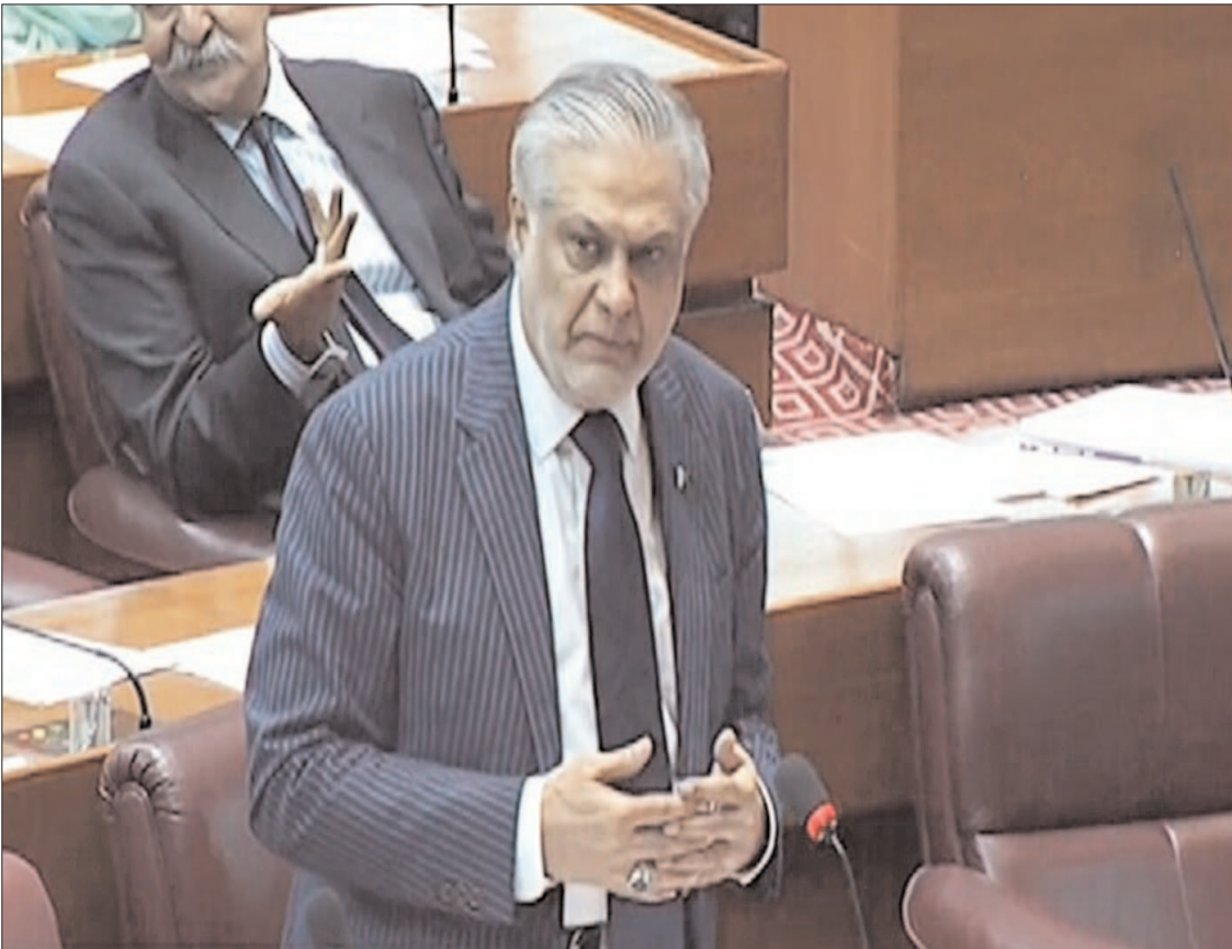
ISLAMABAD: Finance Minister Ishaq Dar speaks during a session of the National Assembly on Sunday.

ISLAMABAD (NNI): President Dr Arif Alvi has departed for Saudi Arabia to perform Hajj. According to details, family members of Dr Arif Alvi are also accompanying the president. In the absence of Dr Alvi, Senate Chairman Sadiq Sanjrani has assumed the duties of acting president of Pakistan. The Cabinet Division has issued a notification of his appointment as the acting president of Pakistan.