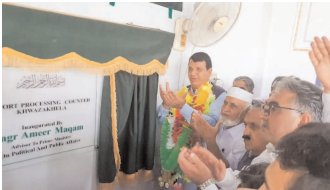
SWAT: Adviser to Prime Minister Engr. Amir Muqam offering dua after inauguration of Passport Office at Khwazakhela.

On this occasion, the people raised full throated slogans in favor of Prime Minister Muhammad Shehbaz Sharif, PMLN Quaid Nawaz Sharif and Engr Amir Muqam.