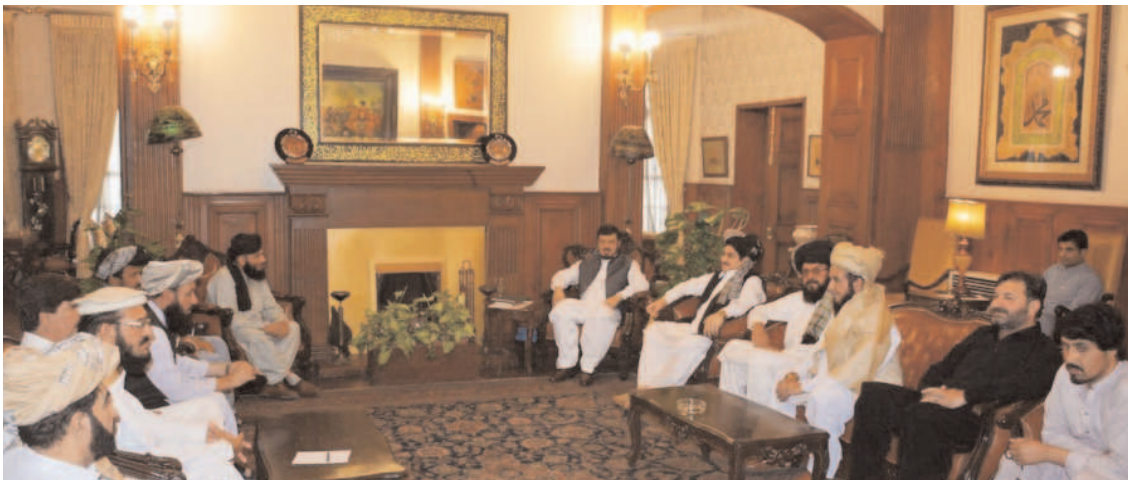
PESHAWAR: A delegation of North Waziristan led by Chief of Waziristan Malik Nasrullah meeting with Governor Khyber Pakhtunkhwa Haji Ghulam Ali meeting at Governor's House.

This Early Warning System analyzes existing data with previous flash flood historical data and upon reaching a dangerous level the system generates alert signals. PDMA-PEOC remains active round the clock (24/7) with free of cost Emergency Helpline 1700.