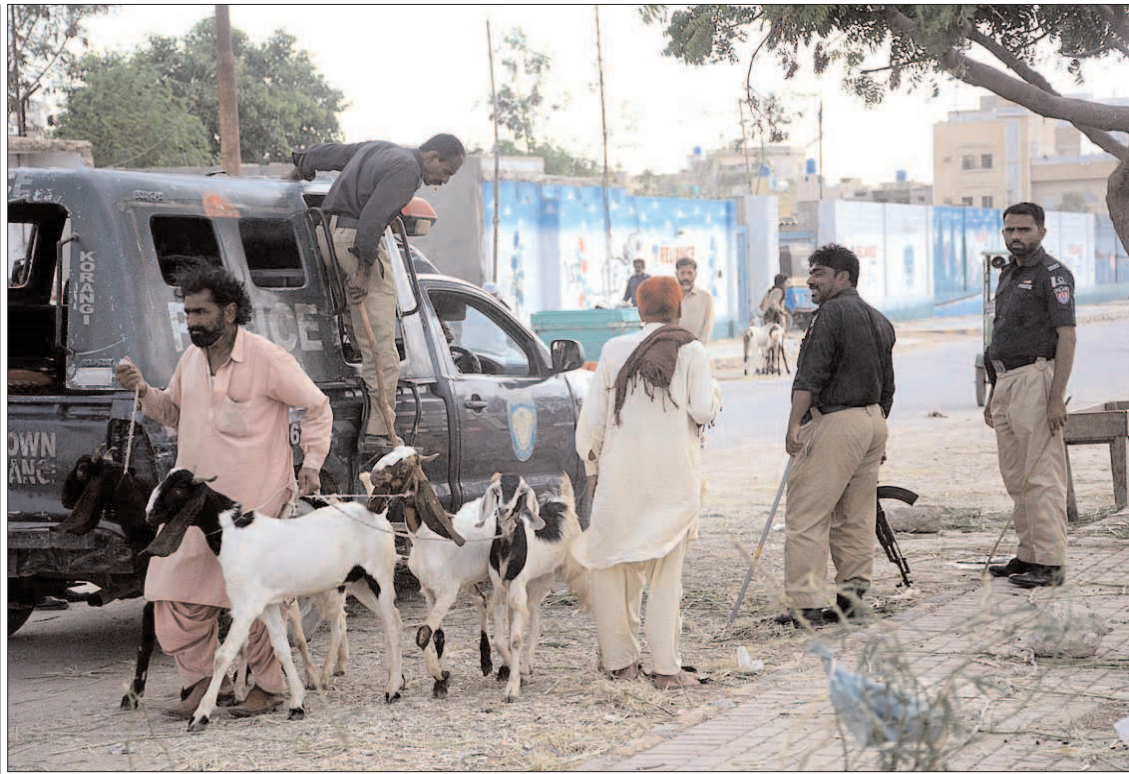
KARACHI: Policemen removing illegal sacrificial animals sellers from footpath in Korangi area.