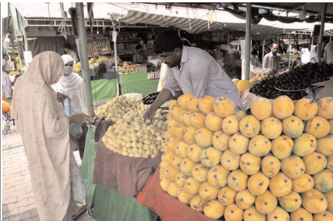
ISLAMABAD: Women busy in purchasing fruits at H-9 weekly bazaar.

We see in the findings of the study that only 1.5% of the marriages in Pakistan are ethnically exogamous. Ethnic exogamy is more prevalent in urban Pakistan (1.9%) than in rural but only by a very small margin. Among the provinces, Balochistan shows the highest proportion of language exogamy (4.1%), and Punjab is the lowest (0.9%).