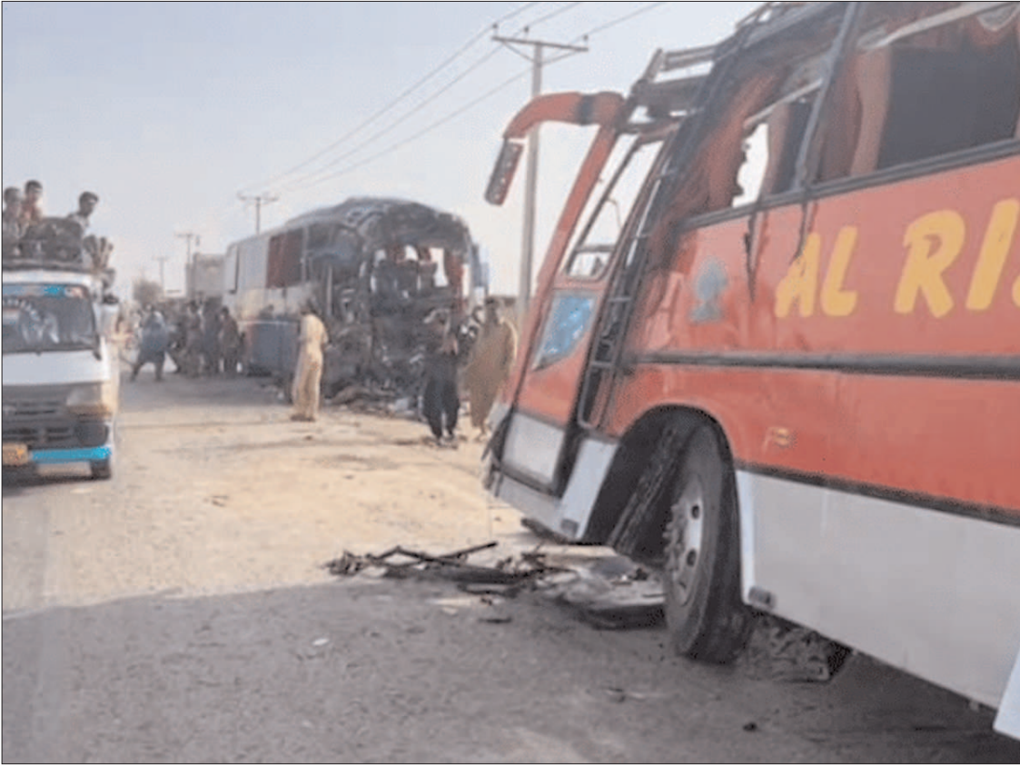
NAWABSHAH: Two passenger coaches are heavily damaged after they collided head-on while passengers depart in a van in Nawabshah.