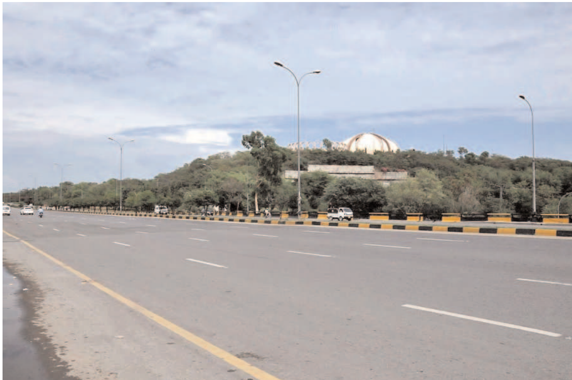
ISLAMABAD: A deserted view of Islamabad Highway as people deaprts to the hometowns to celebrate Eidul Azha with their dear ones.

RAWALPINDI (APP): Anti-Narcotics Force (ANF) during three different operations across the country on Wednesday, arrested eight accused allegedly involved in drug smuggling and recovered 150 kg of drugs from their possession, said an ANF spokesman here. He informed that in an operation near Kala Shah Kaku Motorway Toll Plaza, 96 kg opium and 24 kg charras were recovered from a vehicle while two drug peddlers, residents of Jhelum and Sheikhpura were also rounded up. In the second operation on Shakarpur, Sukkur Road, a drug smuggler, resident of Balochistan was arrested while 12 kg charras was recovered from his possession. In the third operation near Kuchlak Bypass, two motorcycles were intercepted five accused residents of Faisalabad, Qilla Abdullah, and Shakarpur were netted on recovery of 18 kg charras, concealed beneath the seats of the motorcycles. Separate cases had been registered against the accused while further investigations were in process, the spokesman added.