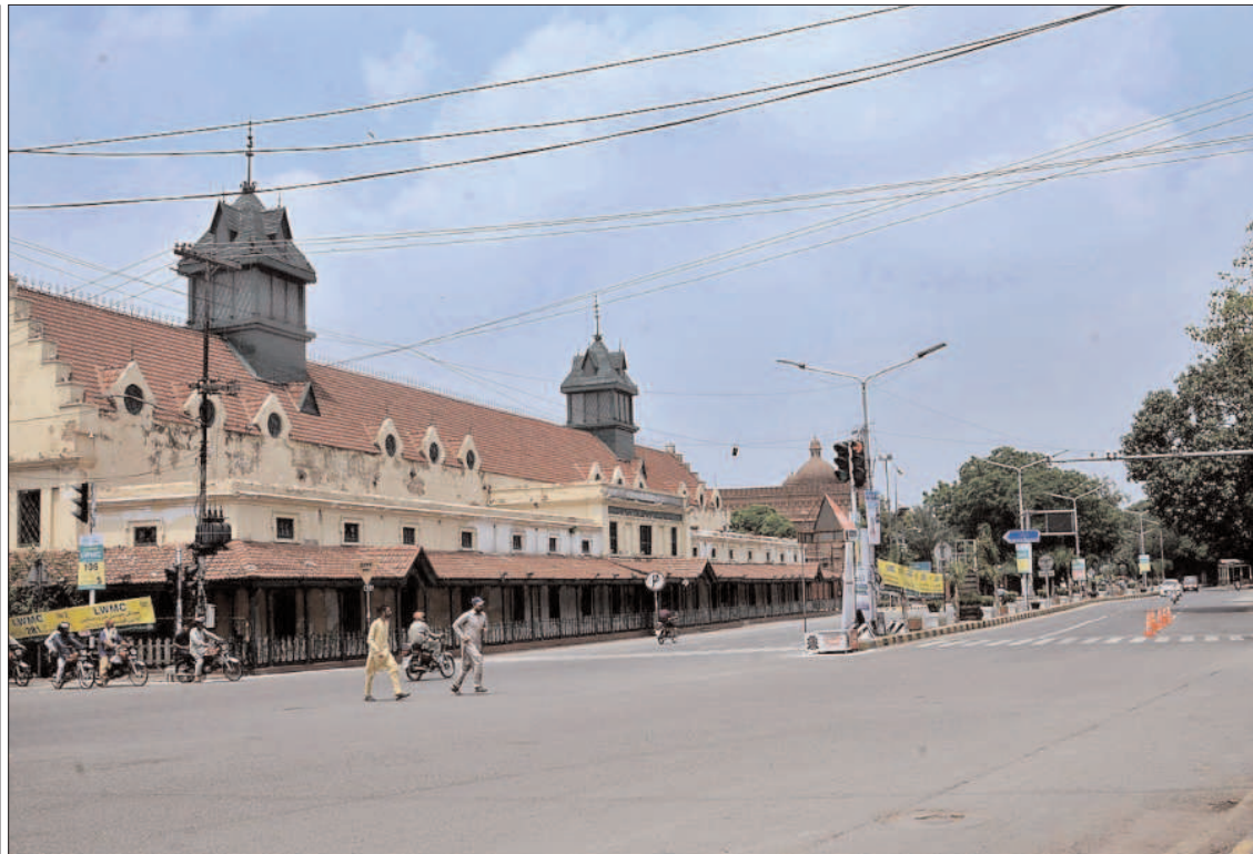
LAHORE: A deserted view of road in Provincial Capital during Eid-ul-Adha holidays.

He added, "93 collection points will be established for collecting the waste of the sacrificial animals during Eidul Azha. Additionally, complaint centres will be made functional in each district of the metropolis. Murtaza Wahab said that complaints can be registered at SSWMB helpline 1128.