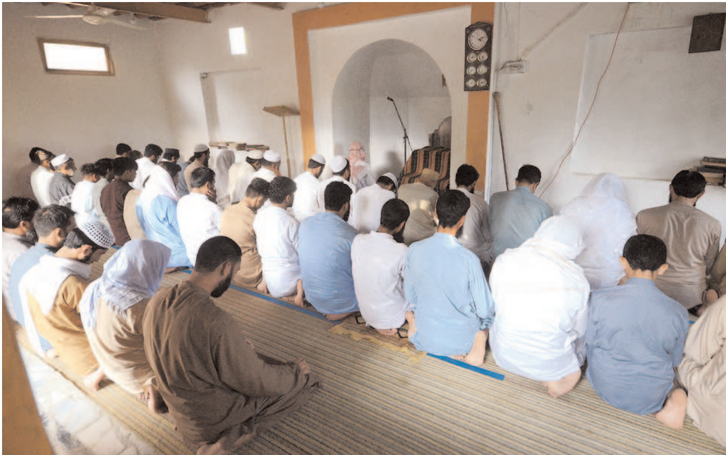
PESHAWAR: Afghan refugees offering Eidul Azha prayers at a mosque in Khazana Refugees Camp.