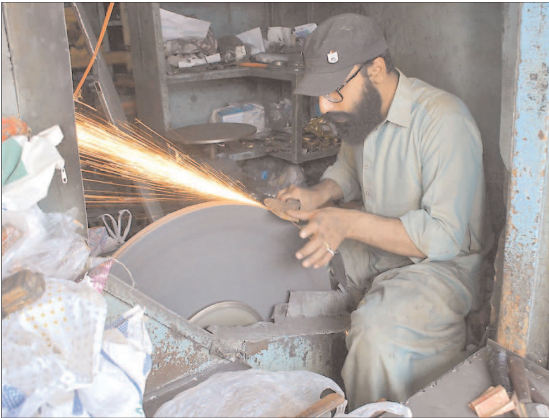
QUETTA: A blacksmith bus in sharpening knives ahead of Eidul Azha.