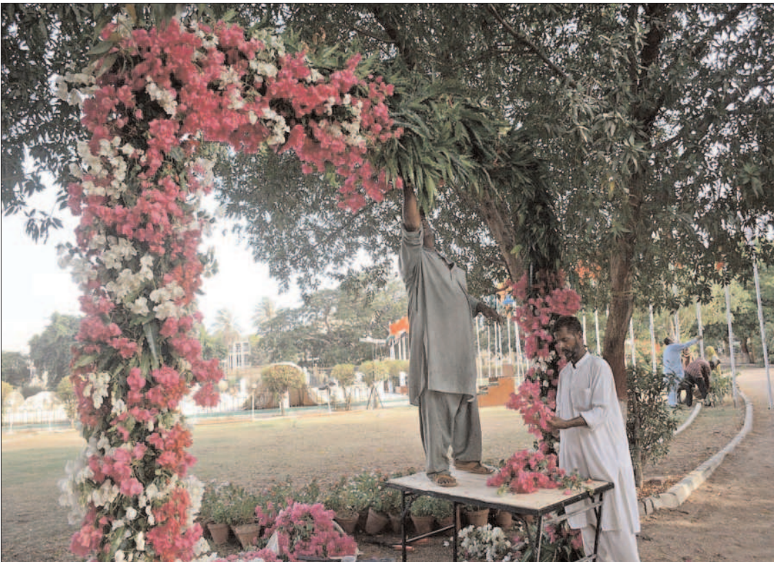
KARACHI: Workers busy in preparations for Eid-ul-Adha congregation at Polo Ground, Gulshan-e-Jinnah Park.

Secretary Procurement Committee Mohmand Dam Consultants Group (MDCG), 38-N Model Town Extension, Lahore, Ph: +92-42-35218089 (Ext. 108), Email: afzal27@hotmail.com PID(L) 3727