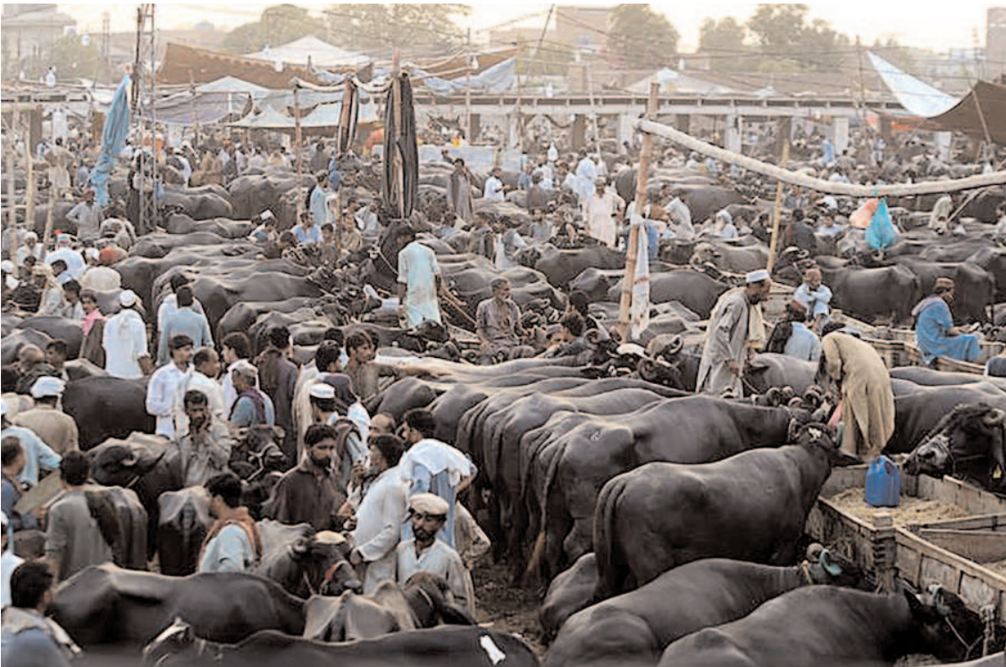
PESHAWAR: A large number of people purchasing sacrificial animals for Eidul Azha.

PESHAWAR (APP): The Traffic Police Dir Lower announced a traffic plan in connection with the forthcoming Eid-ul-Adha by deploying more than 150 Traffic Police for tourists during Eid days. The traffic Police will be on patrol duty around the clock, DPO Lower Dir Ziauddin Ahmad said here Wednesday. District Police Chief, Dir Lower Ziauddin Ahmad has welcomed all the tourists to Dir Lower, the land of lush green, dense forests and beautiful valleys, and said that they should travel from Dir Lower to Dir Upper and Chitral during Eid-ul-Adha. A special security plan has been issued to guide and protect the tourists. Special blockades have been established on the entrance and exit routes of the district along with round-the-clock patrolling of the Police on main GT Road. He has said that more than 150 traffic Jawans will be on duty for the flow of traffic during Eid-ul-Adha. Tourists can come here without fear of danger. He has requested the tourists to respect the traffic rules while travelling besides avoiding fire in the Jungle.