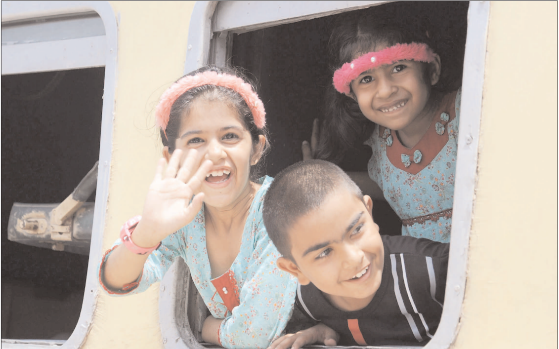
HYDERABAD: Children waving their hands as goodbye from the window of a train during a journey to their parental cities on Eidul Azha, at Railway Station.