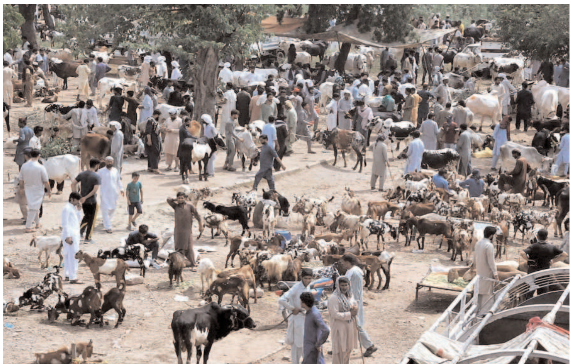
ISLAMABAD: A large number of people purchasing sacrificial animals at Khanapul for upcoming Eidul Azha.

Under the plan, all available resources would be utilized to fulfill the task during the Eid-ul-Azha holidays, he added.