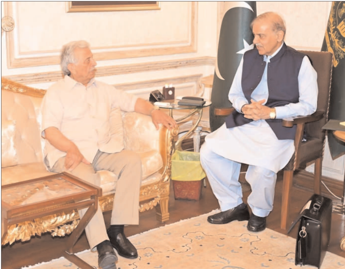
LAHORE: Minister for Federal Education and Professional Training Rana Tanvir Hussain called on Prime Minister Shehbaz Sharif.