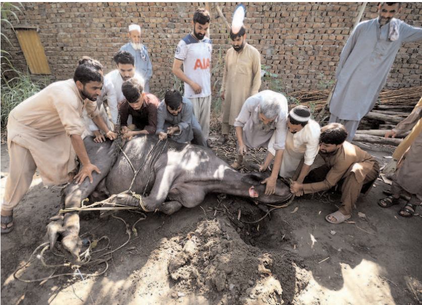
PESHAWAR: Afghan refugees slaughtering on occasion of Eidul Azha.