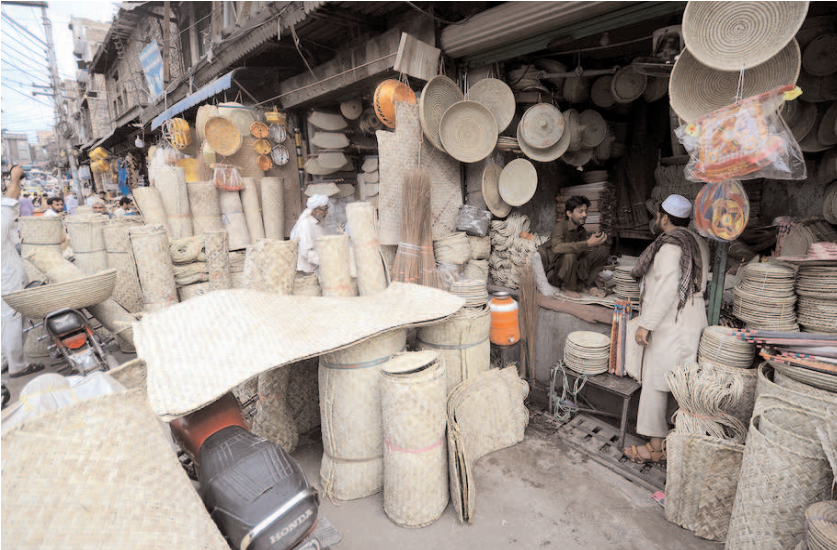
PESHAWAR: Shopkeeper tradition wooden stick made sheet to attract customers at Peepal Mandi.

PESHAWAR (APP): The different routes and services of the Trans Peshawar would be active on all three-days of Eid-ul-Adha, said a spokesman of the BRT here on Wednesday. He said the following routes including SR 02, DR 3A, DR 06, SR 08, DR 3B, DR 05 would remain active in order to ensure facilities to our valuable passengers. Apart from the above routes, the other routes the services would remain closed during Eid.