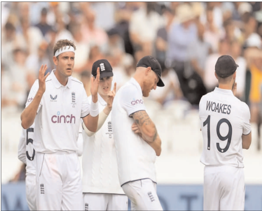
LORD'S: Stuart Broad is bemused after a DRS referral is turned down in 2nd Ashes Test.