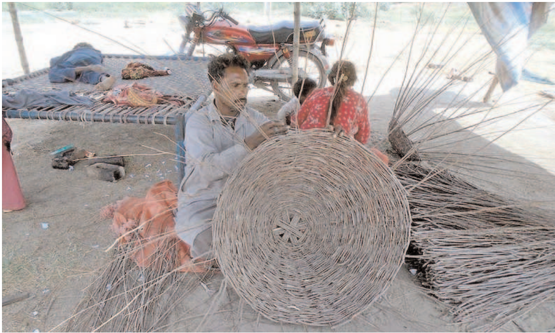
CHINIOT: A worker busy in making traditional basket with branches of tree.

mature and well-developed SME sector. “There has been cooperation in many areas between the SMEs of China and Pakistan, but there’s much more that can be achieved together. The China-Pakistan Economic Corridor (CPEC) provides a tremendous opportunity for SMEs to develop and grow. There’s ample scope for joint ventures between Pakistani and Chinese SMEs, especially in the fields of logistics, trucking, training, warehousing, fisheries, horticulture, minerals, food processing, construction, dairy and livestock, ICT and related services, light engineering, apparel, and cold storage and supply chain businesses,” the CG added.