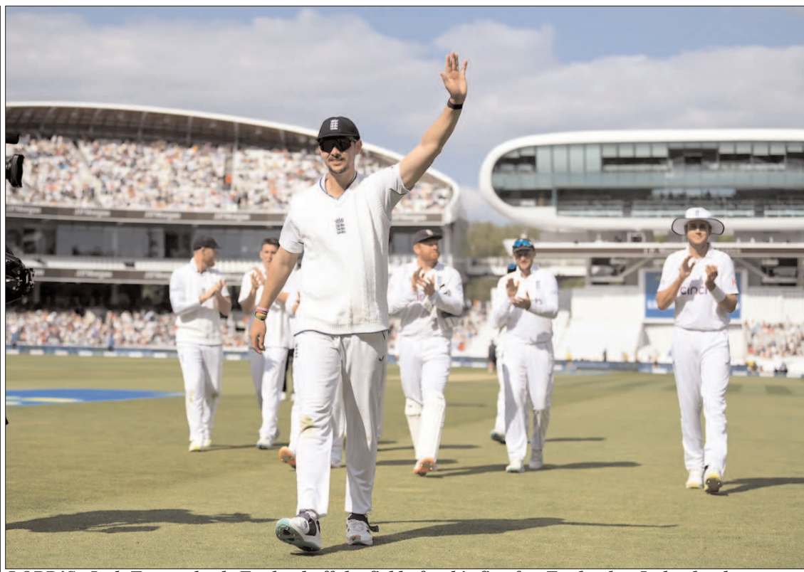
LORD'S: Josh Tongue leads England off the field after his five-for, England vs Ireland only test.