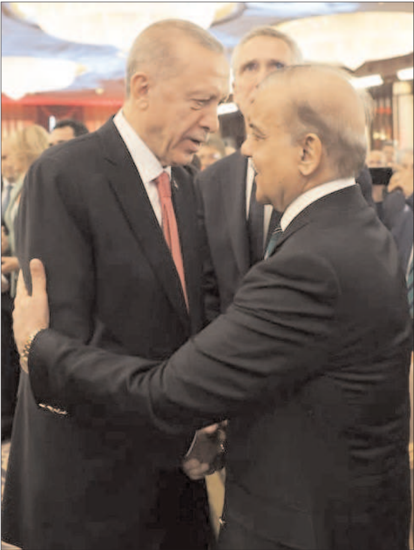
ANKARA: Prime Minister Shehbaz Sharif greeting Turkish President Recep Tayyip Erdogan at his inauguration ceremony in Turkeye.