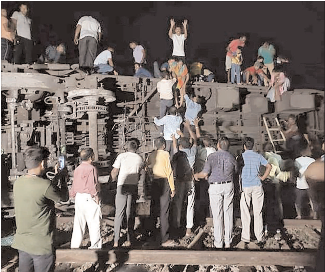
NEW DELHI: People busy in relief and rescue work after collision between two trains in Odisa State of India.