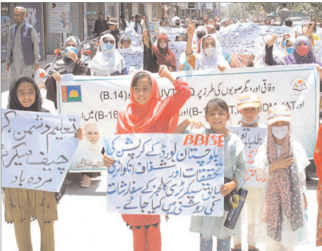
QUETTA: Activists of Government Teachers Association along with student holding a rally in favour of their demands.