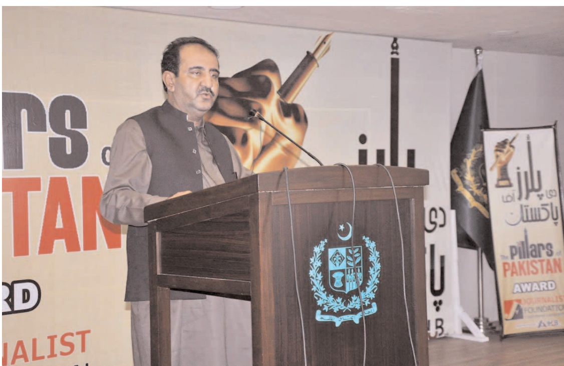
ISLAMABAD: Federal Minister for Science & Technology, Agha Hassan Baloch addressing during the Award ceremony 2023 organized by Journalist Foundation at Ministry of Science and Technology.

In the seventh operation near Government Islamia Graduate College, Sambrial Sialkot, one kg of charras was recovered from the possession of two motorcyclists who were allegedly involved in supplying drugs to students. Whereas in the eighth operation, 673 grams of charras was recovered from the possession of a biker, a resident of Gilgit, intercepted on Jalalabad Road, Gilgit area.