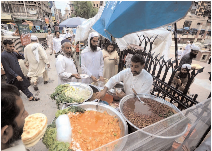
PESHAWAR: A shopkeeper selling food items at Chowk Yadgaar.

In addition, police recovered 29 kilograms of ice drug, 14 kilograms of heroin, 54 kilograms of opium, and 300 kilograms of hashish during the same period, the report added.