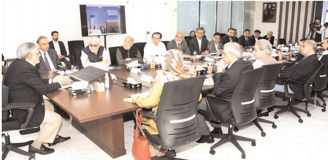
ISLAMABAD: Federal Minister Senator Mohammad Ishaq Dar addressing delegation of Karachi Chamber of Commerce and Industry during a meeting.

The minister said, "The Government will incorporate the suggestions given by the Chamber to stabilize the economy and promote businesses in the upcoming budget."