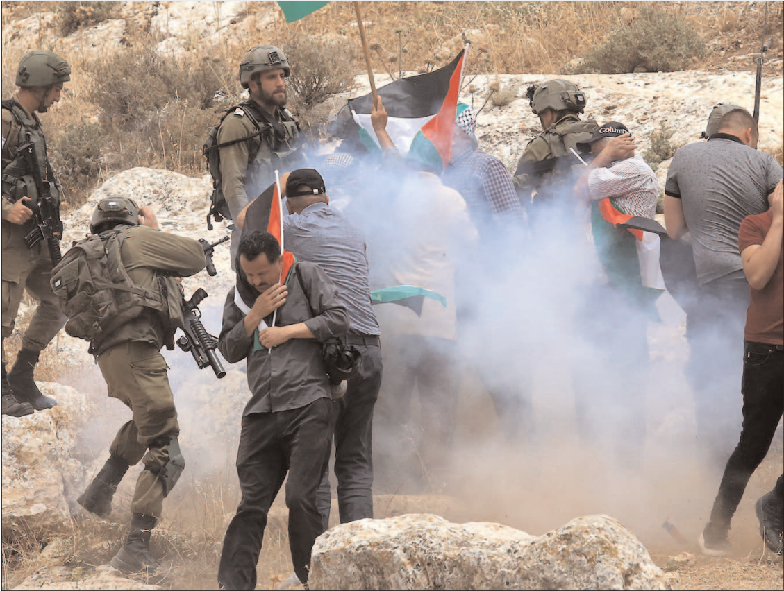
WEST BANK: Palestinians holding a protest against Jews settlement in their areas as Israeli forces clash with them.