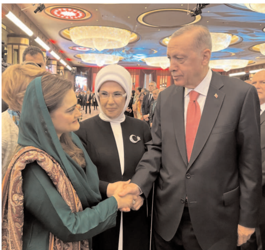
ANKARA: Marriyum Aurangzeb Federal Minister for information and broadcasting greets Turkish president recap Tayyip Erdogan at his inauguration ceremony.

She also urged the international community especially the EU to play its role in facilitating a just and peaceful settlement of the Kashmir dispute in accordance with the relevant UN Security Council resolutions and the wishes of the Kashmiri people for ensuring durable peace in South Asia.