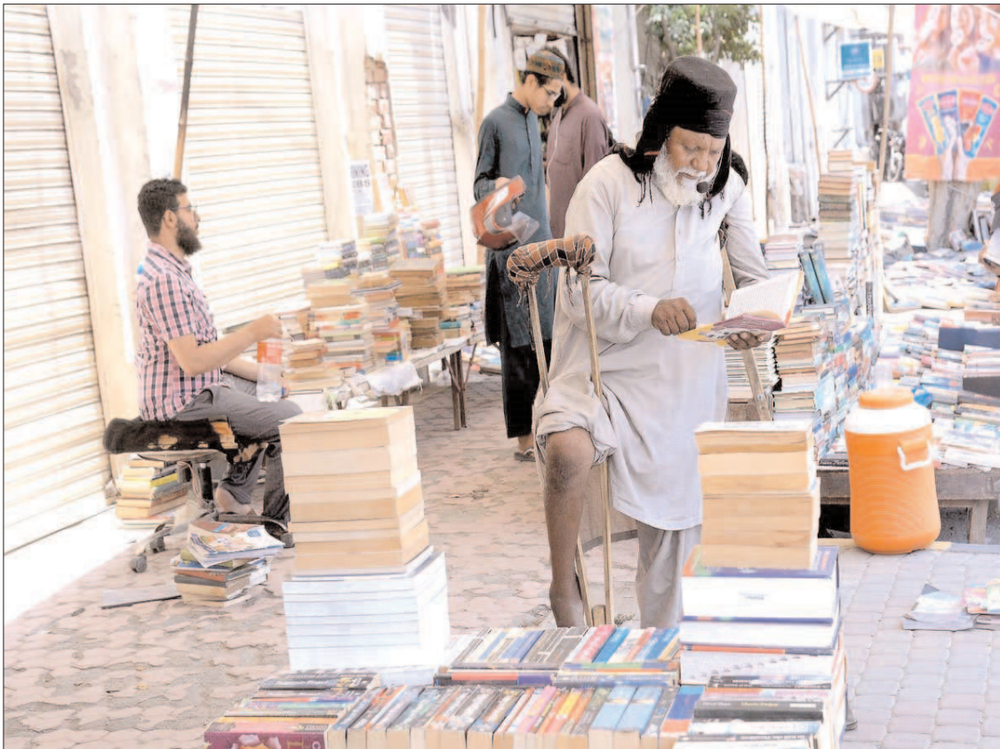
LAHORE: An elderly disabled person selecting books from roadside old books stall in Provincial Capital.

The WWF has already set up a dolphin monitoring network in collaboration with local communities and a round-the-clock phone helpline has also been established, she informed. The latest survey, conducted by the WWF on dolphin census revealed there are 660 dolphins between Taunsa and Guddu stretch (approximately 354-km), Uzma Khan added. She emphasised that citizens should reduce the use of plastic to zero, and promote plastic-free practices across the riverside and coastal spots, to save the dolphins and marine life.