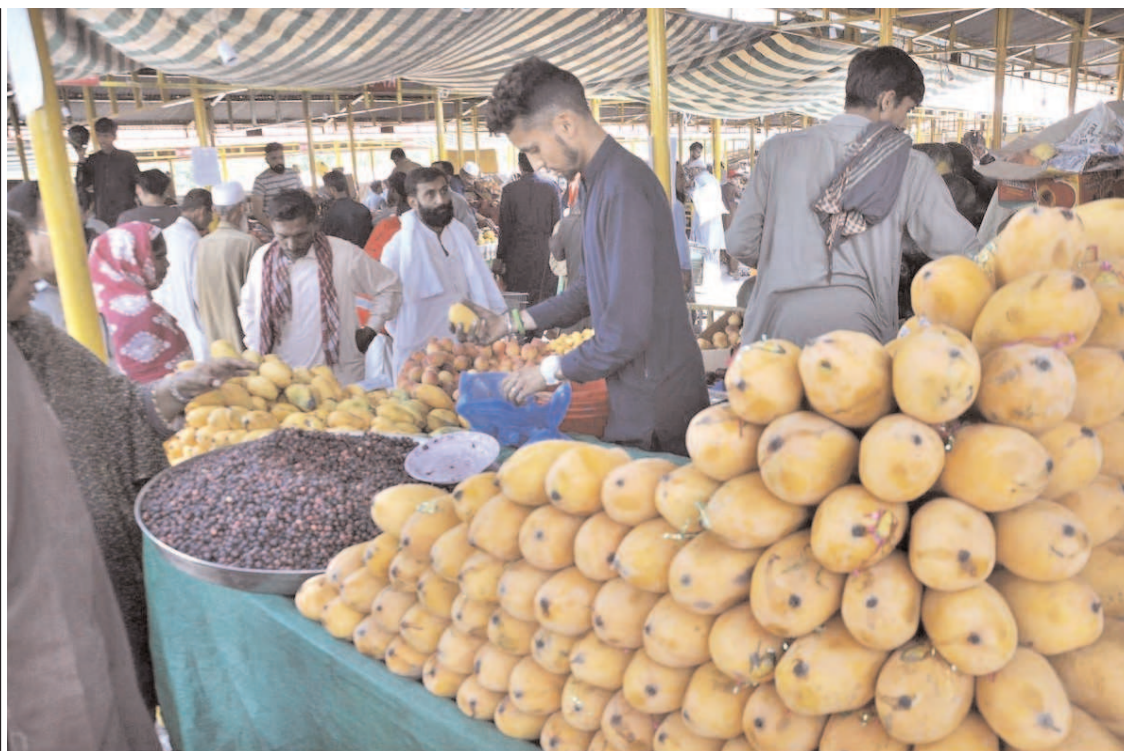
ISLAMABAD: Vendor sells seasonal fruit mangoes at his stall in weekly Sunday Bazaar G-6 Sector.

He called for strict measures to stop illegal trade, as the smuggling is not only causing massive shortfall in revenue collection but also discouraging the legal businesses and documented economy. Majority of the people don't want to get them registered and preferred purchasing of smuggled goods mainly due to high duties on legal import, he added.