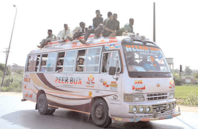
HYDERABAD: People traveling on rooftop of passenger bus at Tando Jam Road may cause any mishap and needs attention of concerned authorities.

been issued by the district administration that all food items including Roti (naan) should be kept and prepared in a healthy and clean environment and the complaint of Deputy Commissioner Bannu should be printed on the rate sheet by writing WhatsApp number 03040030032 and all bakers and Hotel owners keep digital scales for checking weight of bread.