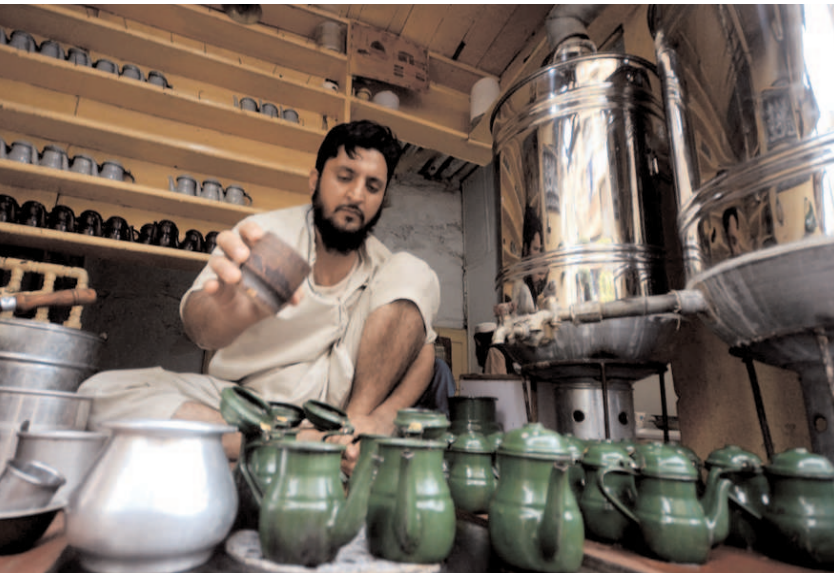
PESHAWAR: A shopkeeper busy in preparing traditional Peshawari Kahawa at his shop.

SP Education Shazia Shahid and her team are providing information to residents in various sectors, focusing on the use of seat belts and helmets, avoiding mobile phone usage while driving, and the significance of adhering to traffic rules. Wearing helmets and seat belts during travel ensures the safety of individuals, as even a momentary distraction caused by mobile phone use can lead to severe accidents, putting lives at risk. Accidents can occur within seconds due to drivers' negligence.