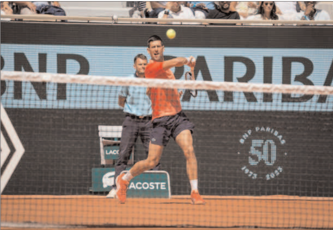
PARIS: Novak Djokovic of Serbia during the Day 8 of Roland Garros at Roland Garros.

which included two fours, and was one of the only three players from her side to reach double figures. She scored 161 runs from five matches and stood second on the batting charts after Sidra Amin. For Dynamites, the spin duo of Ghulam Fatima and Nashra Sundhu did the damage. Nashra bagged four wickets for five runs in 4.5 overs, while leg-spinner Ghulam Fatima grabbed three wickets for five runs from four overs. Ghulam Fatima ended up as the most prolific bowler with 12 scalps from five outings, while left-arm spinner Nashra stood second on the bowling charts with 11 wickets from five matches. Scores in brief: Dynamites beat Challengers by 132 runs Dynamites 211-6, 45 overs (Sidra Nawaz 103 not out, Sidra Amin 38; Noreen Yaqub 2-53) Challengers 79 all out, 28.5 overs (Javeria Khan 28; Nashra Sundhu 4-5, Ghulam Fatima 3-5) Player of the match – Sidra Nawaz (Dynamites) Player of the tournament – Sidra Amin (Dynamites).