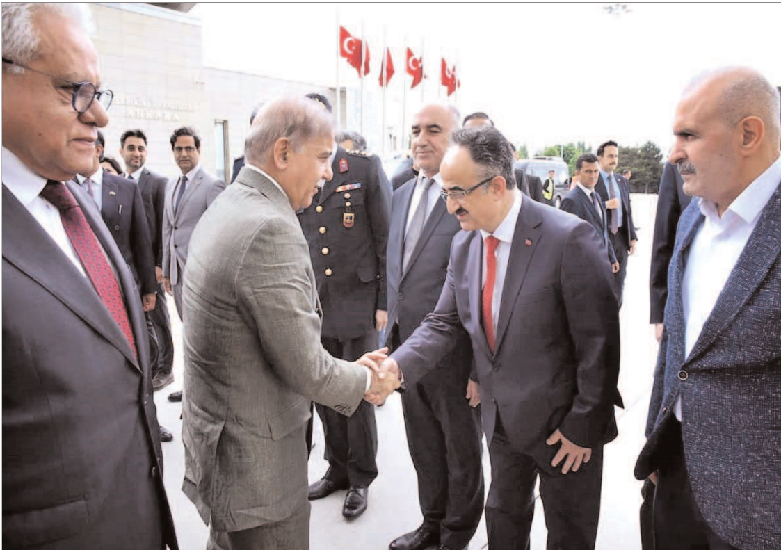
ANKARA: Prime Minister Muhammad Shehbaz Sharif departs from Ankara after completing his two day official visit of Turkiye.

"I know Pakistan's mangoes are very tasty and sweet," President Erdogan replied. Earlier, Prime Minister Shehbaz Sharif attended the inauguration ceremony of President Recep Tayyip Erdogan at the Presidential Complex in Ankara. The prime minister conveyed heartiest felicitations on behalf of the Government and the people of Pakistan to President Erdogan on his re-election as President of Turkiye and wished him continued success.