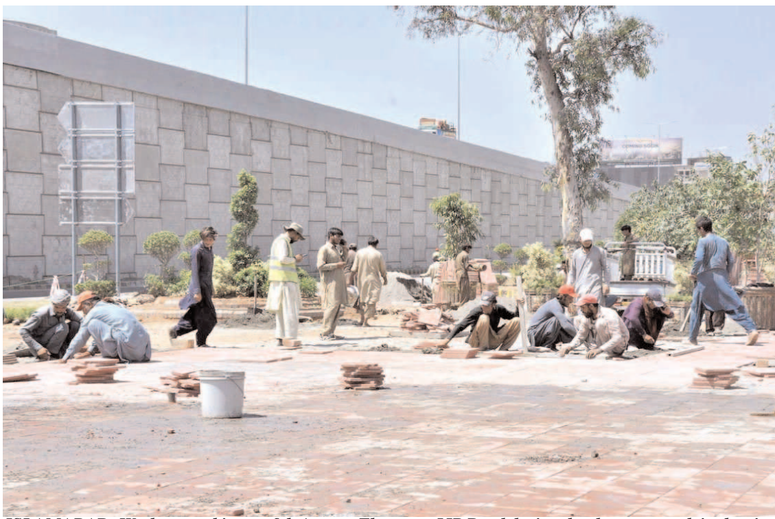
ISLAMABAD: Workers working on 9th Avenue Flyover at IJP Road during development work in the city.