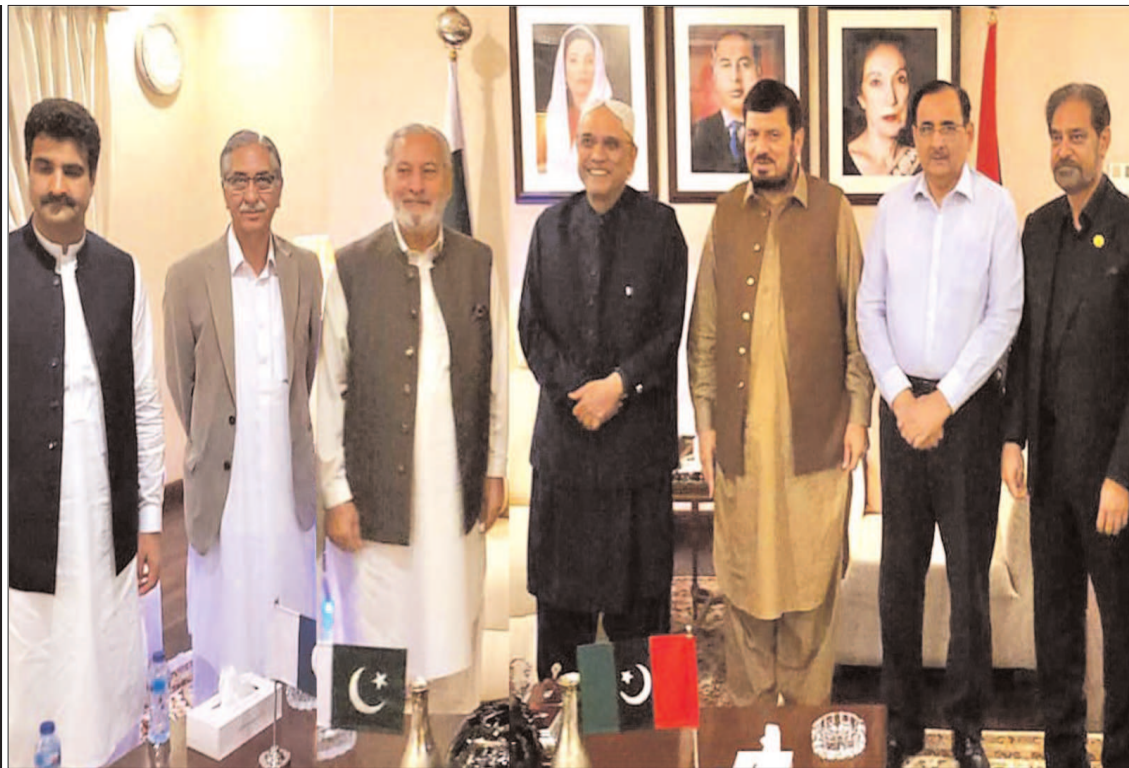
LAHORE: Khyber Pakhtunkhwa Governor Haji Ghulam Ali along with caretaker provincial ministers in a group photo with co-chairman of PPP Asif Ali Zardari.