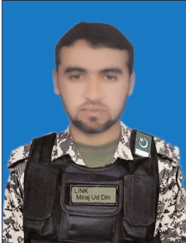
Ismail Khan District) having fought gallantly, embraced Shahadat.