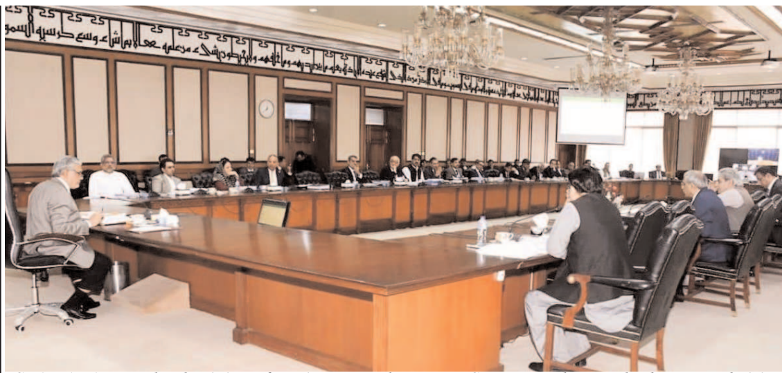
ISLAMABAD: Federal Minister for Finance and Revenue Senator Mohammad Ishaq Dar chairing meeting of Economic Coordination Committee of Cabinet.

The provincial minister was further informed that Chinese and other international investors are taking keen interest in setting up industries in the Rashkai Economic Zone.