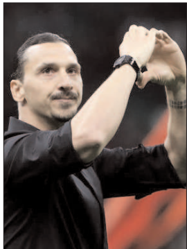
figure in Milan's resurgence to the top of Italian football after his return to the club, helping to bring them back from the doldrums and eventually win the Scudetto last season.

"The first time I came here you gave me happiness, the second time you gave me love," said Ibrahimovic.