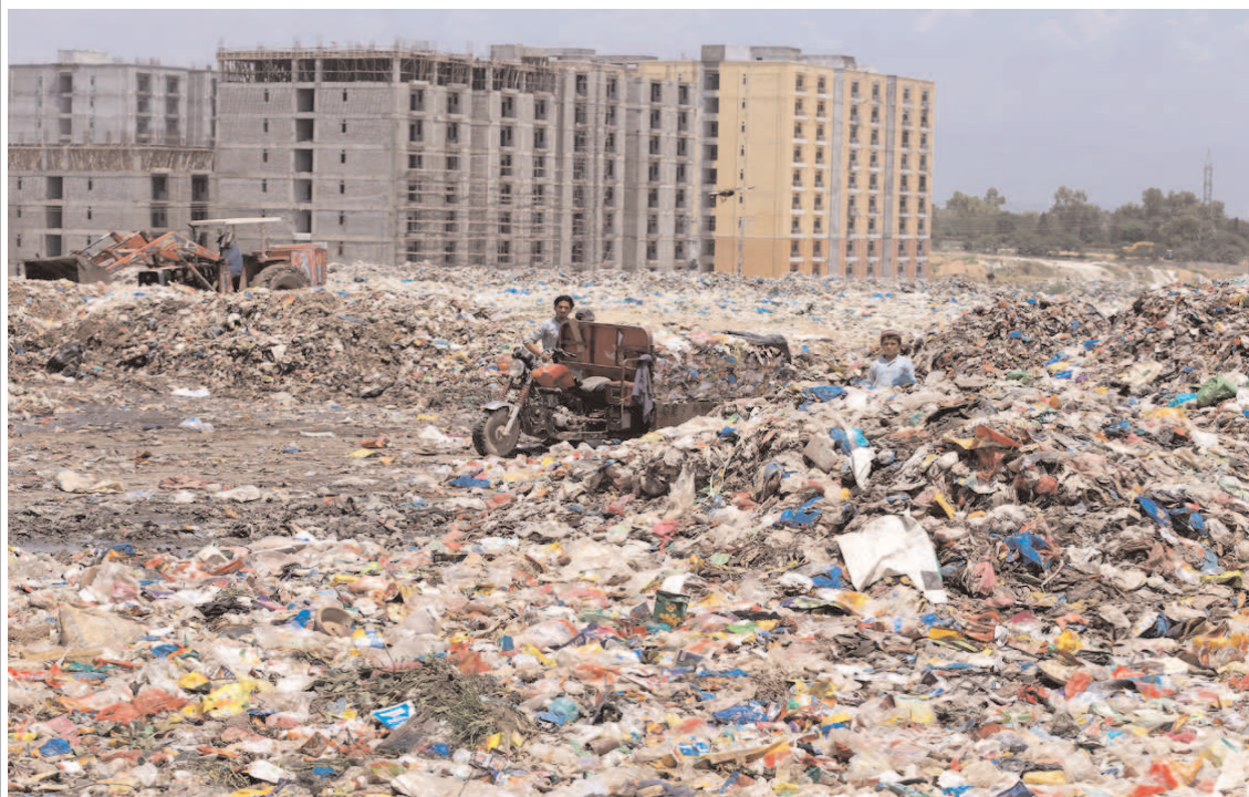
ISLAMABAD: A view of heap of garbage which may cause health issues to the residents of the adjacent areas in the Federal Capital on the eve of World Environment Day.

"Pakistan Railways officers are not entitled to use this facility other than duty and all these saloons are mostly 40 to 50 years old," the official added.