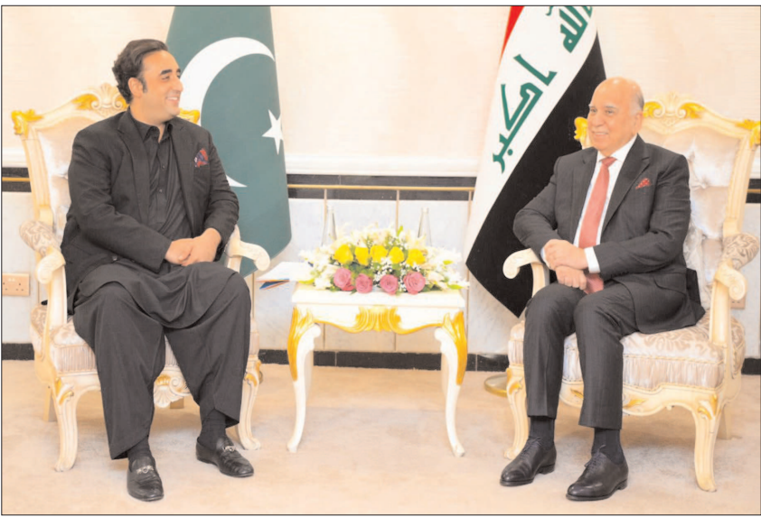
BAGHDAD: Minister of Foreign Affairs Bilawal Bhutto Zardari meeting with his Iraqi counterpart Fuad Hussein during his visit to Iraq.

The JI chief said the most dangerous aspect of the prevailing crises was that the people lost faith in judiciary. The term of rule of law was only limited to the dictionary, he said, appealing to the lawyer community to pay their role for the rule of justice and democracy. He said the lawyers rendered countless sacrifices for the independence of judiciary and they had history of struggle to strengthen democracy but the goals were yet to be achieved.