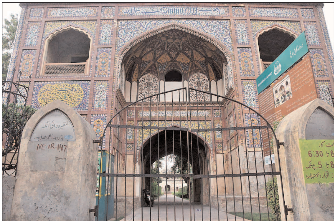
LAHORE: An outside view of the Tomb of Dai Anga also known as the Gulabi Bag is a 17th-century Mughal Tomb Complex located in the Mughal-Era Suburb of Begampura, outside the Walled City of Lahore.