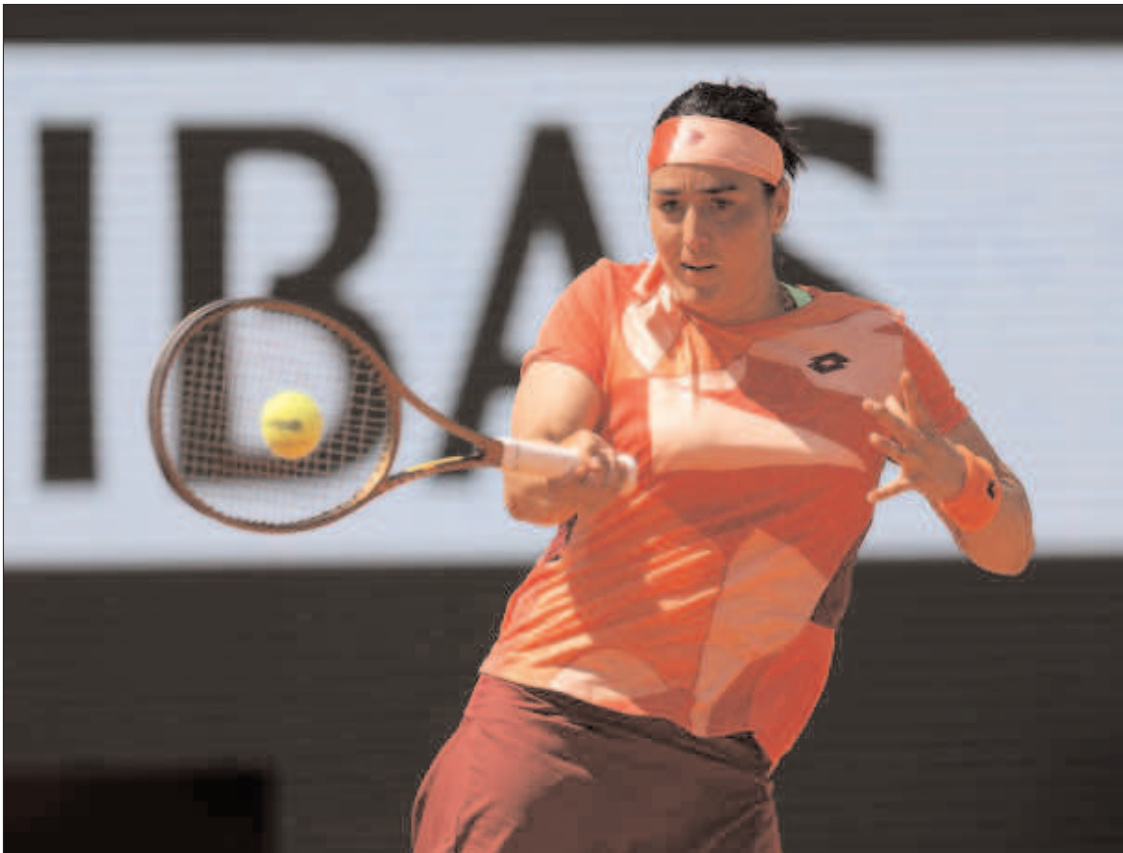
PARIS: Ons Jabeur of Tunisia plays a forehand against Bernarda Pera of United States during the Women's Singles Fourth Round match on Day Nine of the 2023 French Open.

D E N V E R (AFP/APP): The Miami Heat surged past the Denver Nuggets in the fourth quarter for a 111-108 victory that leveled the NBA Finals at one game apiece on Sunday. Gabe Vincent scored 23 points and Jimmy Butler and Bam Adebayo scored 21 points apiece for Miami, who withstood a 41-point performance from Nuggets star Nikola Jokic to get the win. In a game of swinging shifts of momentum, the Heat had the last word, rallying from a 15-point first-half deficit and out-scoring the Nuggets 36-25 in the final period as they silenced the crowd of 19,537 at Ball Arena. Adebayo sealed it with a pair of free-throws with 48.3 seconds remaining. Denver had a last chance to tie it but Jamal Murray missed a three-pointer. Miami, who came through two play-in games and are trying to become the first eighth-seeded team to win the title, host game three of the best-of-seven series on Wednesday. Western Conference top seeds Denver are trying to lift the Larry O'Brien championship trophy for the first time. Although Miami battled through a tough season, they are in the finals for a seventh time in search of a fourth title. The Nuggets had never before reached the championship series.