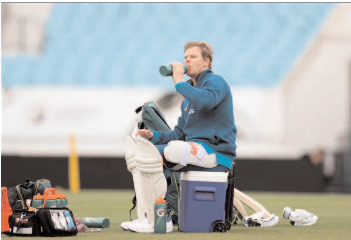
LONDON: Steve Smith of Australia looks on during Australia training prior to the ICC World Test Championship Final 2023 at The Oval on June 05, 2023 in London, England.

Messi was the top scorer in the Spanish league in eight seasons, and the top scorer in the Champions League on six occasions. His 26 goals against Real Madrid are a record for the "clasico" matches against Barcelona's fiercest rival.