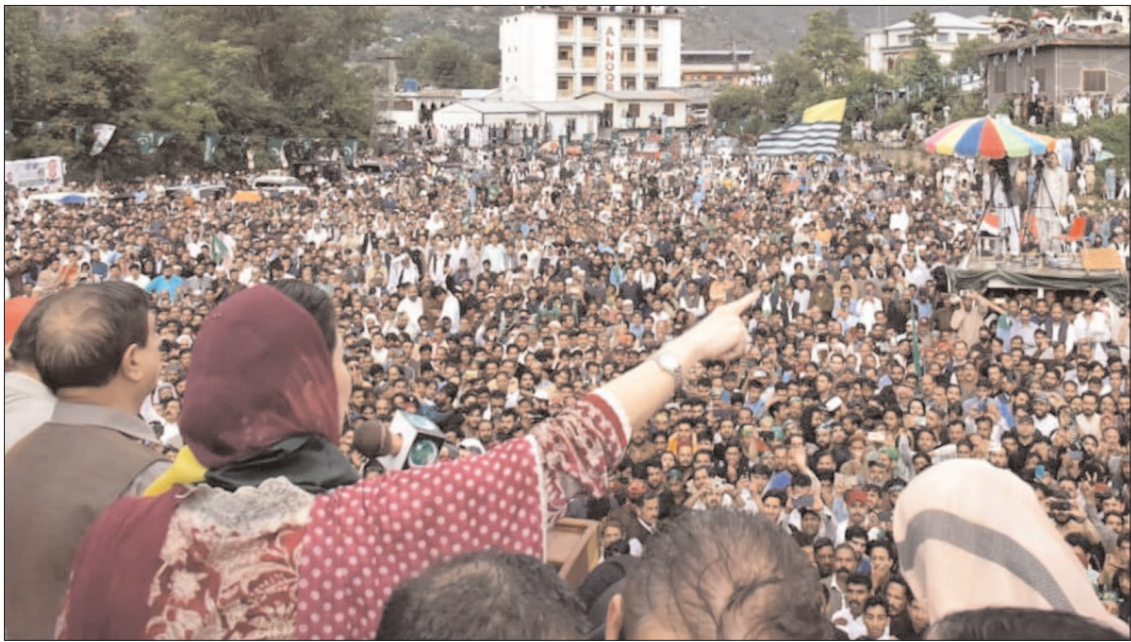
BAGH: Chief Organizer of PML-N Maryam Nawaz addressing during a public gathering in Azad Kashmir.