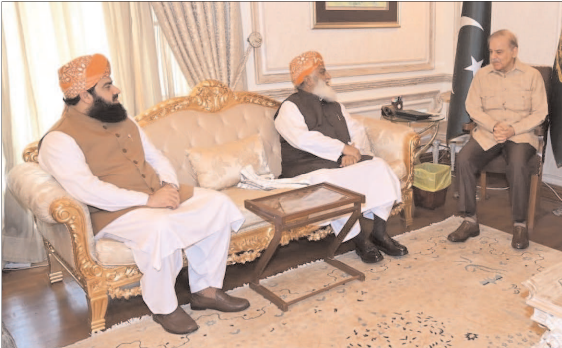
LAHORE: President JUI-F, Maulana Fazlur Rehman and Federal Minister for Communication Maulana Asad Mahmood called on Prime Minister Shehbaz Sharif.

Vol. XXXIX No. 139 Regd. No. 241 ZIQ'A'D 16 1444 -- TUESDAY, JUNE 06 2023 PESHAWAR EDITION 12 PAGES PRICE. 30