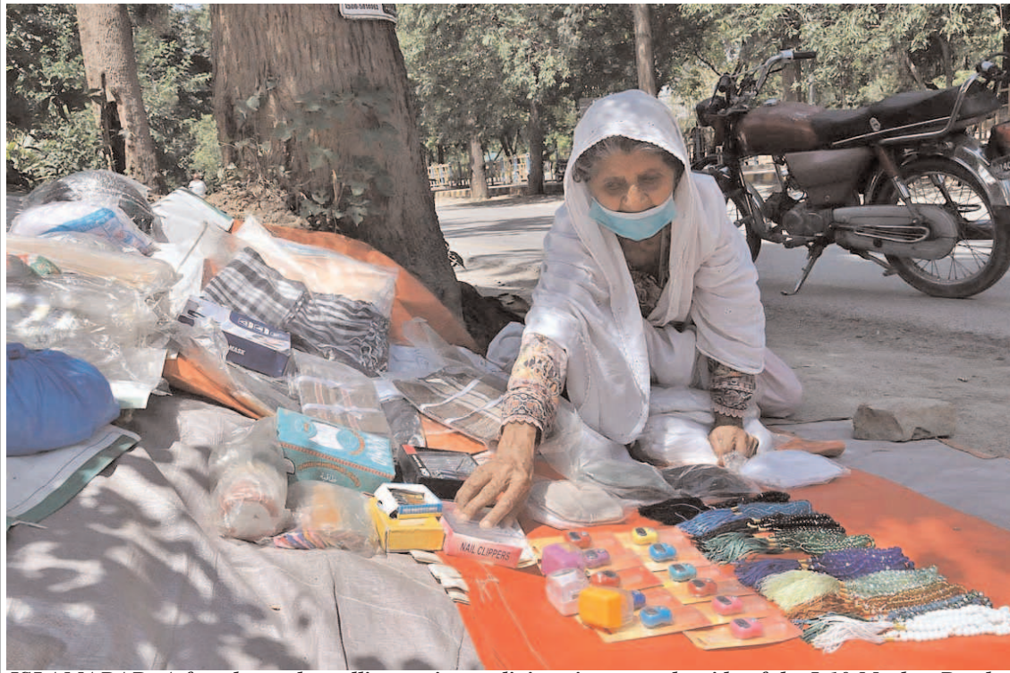
ISLAMABAD: A female vendor selling various religious items on the side of the I-10 Markaz Road.

Traffic Inter-Section Unit is actively working to improve and maintain traffic flow during rush hours in addition to handling any emergent situation. Chief Traffic Officer Islamabad said that the Islamabad Capital Police would ensure safe road environment in the city through preventing violation of traffic rules.