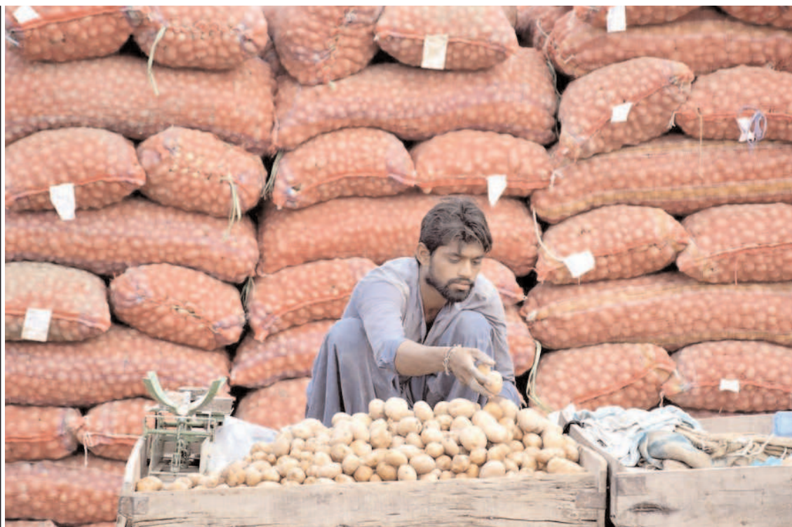
LARKANA: A vendor displaying potatoes to attract customers at Sabzi Mandi.

Iranian Consul General also recorded his impressions in the victor's book of the FCCI.