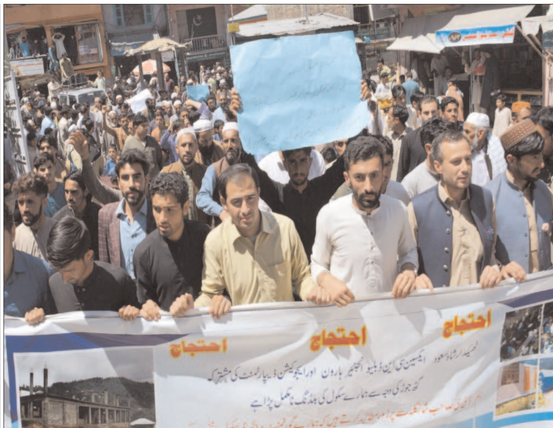
SHANGLA: Resident holding a protest in front of Deputy Commissioner office for acceptance of their demands.