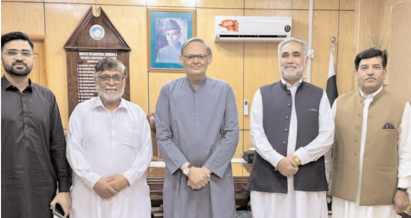
PESHAWAR: Representative delegation of KCCI in a group with Caretaker Minister for Industries Muhammad Adnan Jalil.

The relief equipment can be used to deal with untoward incidents during the monsoon season, said the DG PDMA adding that more relief materials will also be provided to the districts from time to time.