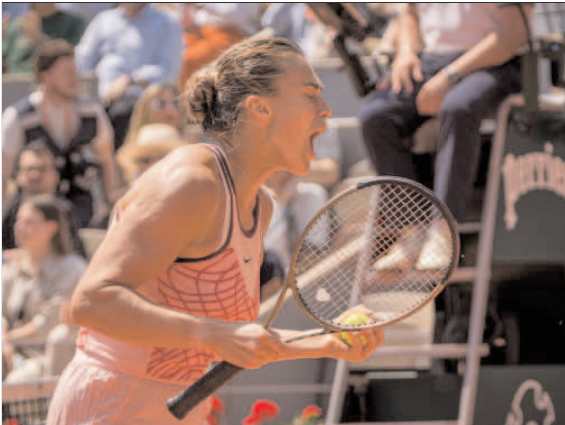
PARIS: Aryna Sabalenka celebrates victory during the Women's Singles Quarter Final Round Match against Elina Svitolina of Ukraine of Belgium during Day 10 of the French Open at Roland Garros.