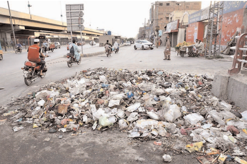
PESHAWAR: Due to a strike by WSSP workers in city, there is a visible accumulation of garbage on main road of Gulbahar.

The participants have also been trained on reporting their findings and providing constructive feedback to the community.