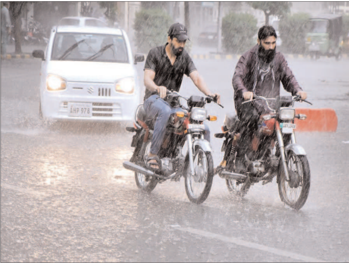
LAHORE: Motorcyclists on the way during heavy rain that experienced the Provincial Capital.

Commuters faced difficulty while travelling on roads, however, clean and pleasant atmosphere gave the provincial capital a heavenly look. Rain in millimetre was recorded at Jail Road 18, Gulberg 20, Johar Town, 3, Airport 10, Laxmi Chowk 61, Mall Road 21, Mughalpura 21, Tajpura 22, Nishtar Town 01, Pani Wala Talab 27, Farrukhabad 10, Gulshan-e-Ravi 9, Sanabad 7 and Qartaba Chowk 43. Mainly hot and dry weather is expected in most parts of the country including the city.