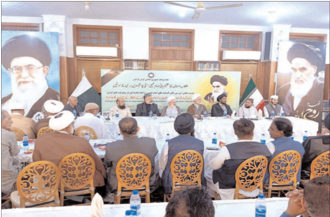
KARACHI: Prominent scholars from Iran and other notables attend a program at the Cultural Centre of the Islamic Republic of Iran Karachi on 34th death anniversary of Imam Khomeini first supreme leader of Iran.