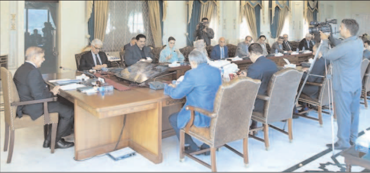
ISLAMABAD: Prime Minister Shehbaz Sharif chairing a meeting to discuss budget proposals regarding the energy sector.

The Ministry of Planning and Development briefed the meeting about the 4RF project. It was told that a huge amount was being spent for the reconstruction of flood-hot areas, through funding from development partners including World Bank, Asian Development Bank and Islamic Development Bank. The NEC, which discussed and held a consultation on the overall economic situation also approved Pakistan Economic Outlook 2035. The prime minister said that the country could not progress until all of its federating units were prosperous.