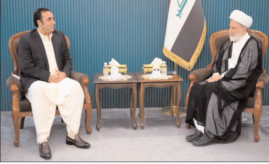
BAGHDAD: Minister of Foreign Affairs Bilawal Bhutto Zardari meeting with head of Islamic Supreme Council of Iraq Dr Sheikh Hamam Hamoudi during his visit of Iraq.

During the meeting with the Speaker of the Iraqi