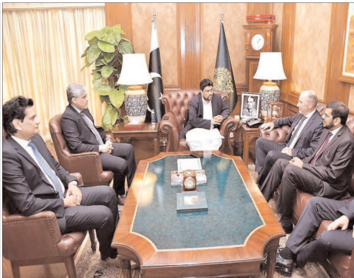
KARACHI: A delegation of German Company KSB Global called on Governor Sindh Kamran Tessori at Governor House.

Expressway and service road along with Iqra University are going to be carpeted, Tile Flooring area inside UC's, Junejo Town, Defense View Society, Manzoor Colony Sectors A & B is in progress and on bringing new 16-inch water line in the area.