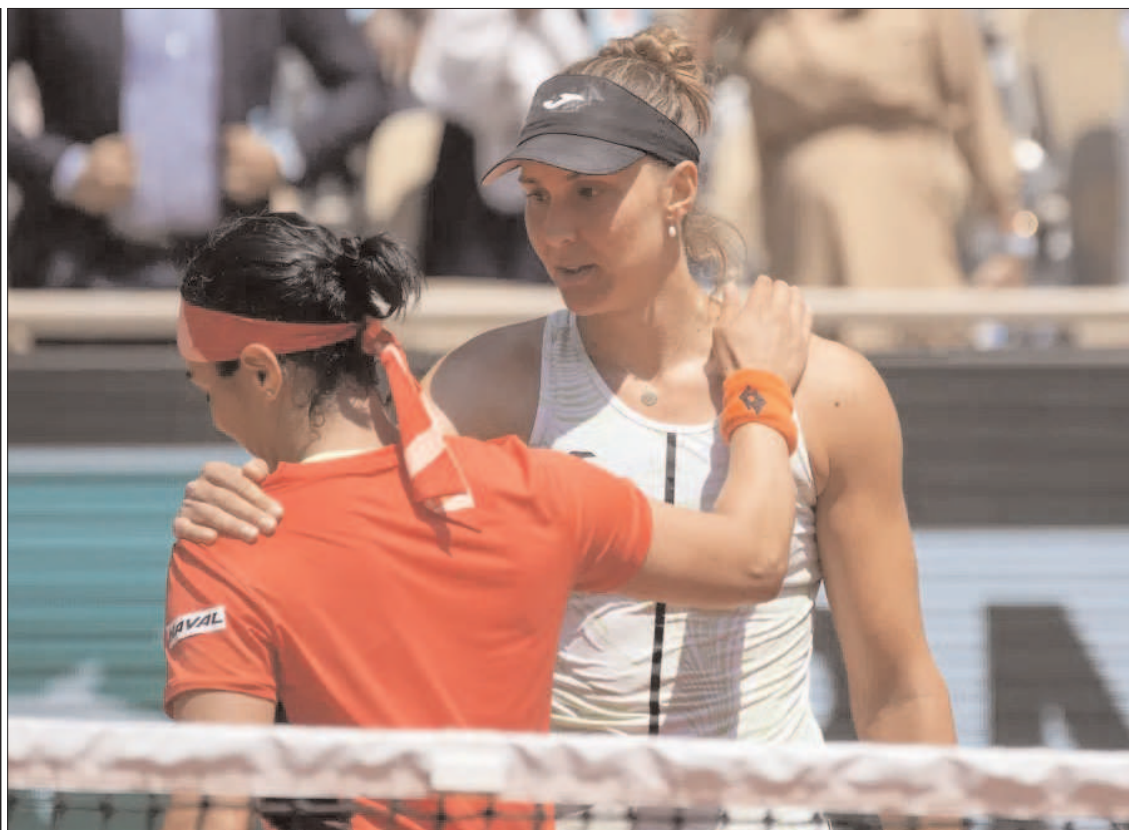
PARIS: Tunisia's Ons Jabeur, left, congratulates Brazil's Beatriz Haddad Maia with winning the quarterfinal match of the French Open tennis tournament.

Sri Lanka will head to Zimbabwe for World Cup qualifiers in a bid to secure one of the two remaining slots for the format's showcase event. Afghanistan is already through to the World Cup, to be held in India in October.