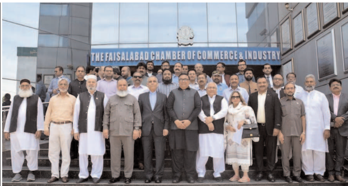
FAISALABAD: Group photo of FCCI members with Consul General of the Islamic Republic of Iran Mehran Movahhedfar during their visit to Faisalabad Chamber of Commerce & Industry.

The exchange rates of the Emirates Dirham and the Saudi Riyal increased by 09 paisas and 08 paisas to close at Rs 78.10 and Rs 76.49 respectively.