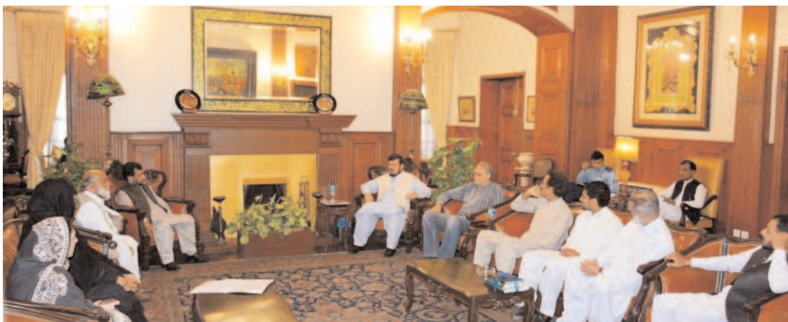
PESHAWAR: A delegation of Gandahar Hindku Board meeting with Governor Khyber Pakhtunkhwa Haji Ghulam Ali. Caretaker Minister Mohammad Adnan Jalil also present.

They asked students to consider cleaning and disposing waste properly as foremost obligation as clean environment is key to healthy society. The seminar titled Clean Campus Drive, a series of awareness activities, organised by Water and Sanitation Servi-