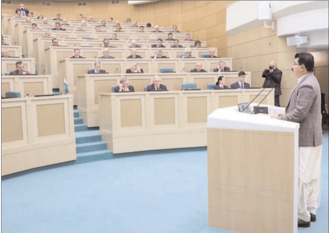
MOSCOW: Chairman Senate, Sadiq Sanjrani addressing the plenary session of Federation Council of the Russian Federation.