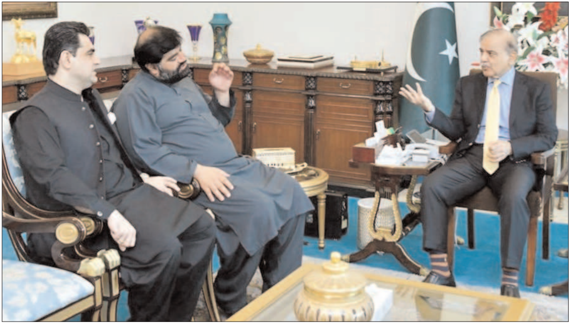
ISLAMABAD: ANP leader Aimal Wali Khan called on Prime Minister Shehbaz Sharif.

Vol. XXXIX No. 141 Regd. No. 241 ZIQA'AD 18 1444 -- THURSDAY, JUNE 08 2023 PESHAWAR EDITION 12 PAGES PRICE. 30