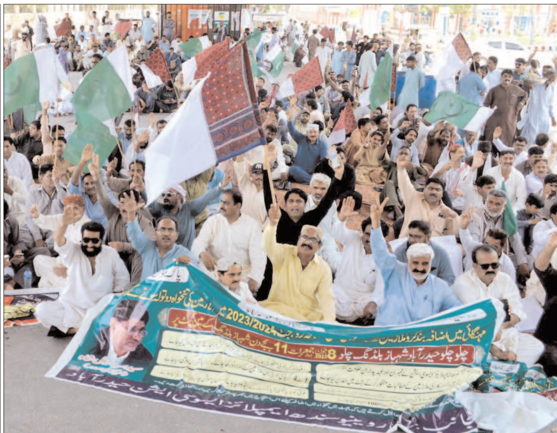
HYDERABAD: Activists of All Revenue Sindh Employees Association holding a protest against price hike.