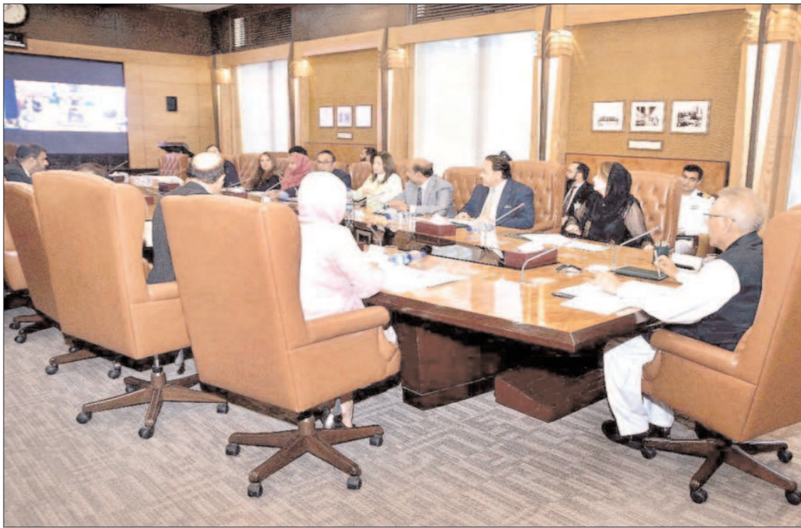
ISLAMABAD: President Dr. Arif Alvi chairing a follow-up meeting on the rights and facilitation of persons with disabilities (PWDs) at Aiwan-e-Sadr.

The Spokesperson welcomed the normalization of relations and reopening of the Embassies of Saudi Arabia and Iran in each other countries and hope for booming ties between both brotherly nations.