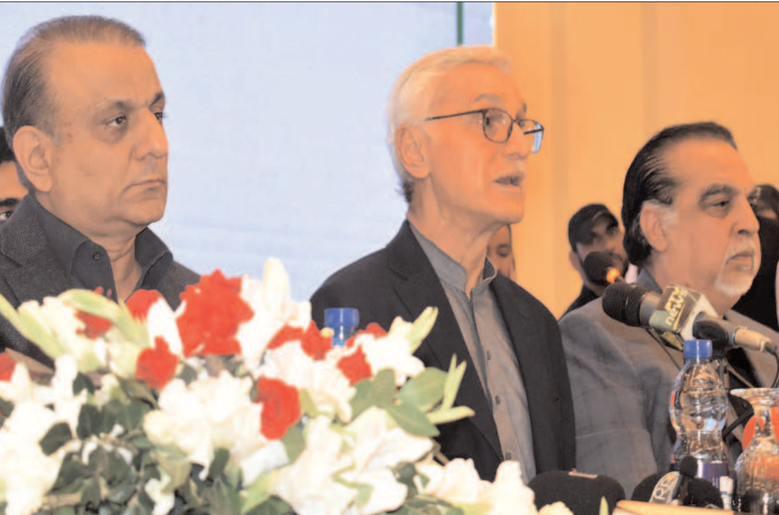
LAHORE: Senior Politician Jahangir Tareen announces his new political party 'Istehkaam-e-Pakistan Movement Party' during press a conference along with others politicians.