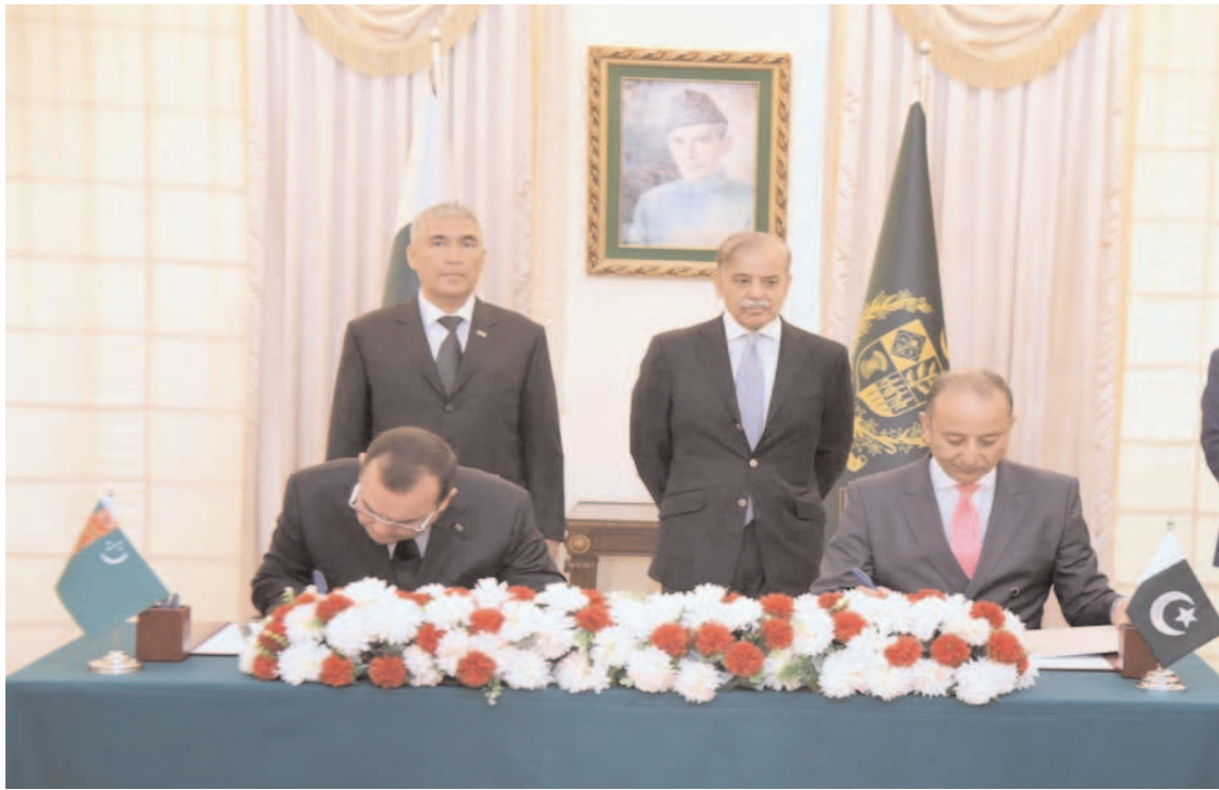
ISLAMABAD: State Minister of Turkmenistan and Head of Turkengaz, Maksat Babayev and Minister of State for Petroleum of Pakistan, Dr. Musaddiq Malik signing TAPI Joint Implementation Plan meanwhile Prime Minister Muhammad Shehbaz Sharif witnesses the signing.

ISLAMABAD (APP): Pakistan Meteorological Department (PMD) has forecast mainly hot and dry weather with chances of rain in a few parts of the country during the next 24 hours. According to the synoptic situation, continental air was prevailing over most parts of the country. A westerly wave was still affecting eastern and central parts of the country and was likely to persist during the next 24 hours. The PMD daily report said that mainly hot and dry weather is expected in most parts of the country.