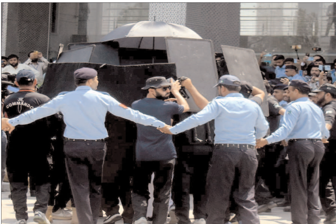
ISLAMABAD: Security personnel with ballistic shields escorting Imran Khan, at High Court.

The prime minister told the meeting that the government would hugely invest in agriculture and information technology sectors in the upcoming budget 2023-24. He said the farmers would be provided with high-quality seeds and automatic agriculture machinery.