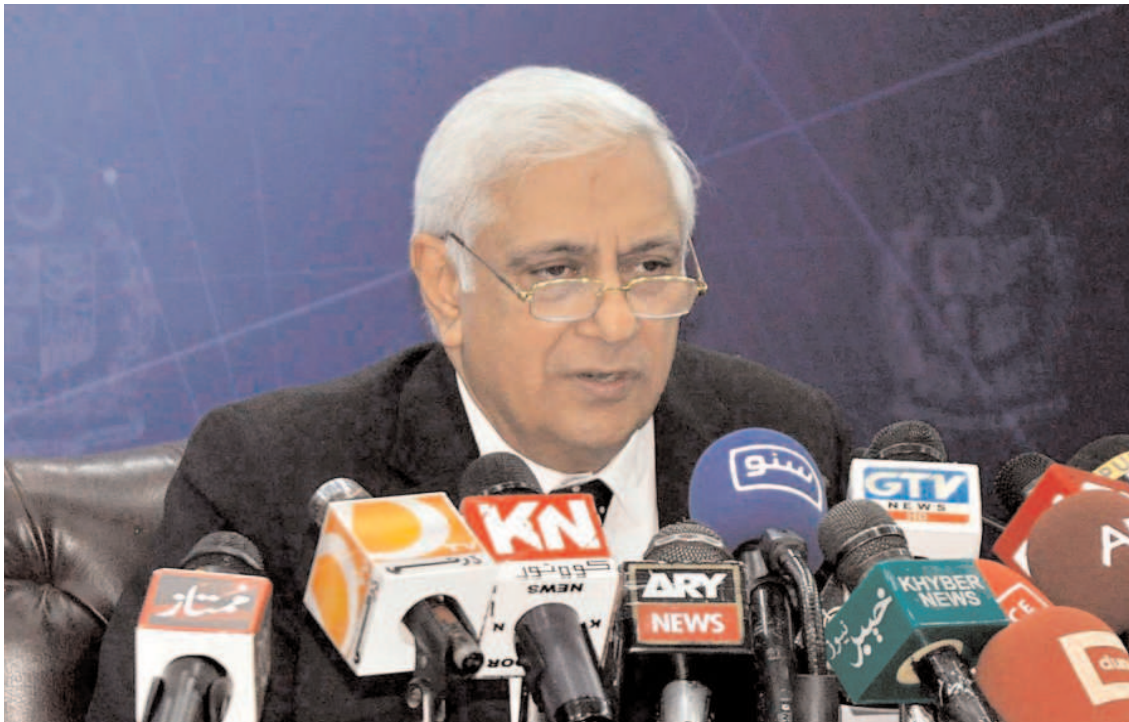
ISLAMABAD: Special Assistant to Prime Minister (SAFM) on accountability, Irfan Qadir addressing a press conference at PID media center.