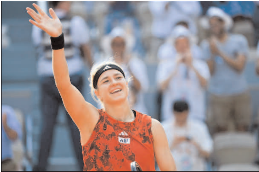
Karolina Muchova of the Czech Republic celebrates winning her semifinal match of the French Open tennis tournament.

PARIS (Agencies): Karolina Muchova of the Czech Republic saved a match point and battled back from 2-5 down in the final set to shock world number two Aryna Sabalenka and reach her maiden Grand Slam final at the French Open on Thursday. Muchova, ranked at 43, defeated the Australian