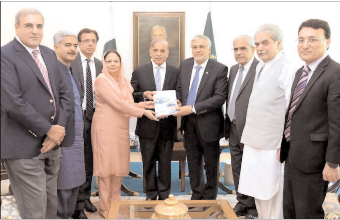
ISLAMABAD: Finance Minister Ishaq Ishaq Dar and economic team presenting the Economic Survey of Pakistan for FY 2022-23 to Prime Minister Shehbaz Sharif.