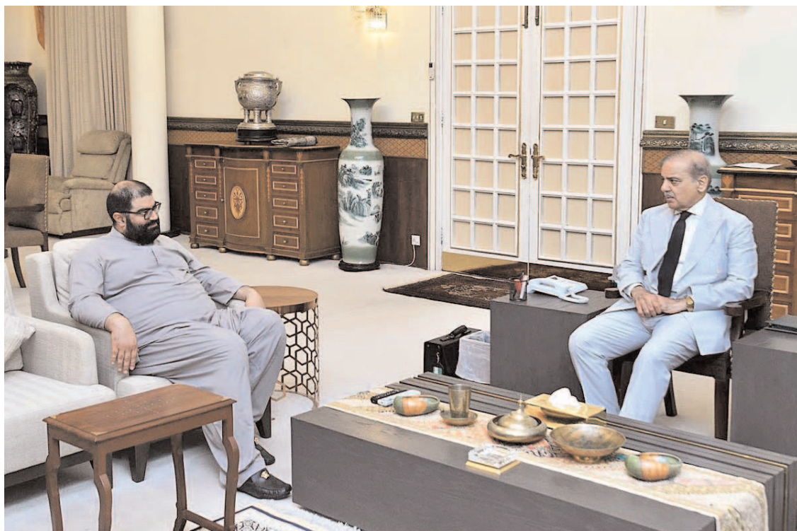
ISLAMABAD: Leader of Awami National Party Aimal Wali khan calls on Prime Minister Muhammad Shehbaz Sharif.

ISLAMABAD (APP): Islamabad Electric Supply Company (IESCO) on Monday notified 2-day power suspension programme for Tuesday and Wednesday for various areas of its region due to necessary maintenance and routine development work. According to IESCO Spokesman, the power supply of different feeders and grid stations would remain suspended for the period on Tuesday From 07:00 am to 12:00 noon, Rawalpindi City Circle, Khanna Road, New Milpur Feeders. On Wednesday From 07:00 am to 12:00 noon, Rawalpindi City Circle, Azizabad, People's Colony, Nogzi, Bajnial Feeders and surrounding areas.