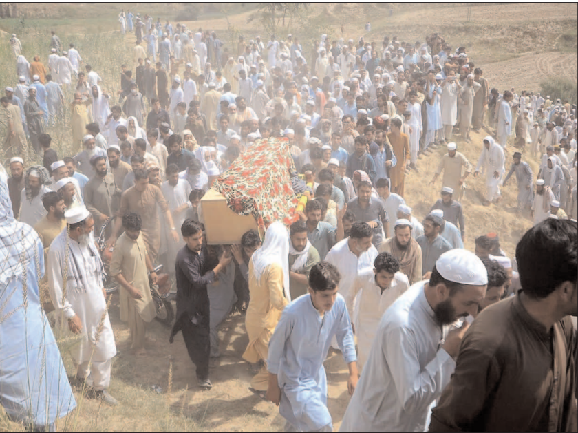
KHAR: People carrying the coffin of Bajaur blast victim for burial.