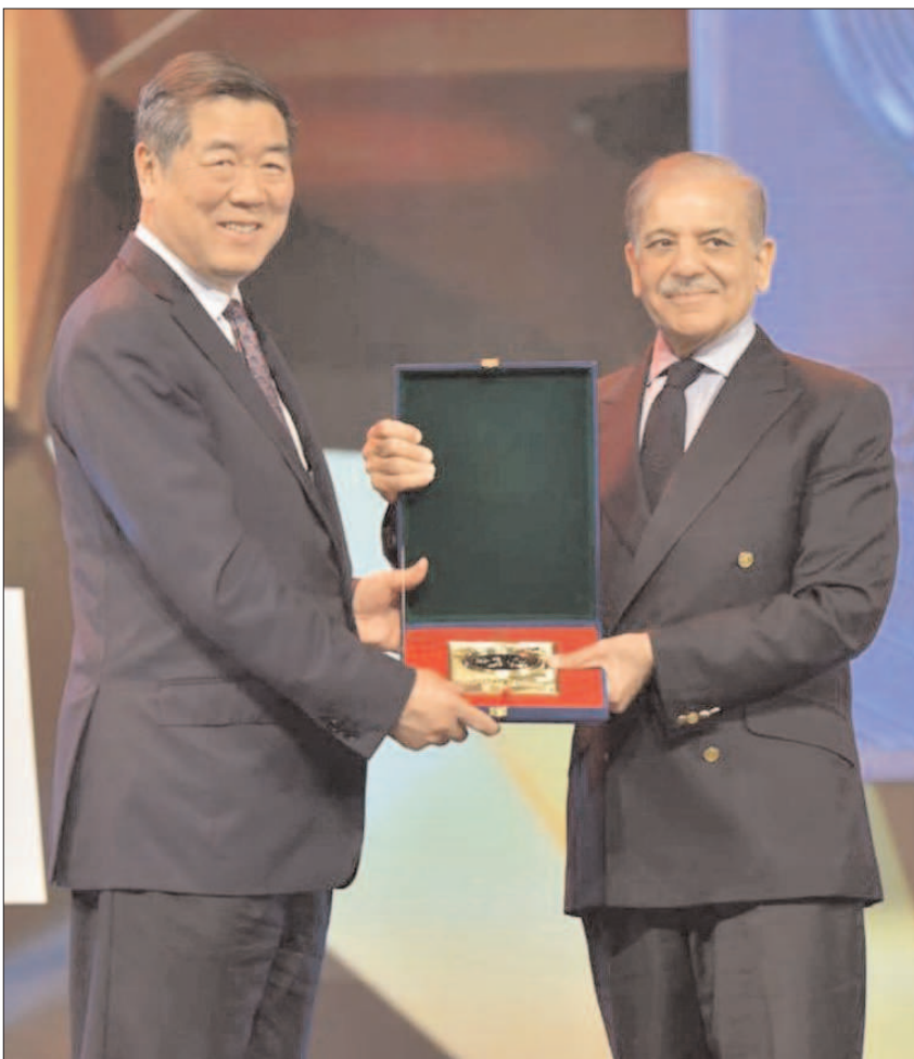
ISLAMABAD: Prime Minister Shehbaz Sharif presenting a memento of Rs. 100 coin to Chinese President Special Representative and Vice Premier He. He Lifeng at a ceremony to commemorate the 10th anniversary of CPEC.