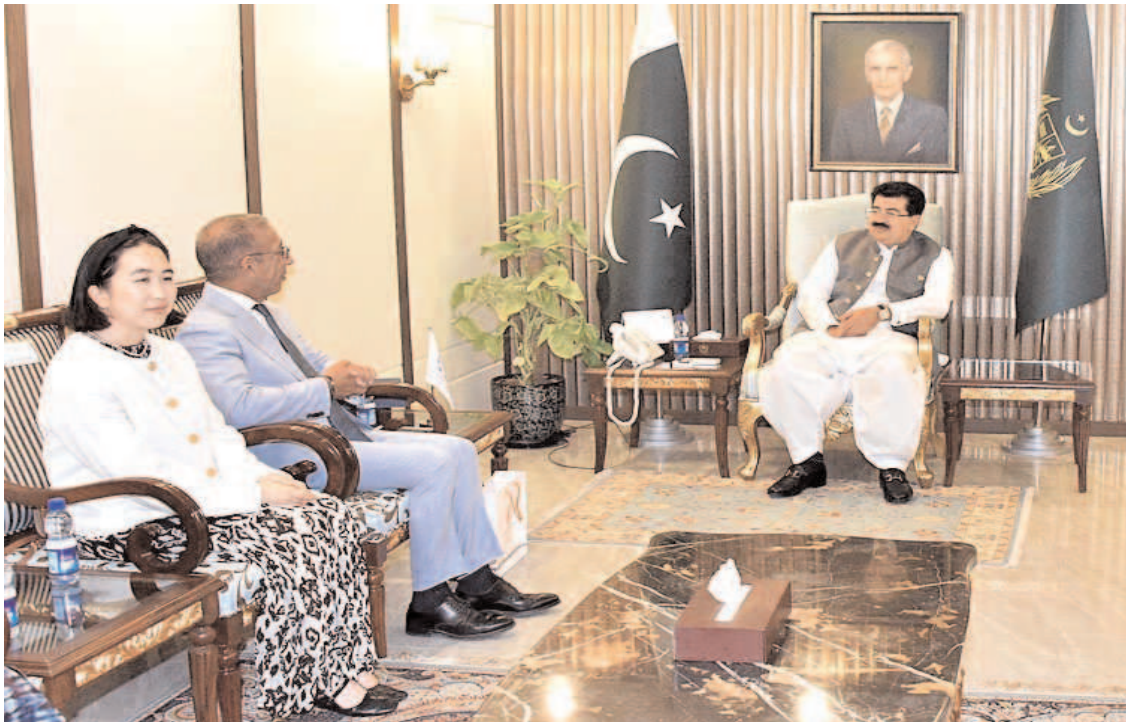
ISLAMABAD: President of the Inter-Parliamentary Union (IPU), Mr. Duarte Pacheco calling on Chairman Senate, Muhammad Sadiq Sanjrani at Parliament House.

This training session marks the beginning of a transformative journey towards promoting academic excellence and driving positive change in the higher education landscape of Pakistan. For more information and updates on the HEC National University Ranking 2023, the people can visit the HEC website, i.e., www.hec.gov.pk.