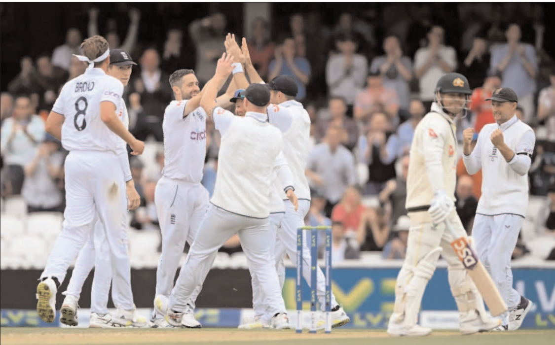
THE OVAL: David Warner's final Test innings in England was ended by Chris Woakes, England vs Australia 5th men's Ashes Test.

LONDON (Agencies): Ben Stokes gave Australia's Steve Smith a potentially match-changing reprieve after early wickets revived England's hopes of a series-levelling win on the last day of the final Ashes Test at The Oval on Monday. Australia were 238-3 at lunch, needing 146 more runs to reach a mammoth target of 384 runs, with rain threatening to intervene. Smith, then on 39, gloved off-spinner Moeen Ali onto his thigh in the last over before lunch. The ball looped to England captain Stokes at leg gully, who grabbed it one-handed above his head. But as his arm came down, his hand clipped his leg and he dropped the ball. Star batsman Smith was initially given not out and an England review confirmed Stokes's error. At lunch Smith, averaging over 93 at The Oval, was 40 not out and Travis Head unbeaten on 31. Earlier, Chris Woakes removed Australia openers David Warner and Usman Khawaja in a dramatic burst of two wickets for one run in seven balls on an overcast morning and with a pitch freshened by rain – classic English conditions for swing and seam bowling. Express quick Mark Wood then had Marcus Labuschagne caught in the slips for 13 to leave Australia, who have already retained the Ashes at 2-1 up, 169-3. Australia, bidding for a first Ashes series win in England since 2001, resumed on 135-0. Warner was 58 not out and Khawaja 69 not out.