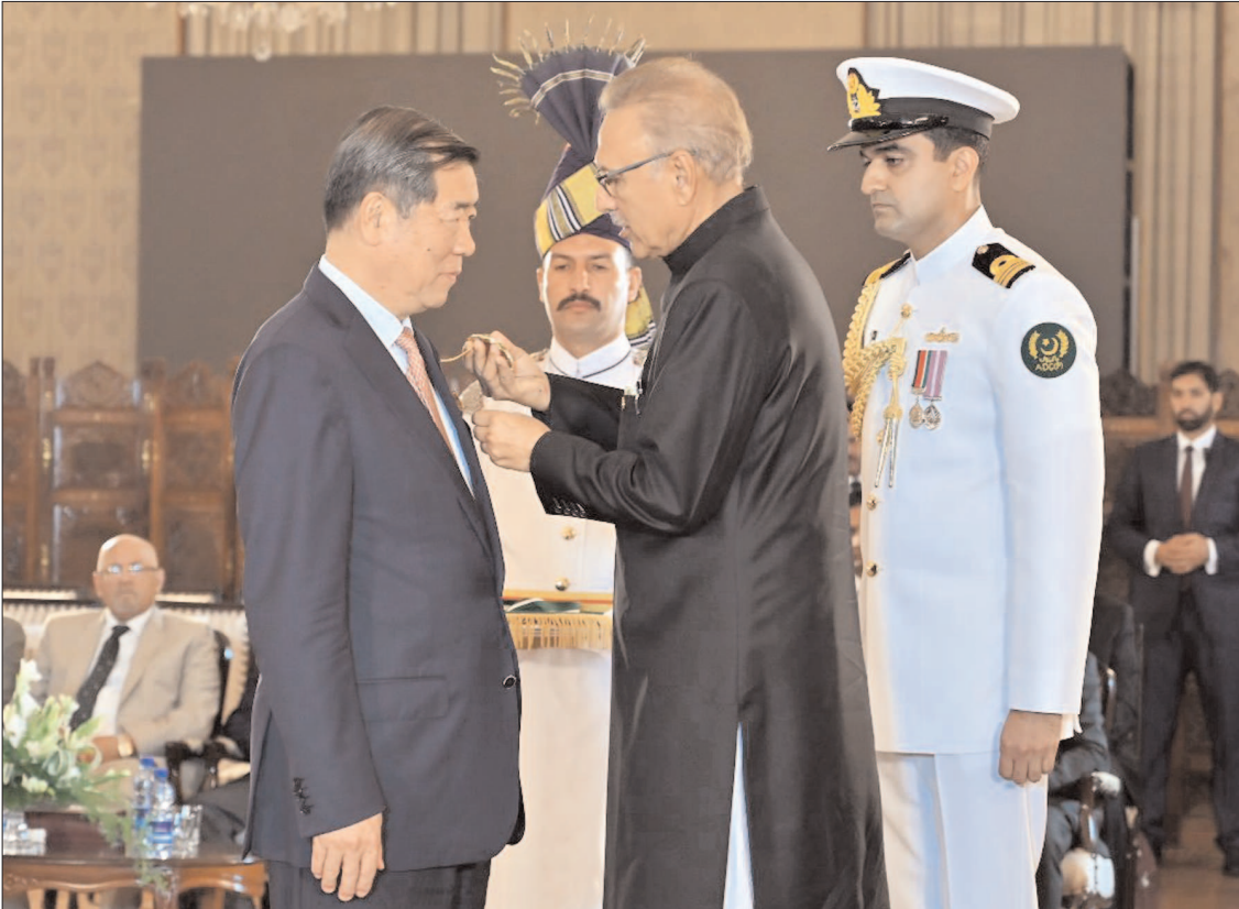
ISLAMABAD: President Dr. Arif Alvi conferring the award of Hilal-e-Pakistan upon the Vice Premier of State of China, He Lefeng, at a special investiture ceremony.

On the other hand, a road built recently in Azad Jammu and Kashmir's Havelian district at the cost of Rs60 million has been washed away by floodwater. The situation has forced area residents to carry patients on their shoulders.