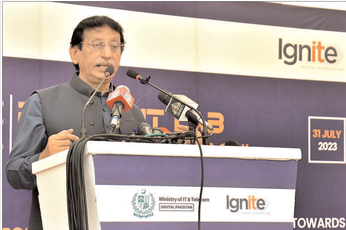
KARACHI: Federal Minister for IT & Telecom Syed Amin-ul-Haq addressing during inaugurating Ceremony Free Digital IT Lab at Rashid Minhas Govt. Boys & Girls School Nazimabad at Rizvia Chowrangi.

These accomplishments signify OGDCL's continuous pursuit of excellence in the oil and gas industry.