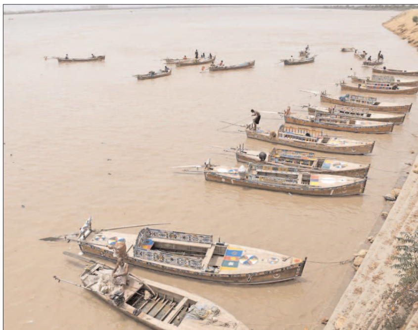
HYBERABAD: A view of Indus River at Jamshoro after recent rain.