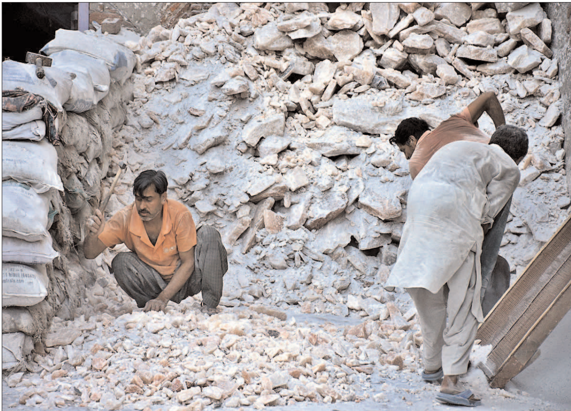
LAHORE: Labourers busy in crashing rocks of Pink salt into small pieces at their work place in Provincial Capital City.