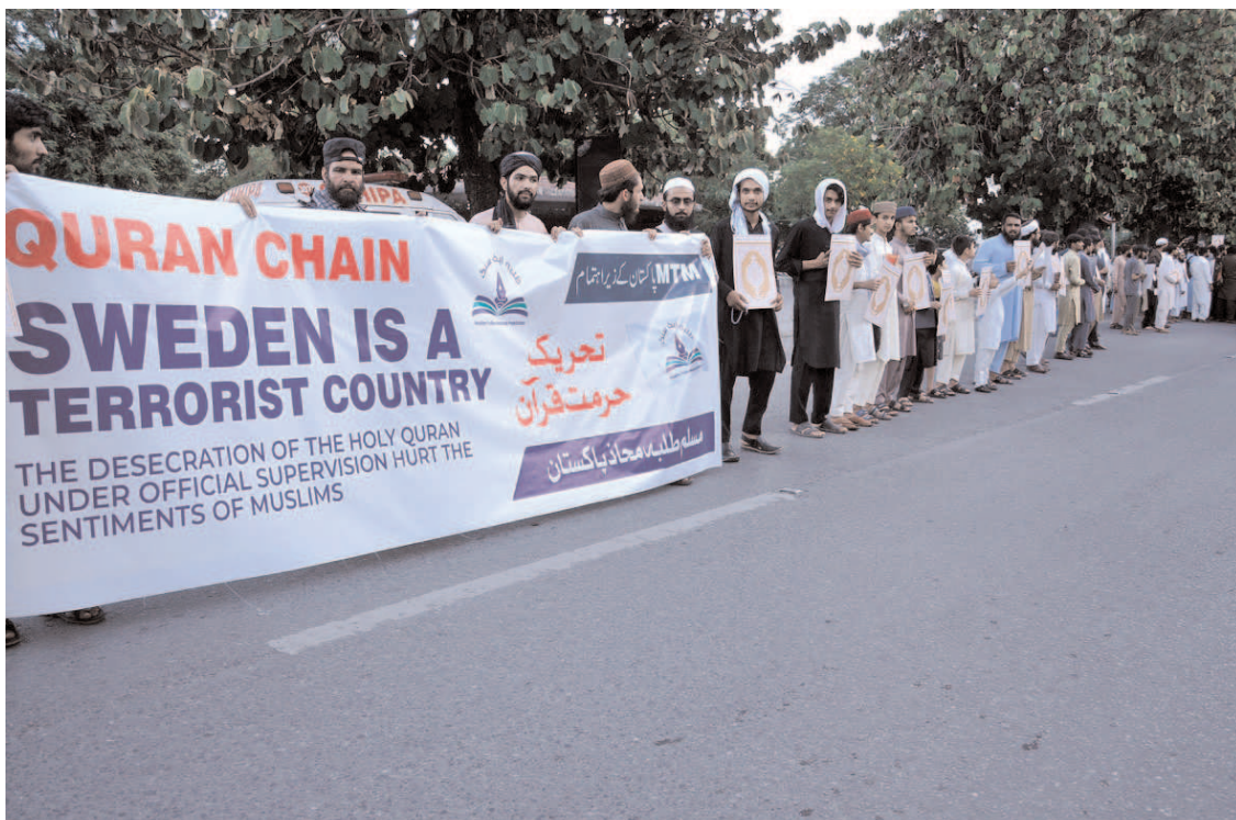
ISLAMABAD: People from different walks of life making Quran Chain organize by the Muslim Talba Mahaz Pakistan at Abpara against the desecration of Holy Quran in Sweden.