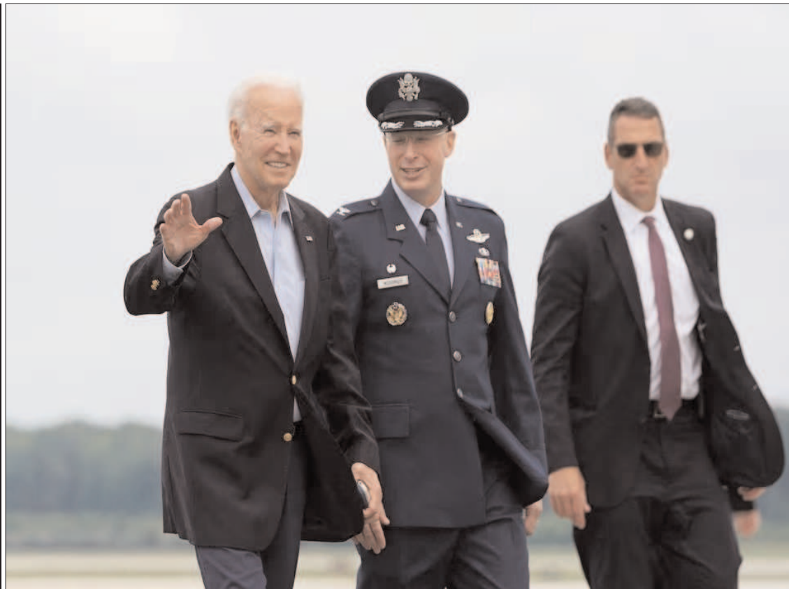
DOVER: U.S. President Joe Biden waves as he is escorted to Air Force One, before departing for Britain from Dover, Delaware.