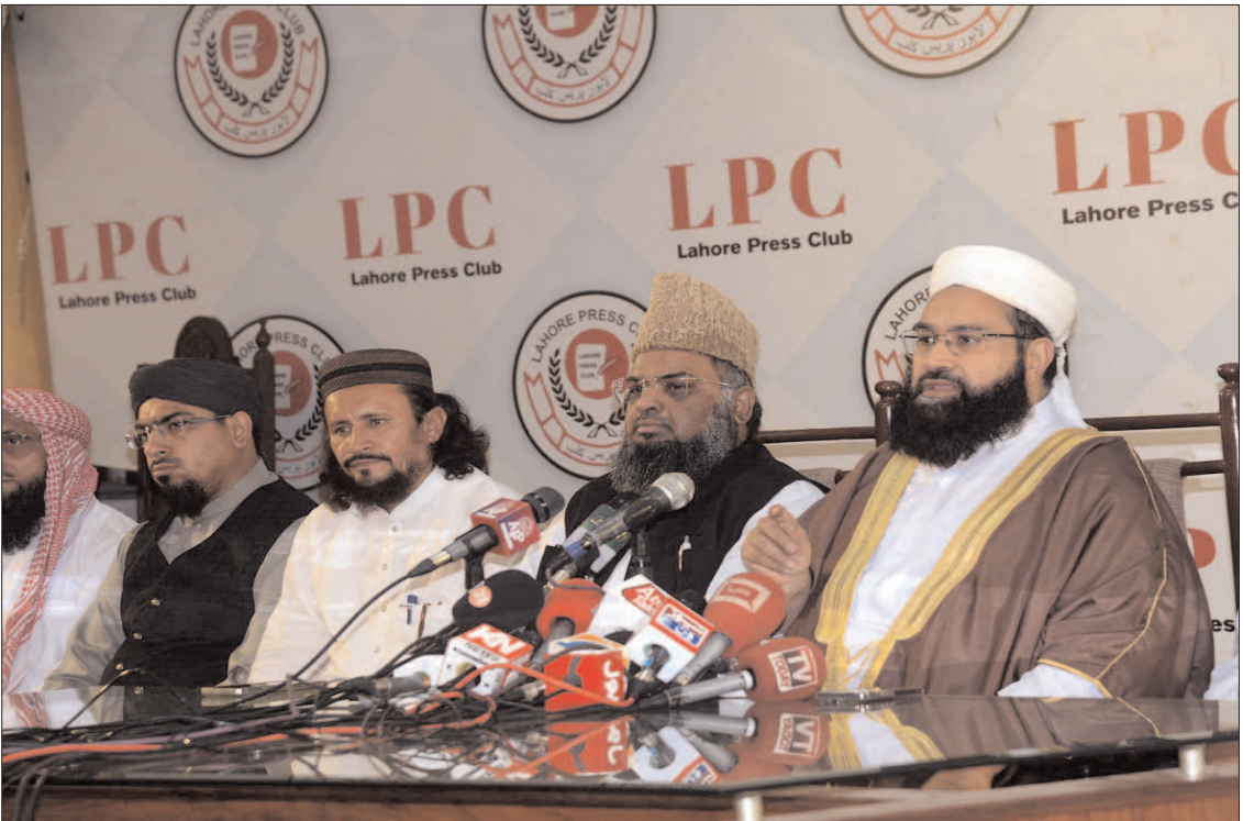
LAHORE: Special Assistant to the Prime Minister on Religious Harmony Maulana Tahir Ashrafi addressing a seminar on Hazrat Usman Ghani (R.A) at Press Club.