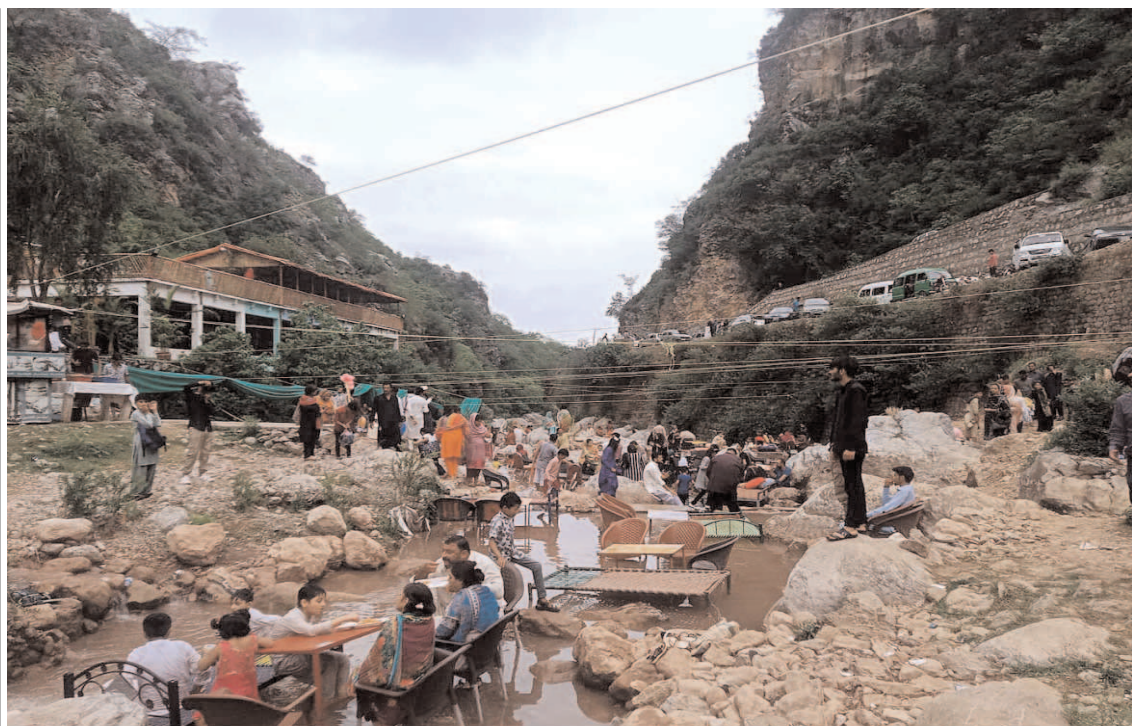
ISLAMABAD: A large number of people enjoying picnic at Shahdara valley near outskirts of the Federal Capital.

The use of frozen meat can be harmful as it may affect kidneys and cause cardiac problems adding that overeating could cause gastric irritation, high cholesterol, acidity, abdominal contraction, nausea, diarrhea, heart problems, and constipation, she added.