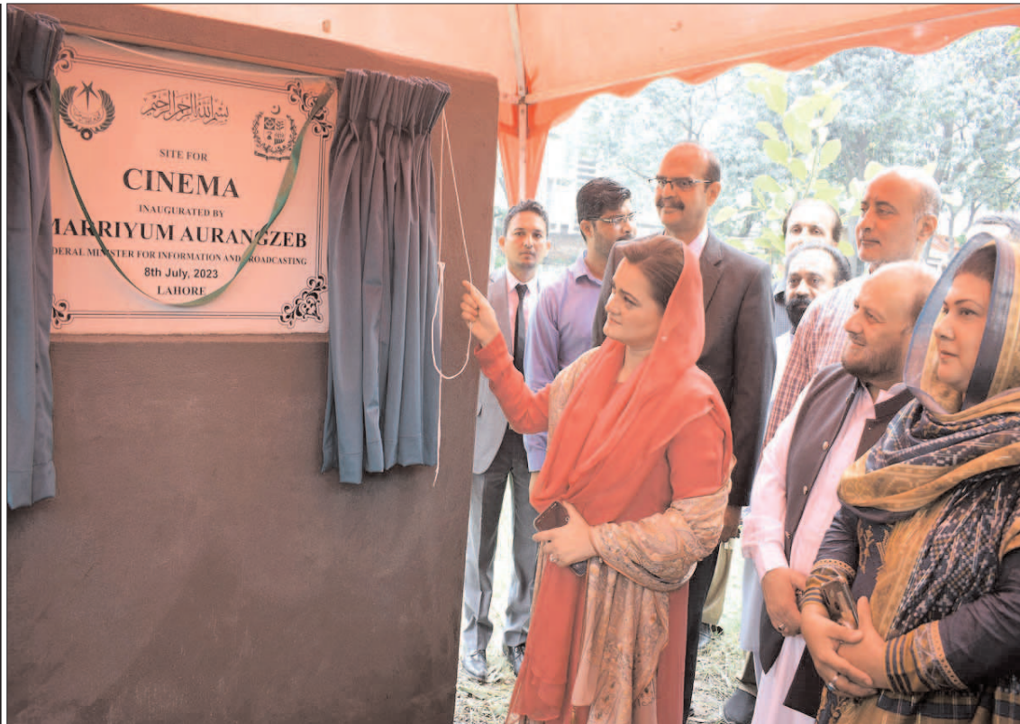
LAHORE: Federal Minister for Information and Broadcasting, Ms. Marriyum Aurangzeb Inaugurating the foundation stone for the construction of cinema building of projects at Radio Pakistan Station building.

He prayed for the high ranks of the departed soul and for the bereaved family to bear the loss with equanimity.