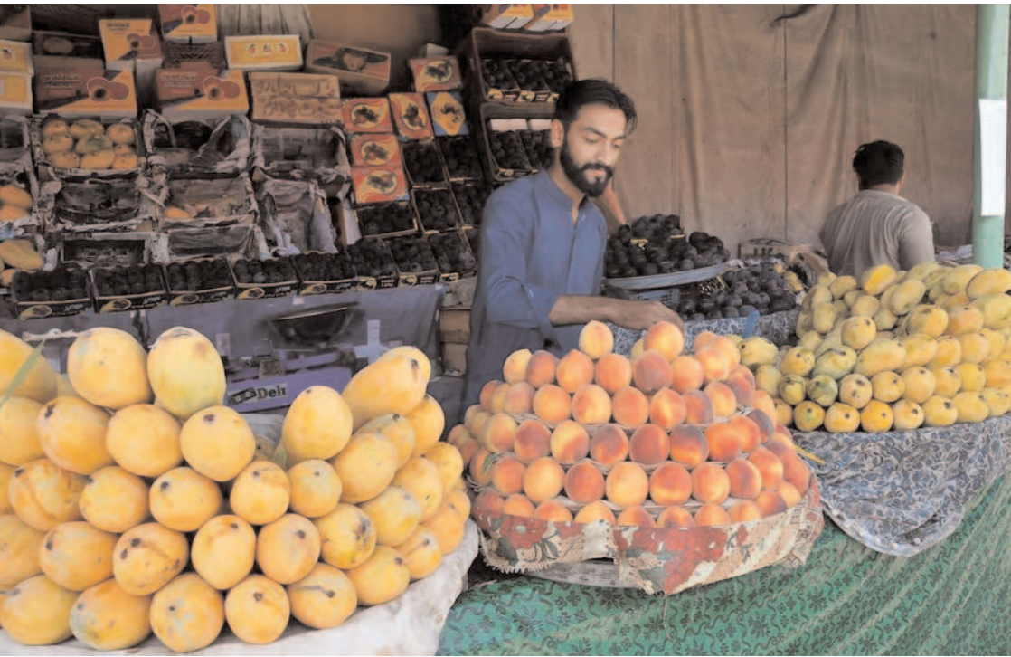
ISLAMABAD: A vendor selling fruits on his stall at weekly Sunday bazaar Peshawar Morr.