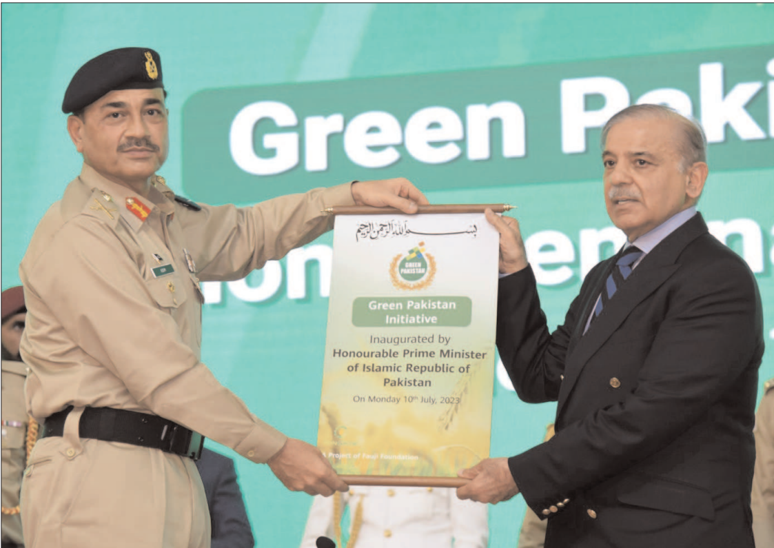
ISLAMABAD: Prime Minister Muhammad Shehbaz Sharif inaugurates Green Pakistan Initiative, COAS General Syed Asim Munir hands over the inaugural scroll to the Prime Minister.

The event was attended by Wang Yi, member of the Politburo of the Communist Party of China and Director of the General Office of CPC Foreign Affairs Commission, State Councilor and Foreign Minister Qin Gang and Chairman CIDCA, Luo Zhaohui. Leading experts and executives from several countries and international organizations also participated in the forum.