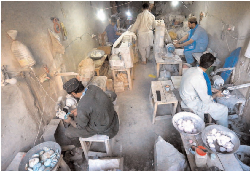
PESHAWAR: Workers busy in cleaning and washing stones in local work-place in Namak Mandi.

He further said that reservations of the refusing parents were addressed through local jirgas and the Ulema not only met with the parents but also held discussions with the health authorities to bring more material for convincing the parents.