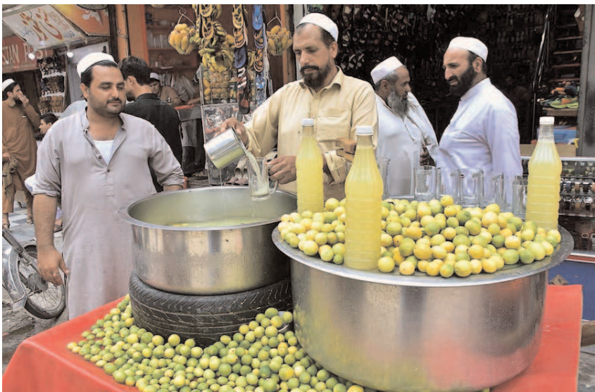
PESHAWAR: A vendor selling lemon juice during hot weather at Qissa Khwani bazaar.

PESHAWAR (APP): Muslim Youth League (MYL) and Muslim Students League (MSL) Monday carried out a protest rally against the desecration of the holy Quran and strongly condemned the incident. Hundreds of students carrying the holy Quran in their hands participated in the protest rally and demanded the United Nations take notice of the incident. The protesters said that the desecration of the holy Quran is not acceptable as it was part of Muslims' faith.