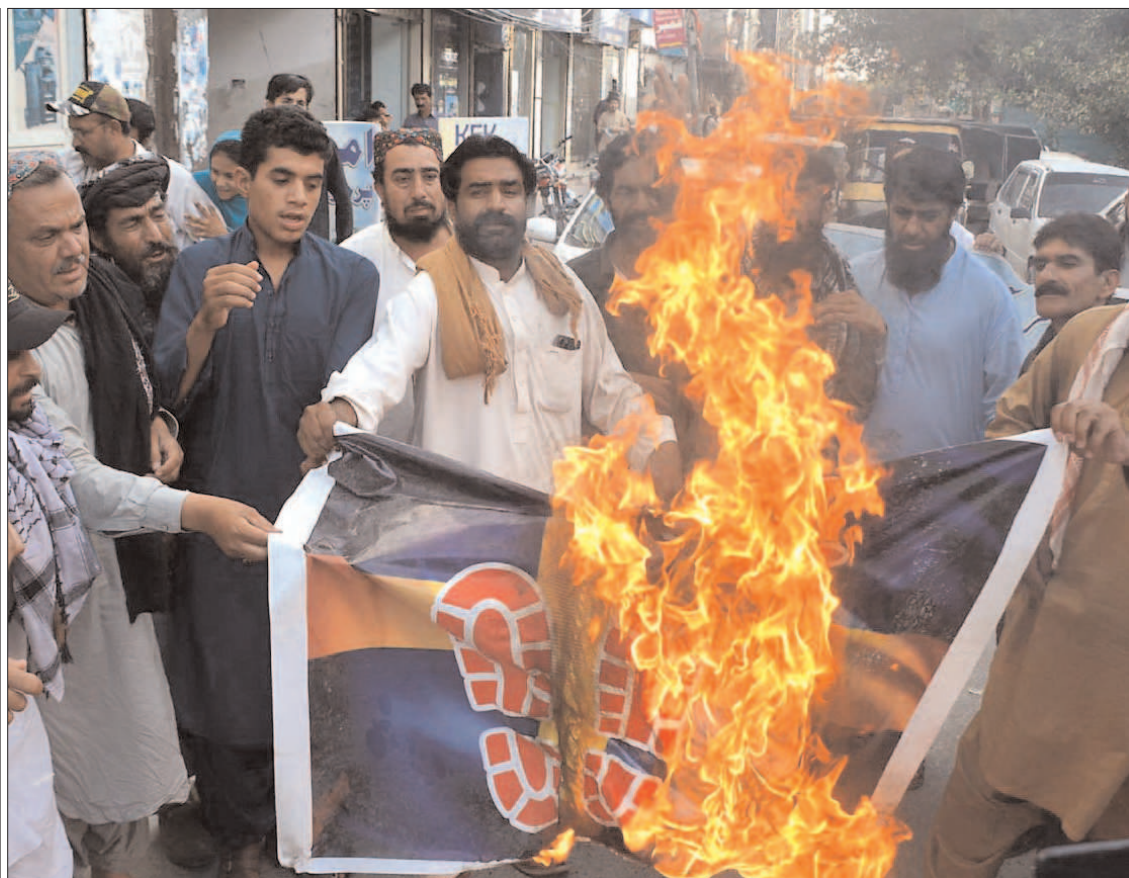
QUETTA: Activists of PML-Q burning Sweden flag during a protest against desecration of Holy Quran.