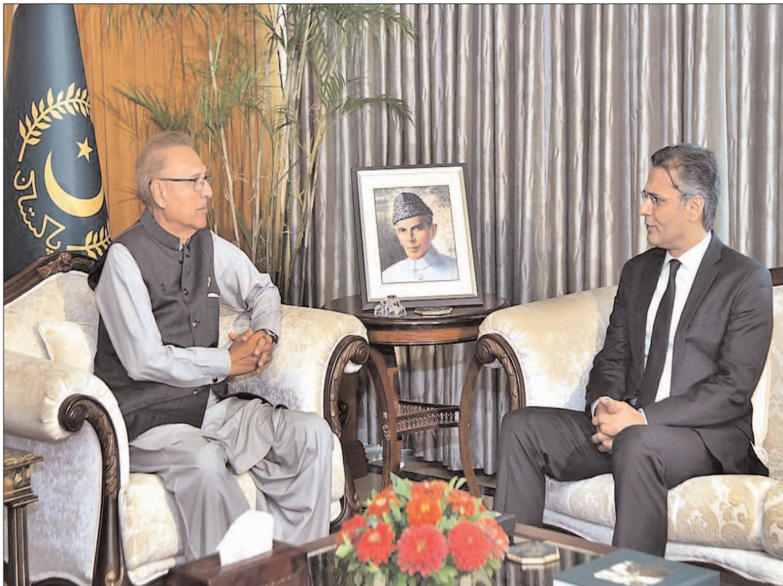
ISLAMABAD: Attorney General for Pakistan, Mansoor Usman Awan called on President Dr. Arif Alvi at Aiwan-e-Sadr.