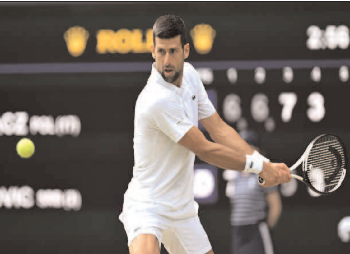
LONDON: Novak Djokovic of Serbia plays a backhand against Hubert Hurkacz of Poland in the Men's Singles fourth round match during day eight of The Championships Wimbledon 2023.

NEW DELHI (Reuters): India confirmed they will send both their men's and women's teams to the Asian Games in Hangzhou in September-October, the country's cricket board (BCCI) said. Cricket featured twice in the Asian Games but India did not participate either when the country hosted the Games in 2010 or in 2014. With India gearing up for the 50-overs home World Cup later this year, they would field a second-string men's team in the Asian Games with opener Shikhar Dhawan as the likely captain. "BCCI will send both men's and women's teams to the Asian Games..." board secretary Jay Shah said in a statement.