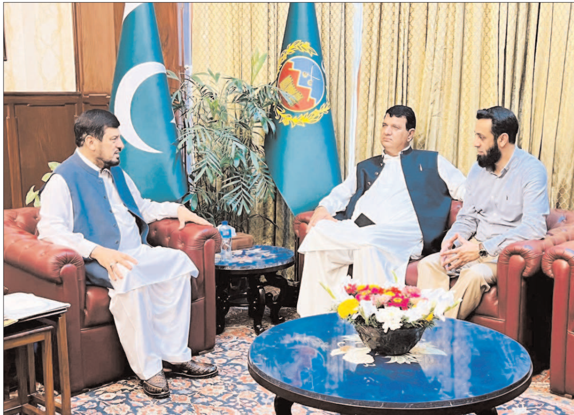
ISLAMABAD: Speaker National Assembly, Raja Pervaz Ashraf in a meeting with Federal Minister for Finance and Revenue, Senator Mohammad Ishaq Dar at Parliament House.