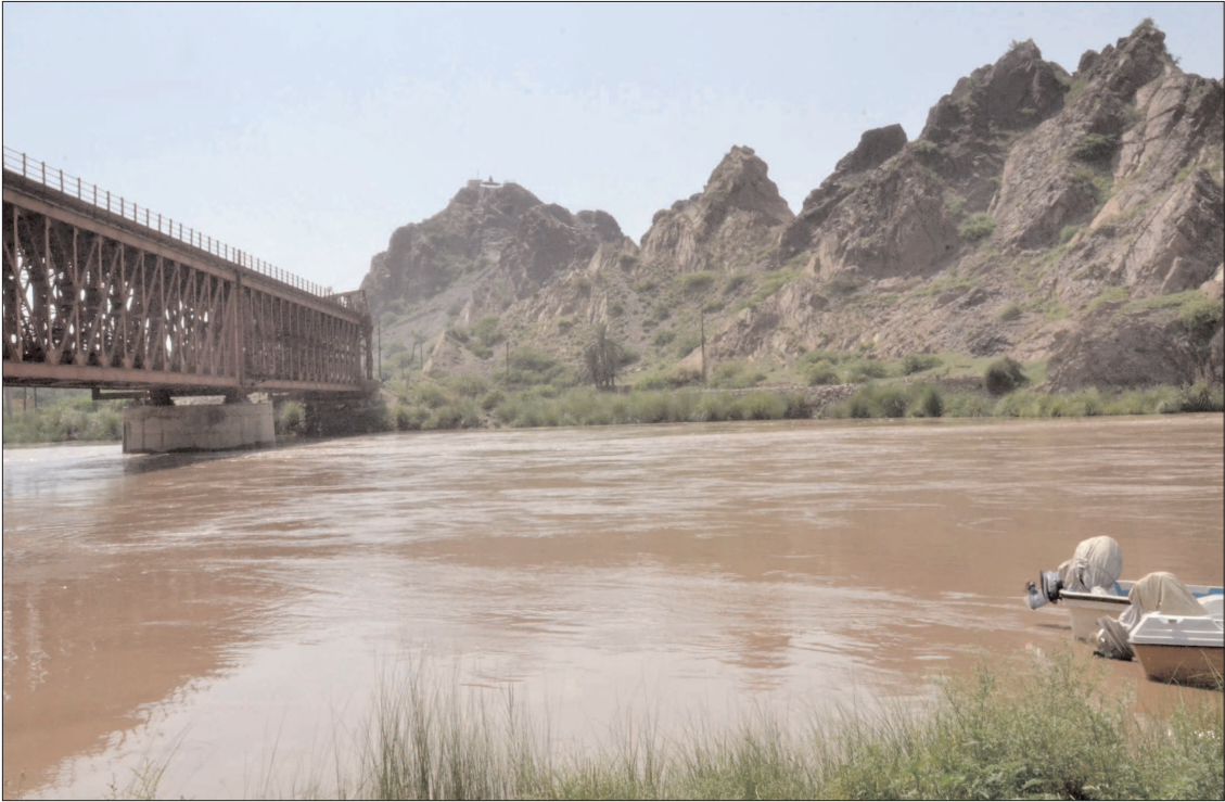
CHINIOT: A view of flood water at Chenab River as released by India.