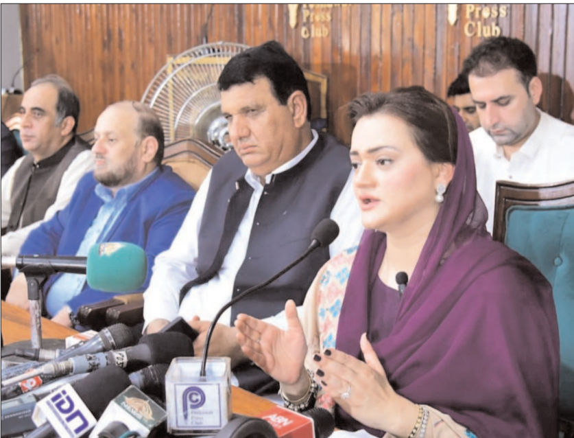
PESHAWAR: Federal Minister for Information and Broadcasting, Marriyum Aurangzeb addressing a press conference at Press Club.