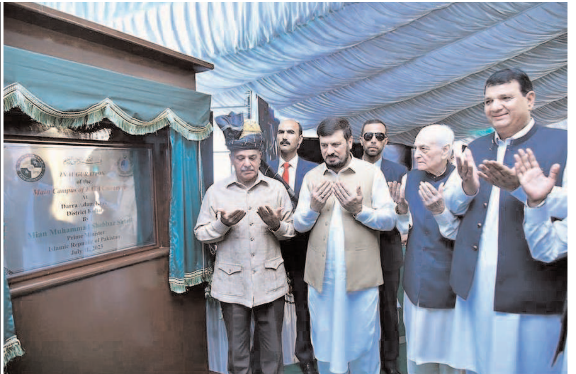
PESHAWAR: Prime Minister Muhammad Shehbaz Sharif performing inaugural ceremony of main campus of a University in Darra Adam Khel at Governor's House.

Maximum and minimum temperatures recorded were Peshawar City 37/24, Chitral 33/17, Timergara 36/23, Dir 33/15, Mirkhani 37/20, Kalam 25/07, Drosh 35/21, Saidu Sharif 34/17 and Pattan 38/24.