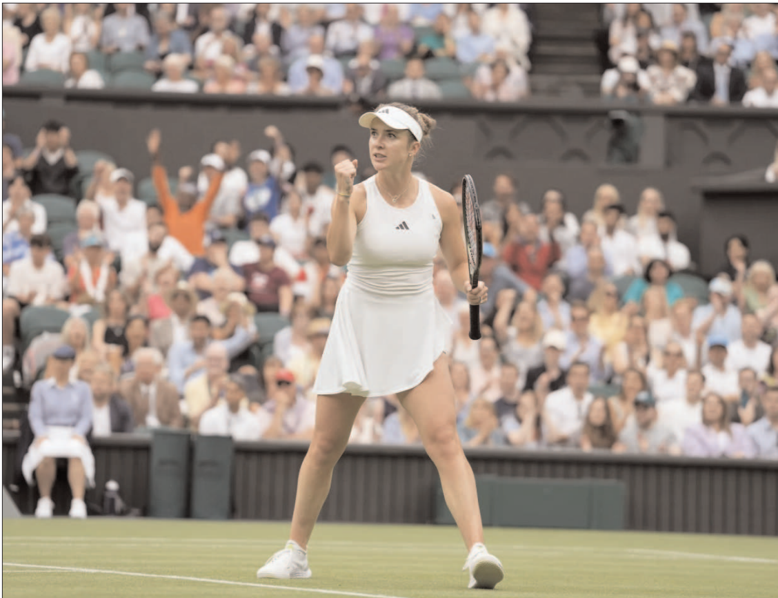
LONDON: Elina Svitolina of Ukraine reacts in the Women's Singles quarter finals match against Iga Swiatek of Poland during day nine of The Championships Wimbledon 2023.

ZURICH (Agencies): FIFA has officially lifted its suspension of the Zimbabwe Football Association (ZIFA) after an 18-month period, clearing the way for the country's participation in the African qualification competition for the 2026 World Cup. The decision was confirmed by officials on Monday, just days before the draw for the qualifiers. To ensure smooth operations during the transitional phase, an interim normalization committee has been appointed to oversee ZIFA until new management elections are held. Zimbabwe faced suspension from the global governing body in February 2022 due to perceived government interference in the administration of the troubled football association. Following allegations of misappropriation of funds meant for Zimbabwe's participation in the 2019 Africa Cup of Nations finals, the executive committee of ZIFA was dissolved in November 2021 by the country's Sports and Recreation Commission, a government-appointed body. FIFA's Bureau of the Council made the decision to lift the suspension and establish a normalization committee, stating, "The Bureau of the FIFA Council decided to lift the suspension that was imposed on the Zimbabwe Football Association in February 2022 and appoint a normalization committee with immediate effect."