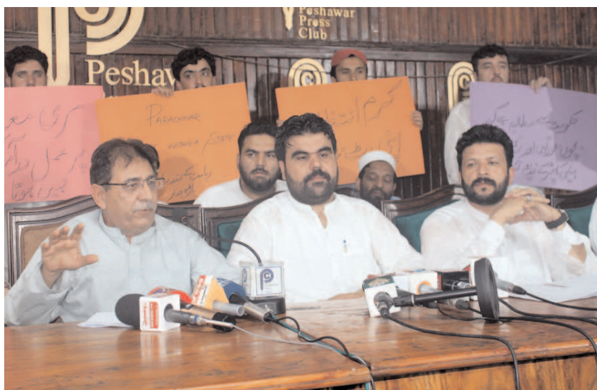
PESHAWAR: Imran Khan and Muneer Bangash addressing a press conference.

According to the code of conduct issued by the ECP, the appointment and posting/transfer of government employees has been banned in the districts where elections are being held. Prime Minister, Chief Minister, Governor, Speaker/Deputy Speaker of any assembly, representative of any other public office holders are prohibited to visit and announce any development projects in respective councils till the culmination of the said elections.