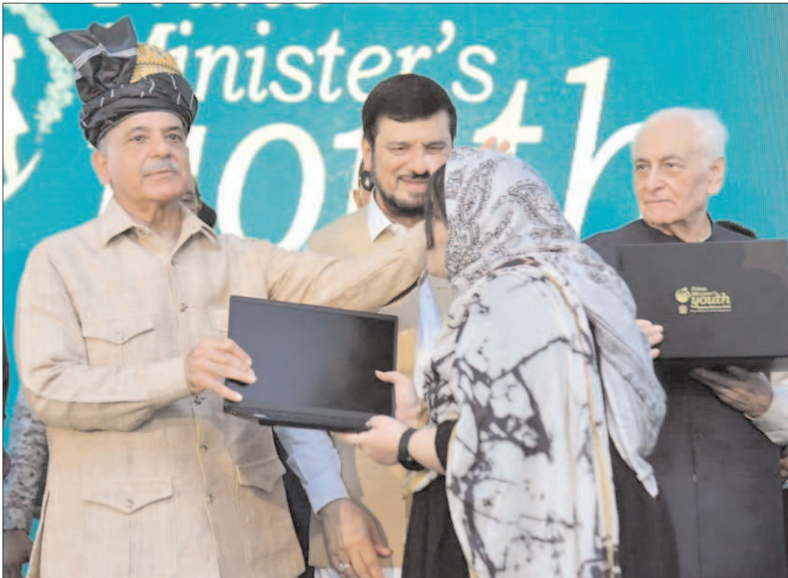
PESHAWAR: Prime Minister Shehbaz Sharif distributing laptops among high-achieving students under the PM's Youth Laptop Scheme 2023.

ISLAMABAD (PPI): Senior leader of Muslim League (N) and Federal Interior Minister Rana Sanaullah, while reacting to PDM chief Maulana Fazlur Rehman's reservations, said on Tuesday that no decision had been taken in Dubai.