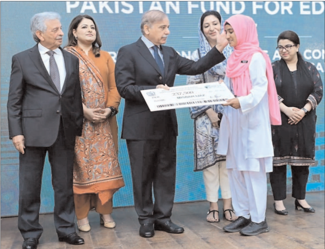
ISLAMABAD: Prime Minister Shehbaz Sharif distributing scholarships among high-achieving students on merit basis under the Pakistan Endowment Fund for Education.

Currently, he said, various projects worth Rs 150 billion were in progress in Islamabad, out of them the projects of Rs 100 billion would be completed in a month time. PML-N leader Hanif Abbasi said the Bahara Kahu flyover would be inaugurated on July 31. Information Minister Marriyum Aurangzeb was also present on the occasion. Meanwhile, the Prime Minister Muhammad Shehbaz Sharif launched the Pakistan Endowment Fund for Education along with incorporation of computer coding and constitutional studies in the National Curriculum.