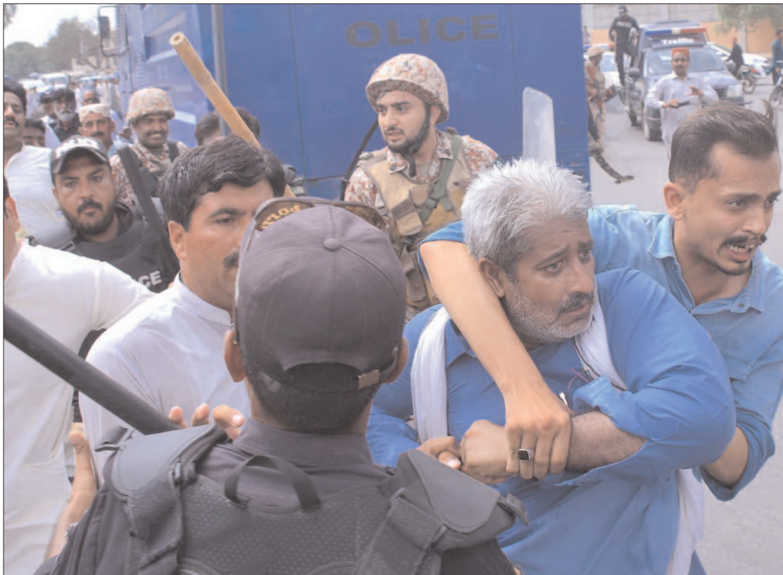
KARACHI: Police personnel arresting protesting teachers, while they trying to enter red zone.