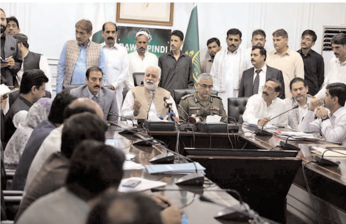
RAWALPINDI: Murtaza Javed Abbasi, Federal Minister for Parliamentary Affairs/Minister Incharge Prime Minister's Public Affairs & Grievances Wing addressing during "Open Kachari" at Commissioner Office.

He further said that, bomb disposal squad would conduct checking of routes through robots and modern technology while entry of participants in the procession would be ensured after complete checking. No laxity in security duties would be tolerated, the SSP maintained.