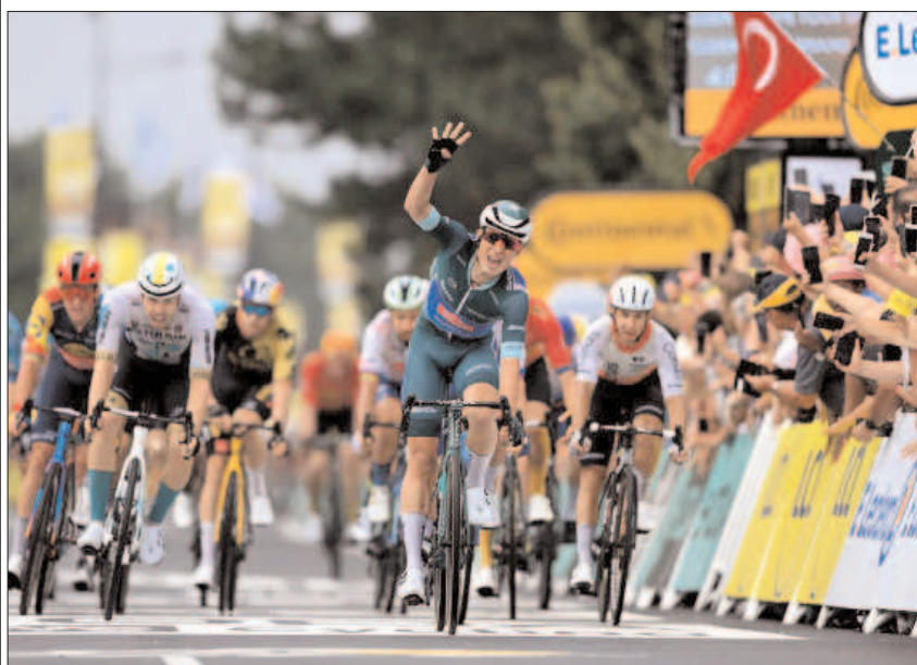
MOULINS: Jasper Philipsen of Belgium and Team Alpecin-Deceuninck - Green Points Jersey celebrates at finish line as stage winner during the stage eleven of the 110th Tour de France 2023.

She failed to convert her first match point when a net cord bounced the wrong way for her but made no mistake on the second as she moved a step closer to a second major singles title. "Since I was little I was dreaming about the Wimbledon title, it is something special," she said. "Wimbledon is different, it's more special."