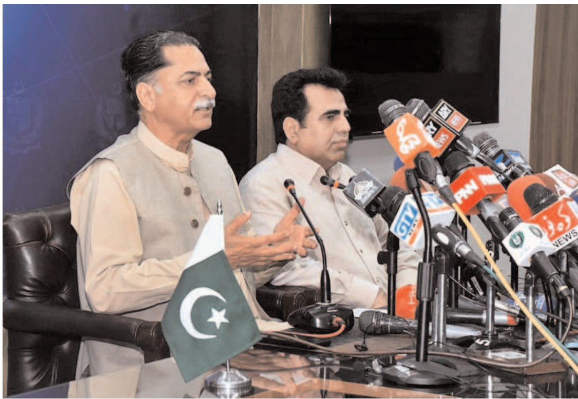
ISLAMABAD: Federal Minister, Mian Javed Latif, addressing a press conference.

RAWALPINDI (APP): City Traffic Police (CTP) Rawalpindi had issued 19,159 challan tickets and imposed a fine of Rs 6,488,350 over violations of traffic rules during the last ten days. Chief Traffic Officer (CTO) Taimoor Khan while talking to APP informed that 10,946 challan tickets were issued to motorcyclists without helmets while FIRs were registered against ten drivers for violating traffic rules. He added that permits for nine vehicles were cancelled while 479 challan tickets were issued for one-way violations. Similarly, the CTO informed that 551 challan tickets were issued to vehicles bearing tinted glasses while 359 challan tickets were issued for wrong parking.