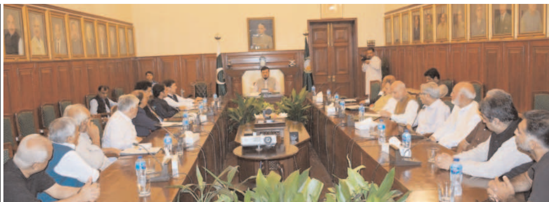
PESHAWAR: Governor Khyber Pakhtunkhwa Haji Ghulam Ali presiding over a meeting with officials of Health Department and Rotary International at Governor's House.