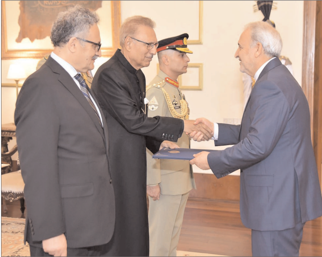
ISLAMABAD: Ambassador-designate of Iran to Pakistan, Dr Reza Amiri Moghaddam, presenting his diplomatic credentials to President Dr Arif Alvi, at Aiwan-e-Sadr.