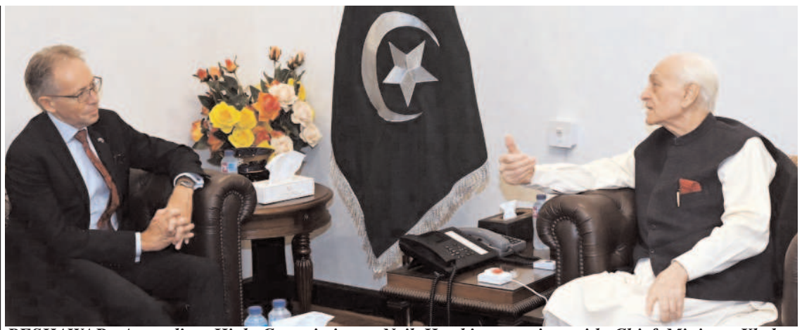
PESHAWAR: Australian High Commissioner Neil Hawkins meeting with Chief Minister Khyber Pakhtunkhwa Muhammad Azam Khan.

property rights to women and address land settlements issues among tribesmen. He said land digitalization in merged areas would help increasing efficiency, accuracy and convenience. Appreciating the support of US, he said land digitalization in all 49 subdivisions in merged areas would be completed in three to four years. Initially the project was started with an estimated cost of Rs 1200 million under which 90 percent manual work on property and settlement issues in merged areas were completed. Provincial Ombudsperson, Rakhshanda Naz said the project would economically empower women in tribal districts after digitalization of land records and would long disputes among tribesmen.