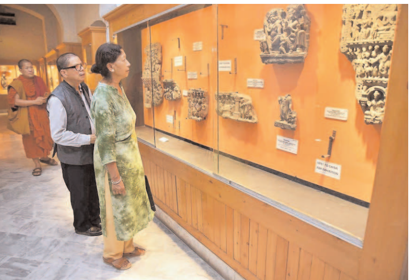
PESHAWAR: Monks from different countries visit Peshawar Museum to see remains of Buddha's.

They thanked the hospitality of Government and reiterated to come again to Khyber Pakhtunkhwa being a tourists friendly province of Pakistan.