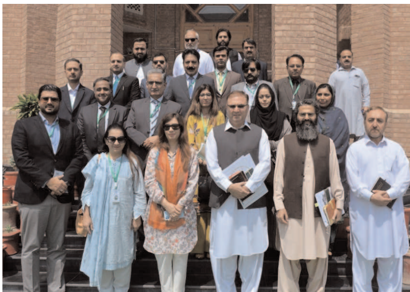
PESHAWAR: A group photo of participants of 37th Mid-Career Management Course of NIM Islamabad with Special Secretary (P&D) Khyber Pakhtunkhwa.

PESHAWAR (APP): The under-training officers of the 37th Mid Career Management Course (MCMC) of the National Institute of Management (NIM), Islamabad here Thursday visited different offices at Peshawar. The participants were briefed by Special Secretary Planning and Development KP in detail regarding the administrative affairs and ongoing development projects in the province besides the merged tribal districts. Later on, the delegation visited the office of IGP at CPO where the under-training officers were given detailed briefing about law and order situation in KP and the KP police. The participants also visited Regional Tax Office where Chief Commissioner Inland Revenue briefed them about the revenue collection. Earlier, the participants of 37th MCMC have also visited Sarhad Chamber of Commerce and Industry, Peshawar Museum and Model Collectorate. The under training officers belonged to Pakistan Administrative Service, Information Service, Foreign Service, Inland Revenue Service, Audit and Accounts Service, IB, Commerce and Trade Group, Election Commission, Board of Investment and Planning and Works.