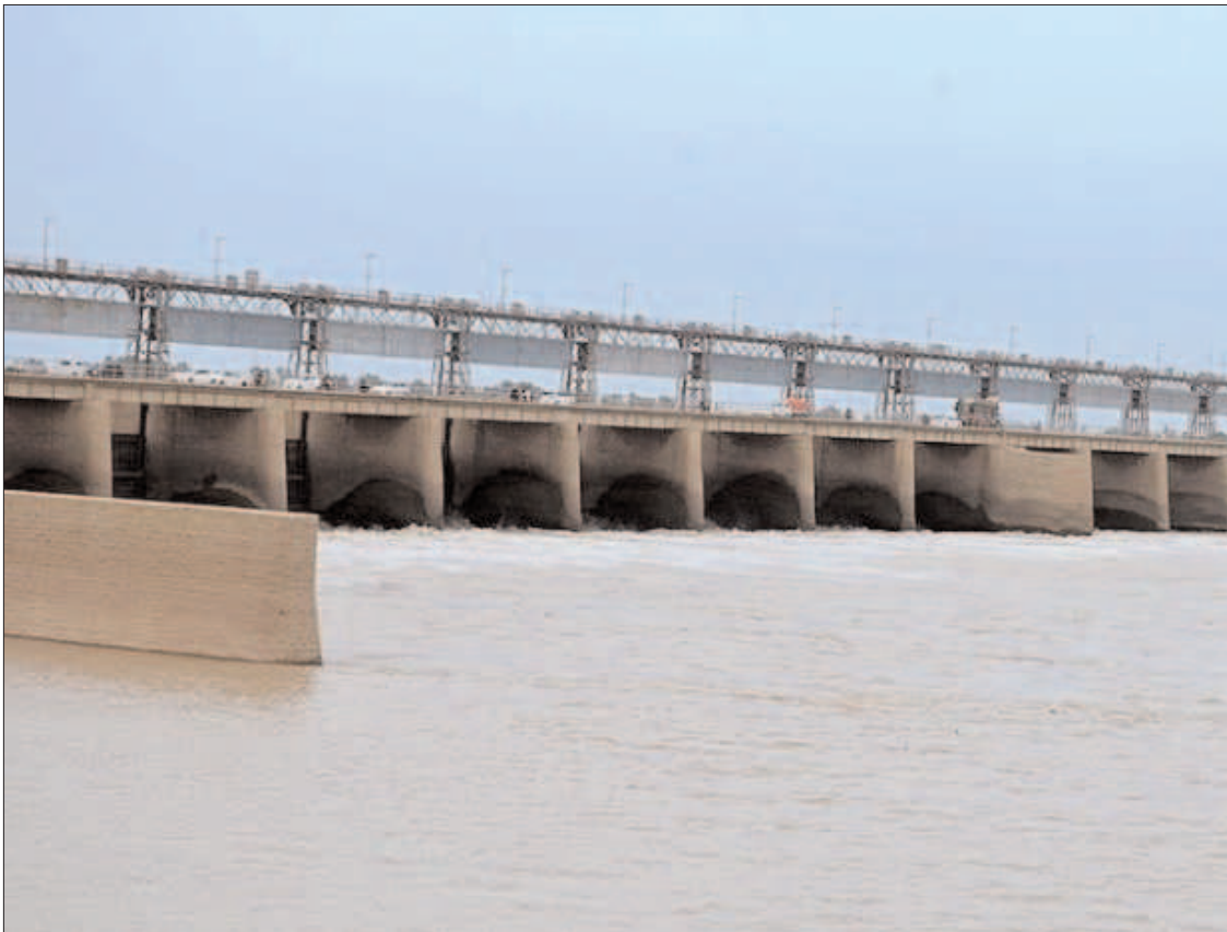
HYDERABAD: A view of water level of Indus River rises after the recent rains in the country.

GUJRANWALA (INP): The police resolved a murder case on Thursday and detained elder sister for killing younger sister over domestic disputes. According to details, a 26-year girl was stabbed to death in Cheema Colony of Gujranwala some one week earlier. The police over suspicion arrested elder sister of the deceased who during investigation revealed that she stabbed to death her younger for not washing dishes.