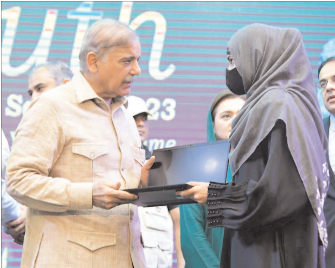
MULTAN: Prime Minister Shehbaz Sharif distributing laptops among the high achievers of public sectors universities under the PM's Youth Laptop Scheme.

Vol. XXXIX No. 175 Regd. No. 241 ZIL HAJJ 25 1444 -- FRIDAY, JULY 14 2023 PESHAWAR EDITION 12 PAGES PRICE. 30