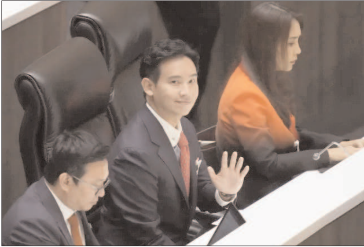
would have been unthinkable.

Thitinan thinks that given the massive voter support for Move Forward and the Pheu Thai Party, its top partner and political ally, Pita stands a good chance "because of mounting public pressure on the senators. It will depend on the will, the resilience and the intransigence of the royalist conservative establishment." But if Pita cannot win over enough senators, his options appear nil. The options for the eight-party coalition as a whole appear more viable. One is for the Pheu Thai Party to put forward one of its members as a candidate for prime minister, a possibility that once