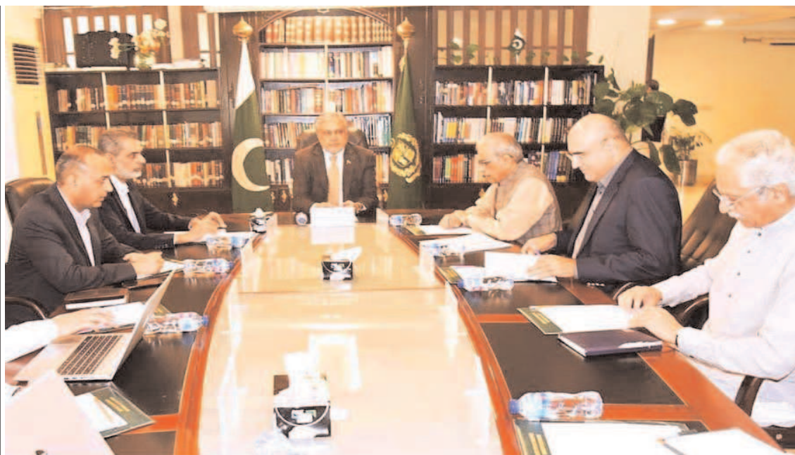
ISLAMABAD: Federal Minister for Finance and Revenue Senator Mohammad Ishaq Dar chaired a meeting on the establishment of Pakistan Sovereign Wealth Fund, at Finance Division.

He said that the IMF's main conditions include ending electricity subsidies, keeping debt within serviceable limits, keeping the value of the dollar in line with the market, improve governance, increase revenue, end corruption, reform the energy sector and making country resilient to climate change. Next installment will be possible only after quarterly review of operational progress on these issues.