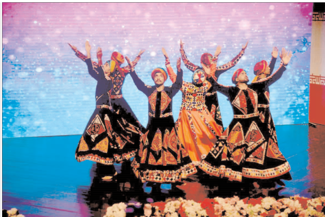
LAHORE: Artists presenting an art performance in the Sufi Music Festival regarding the culture of Pakistan and Iran at Al Hamra.

Regarding the allocation of land in the zone, he explained that as per the regulations of the SEZMC land will be exclusively provided to investment companies. In response to another question, Sharjeel Inam Memon expressed his enthusiasm for the project, stating that it will have a significant positive impact on Karachi, Sindh, and Pakistan as a whole. He mentioned that the project has the potential to expand from its initial size of 1500 acres to a massive 15000 acres.