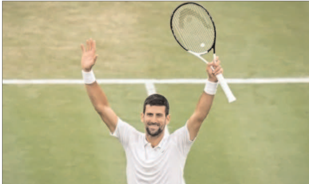
Novak Djokovic celebrates winning in the Wimbledon semi-finals.

"Jannik has proven why he is one of the leaders of the next generation and one of the best players in the world. I tried not