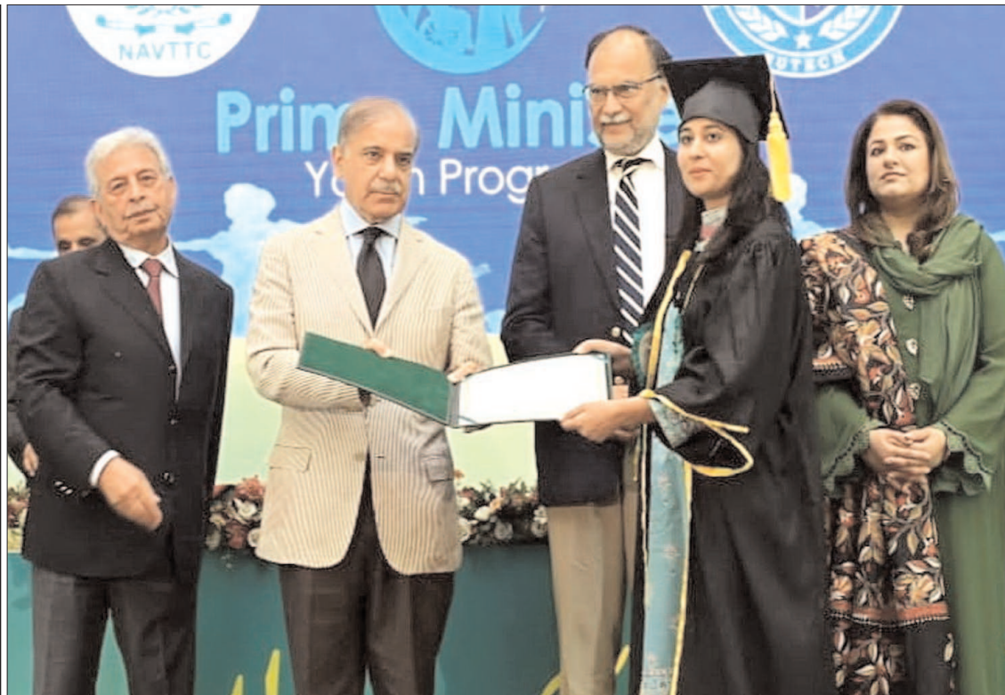
ISLAMABAD: Prime Minister Shehbaz Sharif distributing certificates among the successful candidates of Prime Minister's Youth Skill Development Program.

Later, Rana Sanaullah also chaired the PML-N Punjab party meeting, which was attended by party's senior leader Pervaiz Rasheed, Anusha Rehman and others. During the meeting, it was decided that lists would be sought from all party organisations about the party candidates in all constituencies. The meeting also decided to field the PML-N candidates in each and every constituency, and finalise preparations to accord a warm welcome to party supremo Muhammad Nawaz Sharif upon his arrival in the country.