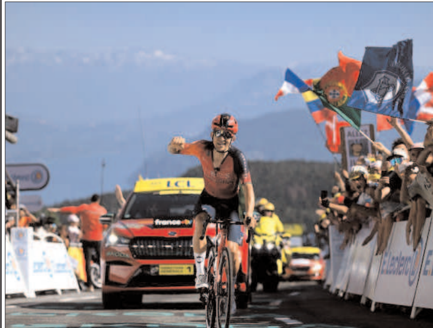
GRAND COLOMBIER: Michal Kwiatkowski of Poland and Team INEOS Grenadiers celebrates at finish line as stage winner during the stage thirteen of the 110th Tour de France 2023 a 137.8km stage.