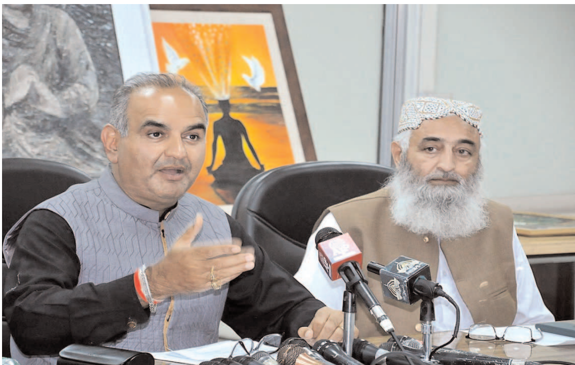
ISLAMABAD: Dr. Ramesh Kumar Yankwani Chairman/Minister of State Prime Minister's Task Force and Gandhara Tourism important press conference at Sir Syed Building 19 Atta Turk Avenue, G5.

Then there is also a challenge of changing our mindset as we always show off air of magnificence due to classes division, seeing anybody riding a cycle with scorn. Therefore, it is direly needed that the elected representatives, affluent, top ranking government officials, academia and jurists must come forward to revive this culture.