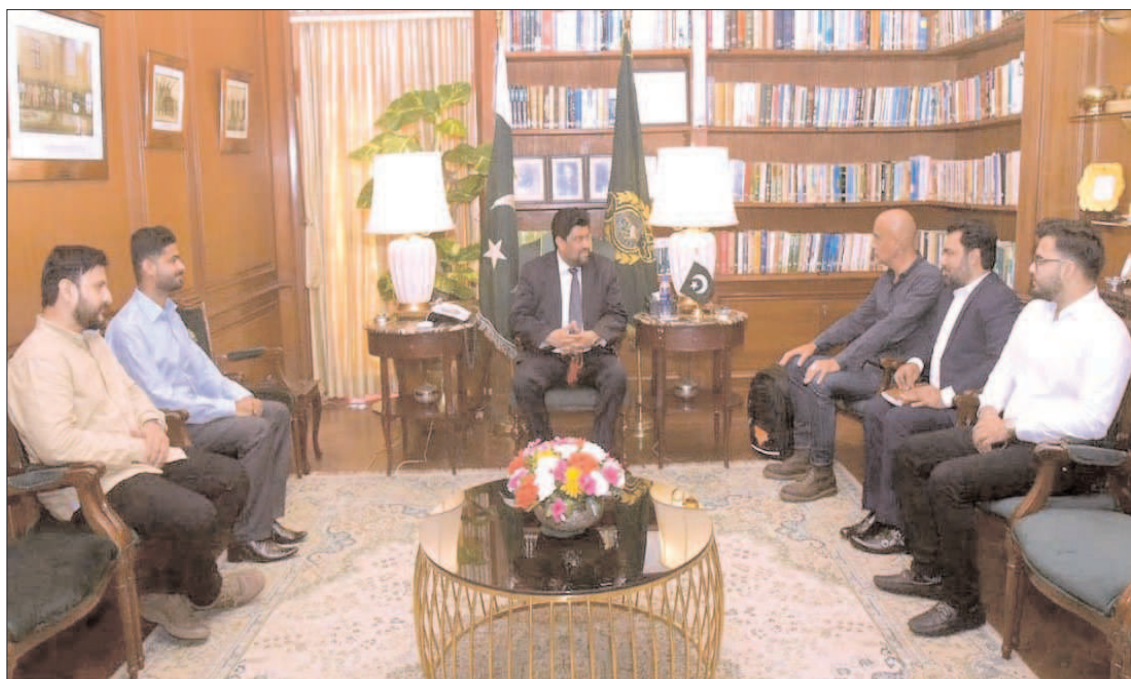
KARACHI: Governor Sindh Kamran Khan Tessori meets delegation of French NGO, Triangle Generation Humanitaire at Governor House.

As many as 638 people with serious injuries were shifted to different hospitals, while 638 with minor injuries were treated at the incident site by the rescue medical teams. The data analysis showed that 658 drivers, 40 underage drivers, 114 pedestrians and 531 passengers were among the victims of road traffic crashes. The statistics showed that 253 accidents were reported in Lahore, which affected 285 persons, placing the provincial capital at top of the list, followed by 89 in Multan with 97 victims.