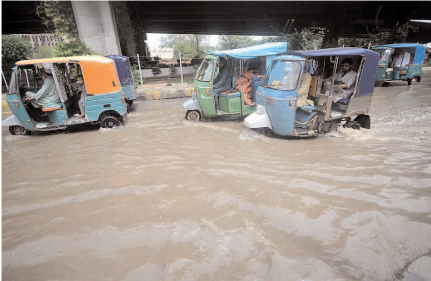
PESHAWAR: Vehicles passing through accumulated rain water after heavy rain in provincial capital.

They urged the TDAP to organise further trainings and awareness sessions on E-commerce.