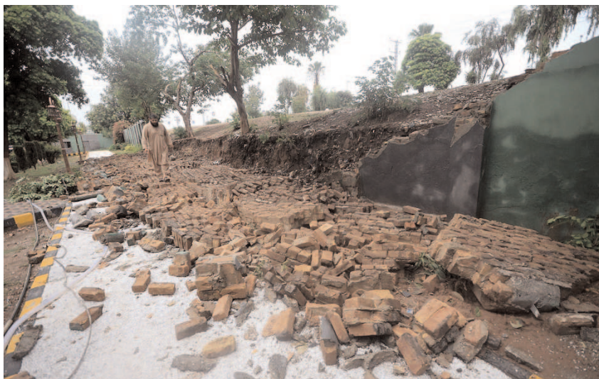
PESHAWAR: A view of fallen wall of Jinnah Park due to heavy rain.