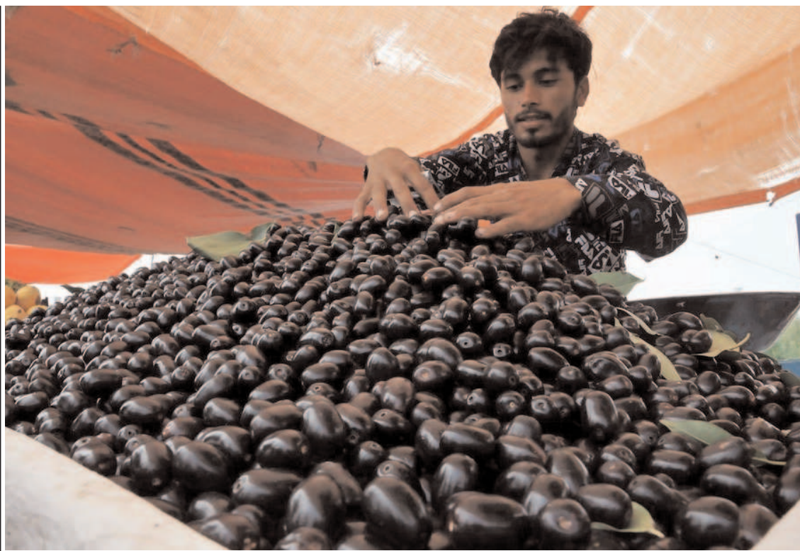
ISLAMABAD: A vendor selling Jambolan at his roadside setup in Federal Capital.

The exhibition provided a good platform to the students to demonstrate their innovative projects and foster their professional development. It also offered an opportunity to stakeholders from various industries, institutes, and community members to visit the Faculty of Engineering and Technology at IIUI. The event showcased final year design projects (FYDP) of students from the Department of Mechanical Engineering (DME) and the Department of Electrical, Computer Engineering (DECE) and Department of Civil Engineering.