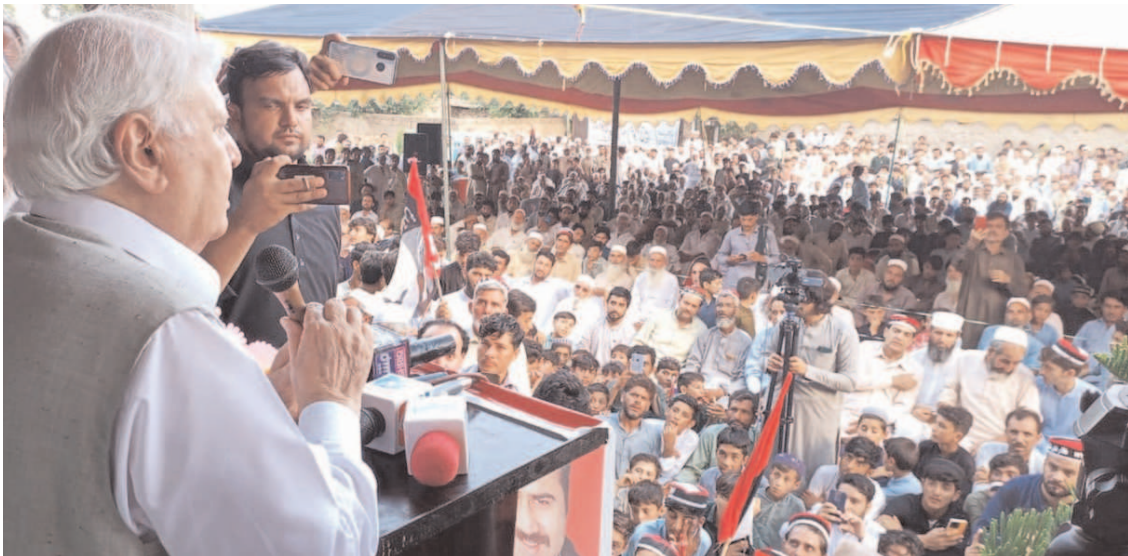
PESHAWAR: Chairman Qaumi Watan Party Aftab Ahmad Khan Sherpao addressing a public gathering.