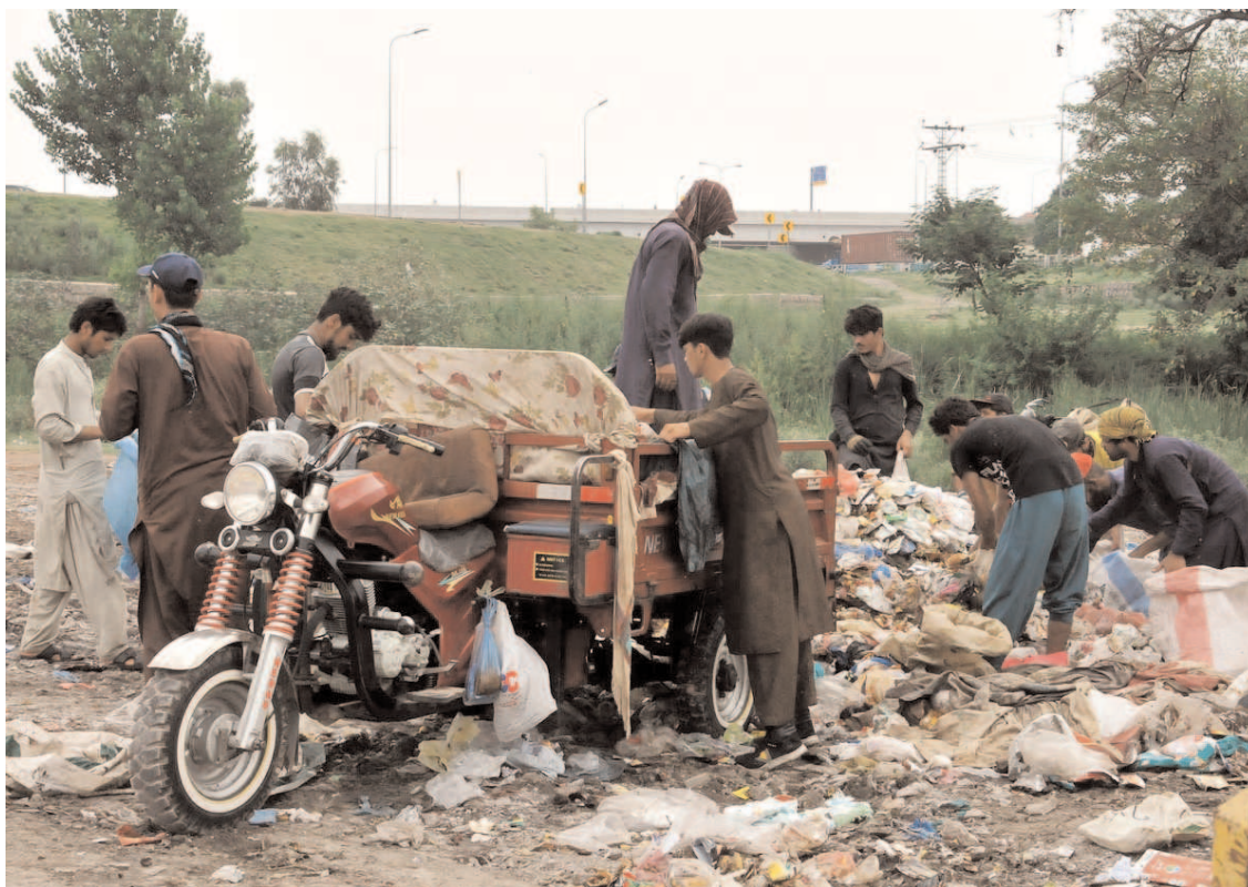
ISLAMABAD: Gypsy boys searching valuables from garbage near Khanna Pul area in the Federal Capital.