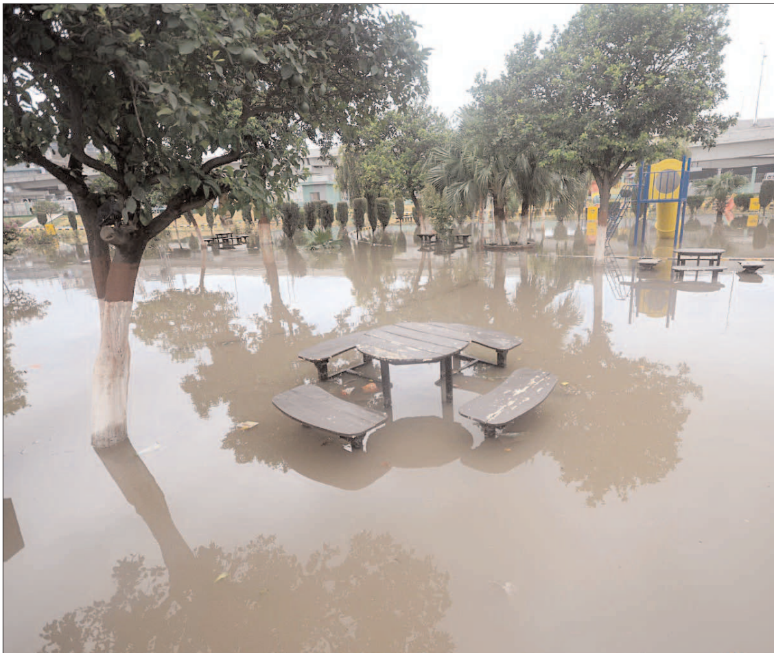
PESHAWAR: A view of accumulated rainwater at Jinnah Park after heavy rain in the city.