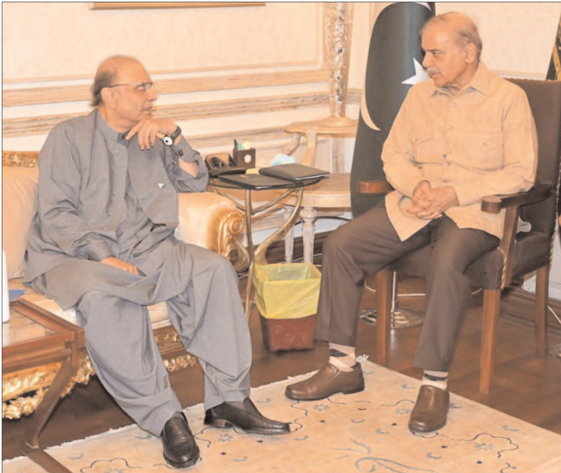
LAHORE: President PPP, Asif Ali Zardari called on Prime Minister Shehbaz Sharif.