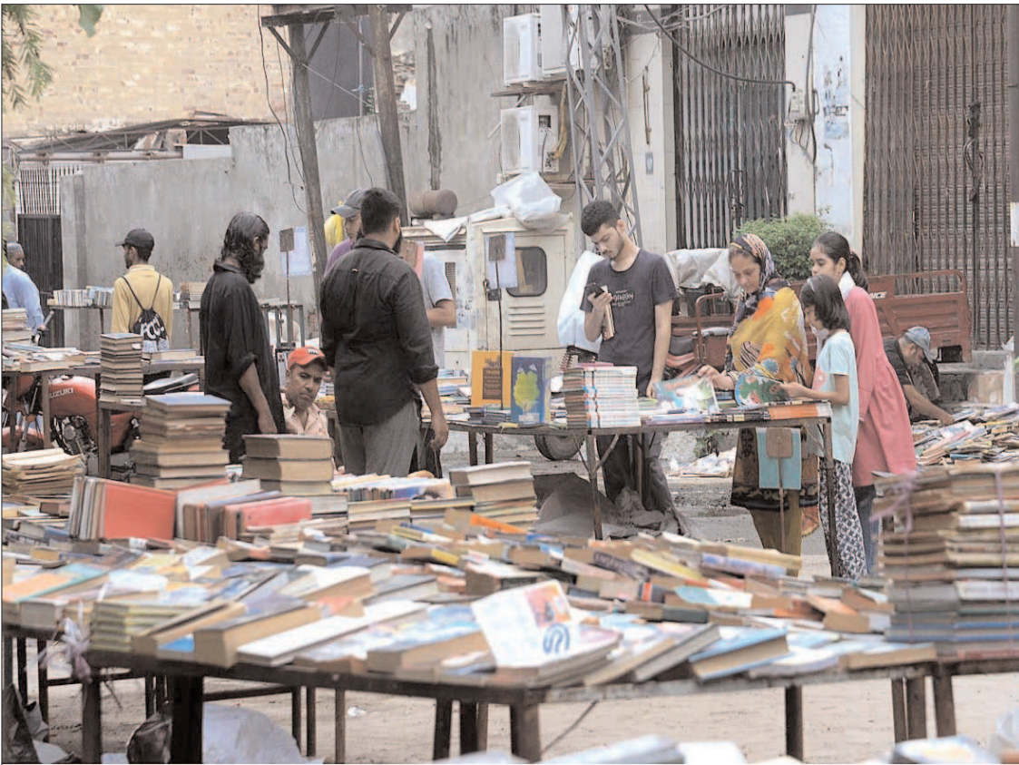
LAHORE: People busy in selecting and purchasing old books from roadside stall in Provincial Capital.