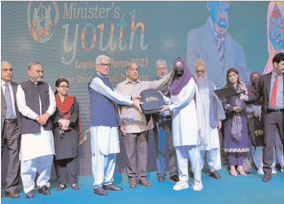
SIALKOT: Prime Minister Muhammad Shehbaz Sharif distributes laptops among the high achievers of public sector universities under the PM's Youth Laptop Scheme.

"Those people who had conspired against the country, with the grace of Allah Almighty, all their machinations have been buried and their links abroad, including a recent statement by Israel against Pakistan, all these were failed," he added. About IMF's agreement, he said it was something of 'sweet meat', and alluded to the economic challenges. But with determination and commitment, they could stabilize the economy with revolutionary and bold steps, he stressed.