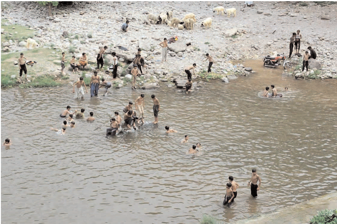
ISLAMABAD: Youngsters jumping and bathing in water channel of Rawal Dam to get some relief from hot weather in Federal Capital.