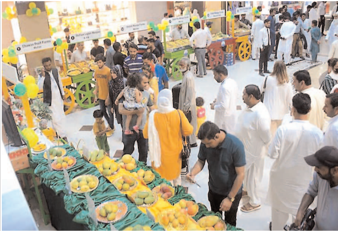
ISLAMABAD: People taking keen interest in Mango Festival.

Sharing his personal feelings about the CPEC project, he said, the beauty of CPEC is that this project was between those two countries, which enjoy a very unique relationship.