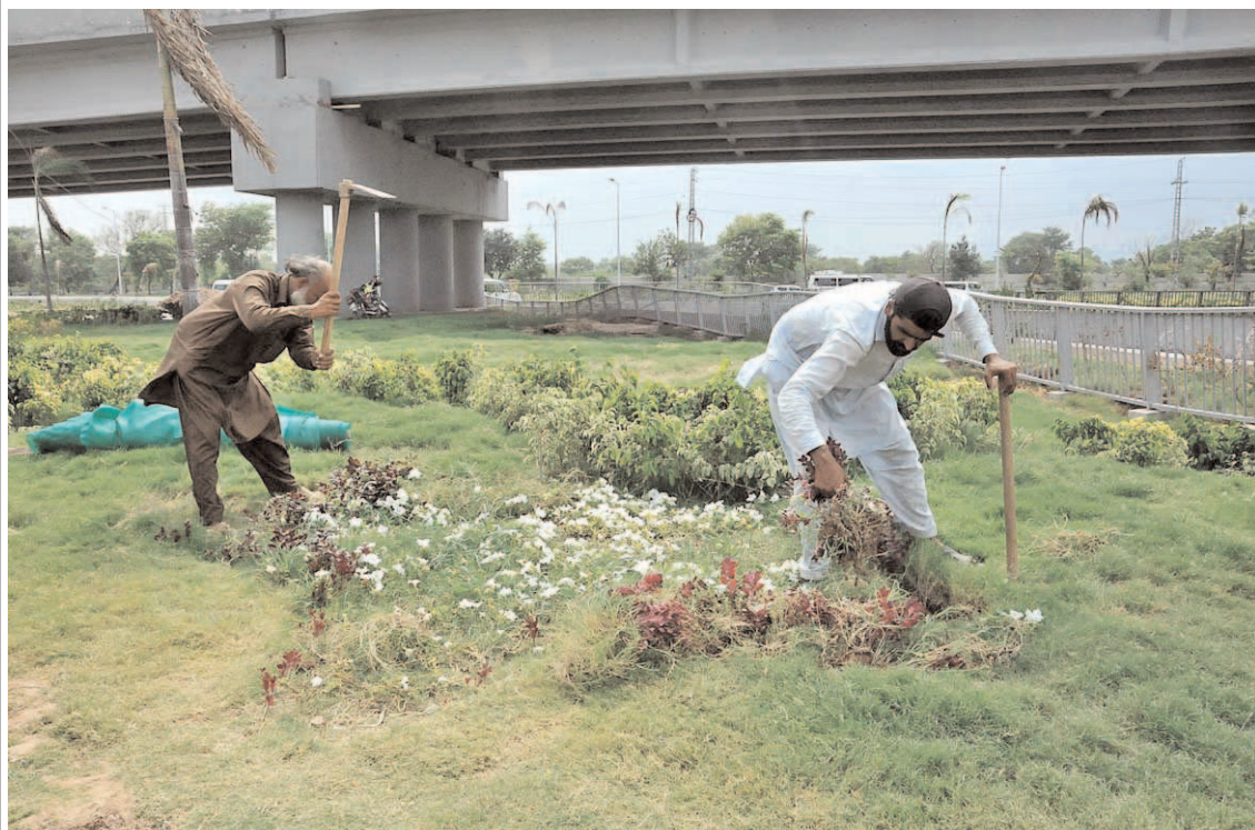
ISLAMABAD: CDA gardeners busy in work on greenbelt area at Rawal Dam Chowk in Federal Capital.

Therefore, the residents have demanded to ensure that in future no housing society is issued NoC until it submits alternate water provision plans like the construction of reservoirs and rainwater harvesting instead of pumping out more and more water.