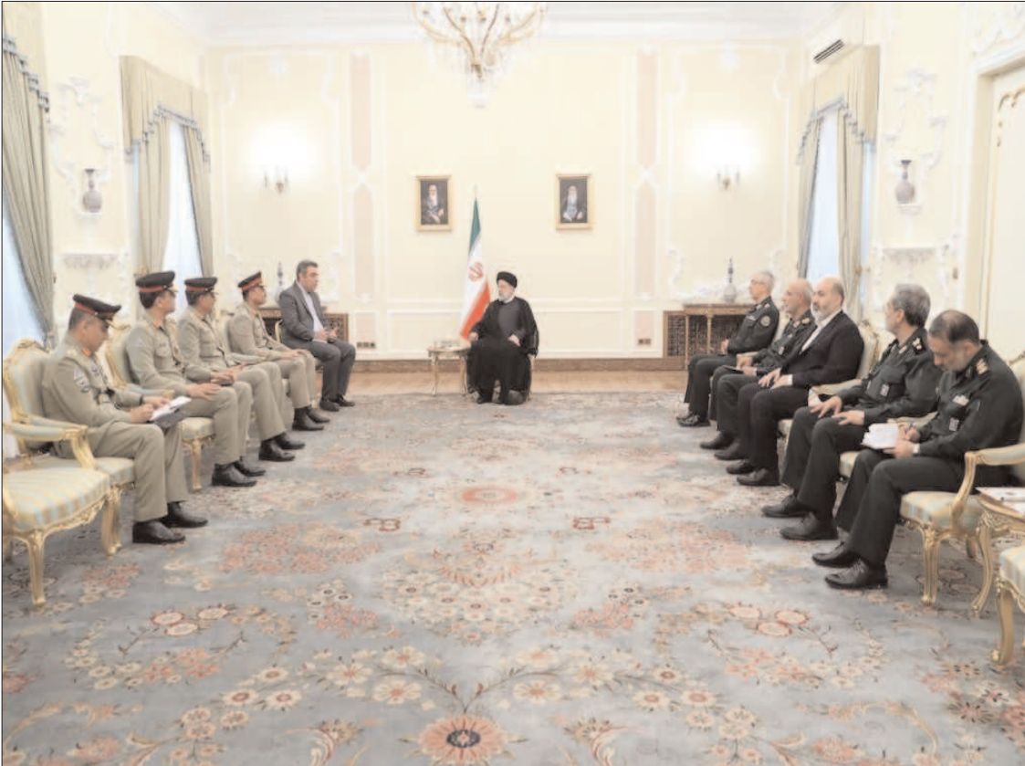
TEHRAN: COAS General Syed Asim Munir called on President of the Islamic Republic of Iran, Ebrahim Raisi and Foreign Minister Hossein Amir Abdollahain.

The party has notified to them that they voted against the decision of the party and found involved in the conspiracy against the PTI during the election in Gilgit-Baltistan. The party asked them to submit an explanation in writing within three days. If the notice is not answered or is unsatisfactory, further action will be taken as per the party policy and rules, the notice warned them. Separately, Barrister Gohar Ali Khan has been appointed Pakistan Tehreek-i-Insaf Chief Election Commissioner.