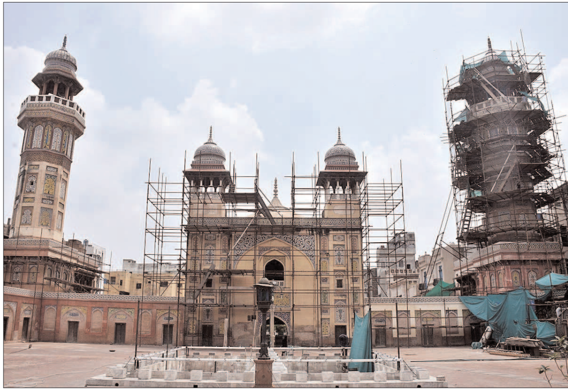
LAHORE: Labourers renovation work at historical Mosque Masjid Wazir Khan at Walled City.