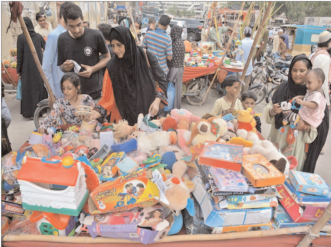
KARACHI: Women and children selecting and purchasing old toys at a roadside stall in Empress Market.