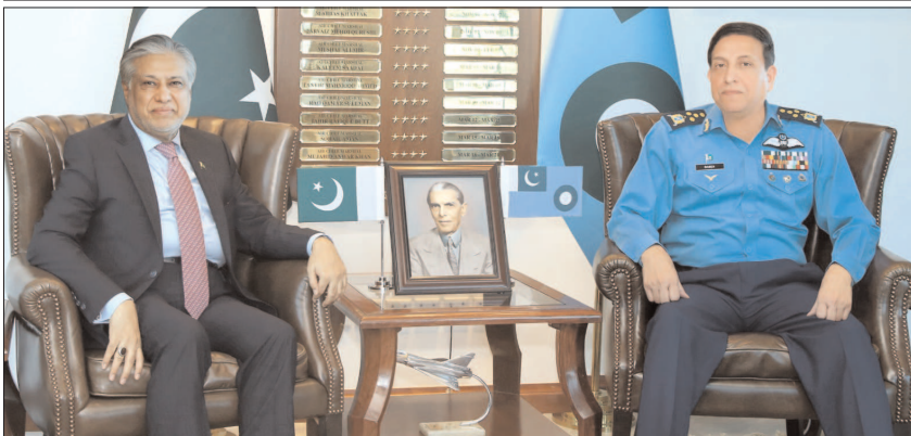
ISLAMABAD: Finance Minister, Ishaq Dar, called on Air Chief Marshal Zaheer Ahmed Baber Sidhu, Chief of the Air Staff, Pakistan Air Force.

Furthermore, the VVIP Protection Unit focuses on providing comprehensive security measures for the President and Prime Minister of the Islamic Republic of Pakistan. Lastly, the High-Security Zone Protection Unit (HSZPU) is entrusted with protecting members of the National Assembly, federal ministers, high-ranking officials, ministries, and civil offices.