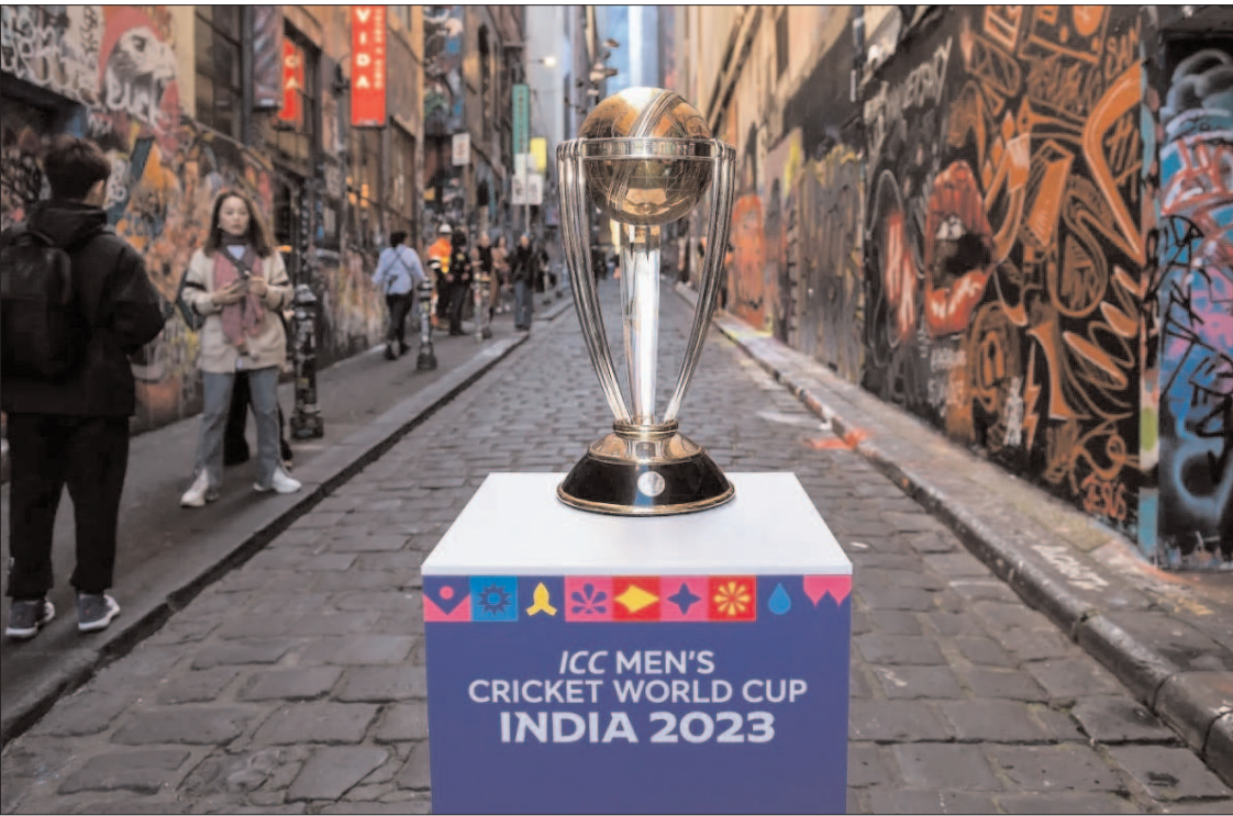
MELBOURNE: The World Cup trophy at Hosier Lane in Melbourne.

The sports taking place during the 2023 World Games include archery, chess, cricket, blind football, partially sighted football, women's football, goalball, judo, powerlifting, showdown, tenpin bowling and tennis. Pakistan's men blind cricket team is also scheduled to feature in the Games.