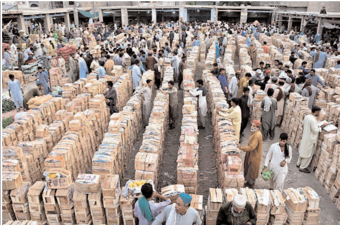
LARKANA: People purchasing mangoes displayed by vendors during at fruit market.

The signing ceremony took place in Lahore that brought together key representatives from Jubilee Life Insurance and Daewoo Express. This event marks a significant milestone in the insurance and transportation sectors, reinforcing both companies' dedication to providing innovative solutions and enhancing customer satisfaction.