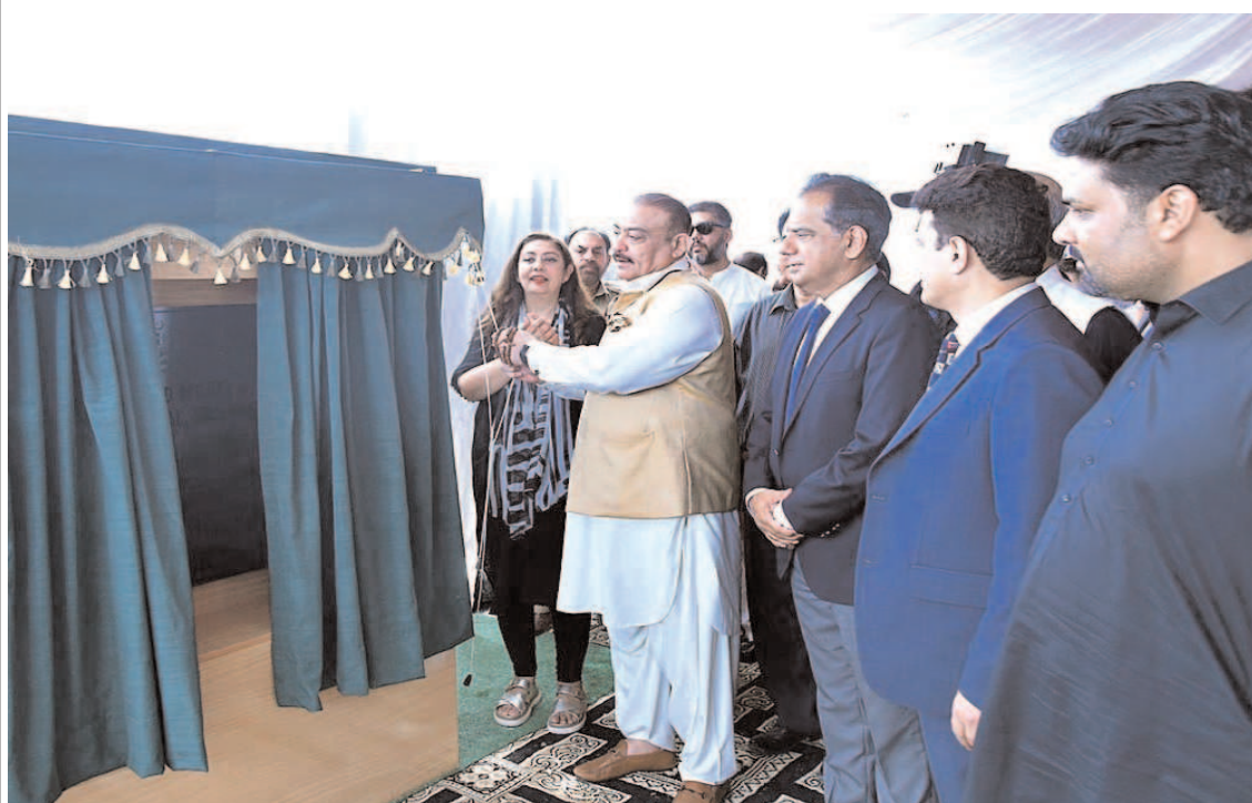
ISLAMABAD: Federal Minister for health Abdul Qadir Patel inaugurating ground breaking ceremony of Cancer Hospital in PIMS.

"Separate cases have been registered against the accused while further investigations are in process," he added.