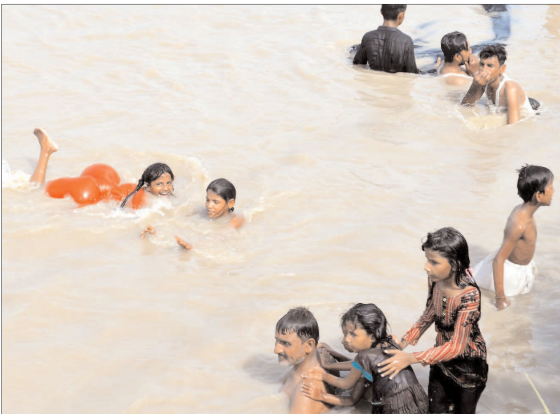
HYDERABAD: Children are bathing into Pinyari Canal to beat the heat of scorching sun during a hot day.

DUKI (PPI): Three persons, including two women, sustained injuries after unidentified armed men opened fire on a vehicle they were travelling near Kach Sadozai area of Luni in district Duki of Balochistan province on Monday.