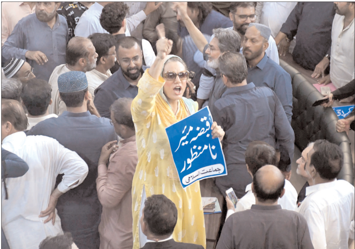
KARACHI: Members of Jamaat-e-Islami and his alliance stage a protest in front of Mayor desk during the meeting of City Council.