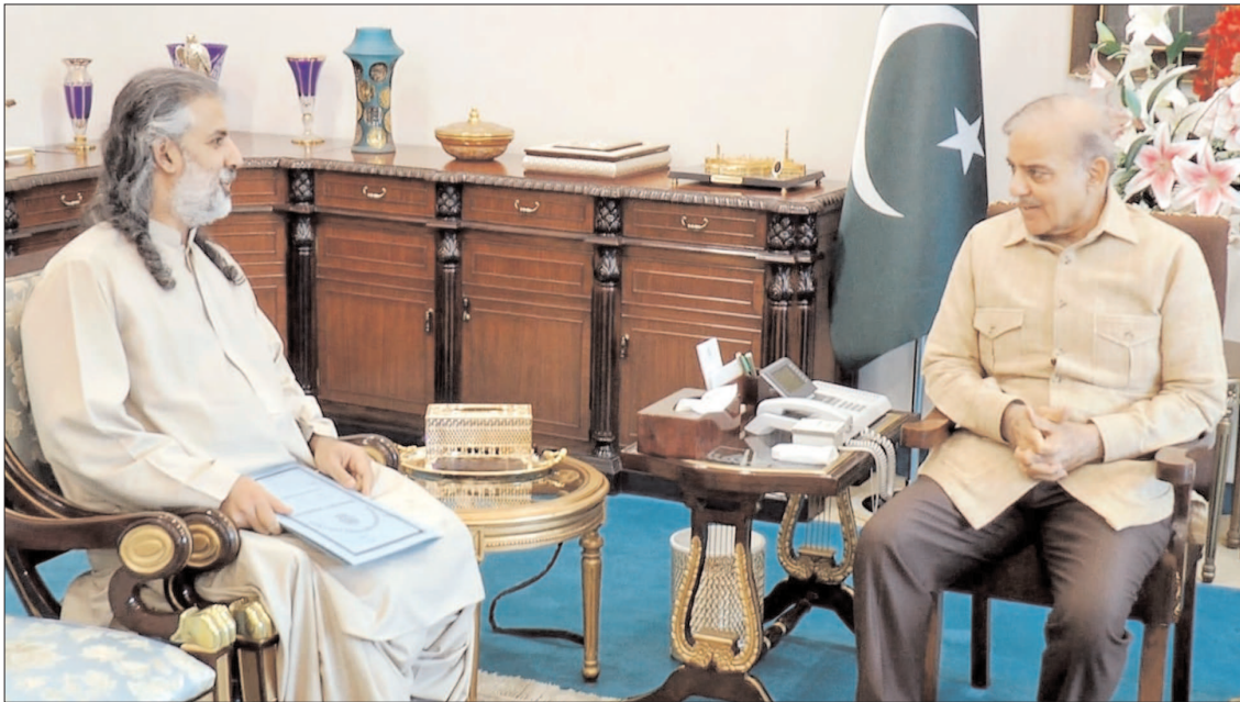
ISLAMABAD: Federal Minister for Narcotics Control, Nawabzada Shahzain Bugti called on Prime Minister Shehbaz Sharif.

Vol. XXXIX No. 179 Regd. No. 241 ZIL HAJJ 29 1444 -- TUESDAY, JULY 18 2023 PESHAWAR EDITION 12 PAGES PRICE. 30