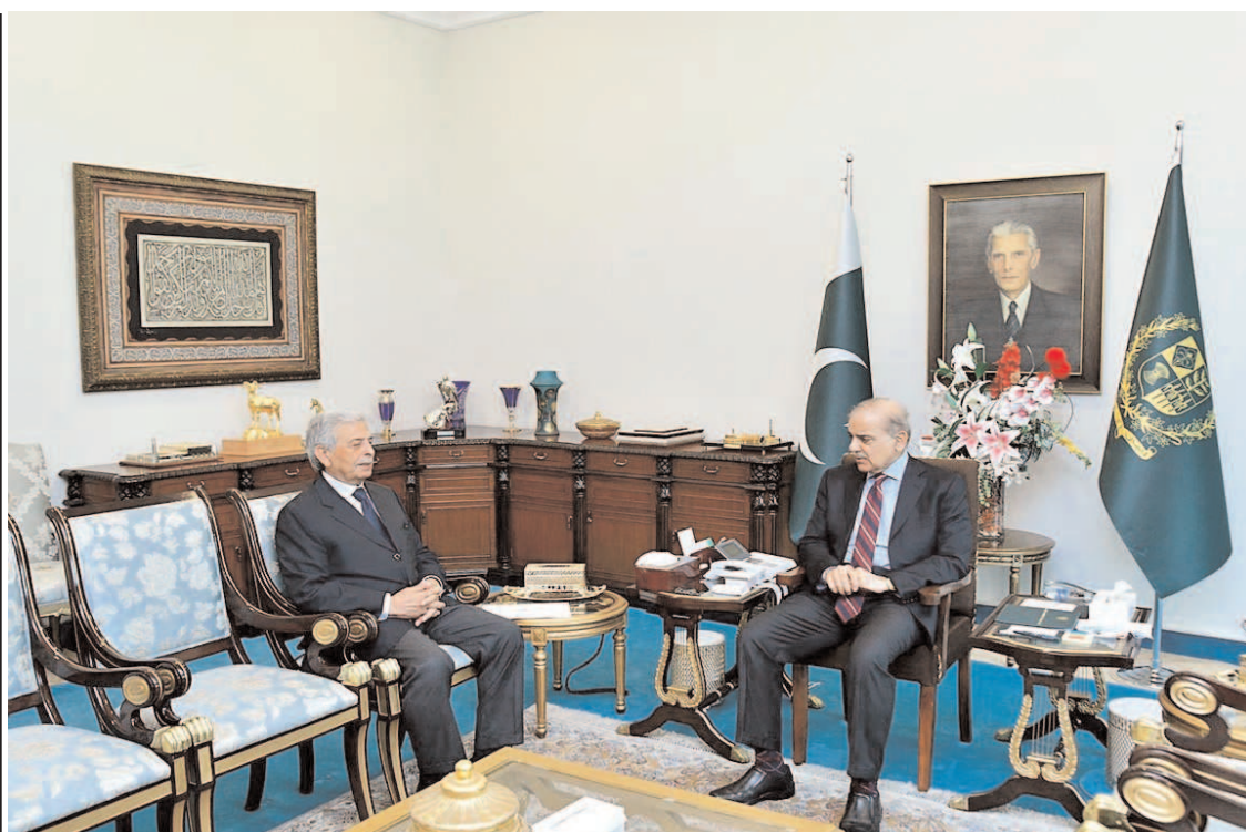
ISLAMABAD: Minister for Federal Education and Professional and Technical Training Rana Tanvir Hussain calls on Prime Minister Muhammad Shehbaz Sharif.

The future of the jobs was not in labour but rather in operating machines based on advanced techs, he said, adding, "Bangladesh and Thailand banks have dedicated finance for women alone to promote female entrepreneurship that Pakistan also need to replicate."