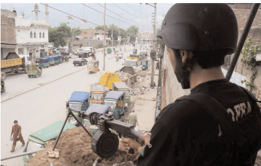
PESHAWAR: A policeman stands guard at Imambargah.

This project is striving to establish multiple tourism infrastructures in seven merged districts and six merged sub-divisions. A comprehensive survey has already been conducted to identify major tourism development initiatives in these areas.