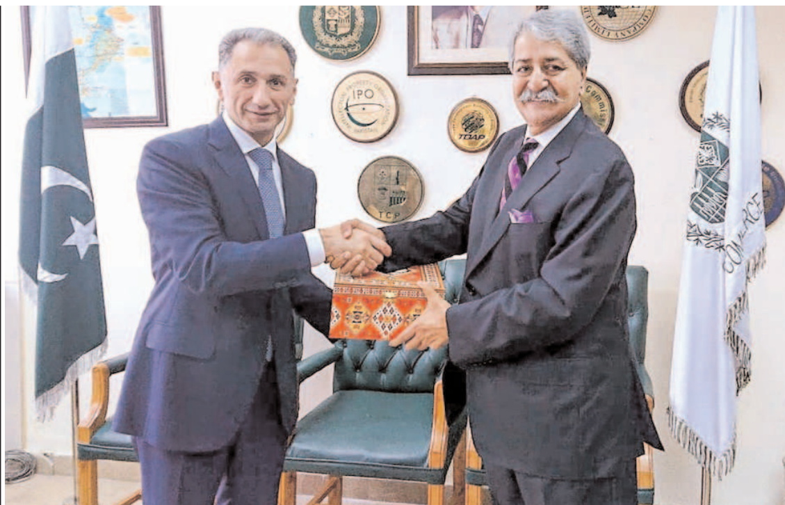
ISLAMABAD: Federal Minister for Commerce Syed Naveed Qamar and Azerbaijan Minister of Digital Development & Transport Rashid Nabiye exchanging souvenir.

Both sides expressed their commitment to enhancing bilateral trade ties between the "brother countries" and strengthening economic cooperation.