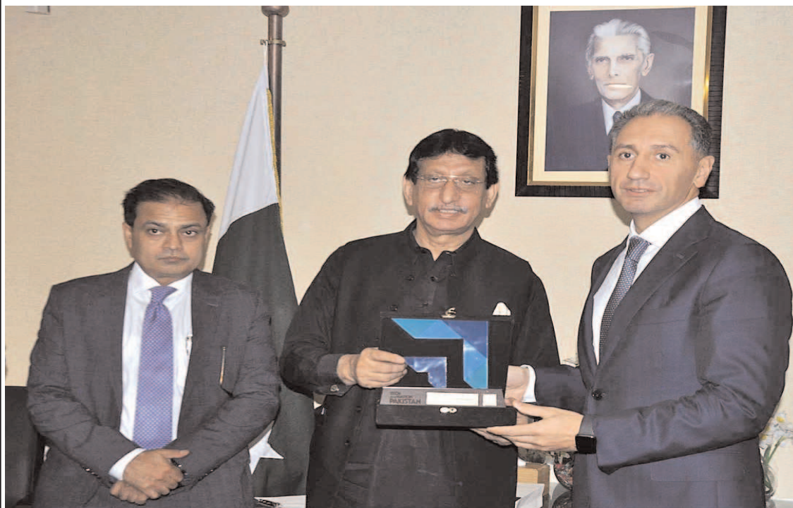
ISLAMABAD: Federal Minister for IT and Telecommunication Syed Amin Ul Haque presenting shield to Azerbaijan Minister for Digital Development & Transport Mr. Rashad Nabiyeu at IT Ministry.

CPO/DIG Bukhari emphasized the importance of cooperation between organizers and law enforcement to ensure a peaceful and secure Muharram observance. By integrating the comprehensive security measures, he said the Islamabad police seek to foster an atmosphere of tranquility and reverence during this significant religious occasion.