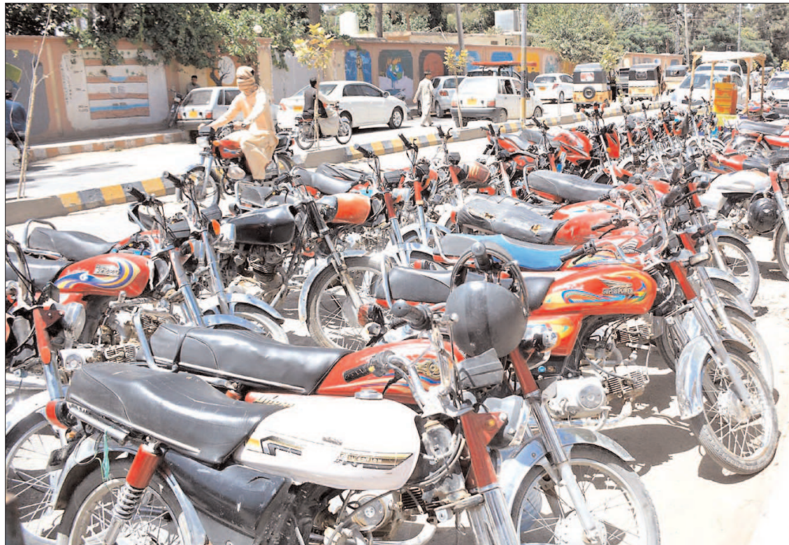
QUETTA: A view of illegal motorbikes parked outside DC office creating problems for traffic.