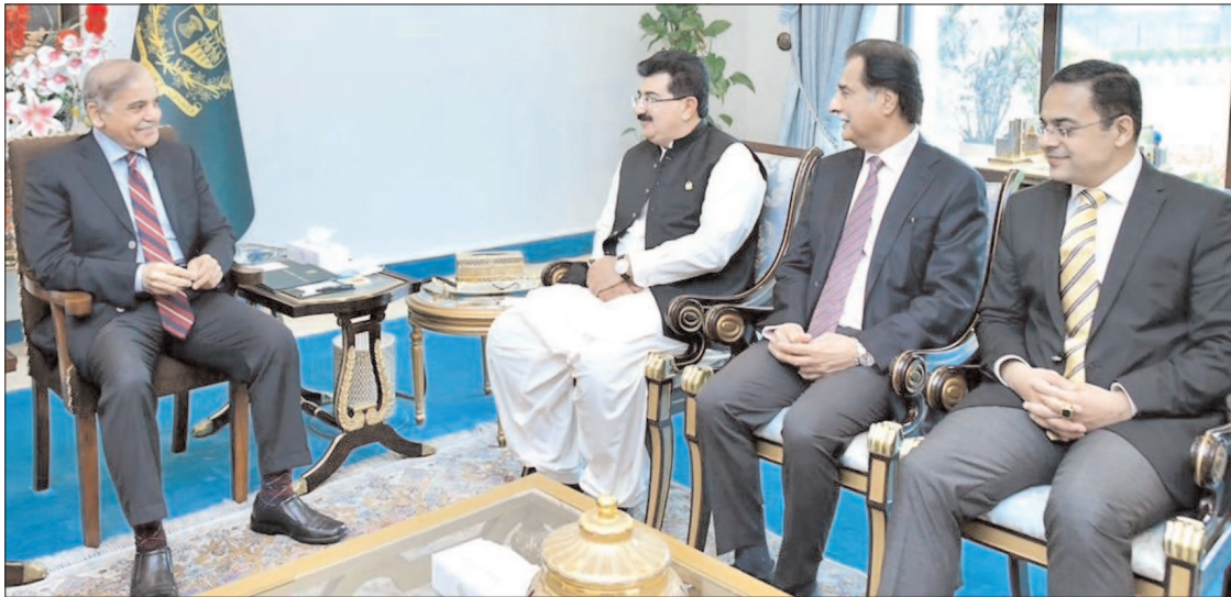
ISLAMABAD: Chairman Senate Sadiq Sanjrani called on Prime Minister Shehbaz Sharif.

During the meeting, the country's political situation was thoroughly discussed. The party constitutional amendments were also finalised in the meeting. The nominees for the federal and provincial caretaker setups were also discussed at the huddle.