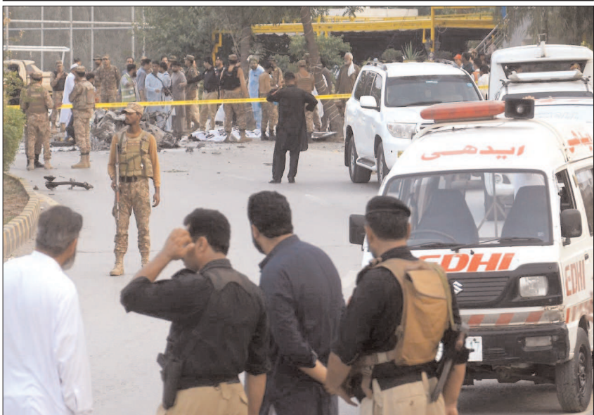
PESHAWAR: Security officials and rescue workers inspecting the site of blast in Hayatabad.