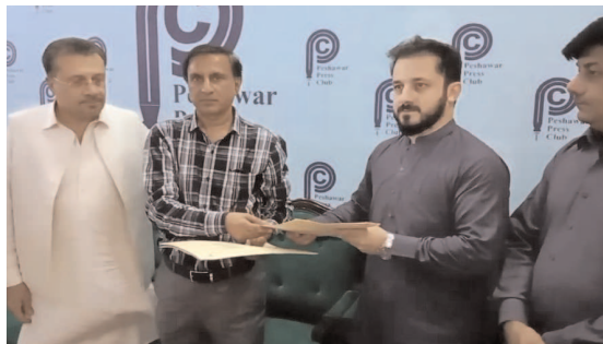
The journalist community appreciated efforts of education committee and hopeful for better future of their child to compete with demands of global village.