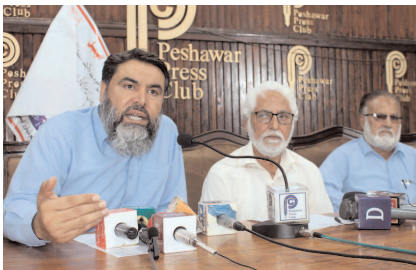
PESHAWAR: Representatives of Khyber Pakhtunkhwa Petroleum Dealers Association addressing a press conference.

All Pakistan Customs Agents Association leader made a request to the concerned department to allow clearance of transit trade goods, especially down transit through One Custom System until the WeBOC is fully completed and made operation in the whole country.