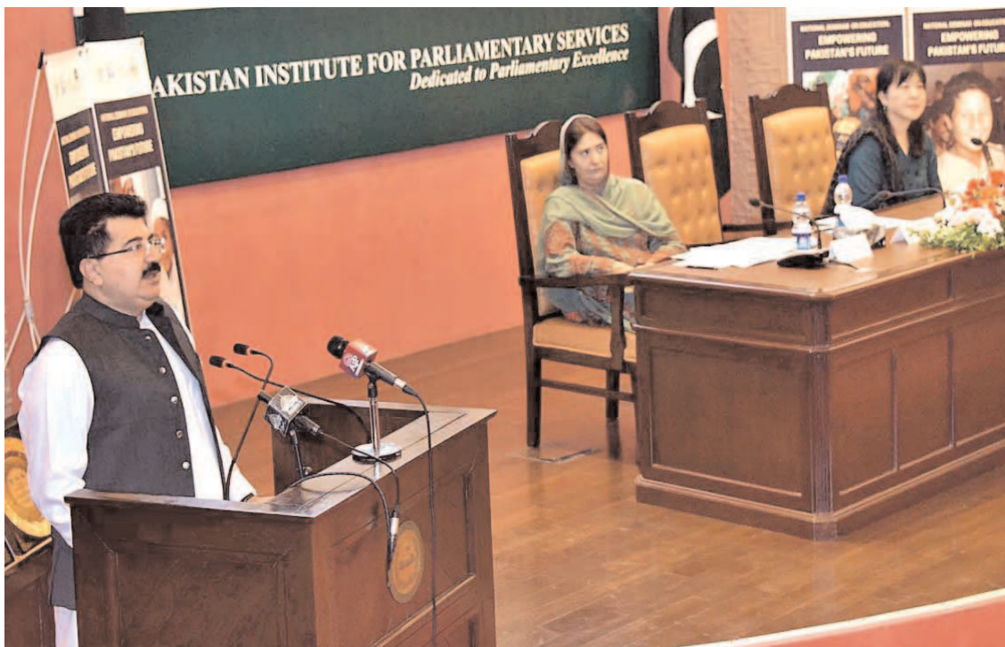
ISLAMABAD: Chairman Senate, Muhammad Sadiq Sanjrani addressing the national seminar on education jointly organized by Education Parliamentarians' Caucus (EPC) Senate of Pakistan and Japan International Cooperation Agency (JICA) at Pakistan Institute for Parliamentary Services (PIPS).

ISLAMABAD (APP): Islamabad police conducted an operation within the jurisdiction of the Phulgran police station and arrested 13 accused including five drug peddlers and recovered a huge quantity of drugs and weapons with ammunition from their possession. Following the special directives of Islamabad Capital City Police Officer (ICCP) Dr. Akbar Nasir Khan, the crackdown on drug peddlers and liquor sellers aims to create a drug-free environment in the city and to safeguard the future of the young generation. During the operation, numerous suspicious vehicles and individuals were thoroughly inspected, leading to the identification of several key individuals involved in drug supply. During the search operation, police teams arrested 13 accused including five drug peddlers, and recovered a huge quantity of drugs and weapons with ammunition from their possession.