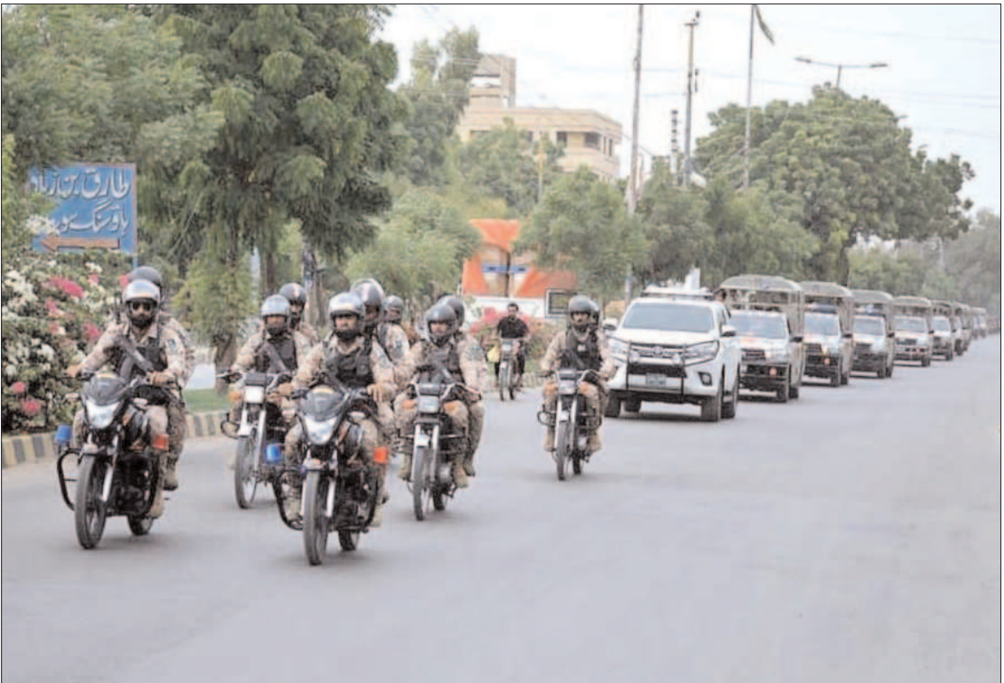
KARACHI: Security personnel conducting flag march regarding maintain law and order during Muharram.