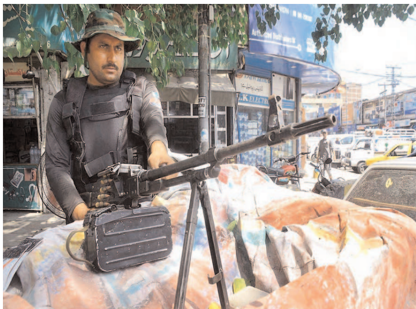
PESHAWAR: Security beefed up at Khyber Bazar Chowk in connection with Muharram.