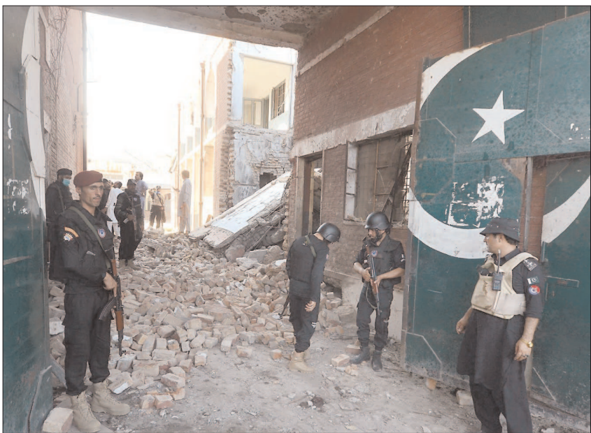
BARA: Police officials inspecting the Tehsil office compound after attack.