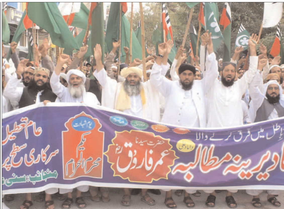
QUETTA: Activists of Sunni Ulema Council holding a rally on the martyrdom anniversary of Hazrat Umer Farooq (RA).