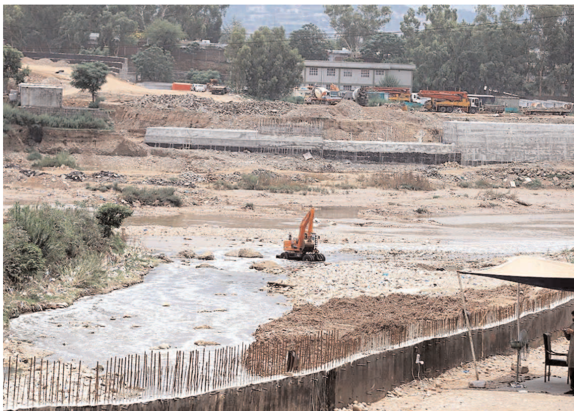
RAWALPINDI: Heavy machinery being used at the site of a collapsed bridge near Lahore High Court (Rawalpindi Bench) at Swan in the outskirts of the city.