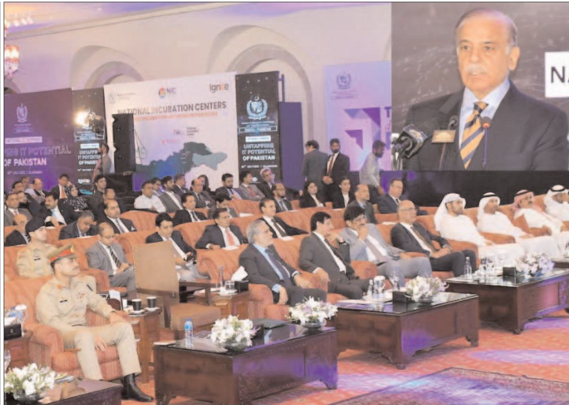
ISLAMABAD: Prime Minister Shehbaz Sharif addressing during National IT seminar. Chief of Army Staff, General Syed Asim Munir also present.

Talking to the media persons on this occasion, the Chief Minister said that our security forces have rendered matchless sacrifices for establishing and maintaining law and order in the region. The provincial government and all relevant departments and agencies are taking all possible steps in order to stop those inhumane activities.