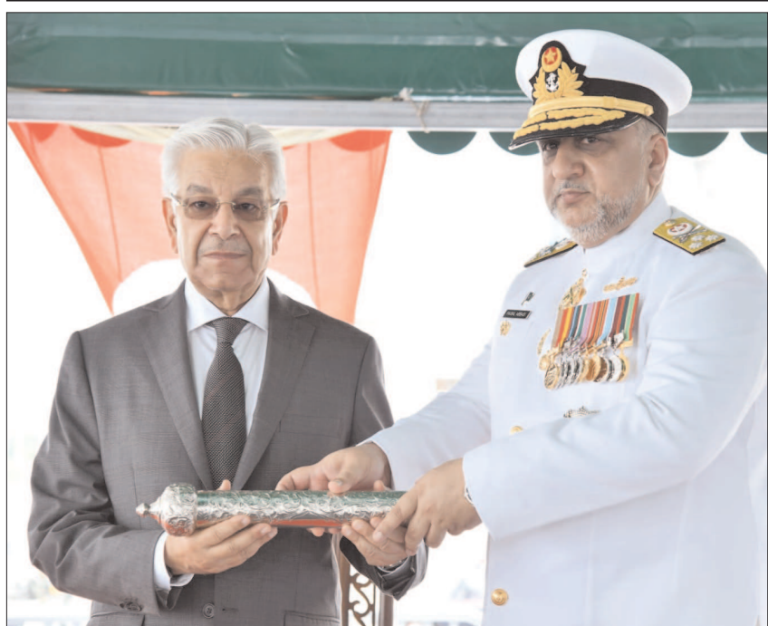
KARACHI: Federal Minister for Defence Khawaja Asif handing over Ship's Scroll to Commander Pakistan Fleet during induction ceremony of PNS Shah Jahan and PNS Tippu Sultan.