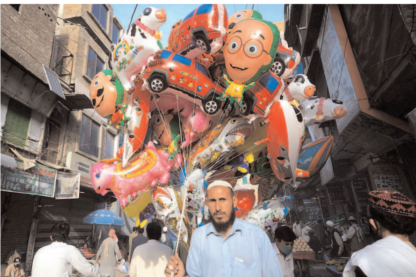
PESHAWAR: A man selling balloons outside in Ganta Gar.