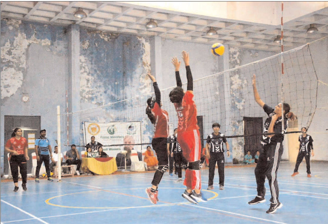
FAISALABAD: Volleyball match played between Lahore and Faisalabad women teams, 34th Provincial Volleyball League matches under PM Youth Talent Hunt Programme organized by Government College Women University Faisalabad(GCWUF)at Crescent Sports Complex.