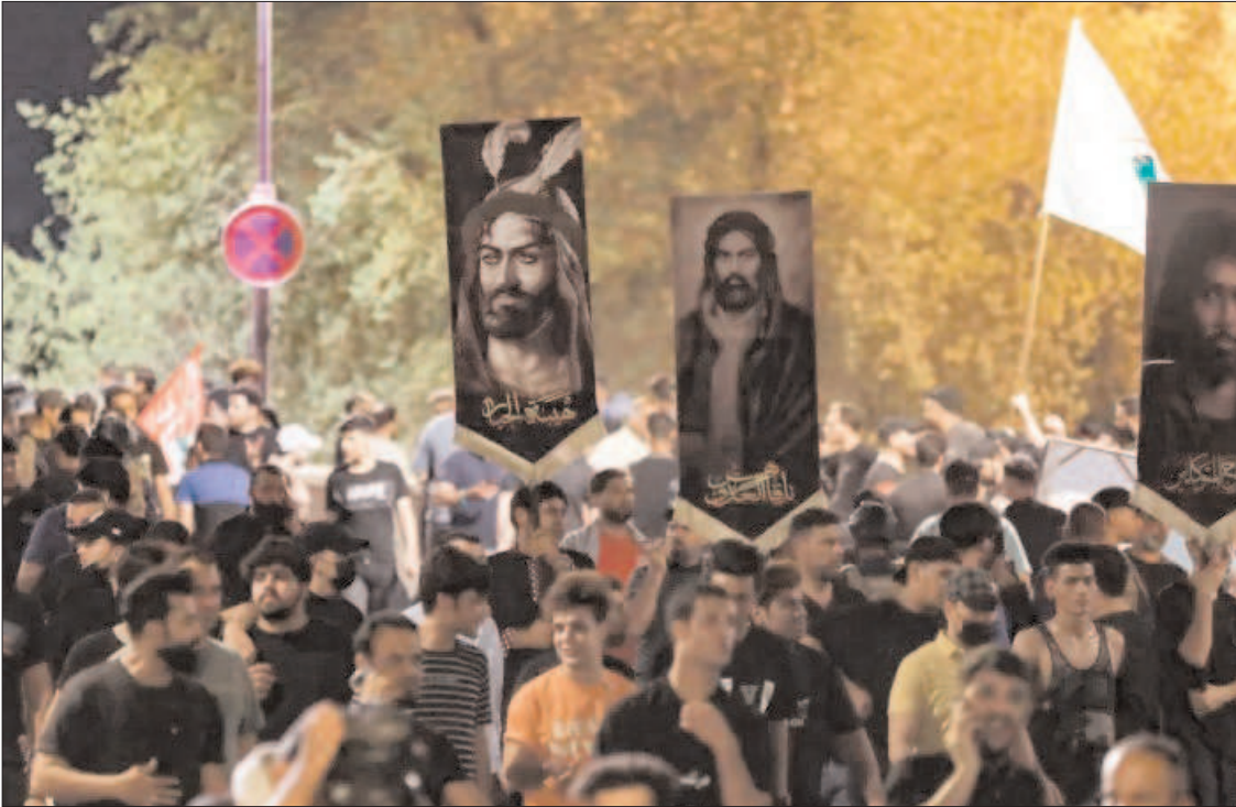
BAGHDAD: Iraqi people holding a protest against desecration of Holy Quran in Sweden.