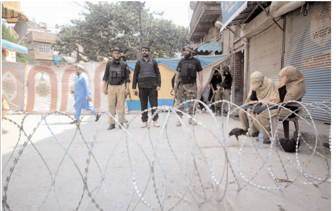
PESHAWAR: Police personnel standing alert on way of procession.

PESHAWAR (APP): A drug addicted woman gives birth to a baby wherein the officials of KP Department of Social Welfare and Peshawar district administration reached the spot to help the intoxicated woman and the new-born child on Hayatabad Industrial Estate Road. The officials, who reached the spot, said that they are monitoring the case and the relevant staff have been instructed to take good care of the baby and the woman in the medical facility center and ensure treatment.