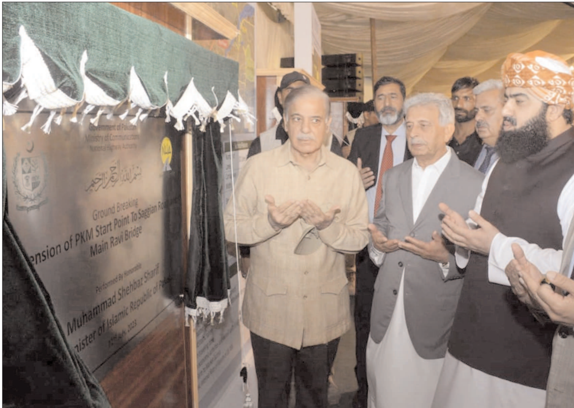
SHARQPUR: Prime Minister Shehbaz Sharif unveiling a plaque during the groundbreaking of extension of PKM start point to Saggian Road and Main Ravi Bridge.

He regretted that trust of the friendly nations was damaged during the previous government's rule. Maulana Asad said that they assured the nation to put an end to the 'engineered governments and elections' forever. Minister for Federal Education and Training Rana Tanveer Hussain, on the occasion, said that 90 percent public projects were completed by the PML-N governments. The just inaugurated projects were dreams of the area which had now turned into reality and would change fate of the people, he added. He observed that it was due to the leadership of the prime minister that steered Pakistan out of the difficulties and put it on the path of progress and prosperity which was carved out by the previous PML-N governments.