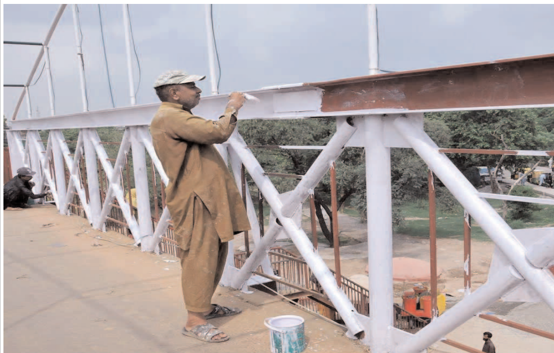
ISLAMABAD: The painter paints the metal railings of the pedestrian bridge with white paint at Islamabad Expressway.

He said most people living with diabetes do not know of their health status and they only come to know about it when their eyes, kidneys, heart, or brain had suffered irreparable damage. The silent killer diabetes was consuming thousands of lives in Pakistan annually but unfortunately, the majority of people were unaware of the causes of the disease considering it a minor issue, he regretted. Lack of awareness regarding health issues was no less than a crime, as diseases like diabetes were causing irreversible damage to the people silently, he mentioned. He advised the public to change their dietary and recreational habits and get themselves tested for diabetes as soon as possible.