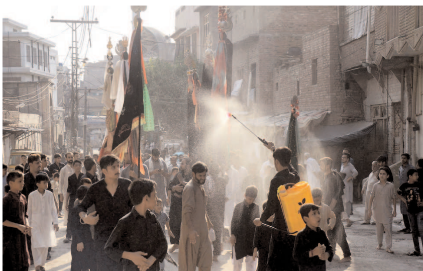
PESHAWAR: Mannat Alam procession passing through its traditional route at Imam Bargah Ali Kiyani.