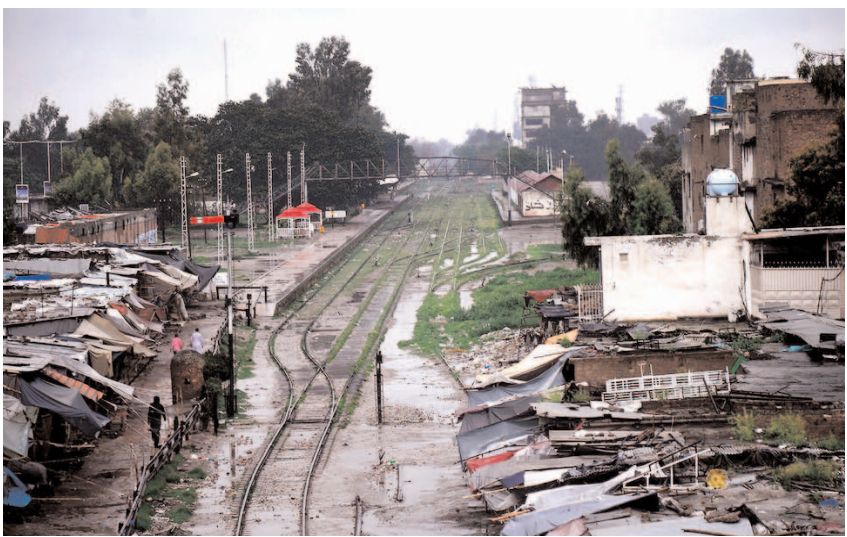
PESHAWAR: A beautiful view of Faqirabad railway track after a rain experience in City.