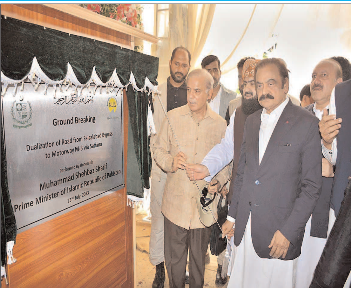
FAISALABAD: Prime Minister Muhammad Shehbaz Sharif is unveiling the plaque during groundbreaking ceremony for dualization of a road from Faisalabad Bypass to Motorway (M-3) via Satiana.