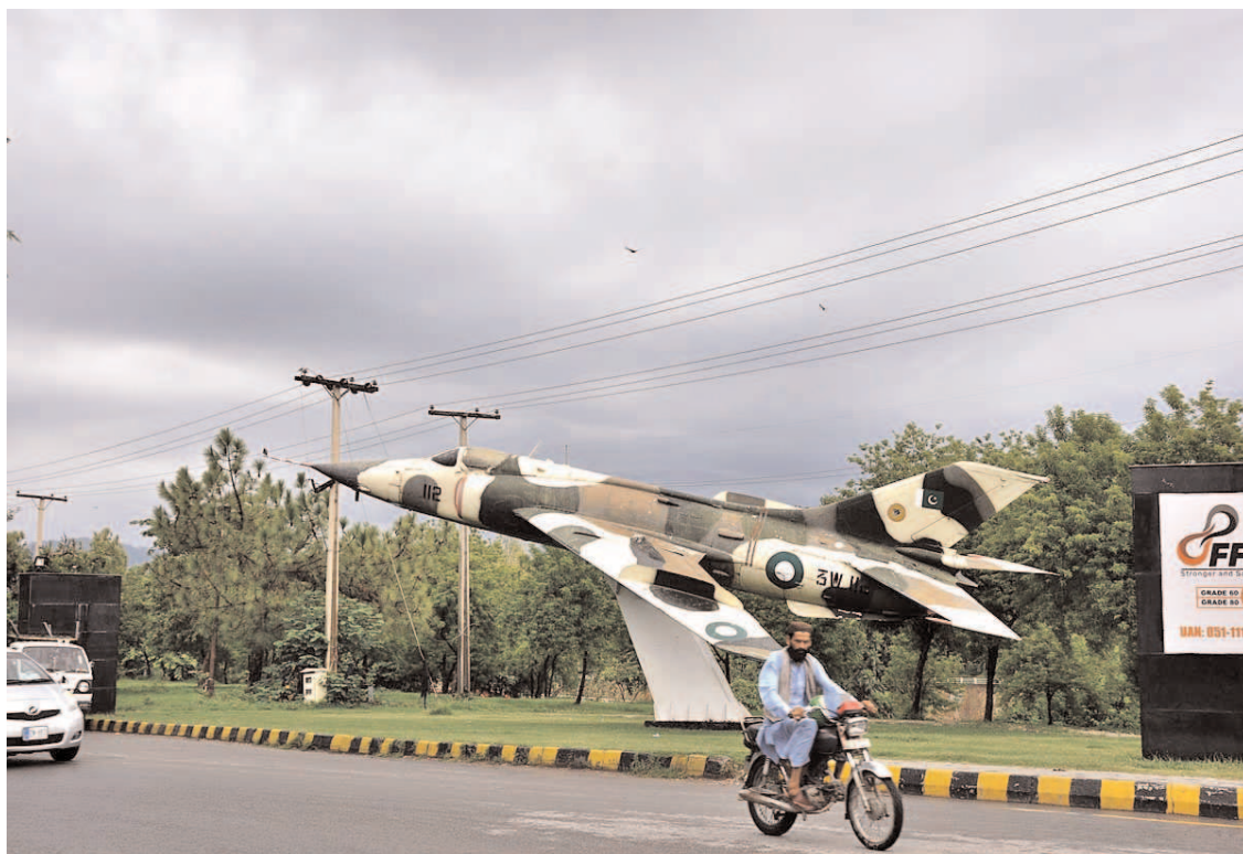
ISLAMABAD: An attractive view of thick clouds hovering over the skies of the Federal Capital.