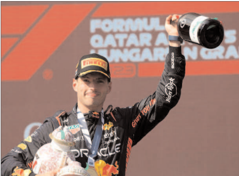
BUDAPEST: Race winner Max Verstappen of the Netherlands and Oracle Red Bull Racing celebrates on the podium during the F1 Grand Prix of Hungary.

McLaren stopped Norris first and gave him the chance to use his fresh tyres to 'undercut' ahead of the Australian. Norris was unable to challenge Verstappen, who was in another league, as he has been for most of the season. But he had the measure of Piastri and Hamilton and was left in the closing laps to fend off a charge from the second Red Bull of Perez. The Mexican recovered from his disappointing ninth place on the grid using an off-set strategy - starting on the hard tyre rather than the medium used by all the cars ahead of him - and progressively picked off the cars ahead of him. Perez edged closer and closer to Norris in the final 10 laps but after getting to about three seconds behind, the McLaren began to pull away again in the closing laps. Perez began to slip back towards Hamilton, but the Mercedes was still 1.5secs behind at the flag.