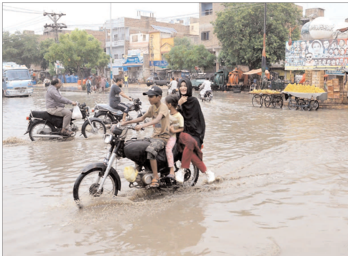
HYDERABAD: Vehicles passing through accumulated rainwater in Latifabad area after heavy rain.

(PECA). The women harassment cases have risen on social media and other places due to no solid steps taken yet. There is need to take stern actions against such crimes so that people could take a sigh of relief.