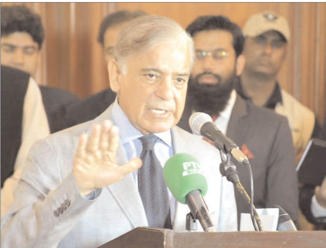
LAHORE: Prime Minister Shehbaz Sharif addressing the signing ceremony of the agreement between Pakistan LNG Ltd and SOCAR of Azerbaijan.

The prime minister said as far as the SEZs by the public sector were concerned, the government would provide land free of charge to the investors, as it had done for the Bahawalpur Solar Park. However, he said the use of SEZs' land for non-industrial use would not be tolerated and recalled similar "misconduct" by some parties in Faisalabad and other SEZs where people had been minting money by selling out the land.