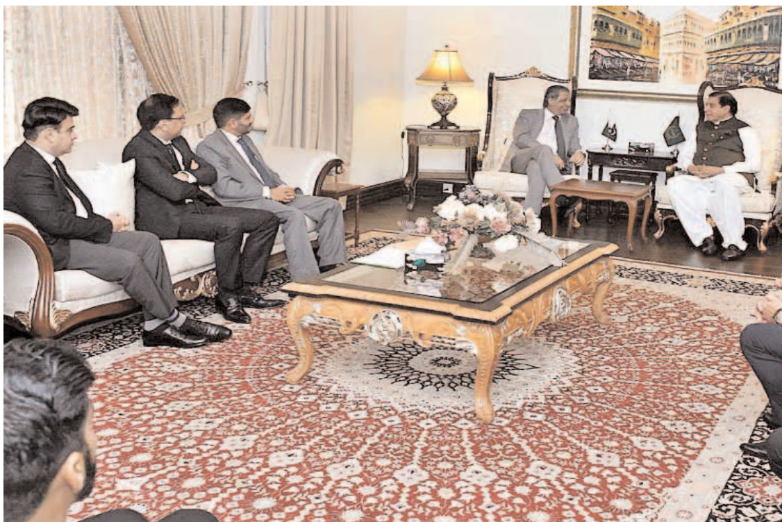
ISLAMABAD: Speaker National Assembly Raja Pervez Ashraf in a meeting with Federal Minister for Law & Justice Senator Azam Nazir Tarar.

ISLAMABAD (APP): Islamabad Electric Supply Company (IESCO) has issued a power suspension programme for Tuesday in various areas of its region due to necessary maintenance and routine development work. According to IESCO Spokesman, the power supply of different feeders and grid stations would remain suspended for the period from 08:00 AM to 1:00 PM Islamabad Circle, Anguri, NCP, Mangyal, Shahdara, Shahpur, Khayaban Iqbal, Peer Suhawah, Quaid-e-Azam University, Bri Imam, Mandala, Athal, NIH Feeders, From 07:00 AM to 12:00 Noon, Islamabad Circle, New Waheedabad, Tramri Feeders, Rawalpindi Cantt Circle, Rahmatabad-I, Kahota City-II, Hanif Shaheed, Old Rawat, New Rawat, CWO, AOWHS, Sparco, Defense Road, Askari-14 Sector-D, Humayun-1, Kalyal, Adwala Feeders, Chakwal Circle, Malhal Mughlan, Sarkal Feeders, Jhelum Circle, Mankayala Feeder, Attock Circle, Pind Pran.