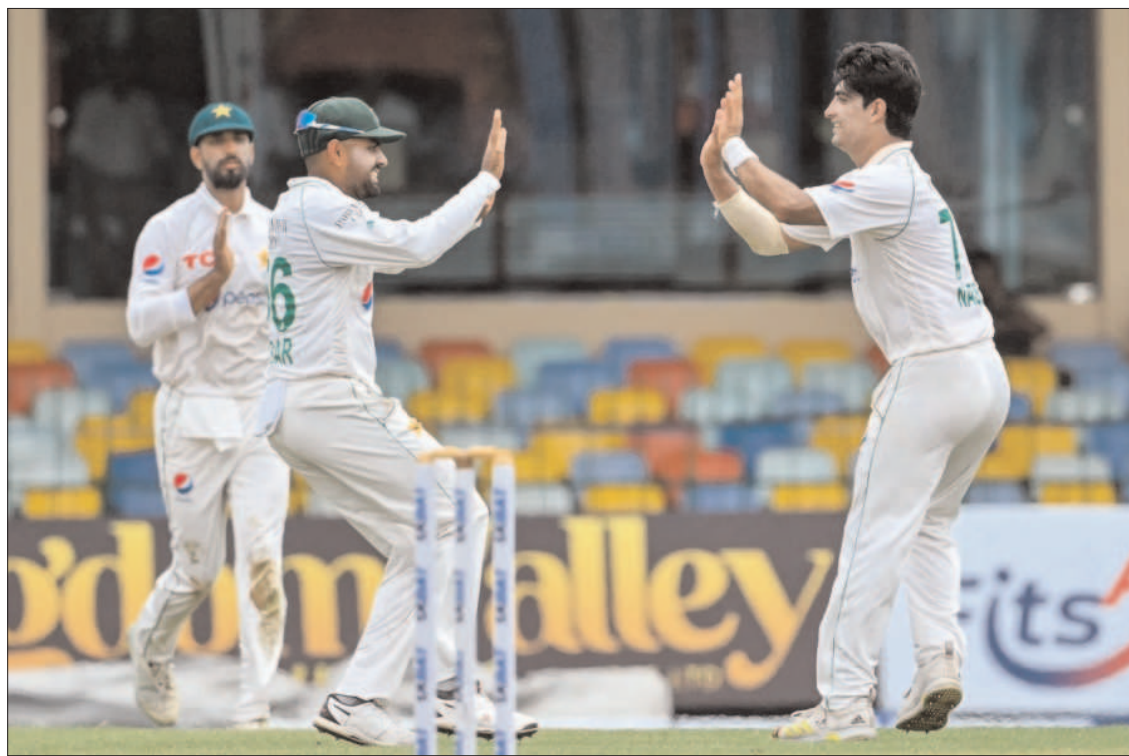
COLOMBO: Babar Azam and Naseem Shah celebrate the fall of Angelo Mathews.

He said that after Khyber Pakhtunkhwa and Sindh, trials will also be held in other provinces and cities, after the trials across Pakistan, six teams will be formed and the final event will be held in Peshawar, and the best young cricketers will be fully supported to advance in PSL and Pakistan Cricket.