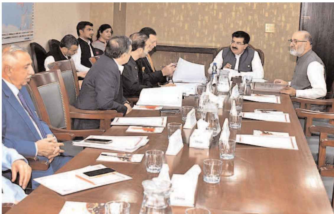
ISLAMABAD: Chairman Senate, Muhammad Sadiq Sanjrani presiding over a Senate House business advisory committee meeting at Parliament House.