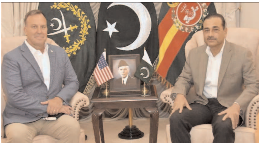
RAWALPINDI: Commander US Central Command (CENTCOM) General Michael Erik Kurilla called on Chief of the Army Staff General Asim Munir.