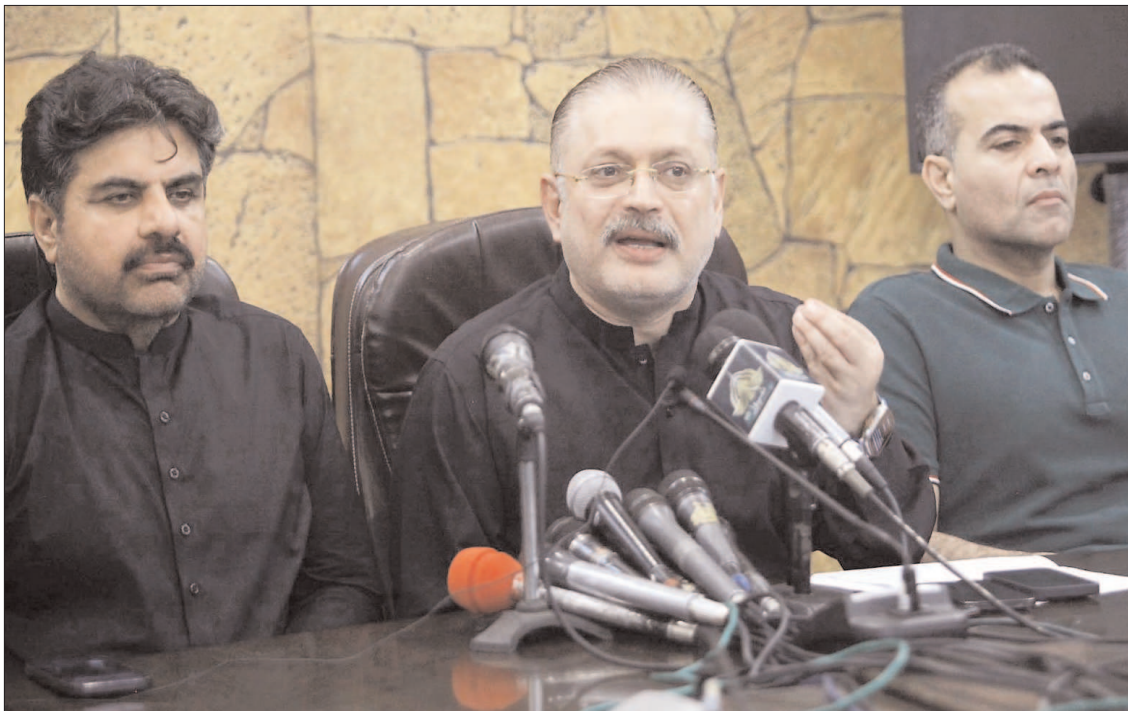
KARACHI: Sindh Information and Transport Minister Sharjeel Inam Memon addressing a press conference.