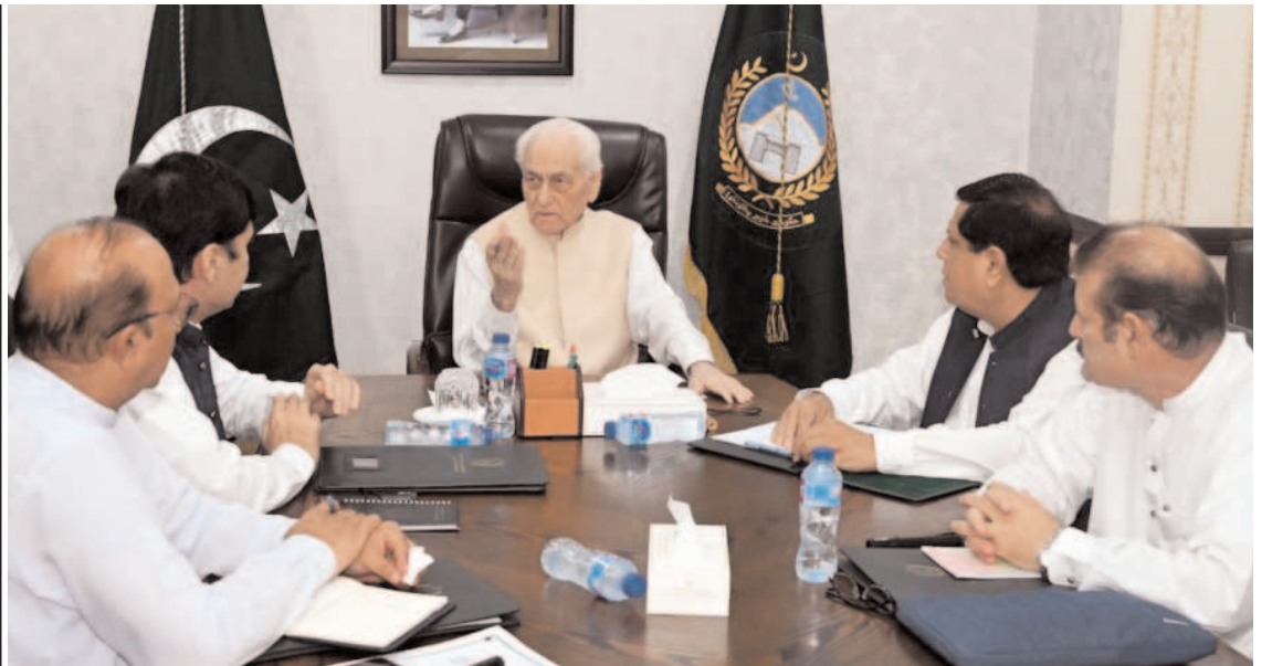
PESHAWAR: Caretaker Chief Minister Khyber Pakhtunkhwa Muhammad Azam Khan presiding over a meeting regarding Sehat Card Plus Scheme.

PHC's divisional bench comprising of Justice Shakeel Ahmad and Justice Shahid Khan dispose-off writ petition after submission of cases record registered against Shakeel Ahmad while stopped harassment of PTI's activist and ordered for provision of record of new cases in future.