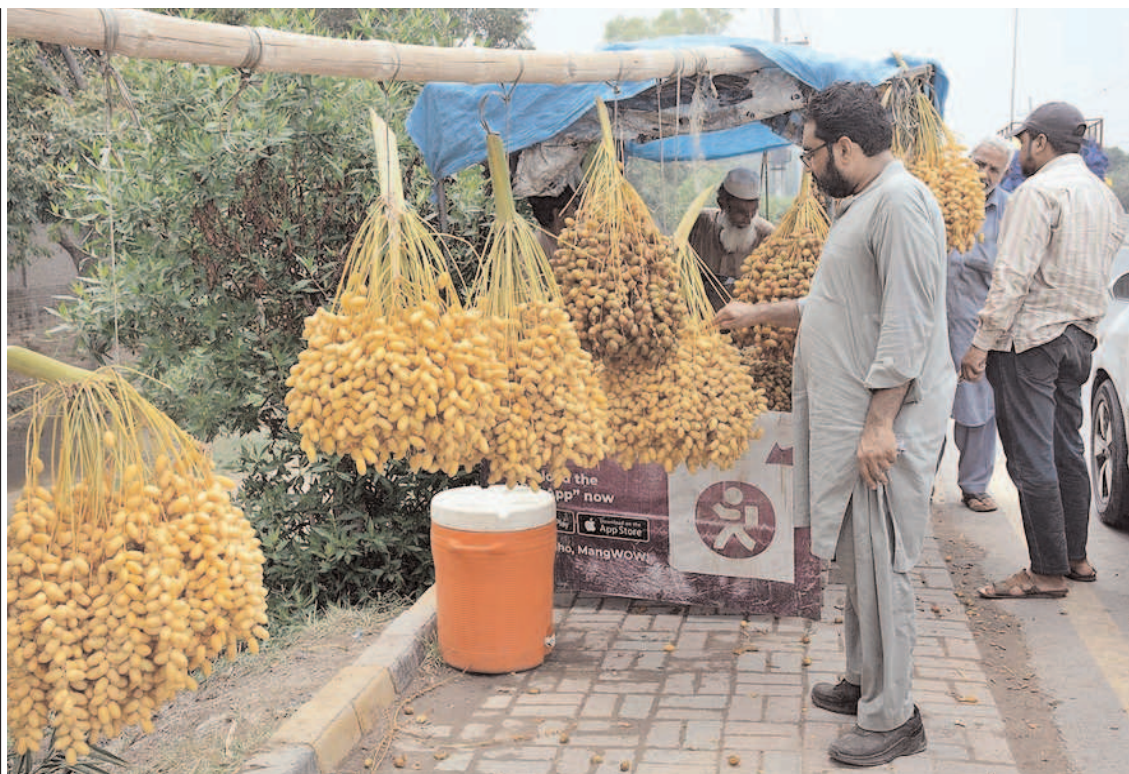
FAISALABAD: People purchasing fresh dates from a roadside setup.

We feel this is a great opportunity for Pakistani startups to explore vast possibilities of the web3 world. We look forward to hosting you at the event and creating a greater impact together.