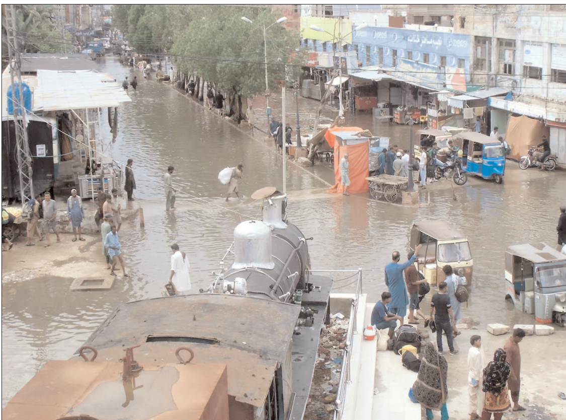
HYDERABAD: A view of the flooded roads and streets after rain.