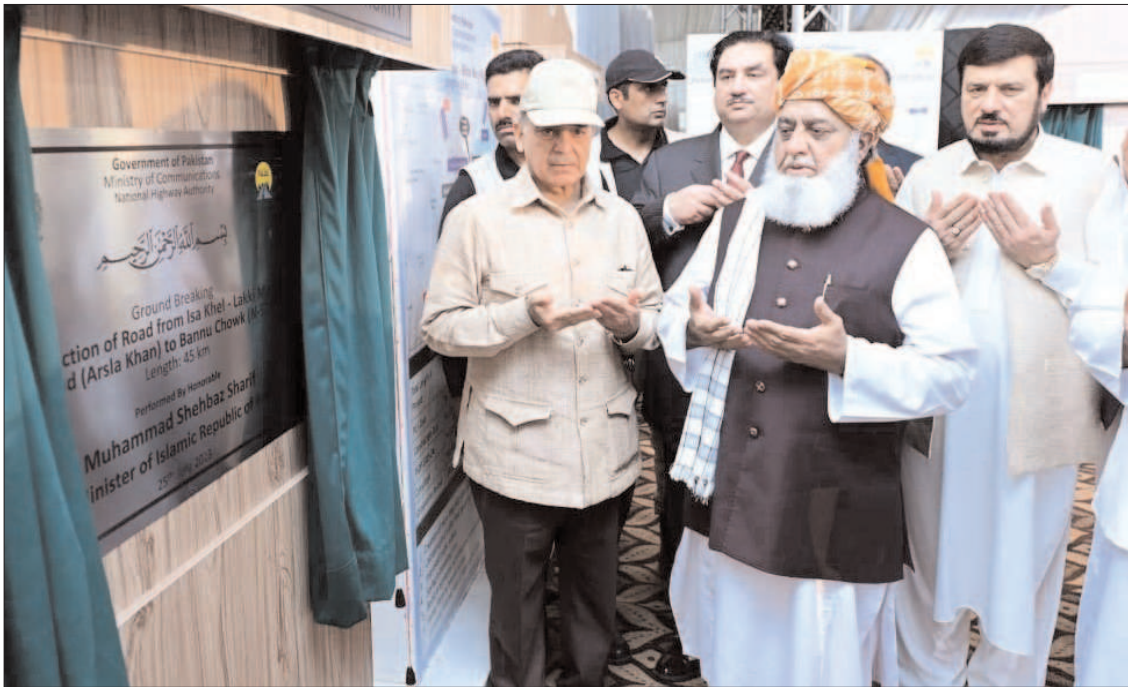
D I KHAN: Prime Minister Shehbaz Sharif inaugurating and laying foundation stone of various infrastructure development projects.