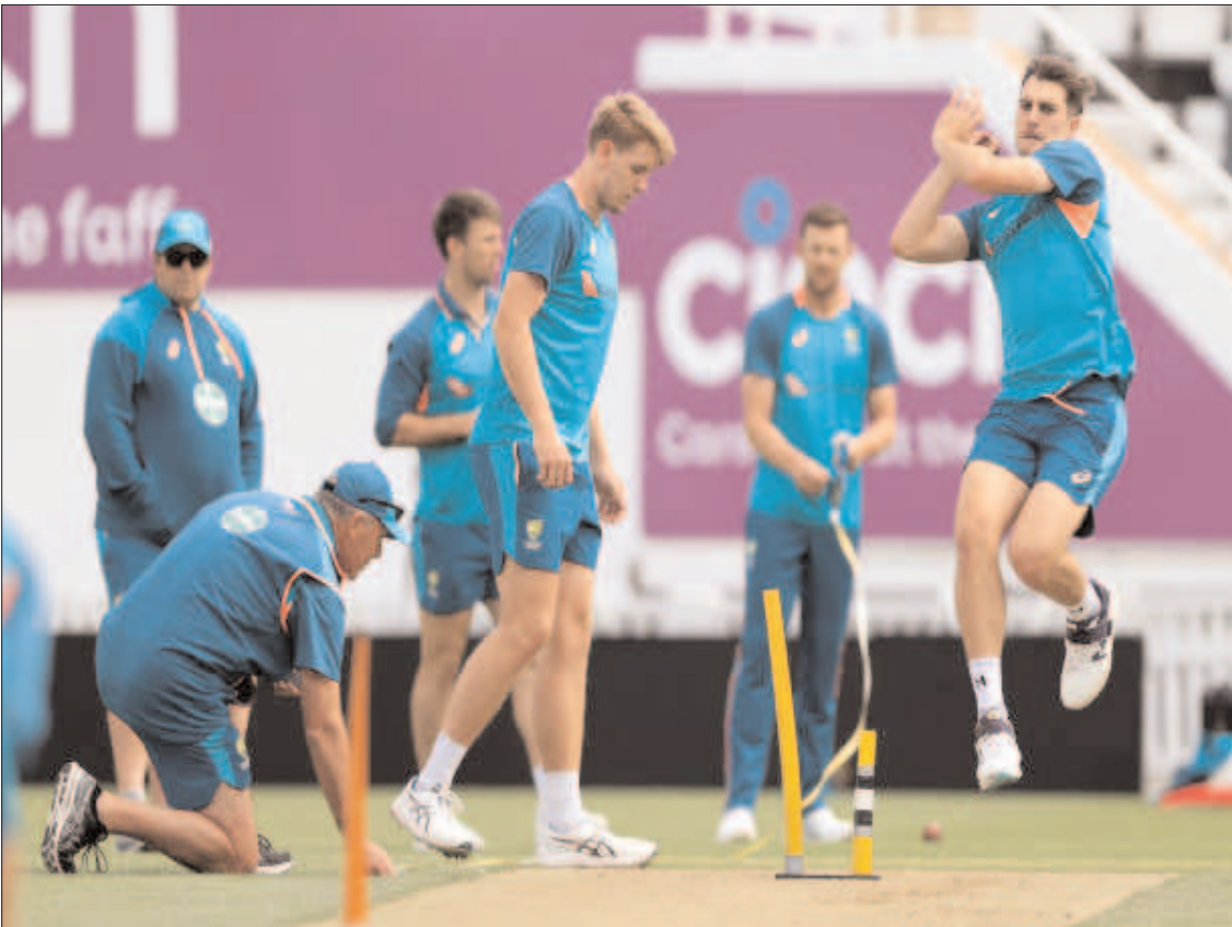
LONDON: Pat Cummins of Australia bowls during the Australia Nets Session at The Kia Oval.