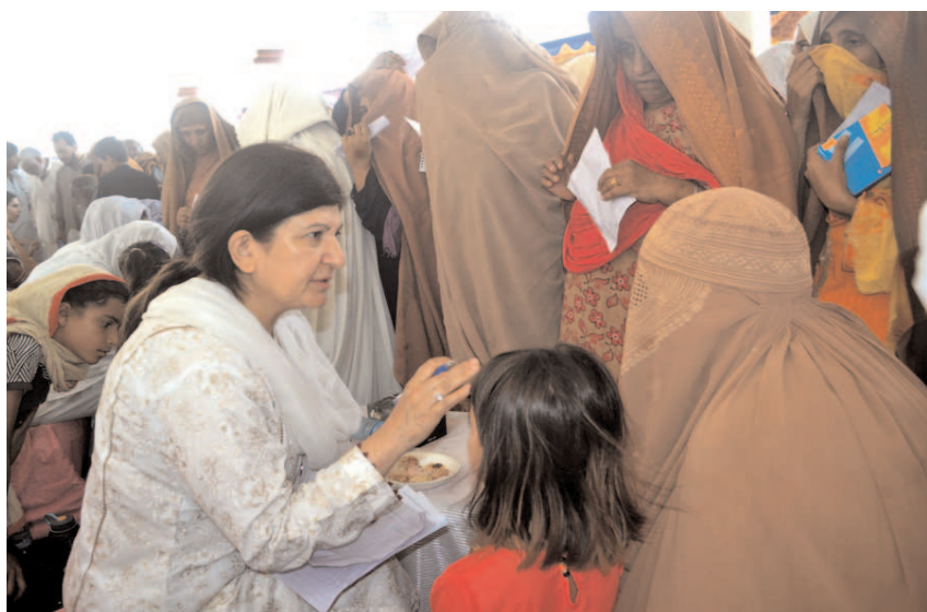
PESHAWAR: Female doctor examining a patient during free medical camp organized by PDF at Haryana Bala area.

The Rescue 1122 diving service is equipped with all the latest equipment including rubber boats, fiber boats and jalar (local boats) boats for hilly areas.