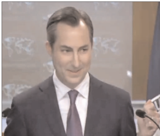
The Frontier Post also asked that Former Prime Minister of Pakistan, former Foreign Minister of Pakistan have acknowledge the reality of Cypher and after Pakistan's National Security Committee meeting, US officials was given demarche in Pakistan and the US, so somebody in the US whether the President,