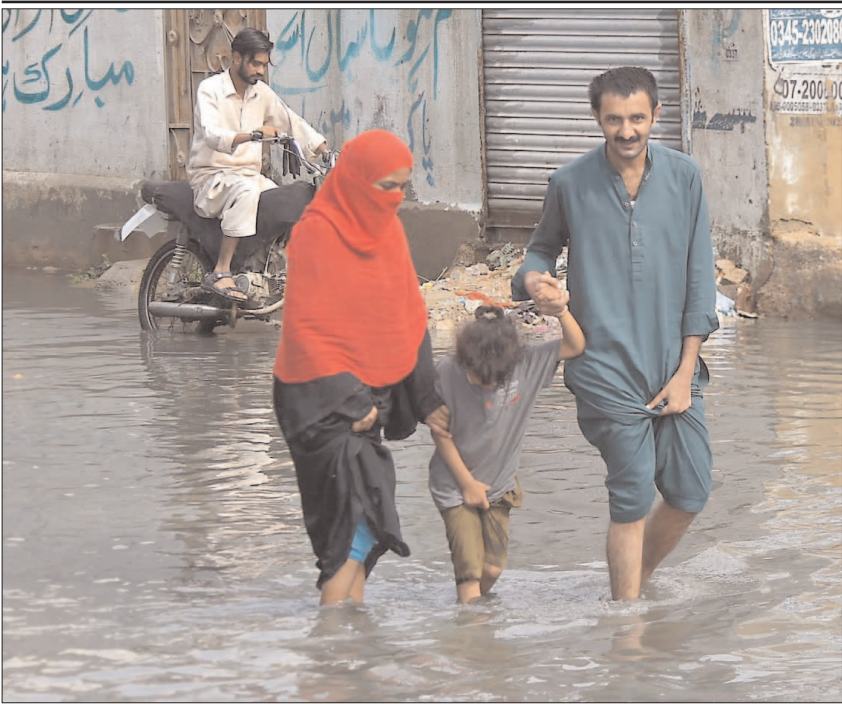
KARACHI: A view of accumulated rainwater after heavy showers.