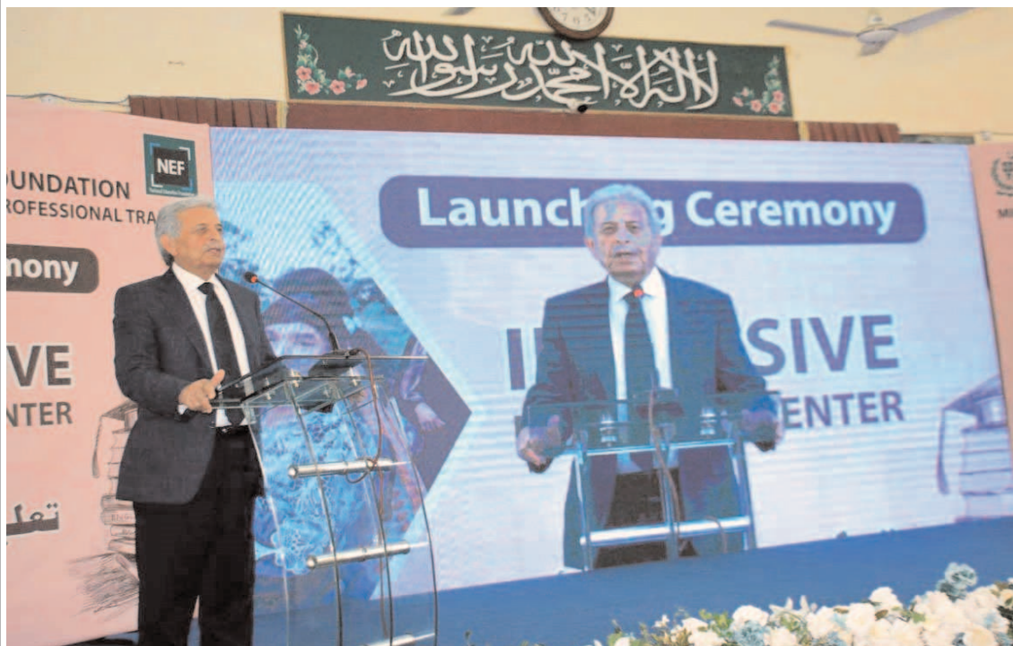
ISLAMABAD: Federal Minister for Education, Professional Training, Rana Tanveer Hussain addressing a launching ceremony of Inclusive Learning Center at IMS for boys G-11/2.

The committee granted principal approval of disbursement of fund to the applicant artists duly scrutinized and recommended by provincial and regional sub-committees. The committee also recommended that the regional members of the committee may be asked to scrutinize the applicant names before recommendation of financial assistance in future.