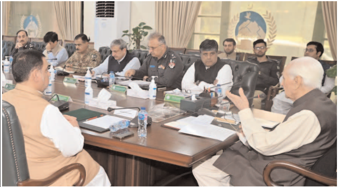
PESHAWAR: Caretaker Chief Minister Khyber Pakhtunkhwa Muhammad Azam Khan presiding over a meeting regarding law and order.

try and our mission is to equip them with the best character building and education in line with the requirements of the modern era. The provincial minister also apprised the advisor on education about problems in Khyber and other tribal districts. The Advisor on Education issued directives and said that besides the problems of teachers in the entire province including merged districts are also being solved on an urgent basis.