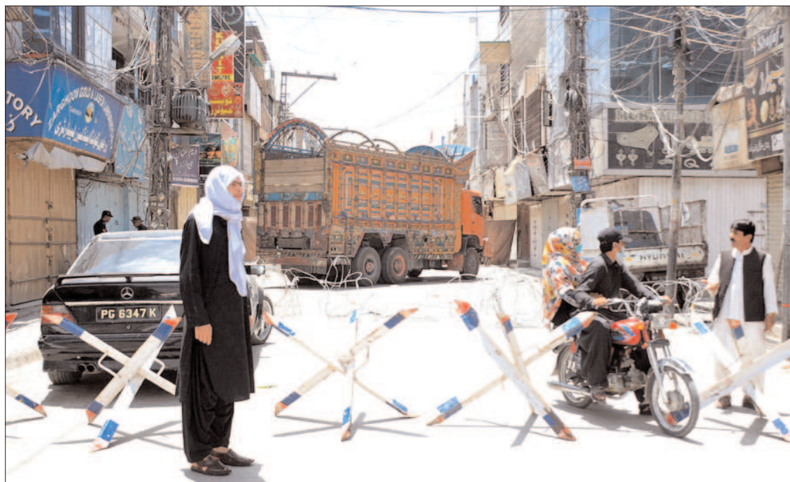
QUETTA: A view of closed road during 7th Muharram-ul-Haram procession.

He has demanded from the higher administration and said that the university administration should take notice of the violence of the influential students on the employees and remedy the injustice with the employees, otherwise we will be forced to take very important steps.