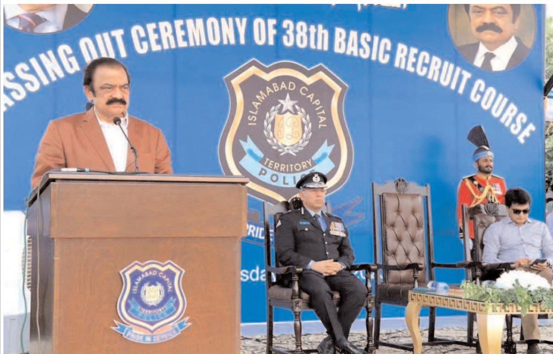
ISLAMABAD: Interior Minister Rana Sana Ullah Khan addressing during the passing out ceremony of 38th Basic Recruit Course at Police Lines.

They stated that such workshops are essential as they provide valuable knowledge about various aspects of road safety that many were not aware of. The Education Wing's officer encouraged the participants to follow traffic laws and drive with responsibly to ensure the safety of themselves and others on the road.