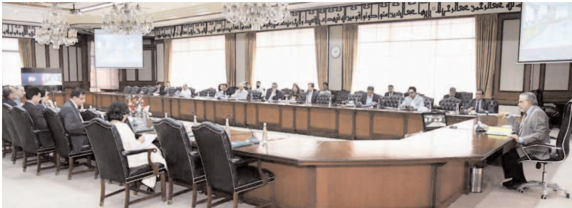
ISLAMABAD: Federal Minister for Finance and Revenue Senator Mohammad Ishaq Dar chairing meeting of Economic Coordination Committee (ECC) of Cabinet.

He called upon the youth to embrace hard work, integrity, and innovation, building a prosperous future for Pakistan.