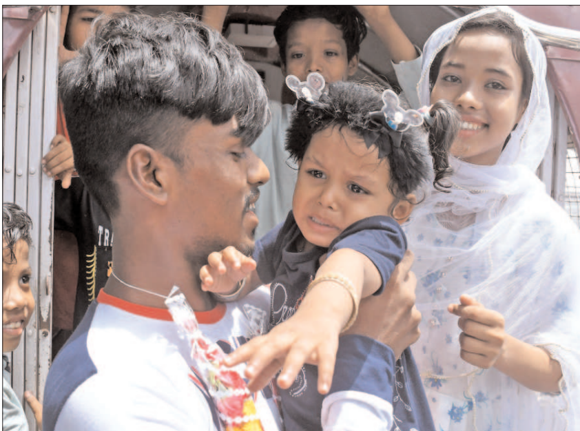
KARACHI: Pakistani fishermen, who were released by the Indian government, greeted with their family members after arrival in the Port City.

Modi condemned the mass assault as "shameful" and promised tough action against the perpetrators. Opposition parties have, however, disrupted the monsoon session of parliament which began last week, to demand a detailed statement by Modi on Manipur in parliament, followed by a debate.