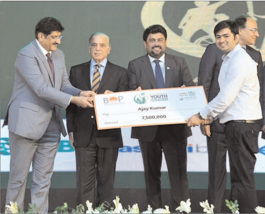
KARACHI: Prime Minister Shehbaz Sharif distributing cheques among successful candidates under PM Youth Business Loan Scheme.

The Foreign Minister also renewed the invitation to Foreign Minister Lavrov to visit Pakistan, a press release issued by the foreign office spokesperson said. The two Foreign Ministers also discussed the Black Sea Grain Initiative (BSGI). Recognizing the