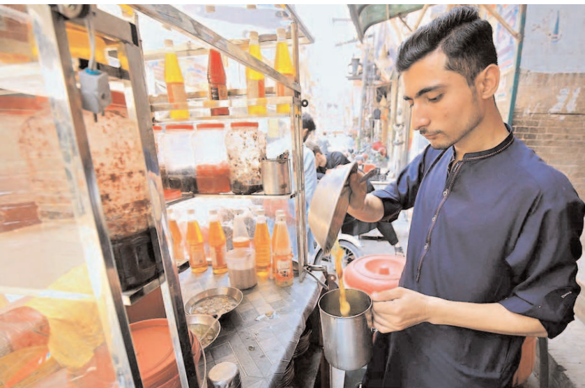
PESHAWAR: A vendor preparing traditional summer drink "gond katira" to attract customers at Namak Mandi area.