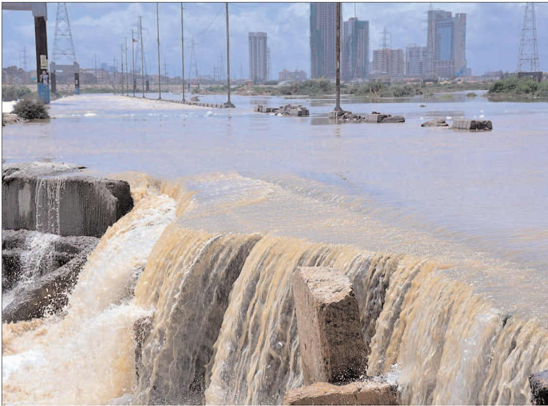
KARACHI: A view of Korangi Road has been closed for traffic due to flooding of Malir River.

talent from various parts of the country was serving as members of the Islamabad Police force. He commended the inclusive recruitment process and emphasized the significance of upholding values like honesty, integrity, and service to the people as they started their duty to protect and serve the nation.