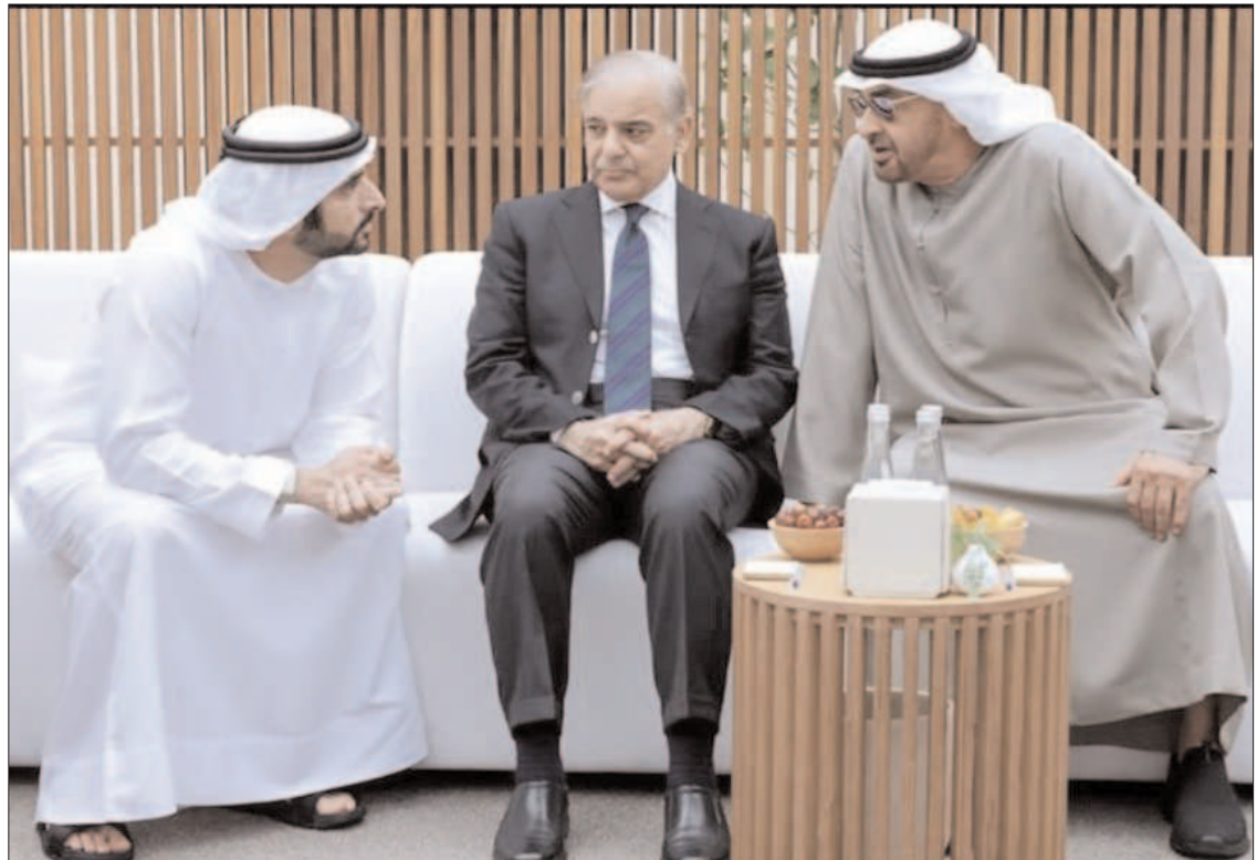
ABU DHABI: Prime Minister Shehbaz Sharif meeting with President of UAE Mohammad Bin Zayed Al-Nahyan and Crown Prince of Dubai Sheikh Hamdan Bin Rashid Al-Makhtoum.