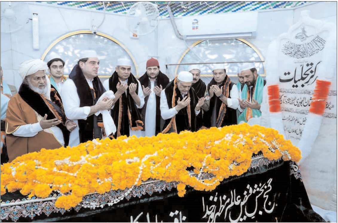
LAHORE: Federal Minister for Finance, Ishaq Dar along with others offer Dua after performing the 980th Annual Ghusal of the Shrine of Hazrat Ali Hajveri (RA) known as Hazrat Data Gunj Bakhsh.