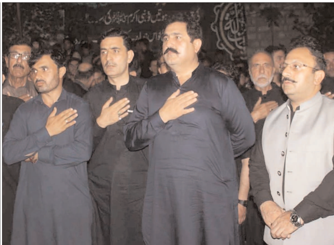
PARACHINAR: Federal Minister for Overseas Sajid Hussain Turi participating in the procession along with members of peace committee.

People can't afford more taxes, so the government exempted Malakand division from taxes for 100 years. Speakers said that the government should take steps to promote tourism here. Expressing complete indifference to the Grand Jirga, he formed the Dir Loya Jirga for the rights of the people, their problems and resolving disputes. The district administration of Dir can take the Dir Loya Jirga into confidence on national issues, law and order situation and other matters.