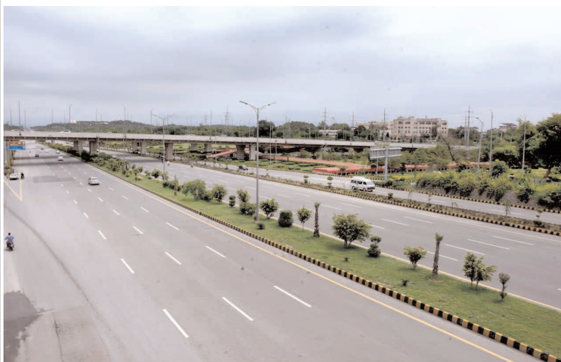
ISLAMABAD: A deserted view of Faisal Avenue on 9th Muharram-ul-Haram observing Youm-e-Ashura in the federal capital.

He said that the WHO and all stakeholders will ensure affordability and accessibility of medicines, testing and treatment to millions in low and middle-income countries. "This is indeed a major step towards elimination of hepatitis by 2030," he added.