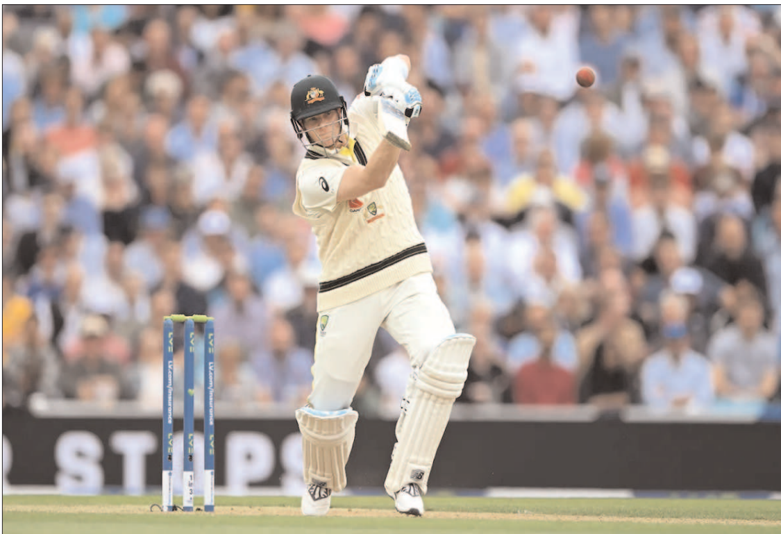
LONDON: Steven Smith drives back down the ground, England vs Australia, 5th men's Ashes Test.