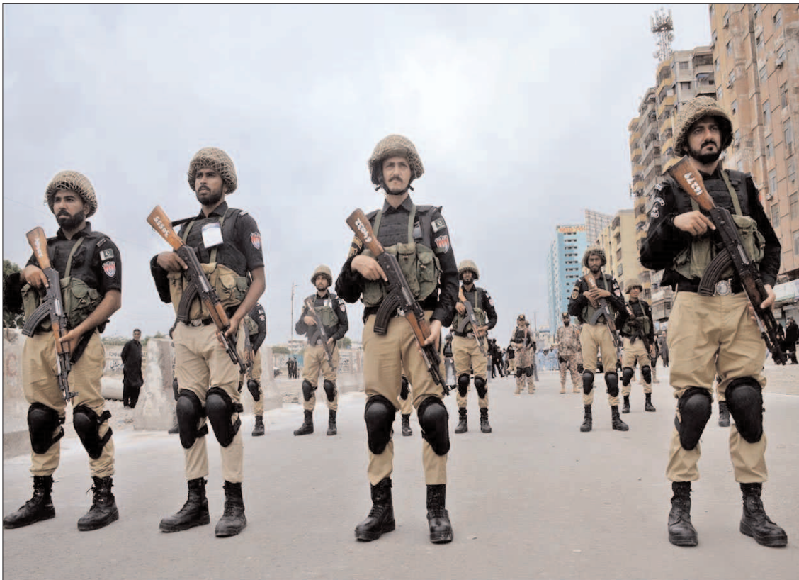
KARACHI: Security personnel standing high alert during the main procession of 9th Muharram-ul-Haram observing Youm-e-Ashur at M.A. Jinnah Road.

By adhering to these principles and putting the security plan into action, the government aims to facilitate a safe environment for the entire community to observe Muharram without any apprehensions, he added.