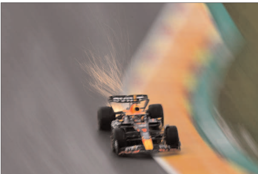
SPA, BELGIUM: Max Verstappen driving the (1) Oracle Red Bull Racing RB19 on track during qualifying ahead of the F1 Grand Prix of Belgium.

It is pertinent to mention here that Muhammad Ali Sadpara, a highly accomplished mountaineer from Skardu, went missing on the mighty K2 while attempting a winter summit with Iceland's John Snorri and Chile's Juan Pablo Mohr in January. The team had been missing since February 5, even after multiple rescue efforts.