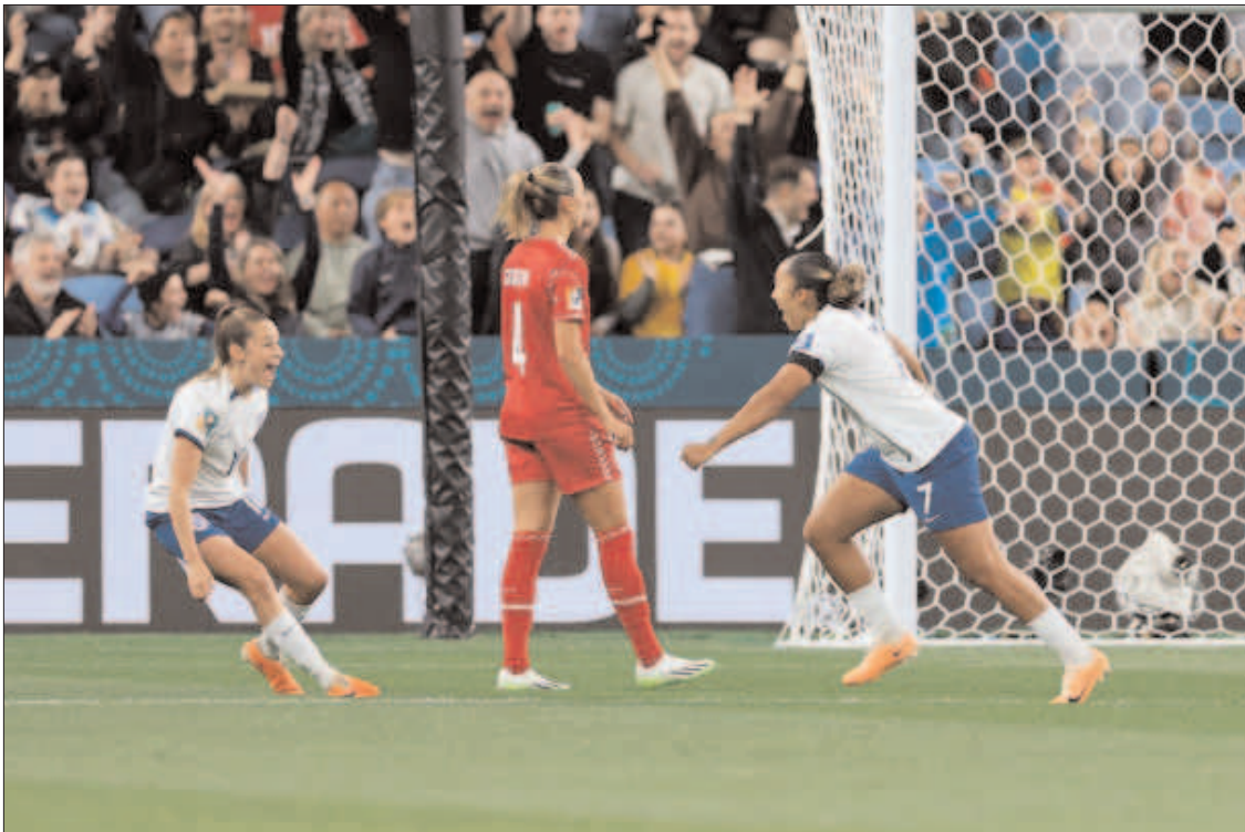
SYDNEY: Lauren James of England in action during the FIFA Women's World Cup Australia & New Zealand 2023 match between England and Denmark at Sydney Football Stadium.

LONDON (Agencies): Conor Benn says he is free to resume his boxing career, announcing he has been cleared by a UK Anti-Doping investigation into the two failed drugs tests that forced the cancellation of his fight with Chris Eubank Jr. Benn was formally charged by UKAD in April after twice testing positive for the female fertility drug clomifene in the build-up to October's domestic catchweight showdown. But the 26-year-old son of British great Nigel Benn revealed in a social media post that the charge has been dismissed. "Today marks the end of a gruelling 10-month process, during which the WBC (World Boxing Council) had already decided I was innocent of any wrongdoing," Benn said. He said he has been "vindicated for the second time" after a hearing with the National Anti-Doping Panel and UKAD. "Hopefully, the public and various members of the media can now understand why I have maintained my innocence so strongly all the way through," he added. "The UKAD process has now formally ended and I remain free to fight." October's proposed bout was intended to be a continuation of the Benn v Eubank feud in which the rivals' fathers -- Nigel Benn and Chris Eubank Sr -- battled it out in two ferocious contests in the early 1990s.