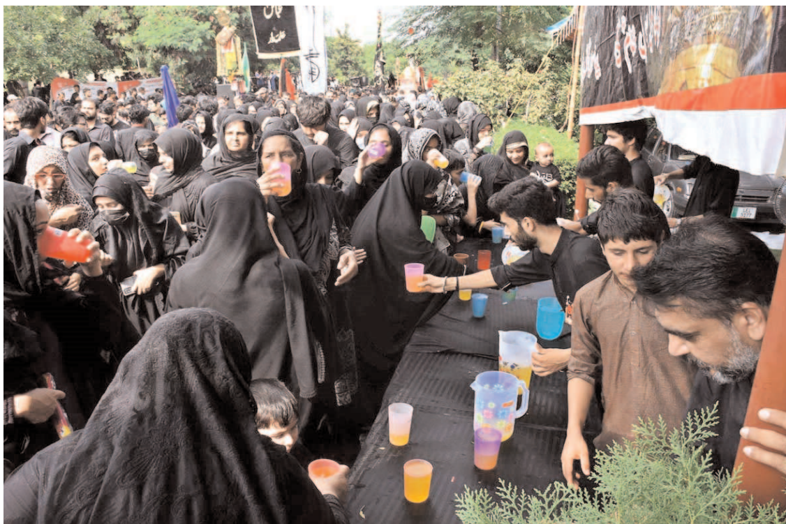
ISLAMABAD: Volunteers serving Sabeel (special drinks) during the main procession of 9th Muharram-ul-Haram observing Youm-e-Ashura at G-6 Road.