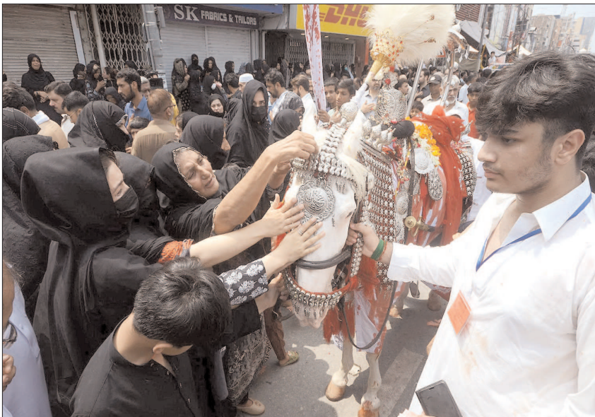
PESHAWAR: Mourners touching Zuljinnah during 9th Muharram procession.