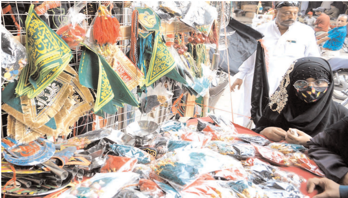
HYDERABAD: Woman secreting and purchasing Muharram ul Haram related stuff on ahead of start Ashura Procession.

The PCE price indexes are the Fed's preferred inflation measures for its 2% target. The core PCE price index reading in June was just above the Fed's recent forecast of 3.9% for the fourth quarter of 2023.