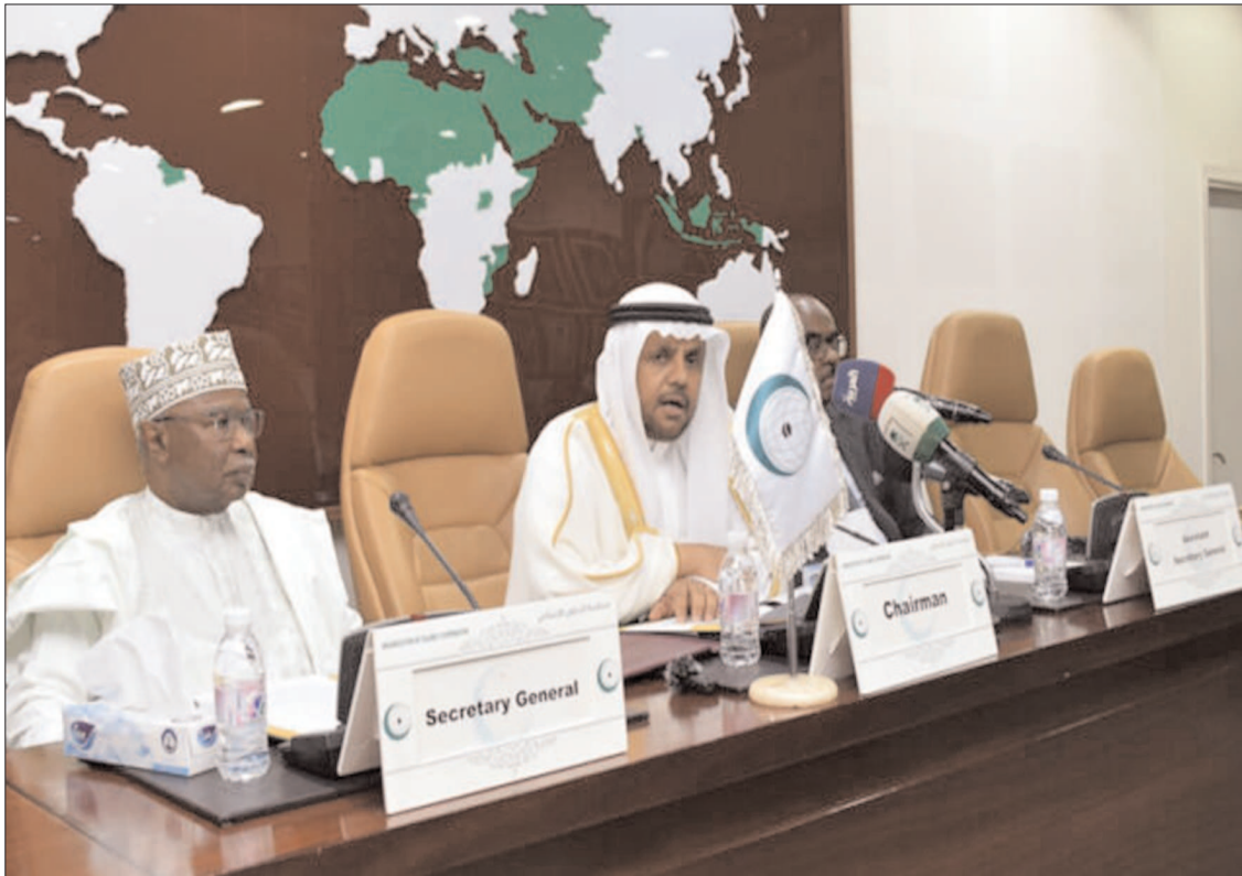
JEDDAH: Extraordinary, open-ended meeting of the Executive Committee of the Organization of Islamic Cooperation, at the headquarters of the General Secretariat in Jeddah.

ISLAMABAD (INP): Istikhkam-e-Pakistan Party (IPP) patron-in-chief Jahangir Khan Tareen on Sunday returned to Pakistan after a medical check-up in the United Kingdom (UK). According to details, Jahangir Khan Tareen reached Pakistan after undergoing several medical tests in London. Jahangir Tareen went to UK before Eid over health issues. On June 8, Jahangir Tareen officially launched the "Istehkam-e-Pakistan" party.