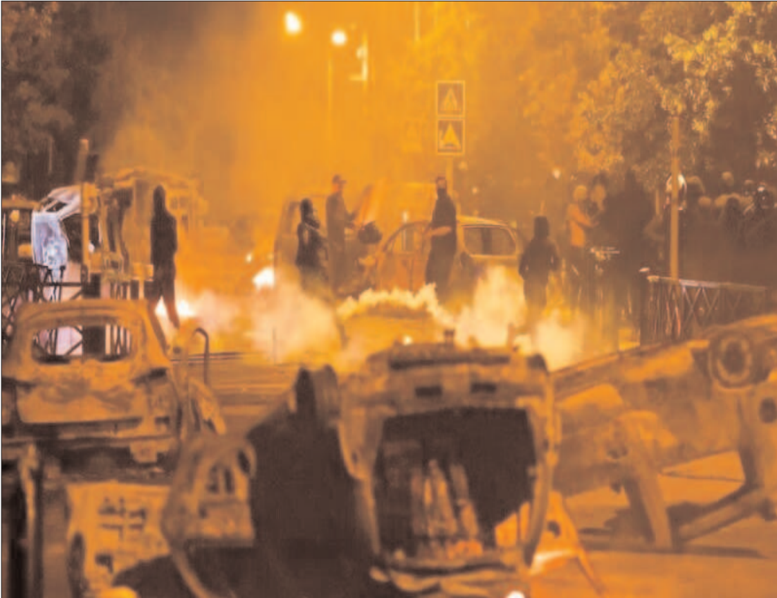
PARIS: Protesters clash with police in the Paris suburb of Nanterre.

ISLAMABAD (PPI): Pakistan Meteorological Department (PMD) on Sunday forecast monsoon rainfall in the country from July 03 and will continue till July 08. The Met Office, in a report stated that moist currents from the Arabian Sea are likely to penetrate in upper parts of the country, and a westerly wave is also likely to enter the country from July 3 (tomorrow). Islamabad, Rawalpindi, Murree, Galliat, Attock, Chakwal and Jhelum, Azad Kashmir and Gilgit-Baltistan and other areas will receive rain with thunderstorm from July 4-7. Rain, wind, thunder-shower with isolated heavy falls are also expected in Barkhan, Sibbi, Loralai, Kalat, Khuzdar, Zhob, Lasbella and Naseerabad, Bannu, Karak, Waziristan, D.I Khan, Rajanpur, Multan, Bhakkar, Layyah, Kot Addu, Bahawalpur, Bahawalnagar, Sahiwal and Okara from July 5 to 8.