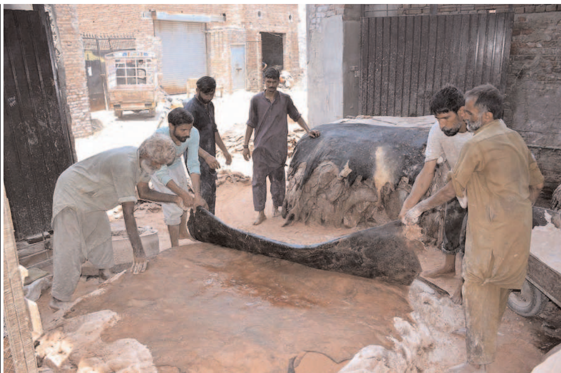
FAISALABAD: Workers preserving sacrificial animal hides at their warehouse.

Cellphones enabling 5G services took the lion's share of May's shipments with 20.17 million units, a 13.7-percent year-on-year expansion, said the CAICT, a research institute under the Ministry of Industry and Information Technology.