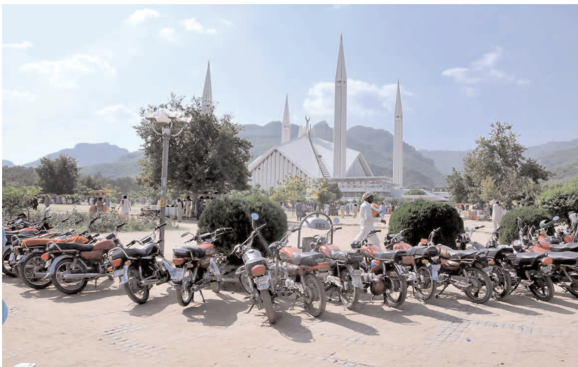
ISLAMABAD: A large number of motorcycles parked in the premises of Shah Faisal Masjid as people visit on weekend.

To enhance tourism between both countries, he said that Indonesia and Pakistan are working to start direct flights which ultimately increase linkages among people. Talking to APP, Ni Made Ayu Marthini, Deputy Minister for Marketing, Ministry of Tourism and Creative Economy, Republic of Indonesia, said that there were multiple common characteristics culturally and religiously between Indonesia and Pakistan that could help enhance people-to-people exchanges as both countries had majority of Muslim populations.