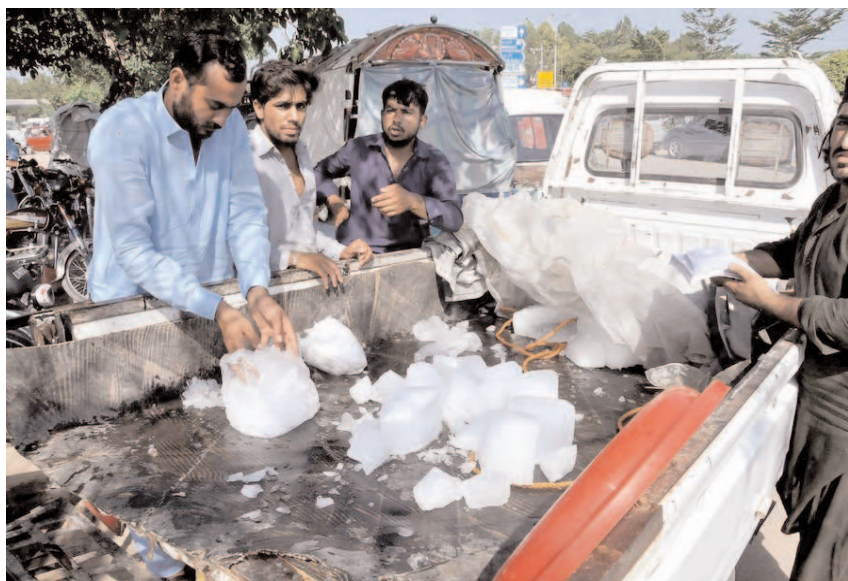
ISLAMABAD: A vendor sells ice in a hot day on his truck setup.

This approach reduces the reliance on synthetic pesticides and promotes sustainable farming practices.