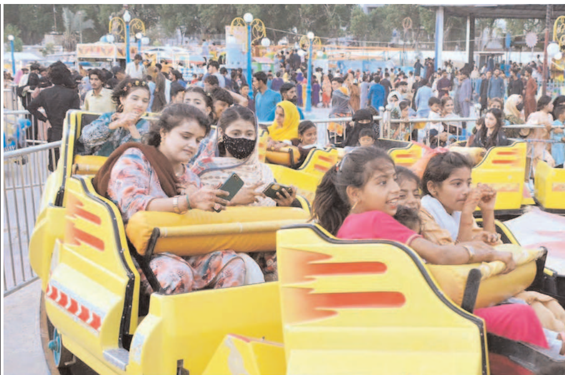
HYDERABAD: Youngsters enjoying mechanical swing ride at Fun Land Park.