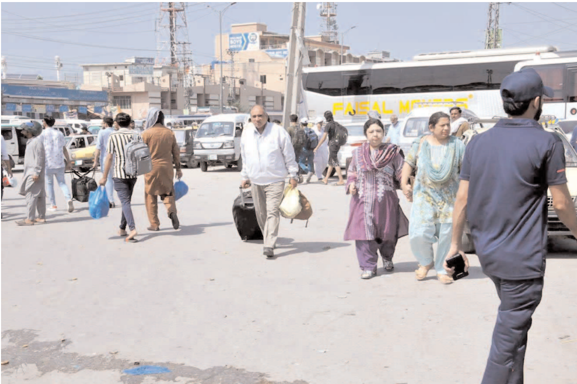
ISLAMABAD: People arriving back to the city after spending Eid holidays with their family members in hometowns.

ISLAMABAD (APP): World Youth Skills Day will be marked on July 15 (Saturday) across the globe including Pakistan, aim of the day is to encourage youth to celebrate the value of acquiring skills like building, making, and creating as a way to achieve personal success and fulfillment. By empowering young people, they can better advance the broader mission of the United Nations (UN) for lasting peace, sustainable development, and human rights for all, according to UN Secretary-General, Ban Ki-moon. A UN resolution to establish a World Youth Skills Day was adopted by the General Assembly on December 18, 2014. On the UN's website, they state that education and training are the keys to success in the workforce. However, unfortunately, existing systems are failing to address the learning needs of many young people. A large number of youths have low levels of achievement in basic literacy and numeracy, according to surveys. Skills and jobs for youth feature prominently in the 2030 Agenda for Sustainable Development.