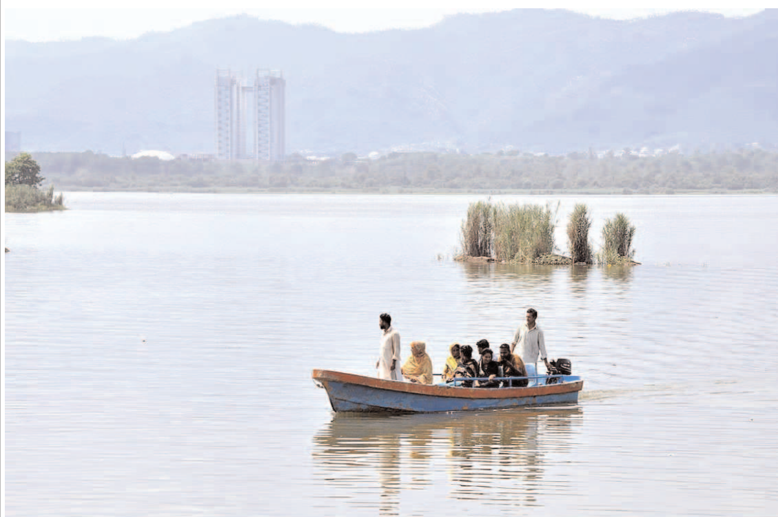
ISLAMABAD: A family is enjoying the motor boat ride at Rawal Dam.

Mild moist currents from Arabian Sea are penetrating into upper parts of the country upto 5,000 feet.