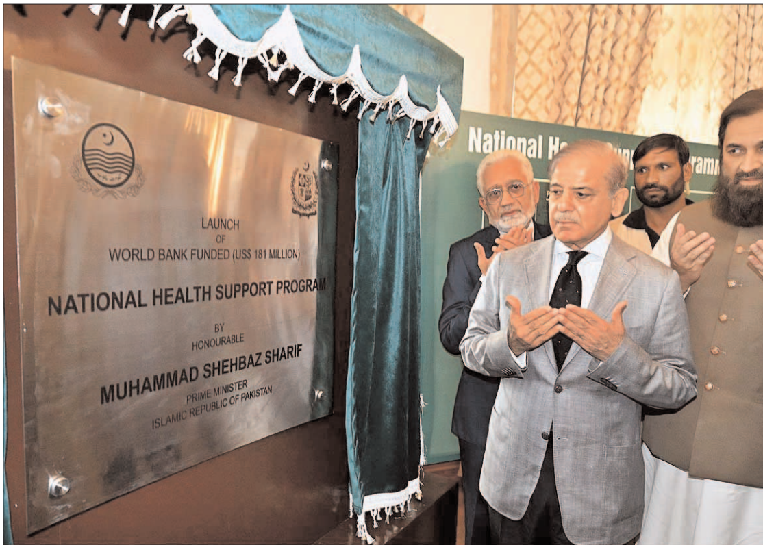
LAHORE: Prime Minister Shahbaz Sharif offering dua after launching the National Health Support Programme.

During the meeting, the prime minister was given a briefing over the law and order situation in the province. The prime minister appreciated the performance of the provincial administration and Punjab police for maintaining law and order during Muharram ul Haram and Ashura.