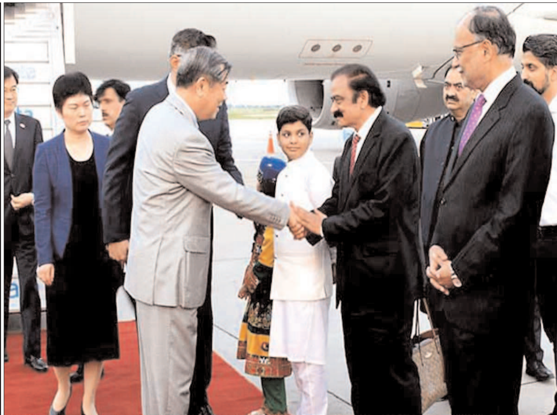
ISLAMABAD: Federal Minister for Interior Rana Sanaullah welcomes Chinese Vice Prime Minister (PM) He Lifeng.

"It's the year 2023, and Russia is engaged in an armed conflict with a neighbour. And I think that there should be a certain attitude towards people who harm us inside the country," Putin told reporters in Saint Petersburg. "We must keep in mind that in order for us to achieve success, including in a conflict zone, everyone needs to follow certain rules," Putin added. The Russian president was responding to a question from a reporter who asked him to comment on the recent jailing of a theatre director and a sociologist.