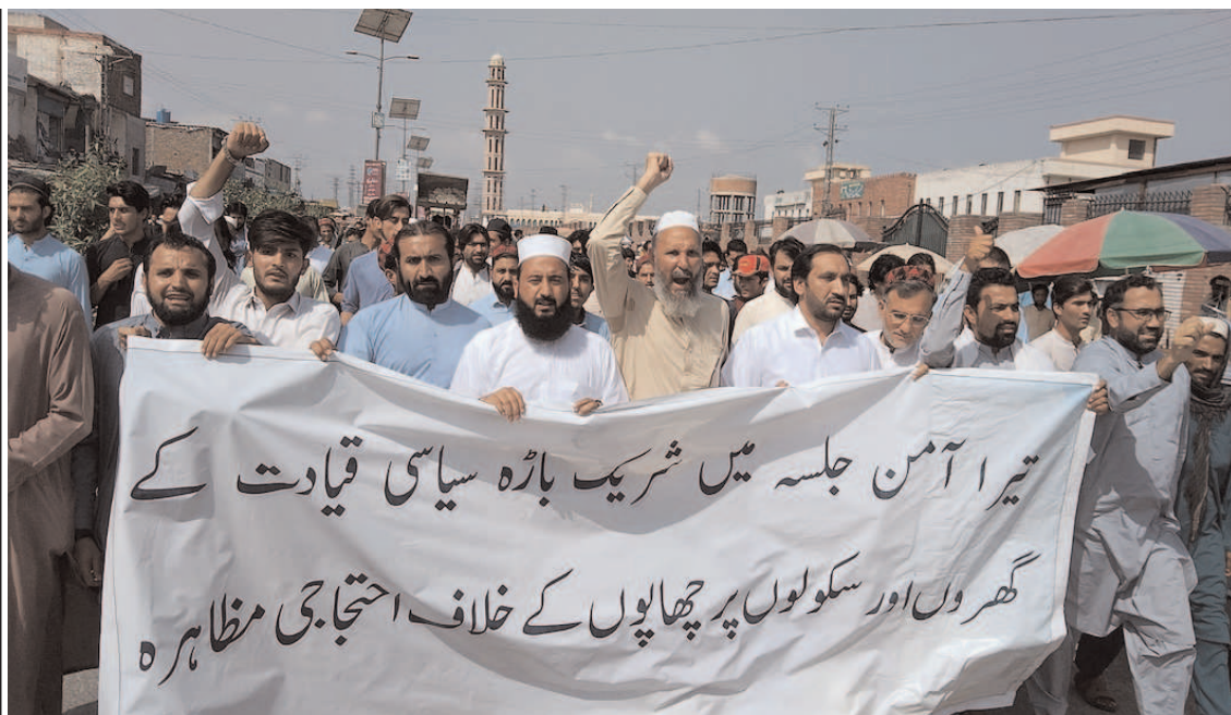
BARA: Political activists hold placard during a protest to condemn FIR lodged against elites of Sayasi Ittehad and conducting raids at house of their leaders.

Later on, he was buried in his native village Wadhi.