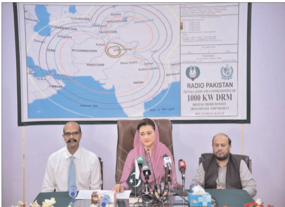
ISLAMABAD: Federal Minister for Information and Broadcasting Marriyum Aurangzeb addressing a press conference.

"With the fast-growing population of the country, there is a need to spend plenty more on the healthcare sector and these facilities should reach out to rural areas as well where there is a severe dearth of doctors and hospitals which ultimately put the burden on health facilities in major cities," he added.