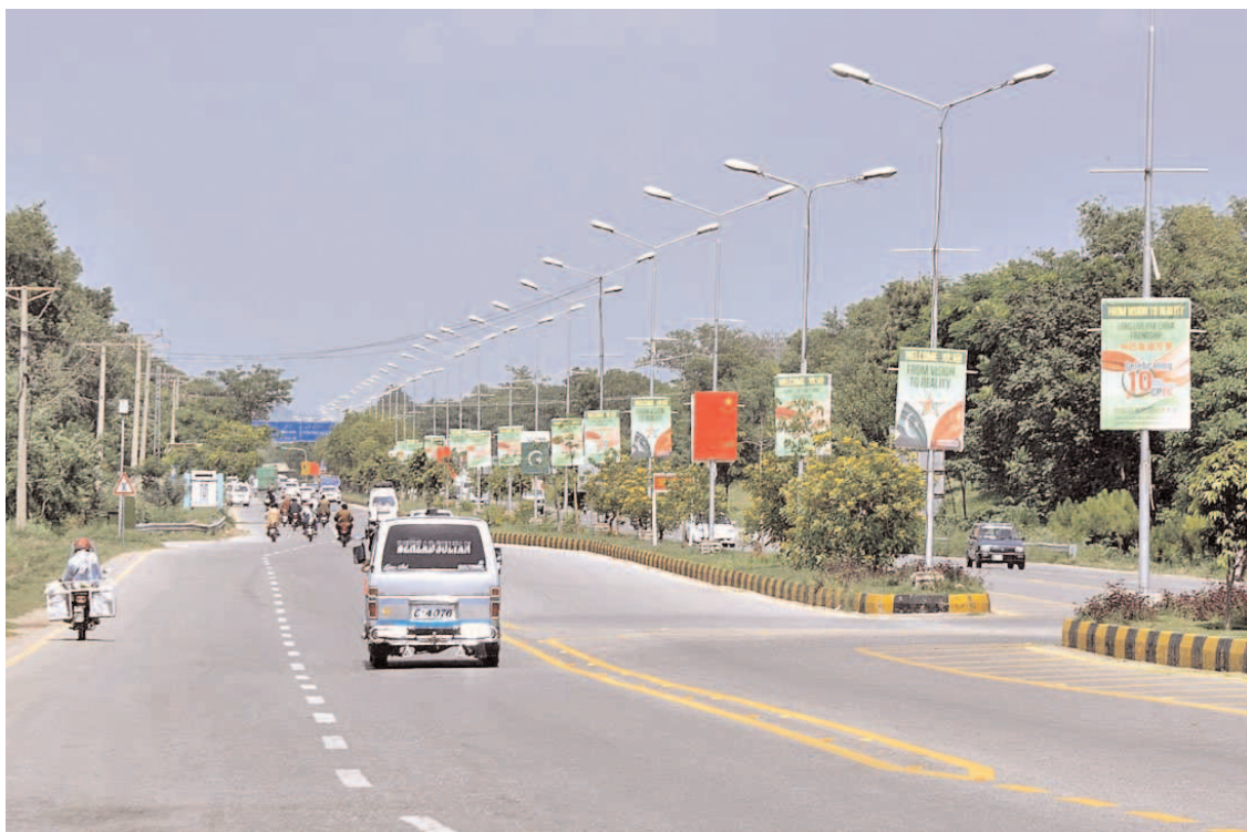
ISLAMABAD: Billboard and Pak-China flags are being displayed at Srinagar Highway in connection with 10 years celebration of CPEC.

RAWALPINDI (APP): Parks and Horticulture Authority (PHA) Rawalpindi would set up a grand nursery to provide plants to the citizens at affordable rates and to generate more revenue, said PHA spokesperson. She informed that the authority had kicked off the monsoon plantation drive.