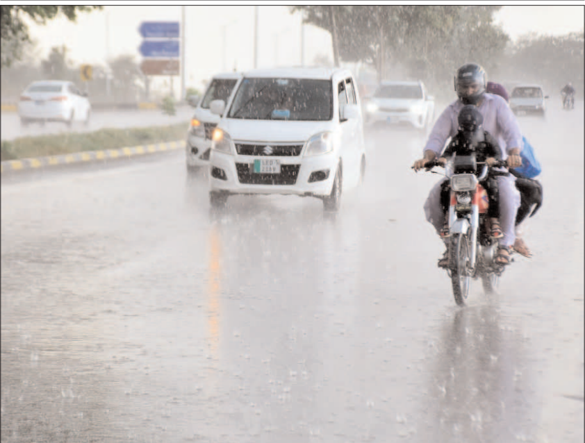
ISLAMABAD: Motorists are on their way at Murree Road during heavy rain fall of pre-monsoon spell.