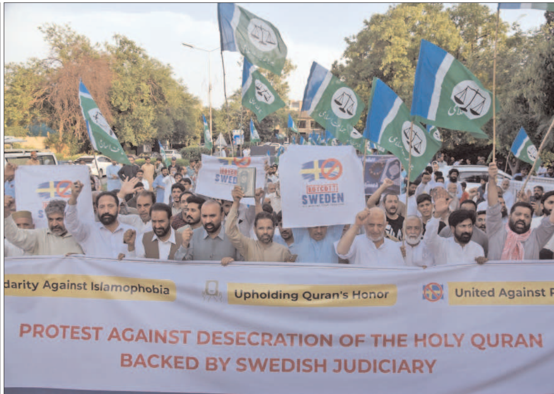
ISLAMABAD: Workers of Jamat-e-Islami holding a protest outside Sweden Embassy against burning of Holy Quran in Sweden.

Burns traveled to Kyiv before Prigozhin’s rebellion, which was not a topic of discussion, the US official told CNN. Speaking at a news conference in Kyiv Saturday, Zelensky said Prigozhin’s rebellion had “greatly affected Russian power on the battlefield” and could be beneficial to Ukraine’s counteroffensive. While the thrust of Kyiv’s efforts have focused on recapturing territory in the south and east of Ukraine, Zelensky told Burnett that his ultimate goal was to liberate Crimea, the peninsula annexed by Russia in 2014 in violation of international law. “We cannot imagine Ukraine without Crimea. And while Crimea is under the Russian occupation, it means only one thing: the war is not over yet,” he said. Asked whether there was any scenario under which there could be peace without Crimea, Zelensky said: “It will not be victory then.”