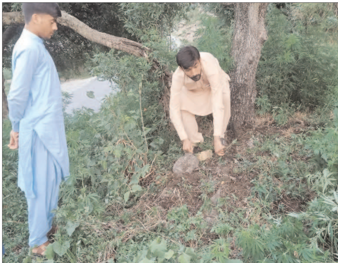
BUNER: The grave of Prince Feroz Shah son of last Emperor of Mughal Dynasty Bahadur Shah Zafar seeks attention of authorities concerned for restoration as well as establishment of monument to educate local populace on indigenous history located at Malka area of Tehsil Mandanr.

Police said that during continued drive against drug peddlers and criminals, the teams of different police stations conducted raids within the areas and arrested five outlaws and recovered 540 gram hashish, 20 liters of liquor, three pistols 30 bore from them.