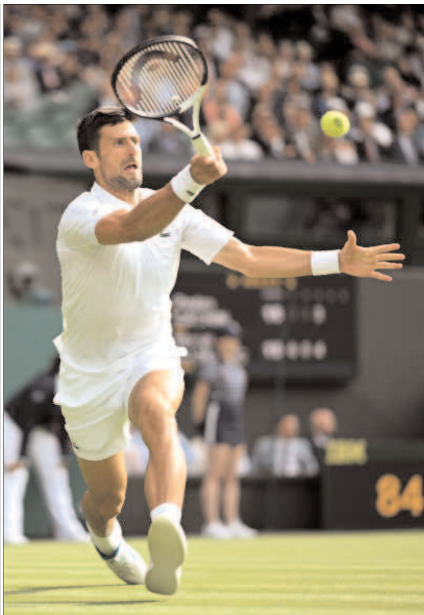
LONDON: Novak Djokovic plays a forehand against Pedro Cachin in the Men's Singles first round match on day one of The Championships Wimbledon 2023.

Shakib Al Hasan was picked up by the Kolkata Knight Riders for this year's IPL, but the all-rounder pulled out of the competition, which clashed with Bangladesh's series against Ireland at home and away. The BCB denied clearance to Test captain Shakib and vice-captain Liton until they played the one-off Test against Ireland in Dhaka from April 4 to 8.