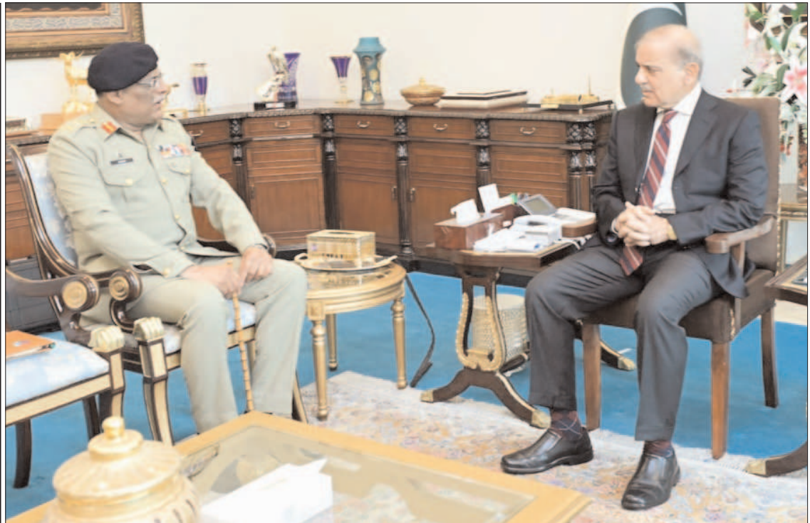
ISLAMABAD: Chairman Joint Chiefs of Staff Committee General Sahir Shamshad Mirza called on Prime Minister Shehbaz Sharif.

He also demanded of the Swedish government to take notice of the Islamophobic and hateful narrative against the Muslim population in their country. Prime Minister Shehbaz appreciated the Organisation of Islamic Cooperation for convening an urgent meeting on the issue and said Pakistan endorsed their meeting and decision, with a hope that such Islamophobic incidents did not recur in the future.