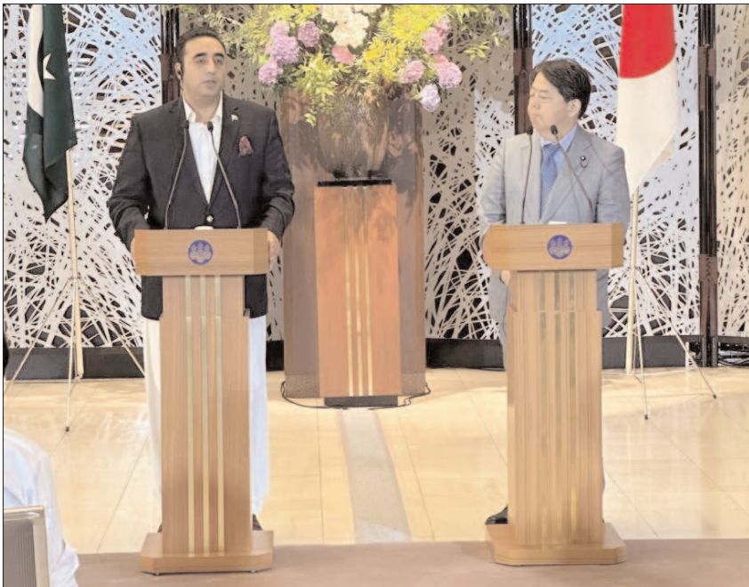
TOKYO: Foreign Minister Bilawal Bhutto with his Japanese counterpart Hayashi Yoshimasa addressing a joint press conference.

Swedish police had granted Momika a permit in line with free speech protections, but authorities later said they had opened an investigation over "agitation against an ethnic group", noting that Momika had burnt pages from the Islamic holy book very close to the mosque.