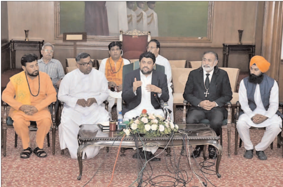
KARACHI: Governor Sindh Kamran Khan Tessori addressing a press conference along with different religious leader against the burning of holy Quran outside a Stockholm Mosque at Governor House.