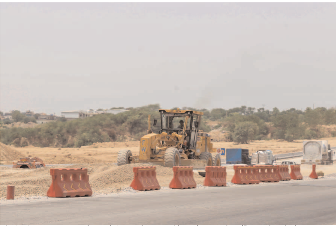
ISLAMABAD: Heavy machinery being used to expand lanes for smooth traffic on Islamabad Expressway.