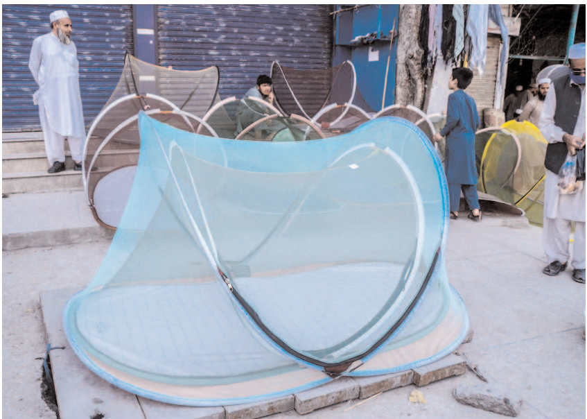
PESHAWAR: Vendor displaying mosquito net to attract customers at Qissa Khawani Bazaar.

The seminar will have four sessions in which prominent personalities from different fields of life will express their views on the mega project of Pakistan-China friendship.