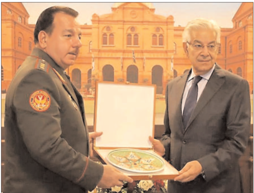
RAWALPINDI: Tajikistan Defence Minister, Sherali Mirzo presenting a souvenir to Defence Minister, Khwaja Muhammad Asif.

Asif Ali Zardari paid rich tributes to those who sacrificed their lives for the restoration of the 1973 Constitution and democracy. "Red salute to those who endured executions, floggings, imprisonment and torture for the restoration of democracy", President Zardari said in his message.