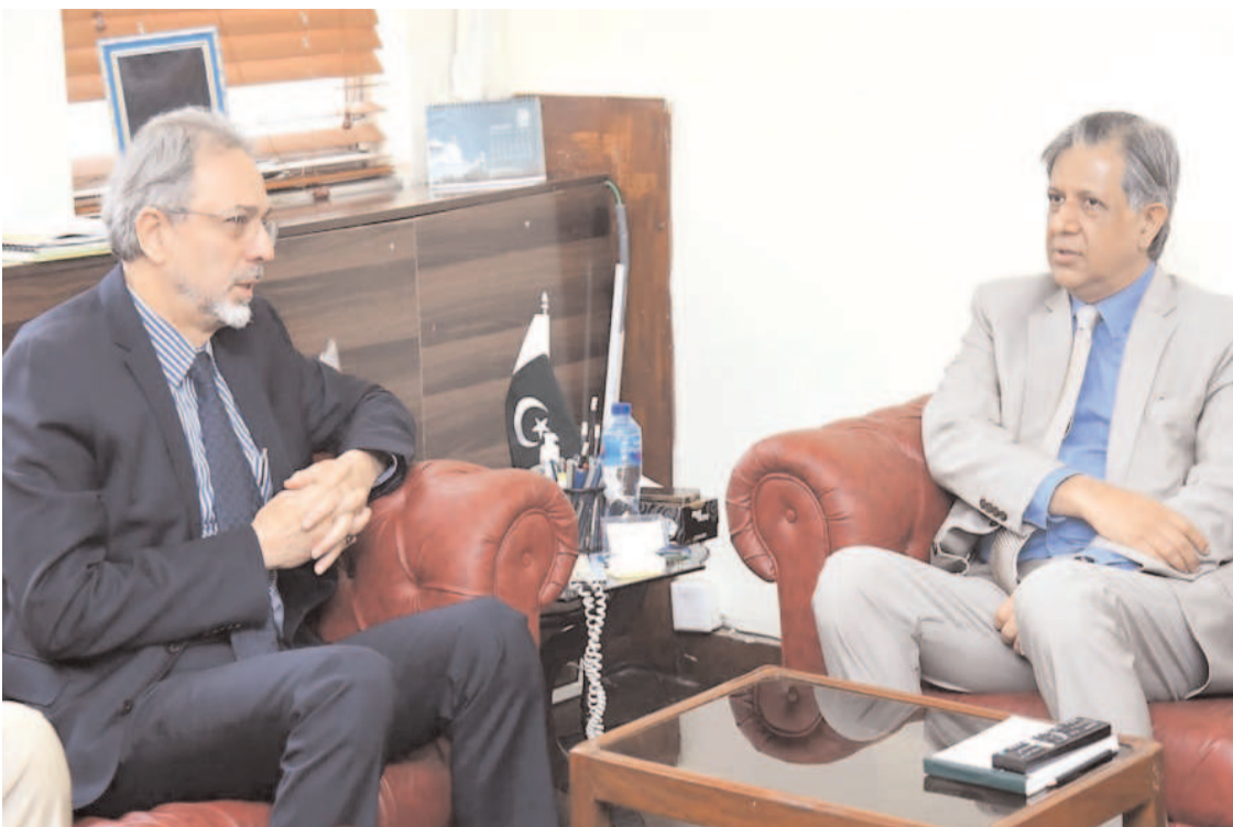
ISLAMABAD: Minister for Law and Justice Senator Azam Naeem had a meeting with the Turkish Ambassador Dr Mehmet Paçacı.

ISLAMABAD (INP): National Disaster Management Authority (NDMA) has directed all relevant departments to remain alert in view of rain spell from Monday till July 8. According to National Disaster Management Authority (NDMA) spokesperson, heavy rains with gusty winds and thunderstorms are expected in different parts of the country during this period which can trigger land sliding in hilly areas and flooding in the lowlands. The National Disaster Management Authority (NDMA) has asked the relevant departments to ensure the presence of emergency machinery and staff and issue advance notice to people in flood-risk areas. It also advised tourists and visitors to remain informed about weather conditions before travelling and farmers and livestock owners to take necessary precautions in view of weather conditions.