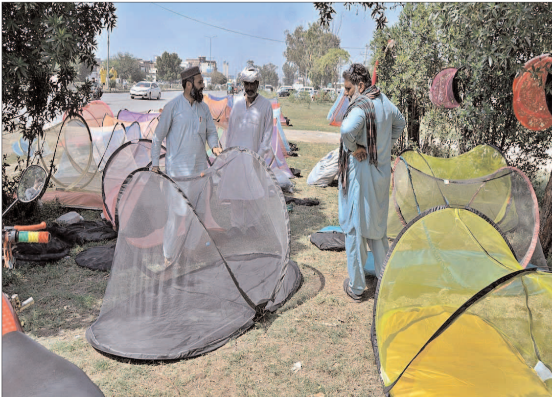
LAHORE: A vendor is selling mosquito nets as a preventative measure against dengue and malaria fever at roadside setup in Provincial City.

Caretaker Minister for Primary Health Jamal Nasir said the CBC test facility had been provided in rural health centers for dengue diagnosis.