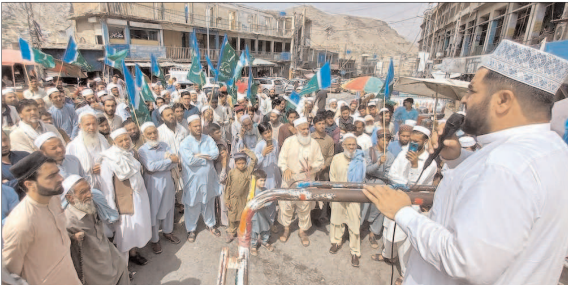
LANDI KOTAL: Local leader of Jamat-e-Islami addressing during a protest against desecration of Holy Quran in Sweden.

QUETTA (INP): At least 27 people have died and 1095 were injured in 739 incidents that occurred on the highways of Balochistan during the month of June. According to data released by Medical Emergency Response Center (MERC), most of the accidents occurred on N25 at Winder, Lasbela area on the Karachi-Quetta highway. The MERC responded to 739 road accidents that happened on the main highways of Balochistan in the month of June and provided medical treatment to 1095 injured people while shifting the dead bodies to the nearest hospitals. According to the report, the authority has recorded the highest number of road accidents of 107 at Winder Lasbela, due to which 124 people were injured during the said period. To provide first aid in emergency situations, Medical Officers, and trained paramedical staffs have been appointed at every Medical Emergency and Response Center to save human lives in case of accidents on the national highways. The centers have been connected with district hospitals to deal with emergency situations and for administrative purposes. The government had also been working to expand the main roads to control the accidents in the province.