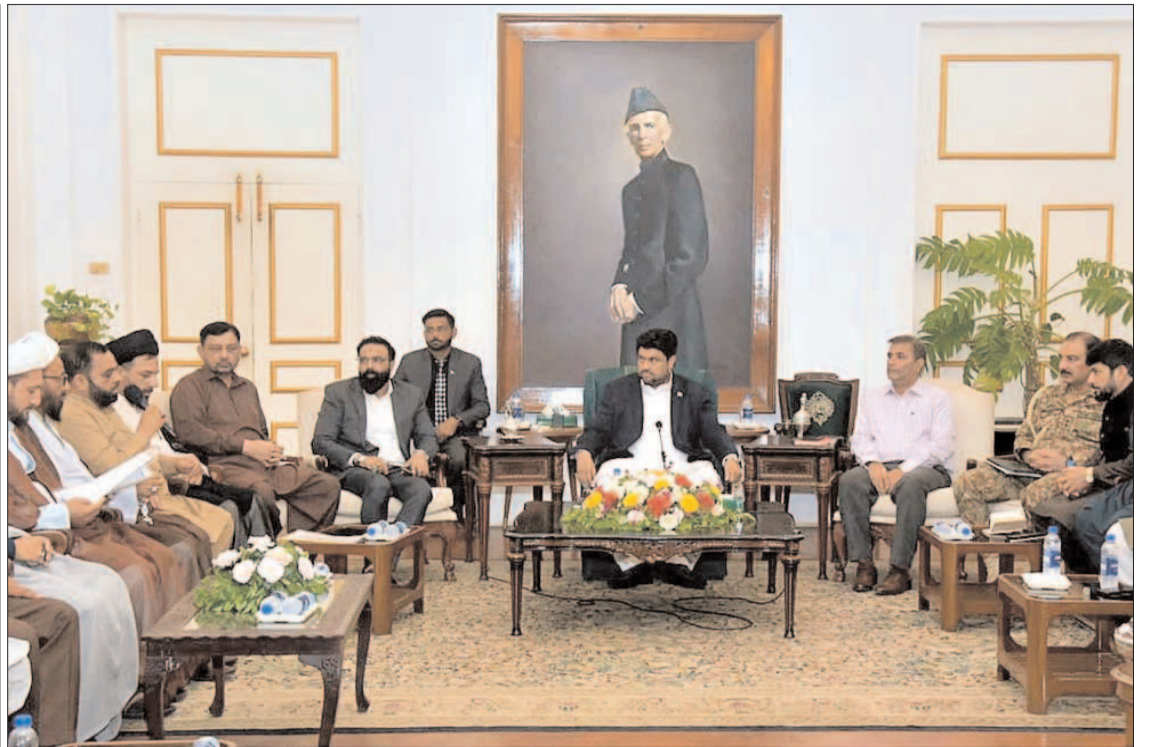
KARACHI: Governor Sindh Kamran Khan Tessori Call on by Delegation of Tanzeem-e-Azadari at Governor House.

He emphasized that the Pakistan People's Party advocates for the implementation of the rule of law and the constitution in the country, the prosperity and unity of our nation depend on upholding these principles, we all should work together for this country.