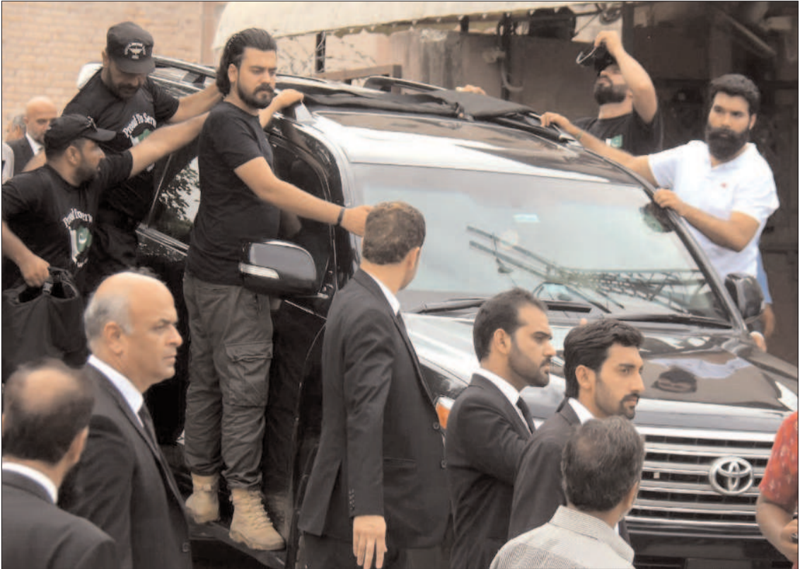
ISLAMABAD: Security personnel securing a vehicle carrying PTI Chief Imran Khan during his hearing in the court.