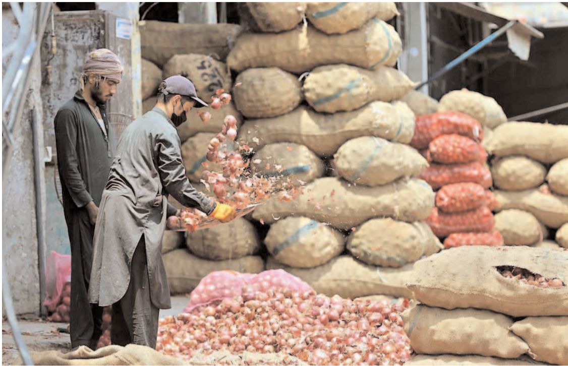
ISLAMABAD: Vendors busy in cleaning onion at fruit and vegetable market.