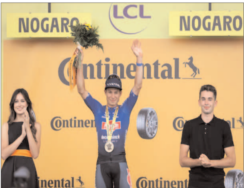
NOGARO: Jasper Philipsen of Belgium and Team Alpein-Deceuninck celebrates at podium as stage winner during the stage four of the 110th Tour de France 2023 a 181.8km stage from Dax to Nogaro.

She will play France's Alize Cornet or Japan's Nao Hibino in the second round as she bids to become the first woman since Serena Williams in 2016 to defend the women's singles title here.