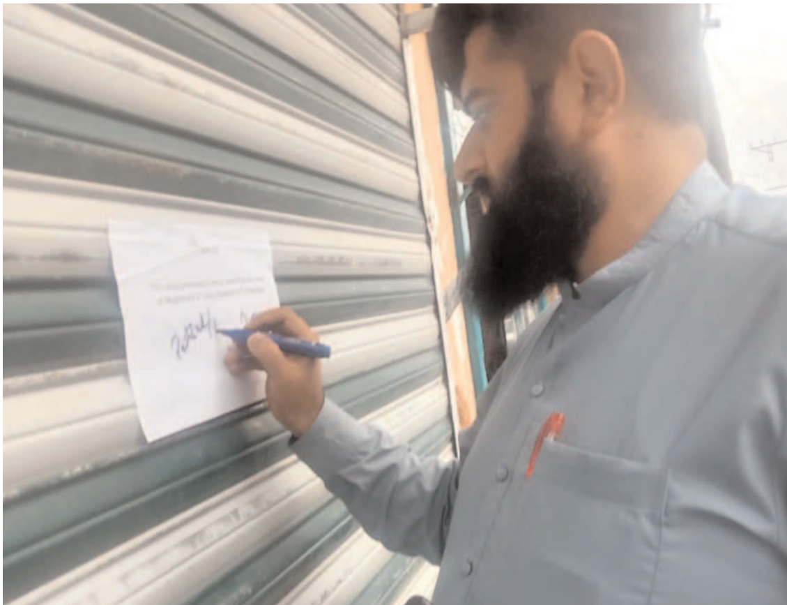
ISLAMABAD: The Islamabad Capital Territory (ICT) administration sealed Gas Cylinder filling shop at Sangjani locality.