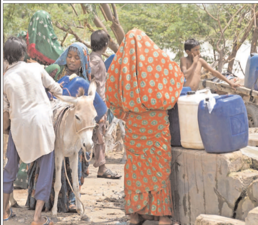
THARPARKAR: Women filling their pots with drinking water at Nagarparkar.

According to police sources, 25 lakh 14 thousand cash, 27 mobile phones, 11 motorcycles, one motor car, two solar panels and other items were recovered from the alleged accused. Instructions have been issued to the police across the region to deal strictly with anti-social elements and treat decent citizens with dignity and respect.