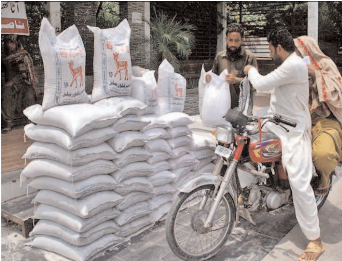
BAHAWALPUR: A motorcyclist purchasing flour bag from a roadside stall.