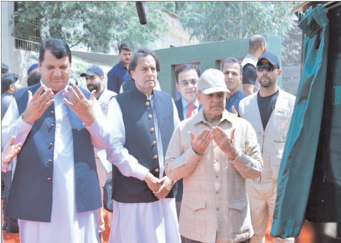
TORGHAR: Prime Minister Shehbaz Sharif laying the foundation stone of RCC Bridge on Indus River that will connect Torgar with Buner District.