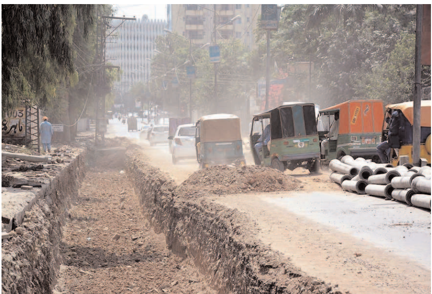
PESHAWAR: View of excavation work under way along roadside at Sher Shah Suri Road.

He directed the traffic riders to ensure the use of helmets while riding motorcycles.