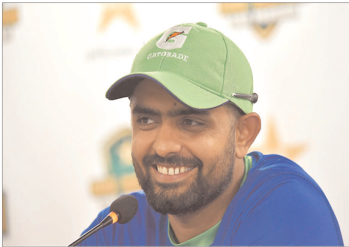
KARACHI: Pakistan's captain Babar Azam smile during a addresses conference at the National Stadium on ahead of their tour to Sri Lanka.

Manchester City full-back Sergio Gomez, who scored in the quarter-final win against Switzerland, added a late fifth.