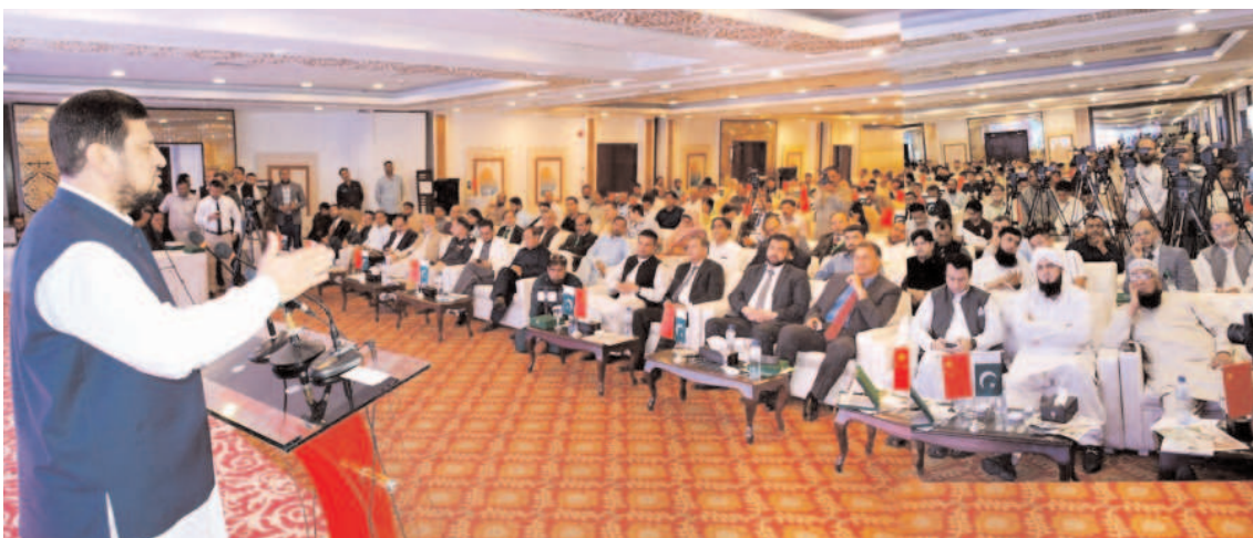
PESHAWAR: Governor Khyber Pakhtunkhwa Haji Ghulam Ali addressing a seminar organized by China Window Peshawar.