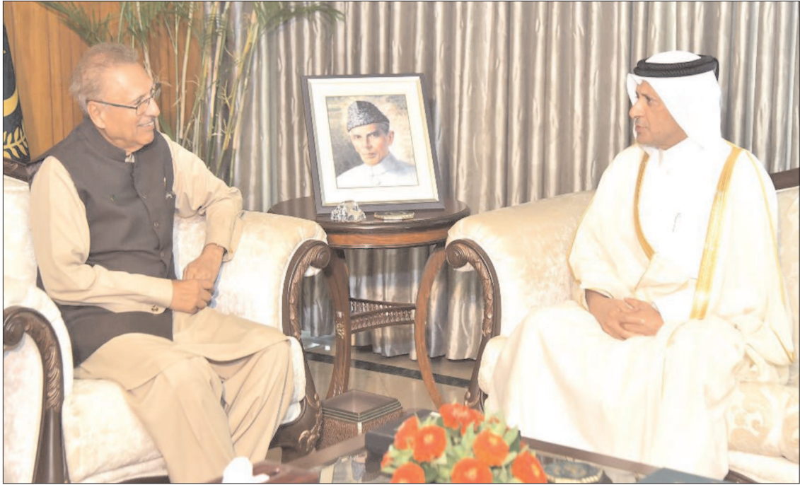
ISLAMABAD: Outgoing Ambassador of Qatar to Pakistan, Sheikh Saoud Bin Abdulrahman Faisal Al-Thani called on President Dr. Arif Alvi, at Aiwan-e-Sadr.