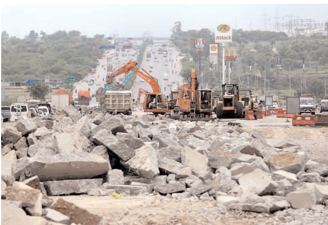
ISLAMABAD: Heavy machinery being used to expand Islamabad Expressway during development in Federal Capital.

The committee would convene its next session on Tuesday.