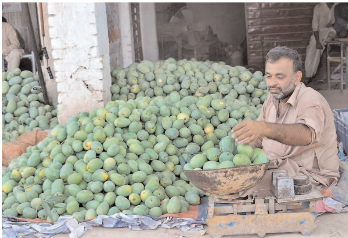
MULTAN: A trader selling seasonal fruit mango at fruit market.

The turnover on the fourth trading day of the week came to 3.57 trillion yen (24.79 billion US dollars).