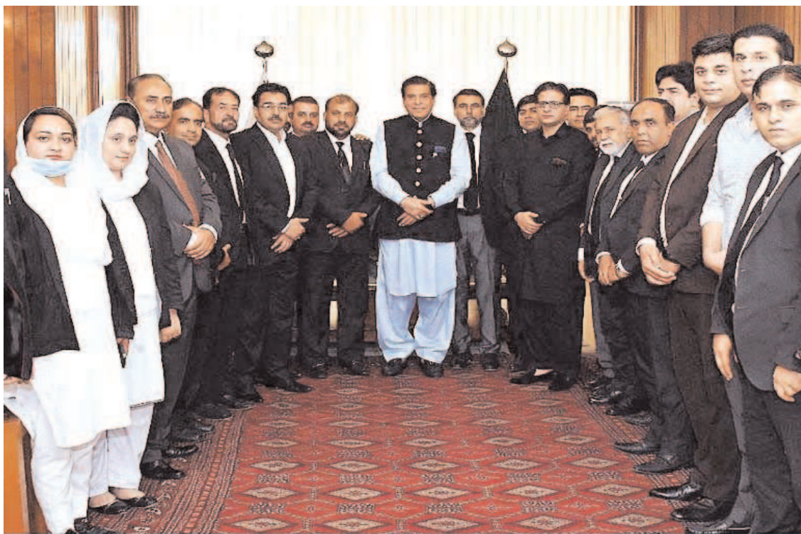
ISLAMABAD: Speaker National Assembly Raja Perviz Ashraf in a group photo with delegation of Gujar Khan Bar Council at Parliament House.