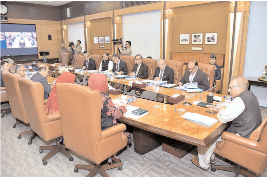
ISLAMABAD: President Dr Arif Alvi chairing the 23rd meeting of the Board of Governors of the National School of Public Policy, at Aiwan-e-Sadr.

ISLAMABAD (APP): Allama Iqbal Open University (AIOU) on Thursday announced to initiate admissions for the second phase of semester Autumn 2023 from Friday (Sept 1). Programs offered in this phase included Associate degree in Arts (BA General), Associate degree in Commerce (B.Com), Associate degree in Education, BS (ODL) programmes, 1.5, 2.5 and 4-year B.Ed programme, Postgraduate diploma and certificate courses, said a news release. The admission forms and prospectus of all the programmes are available on the university website. Admission forms for the Associate Degree programs (BA, B.Com) and B.Ed program are now available at the University's Regional Offices and SWIFT Centers throughout the country. All the necessary information is available in the prospectus and the deadline for admissions is October 17. Candidates may call the university helpline at 051-111 112 468 for further information.