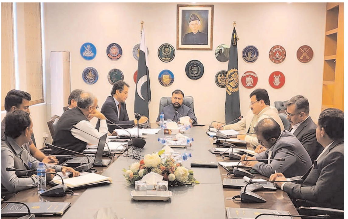
ISLAMABAD: Caretaker Federal Minister for Interior, Sarfraz Ahmad Bugti chairing meeting regarding anti smuggling measures.