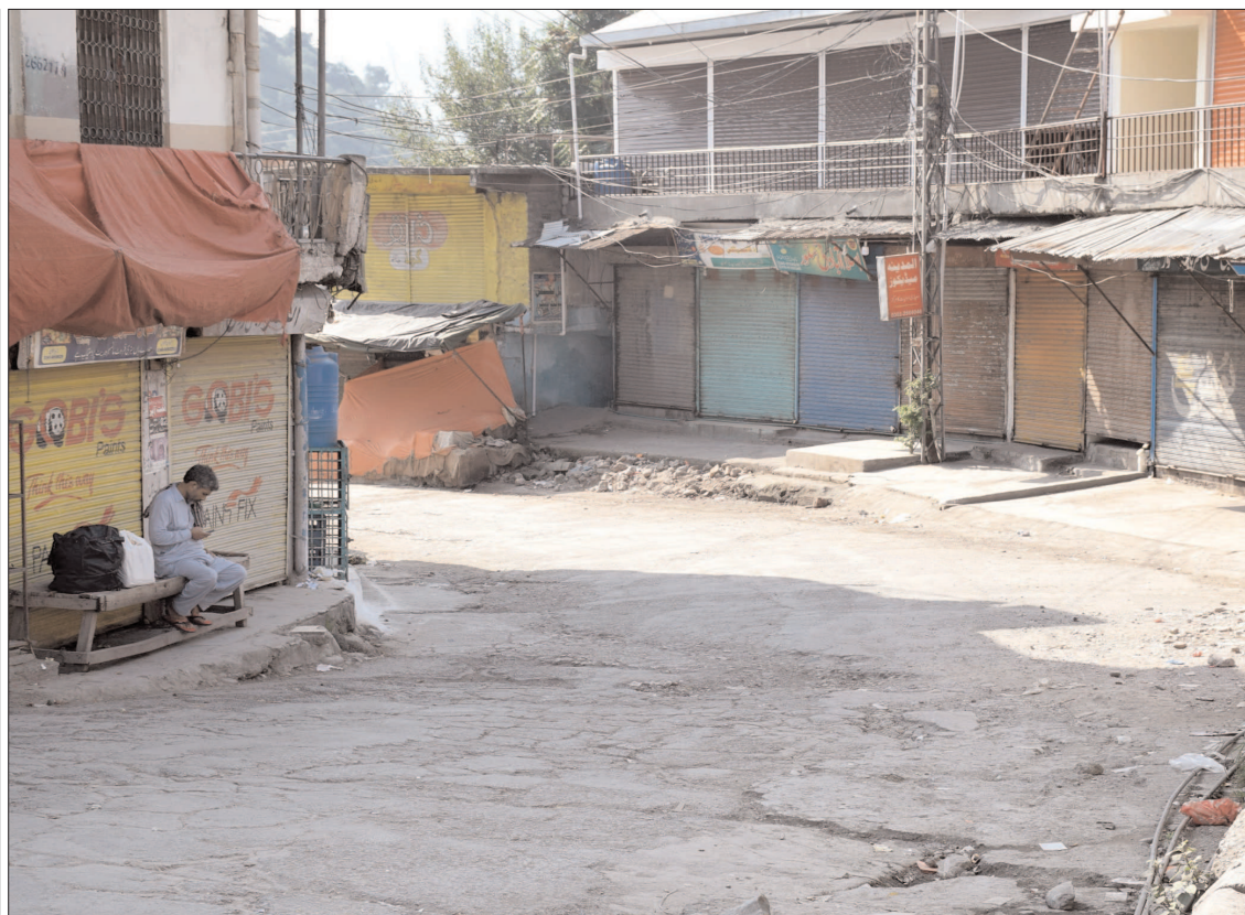
MUZAFFERABAD: A view of closed shops and markets during a protest against unjust price hike of electricity and unbearable inflation.

Because it can provide a safe space for refugees to share their experiences, express their emotions, and build a sense of community.