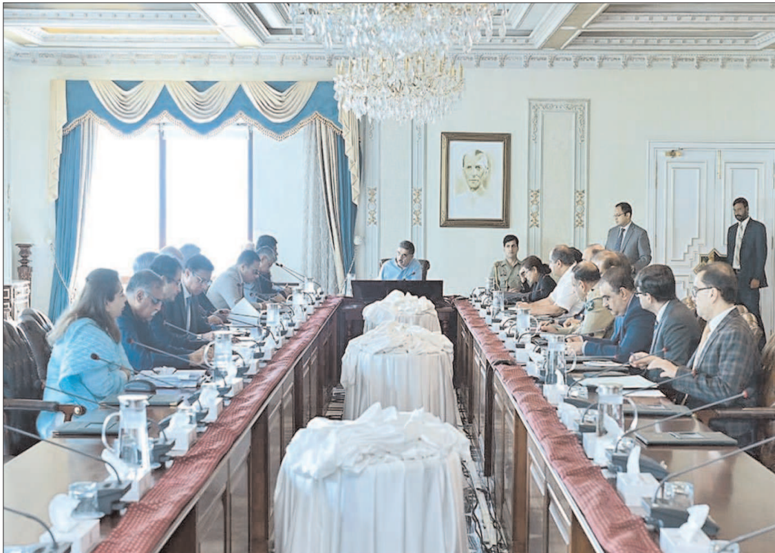
ISLAMABAD: Caretaker Prime Minister Anwaar-ul-Haq Kakar chairs a meeting on Pakistan's Economy.

The minister also eulogized the profound sacrifices by the dedicated peacekeepers in the line of duty. "These brave men and women leave behind the comfort of their homes, risking their lives to bring stability to war-torn regions", he added.