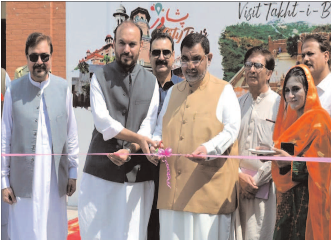
PESHAWAR: Caretaker Minister of Religious Affairs and Information Barrister Feroze Jamal Shah inaugurate Kakakhail City Tour Bus.