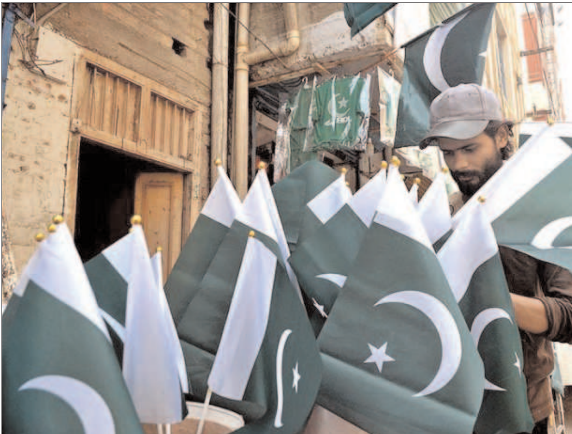
HYDERABAD: Vendor selling flags and other stuff related to Independent Day at Jail Road.