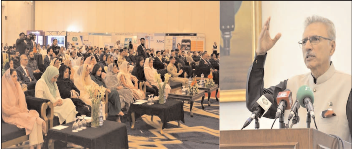
LAHORE: President Dr. Arif Alvi addressing the participants of 118th Senior Management Course and 33rd National Management Course, at the National School of Public Policy.