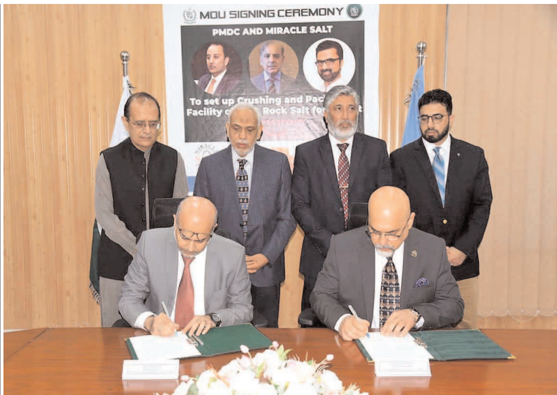
ISLAMABAD: MOU signed between Pakistan Mineral Development Corporation and Miracle Saltworks Collective Inc. for Export Quality Pink Rock Salt Crushing & Packaging facility.

"Moreover, the government disbursed Rs12,817 million under Prime Minister Youth Business and Agriculture Scheme to 23,857 farmers, which provides financial assistance and support to young farmers in agriculture entrepreneurship," he added. The official further said that recognizing the importance of farm mechanization, the government had provided Rs1,056 million to 507 farmers under the markup and risk scheme, he said adding that the initiative aimed to enhance productivity and efficiency in the agriculture sector.