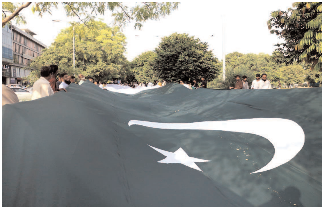
ISLAMABAD: The longest flag was displayed during the rally, organized by the Tajir Etnad Group in connection with Independence Day.

In the programme Subh Pakistan, messages of the president, prime minister, Senate chairman and National Assembly speaker will be broadcast.