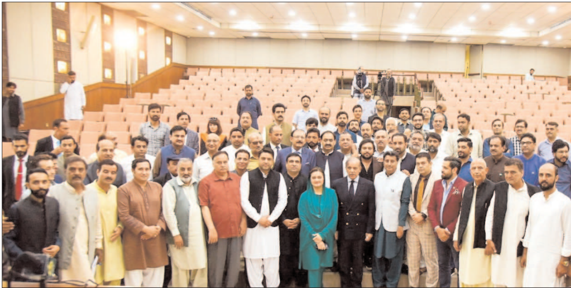
ISLAMABAD: Prime Minister Shehbaz Sharif in a group photo with Beat Reporters.