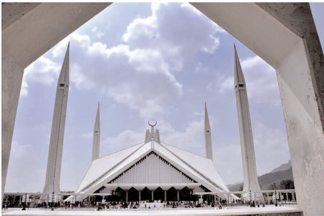
ISLAMABAD: An attractive, eye catching view of thick hovering clouds over Faisal Mosque in Federal Capital.