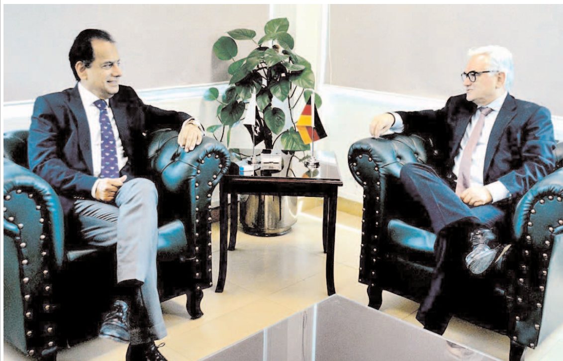
ISLAMABAD: German Ambassador to Pakistan Alfred Grannas calls on Federal Secretary Health Iftikhar Ali Shalwani, Pak-German health collaboration discussed.

The official said that First Information Reports (FIRs) were being lodged and cases were registered and sent to PR Judicial Magistrates for expeditious trial. The issue regarding illegal occupation and possession of Pakistan Railways' land by government departments and institutions has also been taken up with the concerned departments, he added. The official said PR owned 167,690 acres of land across the country, of which 90,326 acre was in Punjab, 39,428 acres in Sindh, 28,228 acres in Balochistan, and 9,708 acres in Khyber Pakhtunkhwa.