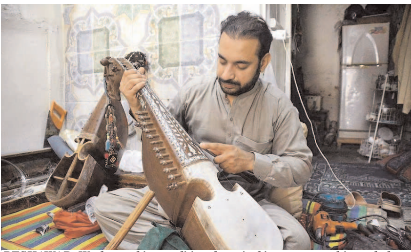
PESHAWAR: Worker making traditional musical instrument at his workplace.

KP Pakistan and also served his audience and entertained them for decades, viewed by generations, and these stories, events, happenings, and past become history that make him hero and supernatural.