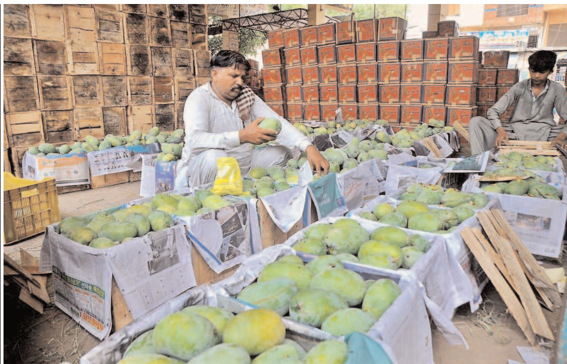
MULTAN: Labourers packing mangoes in wooden boxes at their workplace.

aspirations, laying a robust foundation for a modern economy. Ambassador emphasized that the theme of the forum Innovation Creates the Future, Cooperation Leads to Win-Win Development resonates deeply with our pursuit of moving towards a digital era through scientific excellence, achievements, and cooperation. I am delighted to share that tomorrow we would be signing an MoU on the establishment of its sub-center in Pakistan which we hope could serve as a bridge for uniting governments, private sector, and academia for collaboration in digital fields.