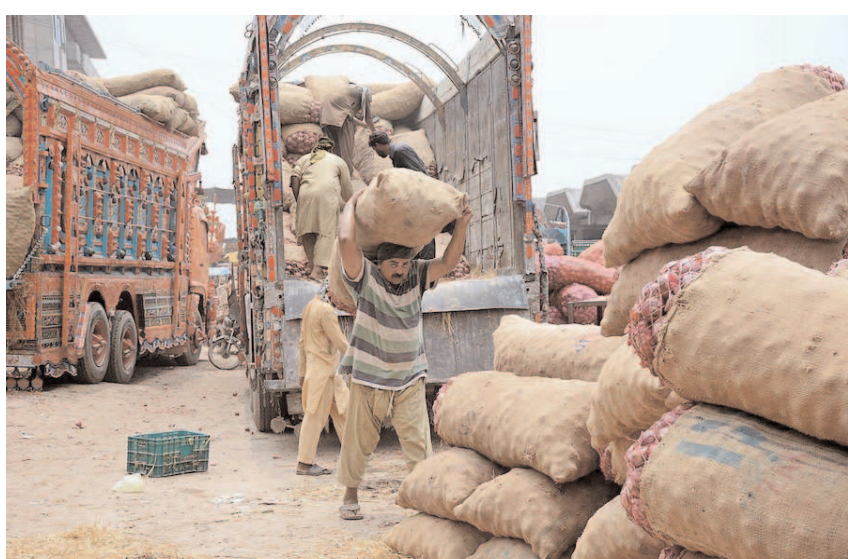
FAISALABAD: Labourers unloading sacks of onion from delivery truck at vegetable market.

country's electricity production but also help save billions of US dollars that Pakistan was currently spending for running other sources of energy. There is a need for both educating the government on such feasible, reliable and cheaper options, and also increasing awareness amongst the common masses. PCJCCI Senior Vice President Fang Yulong was of the view that energy played a significant role in running the economic engine of a country. "The more energy Pakistan produces and effectively uses, the more it protects its economy from fragility and the more it has the chances to prosper. Thus, with national awareness and consistent functioning of Pakistan's NPPs, the country can surely save more money and energy," he observed.