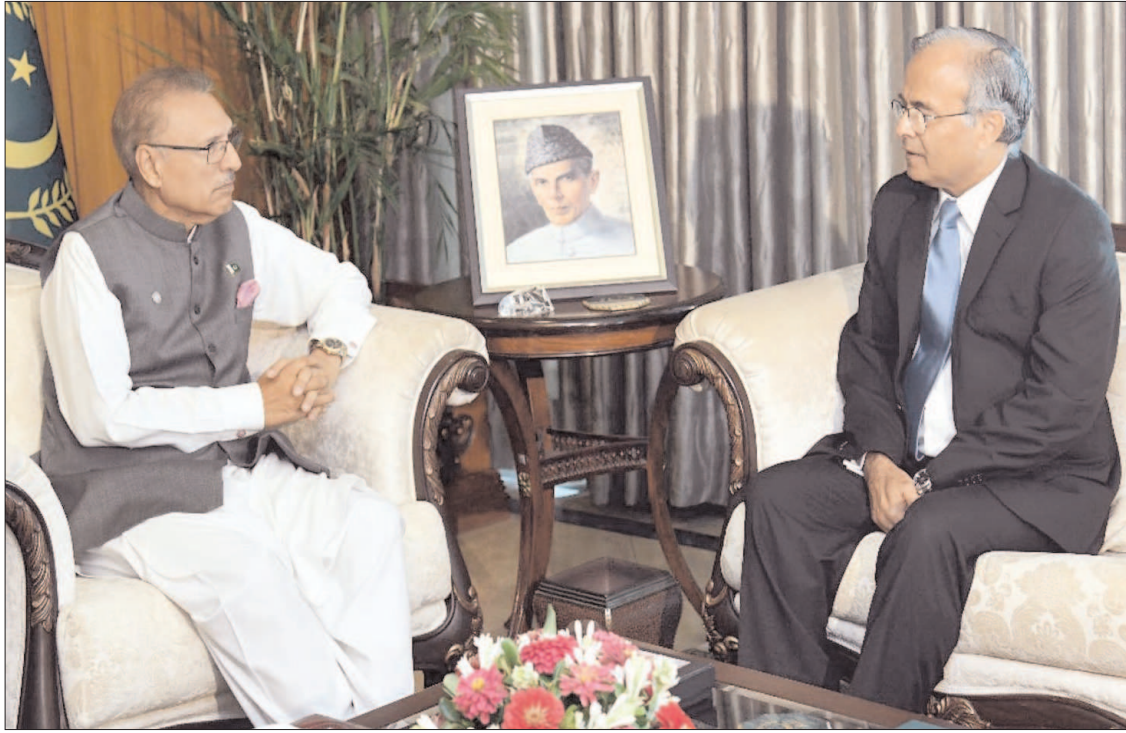
ISLAMABAD: Secretary Foreign Affairs, Asad Majeed Khan, paid a farewell call on President Dr. Arif Alvi, at Aiwan-e-Sadr.

He appreciated the services of the outgoing foreign secretary for promoting Pakistan's stance on different matters. President Alvi also lauded the foreign secretary's professional competence and initiatives on the diplomatic fronts. He also expressed good wishes for Dr Asad Majeed Khan for his post-retirement life.