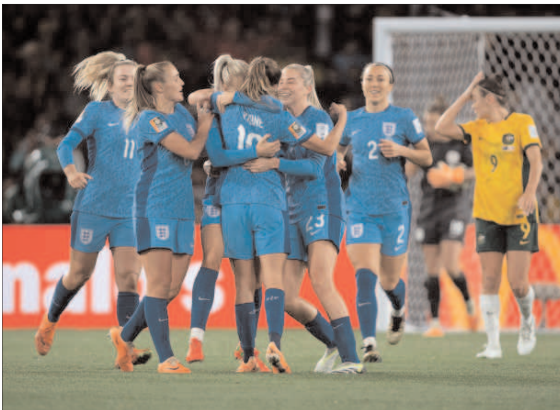
SYDNEY: the players of England celebrate after winning the FIFA Women's World Cup Australia & New Zealand 2023 Semi Final match between Australia and England at Stadium Australia.