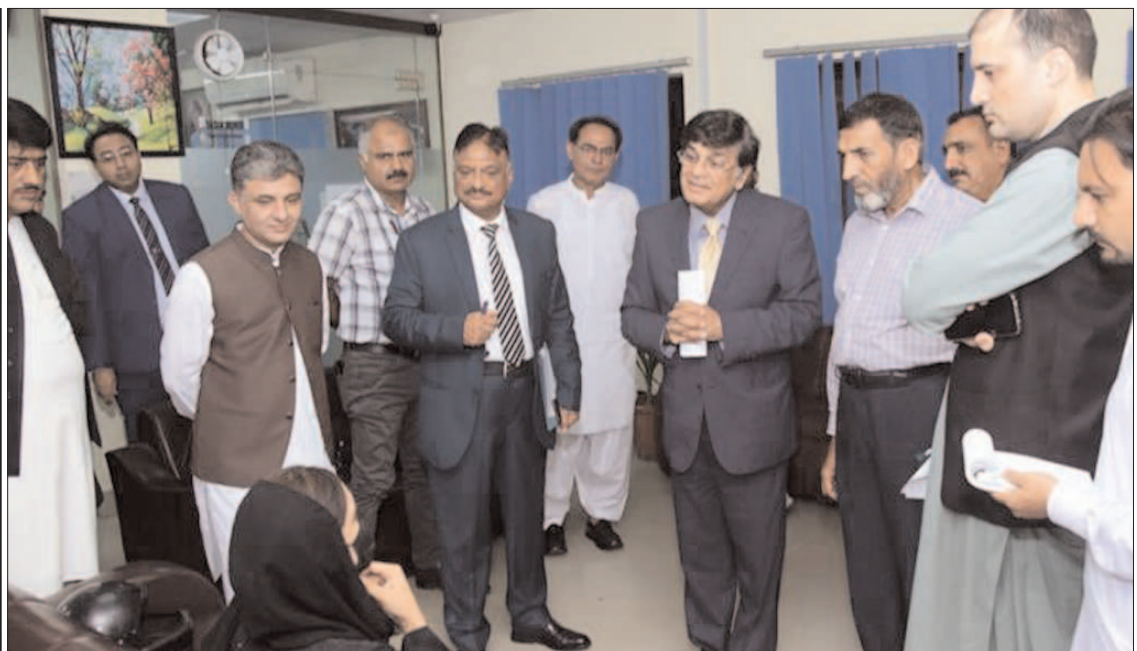
ISLAMABAD: Federal Ombudsman (Wafaqi Mohtasib ) inspection committee members meeting with the customers during their inspection visit of FGEHA.