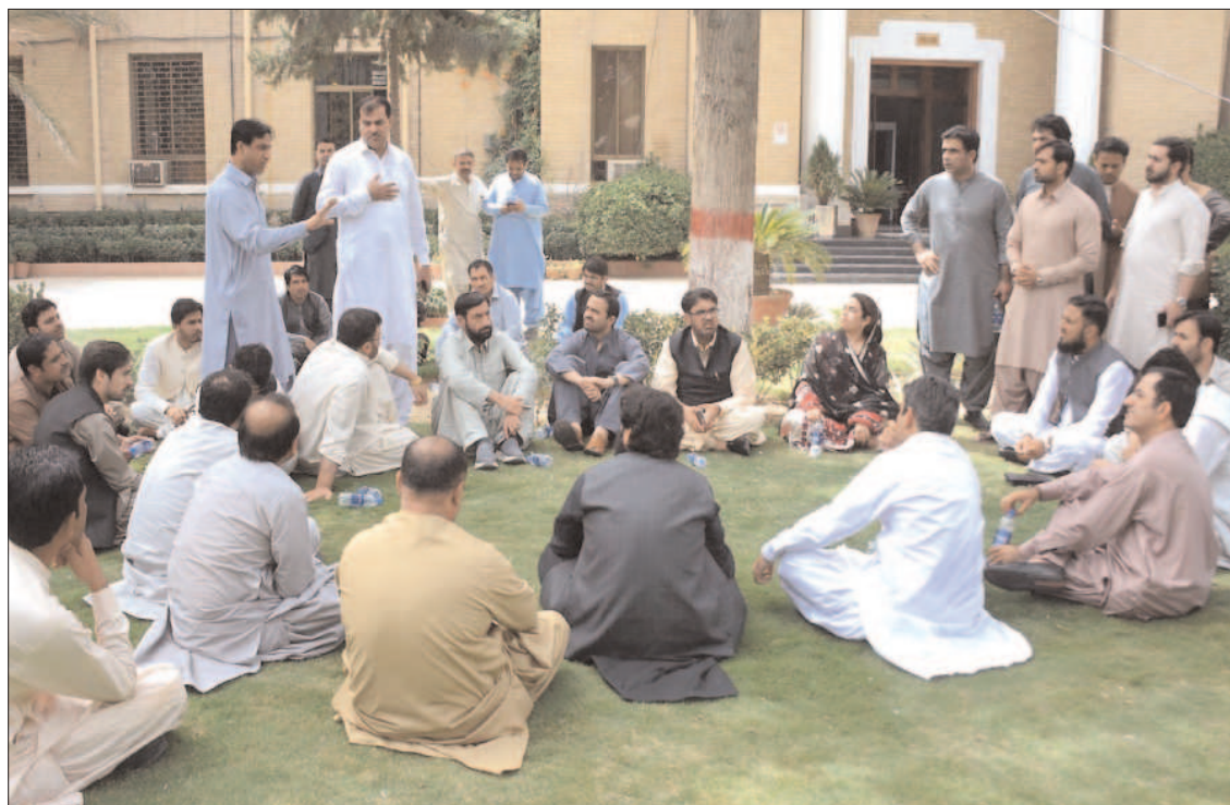
QUETTA: Activists of BCS Officers Action Committee holding a protest in front of Chief Secretary Office.