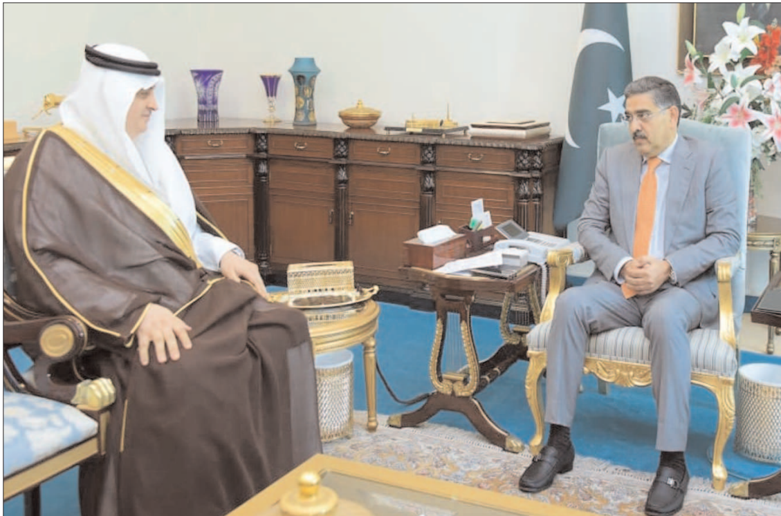
ISLAMABAD: Ambassador of Saudi Arabia, Nawaf Bin Saeed Al-Maliki meeting with Caretaker Prime Minister Anwaar-ul-Haq Kakar.

It is feared that the passage of the new census could delay elections due to new delimitations, which require an amendment to the constitution.