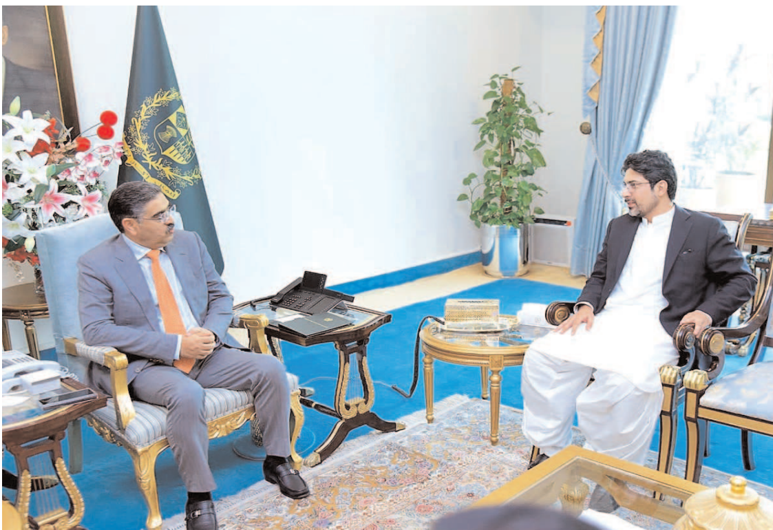
ISLAMABAD: Former Senator Saif Magsi calls on Caretaker Prime Minister Anwaar-ul-Haq Kakar.

RAWALPINDI (APP): The communication teams of Rawalpindi Waste Management Company (RWMC) have carried out its cleanliness and anti-smog awareness campaign in the area of Union Council-16 Mohalla Raja Sultan here on Wednesday. According to RWMC spokesman, the teams asked the residents of the area to play their part in educating the people about the importance of cleanliness. He said the objective of the activity was to reach out to a maximum number of people, to educate the general public about the precautionary measures to avoid smog. The teams also distributed waste bags and leaflets among the people to educate them about the importance of cleanliness. In a message, RWMC has appealed to the people to not burn waste and chemicals in the open as they were the major cause of smog, adding burning garbage was a legal offence as smoke and dust contributed to smog which was harmful to the environment and human health. The teams also asked the resident to ensure the spraying of water to prevent dust and use masks and glasses.