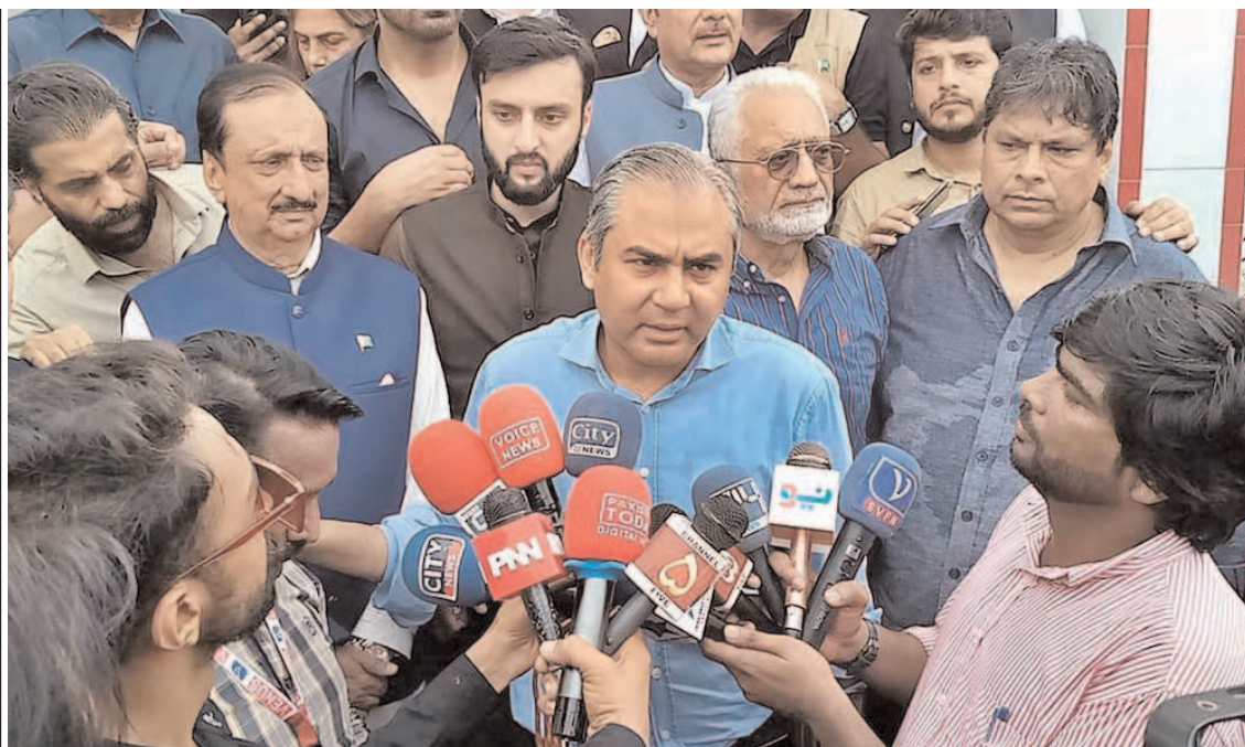
FAISALABAD: Punjab Chief Minister Syed Mohsin Naqvi talking to media after visiting Danish School Camp regarding incident Christian Colony Jaranwala.

The police handed over the body to relatives for burial after completing formalities, he added.