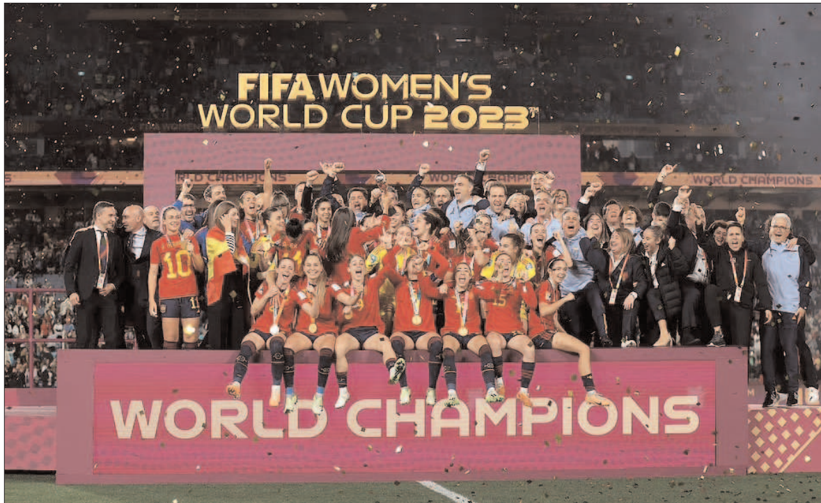
SYDNEY: Players of Spain celebrate the champion with teammates during award ceremony of the FIFA Women's World Cup.