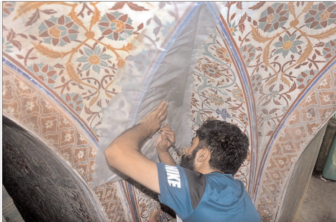
LAHORE: An artisan is deeply engrossed in creating intricate glass cutwork on the wall of the historic Anna Masjid.