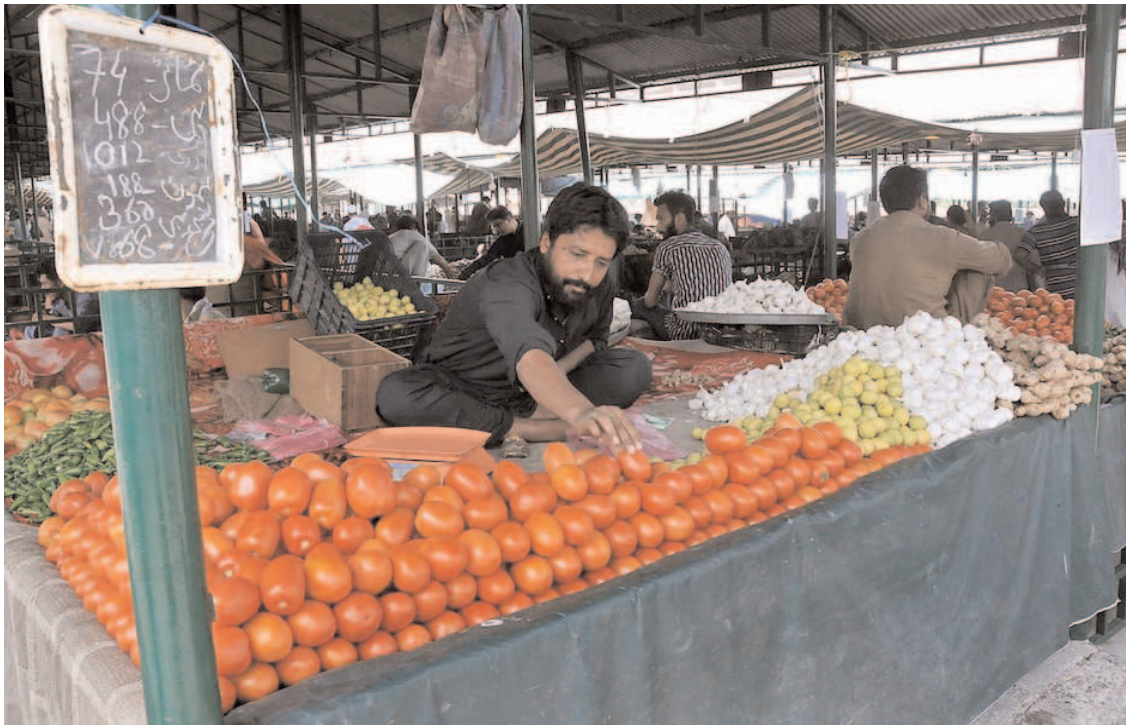
ISLAMABAD: A vendor selling vegetables on his stall at Sunday Bazaar Ahpara Market.

The sector alone can drag the economy down to an abyss unless it is resolved. And for that to happen, nothing short of deregulation and privatization will work, as successive governments have used the energy sector for their political gains by taking decisions that have resulted in unabated rise of circular debt.