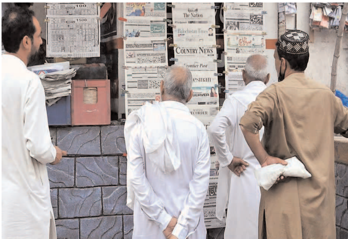
ISLAMABAD: People are reading a newspaper displayed for sale by a shopkeeper at Abpara Market.