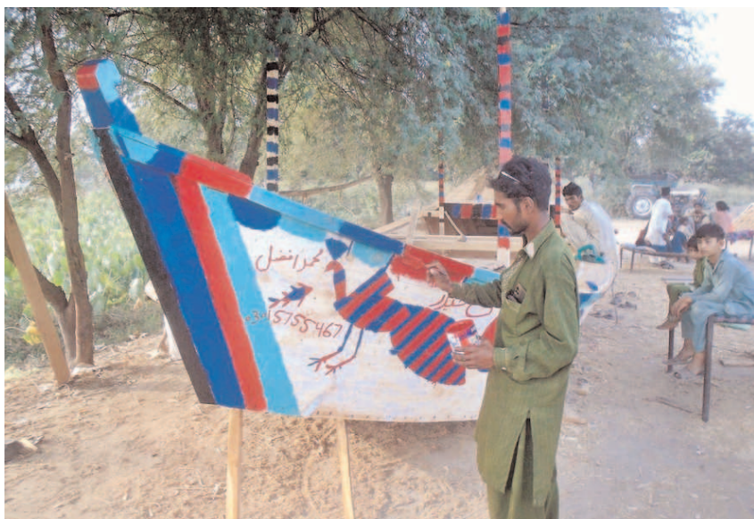
CHINIOT: Workers busy in painting on boat at bank of River Chenab.

Meanwhile, official sources said that rescue and relief camps had been set up in areas lying near banks of Sutlej river so that emergency aid could be extended to people if they were affected by flood like situation.