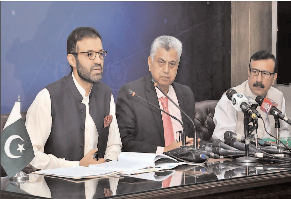
ISLAMABAD: Federal Law Minister Ahmed Irfan Aslam and Information Minister Murtaza Solangi addressing an important press conference at PID Media Center.

Yesterday, former foreign minister and Vice Chairman of Pakistan Tehreek-e-Insaf Shah Mahmood Qureshi was also arrested in Islamabad as part of the ongoing investigation into the cipher inquiry case by the Federal Investigation Agency.