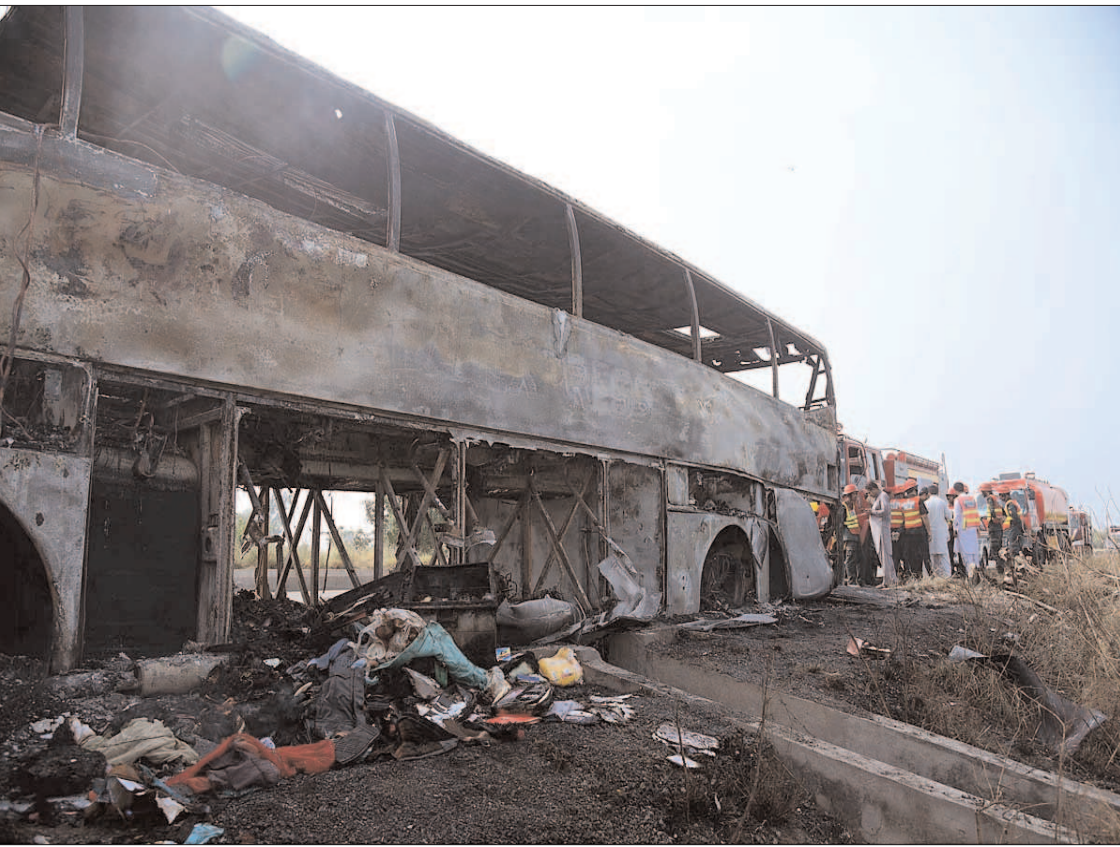
SARGODHA: A view of burned bus after incidence while twenty people were killed when a passenger bus caught fire after being smashed into a pick-up carrying diesel drums at Motorway near Pindi Bhattian.

LAHORE (NNI): Jamaat-e-Islami (JI) Chief Sirajul Haq indicated to go to Supreme Court of Pakistan against the Election Commission of Pakistan (ECP) for not announcing the election's date. Addressing a press conference, Sirajul Haq said that even to date the Election Commission has not announced the date of the elections and this act of the Commission is a violation of the constitution. Siraj also demanded the Election Commission to conduct transparent elections alleging that the previous governments used the Election Commission only for their own interests. Sirajul Haq alleged that PDM and PPP conspired to postpone the election adding the Election Commission should reconsider its decision and announce immediate elections, the caretaker government should conduct transparent elections instead of jumping around.