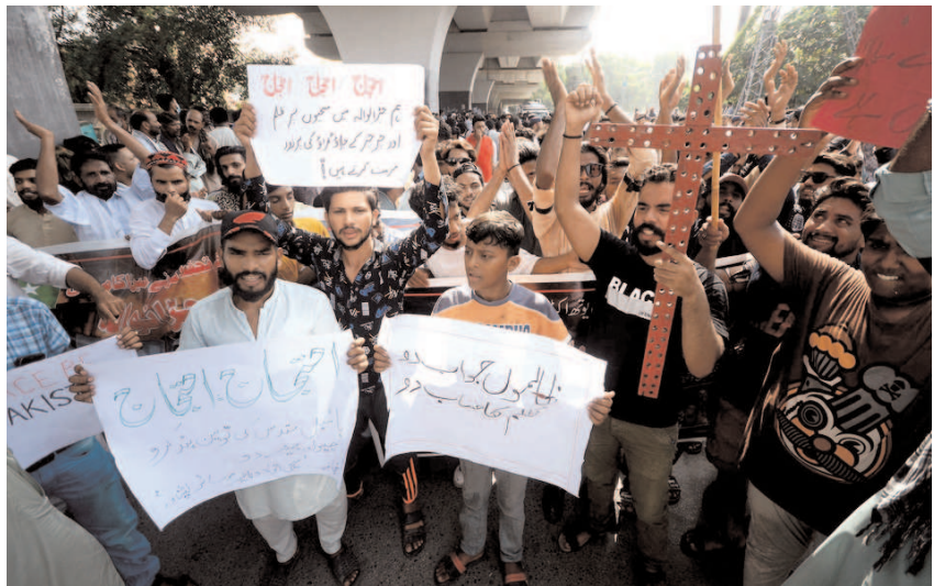
PESHAWAR: Supporters of National Christian Party hold a demonstration condemning recent attack on Christian.