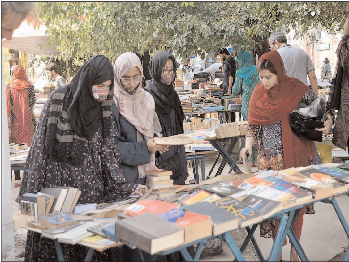
LAHORE: Customers are buying secondhand books from a roadside stall.

KUST has flourished academically because of his vision and actions in all the dimensions where a dozen market oriented programs started and new department(s) have been established offering admissions in BS, MS and PhD level programs with good research teaching and learning facilities for students and faculty members. The enrolment of the university has also increased to a good number because of his efforts for academic uplift of the university and currently the campus has more than 8000 registered students.