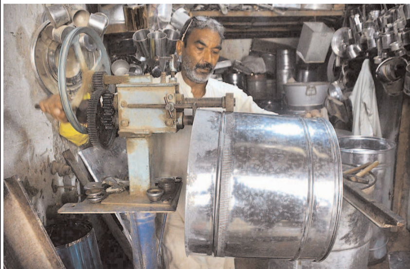
PESHAWAR: Blacksmiths making water storage drums at his workplace near Sheikhabad.