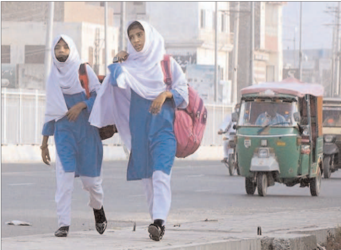
MULTAN: Students going back to school after summer vacations.