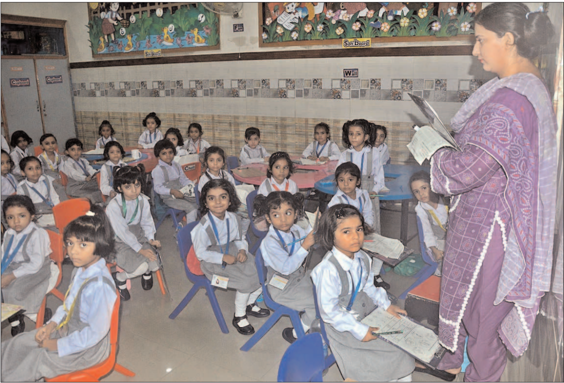
LAHORE: Students are attending class on the first day after summer vacations.

He said that citizens can complain regarding food safety issues, adulteration mafia and unhygienic food points on the 1223 helpline number of PFA, website or PFA Facebook account.