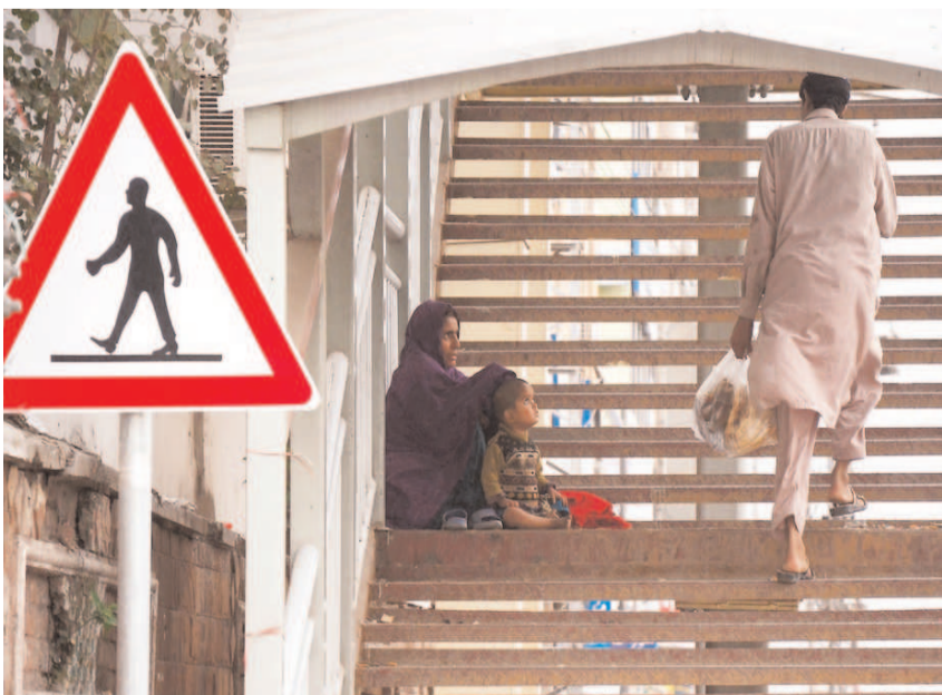
PESHAWAR: Beggar woman alongwith her child sitting on pedestrian bridge stairs while asking for some mercy.

PESHAWAR (APP): The Peshawar Electrical Supply Company (PESCO) on Monday notified power suspension schedule of various grid stations of the province due to maintenance work on August 22 (Tuesday) as follows: 132 KV Jamrud Grid Station from 7 a.m. to 12 p.m., affecting consumers of 11 KV Gull Abad feeders. 132 KV Warsak Power House from 8 a.m. to 6 p.m., affecting consumer of 132 KV New Warsk, Peshawar Cantt, Regi Model Town, Jamrud, and Sakhi Chashma Grid connected 11 KV feeders. 132 KV Peshawar University Grid Station from 7 a.m. to 12 p.m., affecting consumers of 11 KV Malakandher, Engineering, Regi, Taja Abad, Tajabad 2, Mera Achini, HMC, Ring Road, Danish Abad, Gharib Abad, Rahat Abad 1, CMB, Abdara, Achini 1, HBK, Regi, DHA, Askari 6, Abdulrazak, Pawakay and Commercial Baling feeders. 132 KV Mansehra Grid Station from 7 a.m. to 12 p.m., affecting consumers of 11 KV Ghazikot, Ahsan Shaheed, City 1,2, Qalandar Abad, Attar Shesha, Shaheen Shaheed, Lasin Nawab, Muradpur, Khaki and Shankiyari feeders.