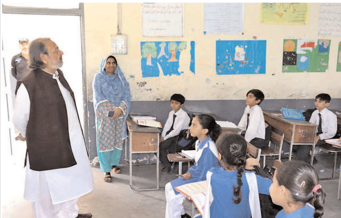
ISLAMABAD: Caretaker Federal Minister for Education and Professional Training Madad Ali Sindhi conducted a surprise visit to Islamabad Model School F-6/3.

The ambassador shared he was pretty hopeful and optimistic in regard to the future of the bilateral ties between Korea and Pakistan. The winners from both the Vocal and Dance categories were encouraged by gift prizes. The attendees also received gift hampers from the Embassy of the Republic of Korea.