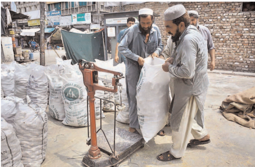
PESHAWAR: Laborers busy in packing sacks of Gur at Gur Mandi.