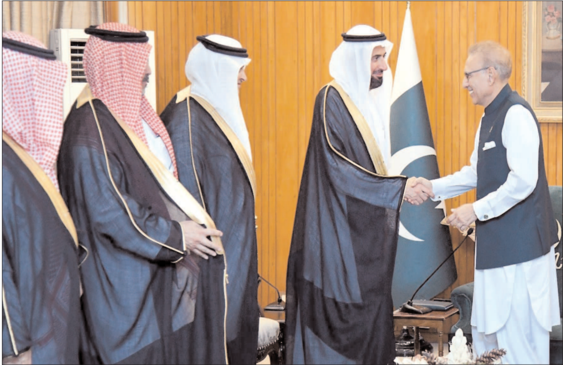
ISLAMABAD: President Dr. Arif Alvi welcoming Saudi Minister for Hajj and Umrah, Dr. Tawfiq bin Fawzan Al-Rabiah, who called him, at Aiwan-e-Sadr.