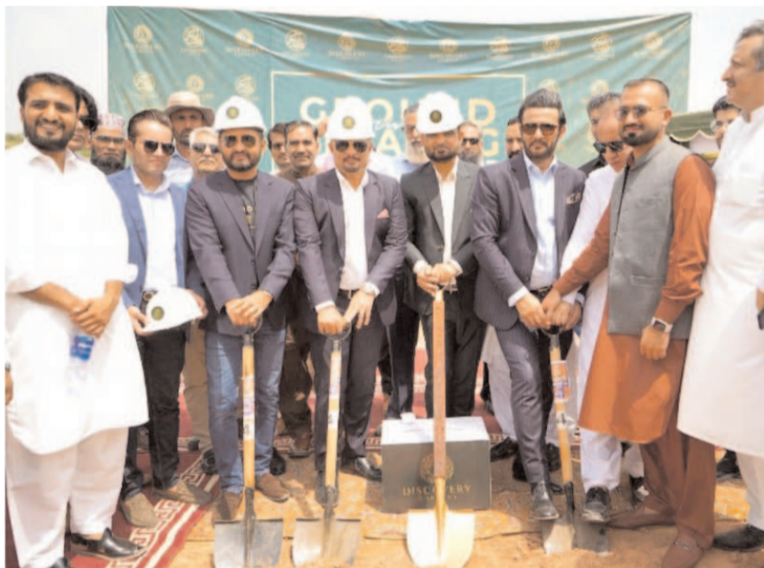
This event took place at a local hotel in Islamabad