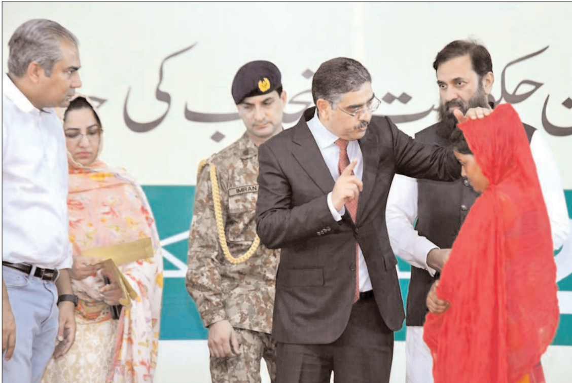
FAISALABAD: Caretaker Prime Minister Anwaar-ul-Haq Kakar distributing cheques of Rs. 2 million each among the members of Christian community whose houses were destroyed in mob violence.