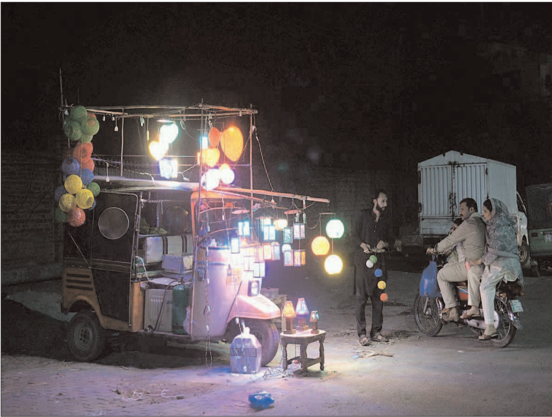
LAHORE: A young man selling beautiful fancy bright decorated lightning lamps on his rickshaw.