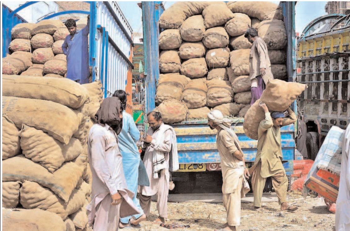
HYDERABAD: Labourers busy in unloading potatoes bags on delivery track at vegetables market.

It is notable that in this regard a Request for Proposal (RFP) has also been issued to the financial experts and Consulting Firms to develop comprehensive and innovative model, specifically tailored to address the unique challenges of Manufacturing SMEs.