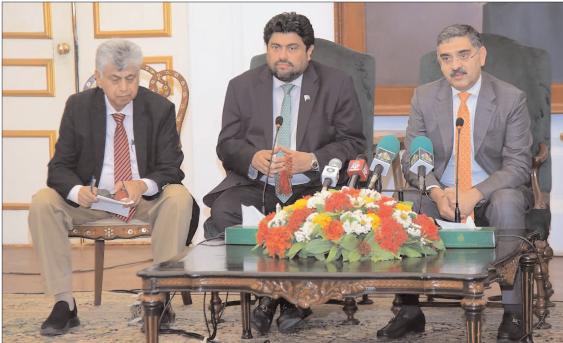
KARACHI: Caretaker Prime Minister Anwaar-ul-Haq Kakar addressing a press conference along with Governor Sindh Kamran Tessori and others.