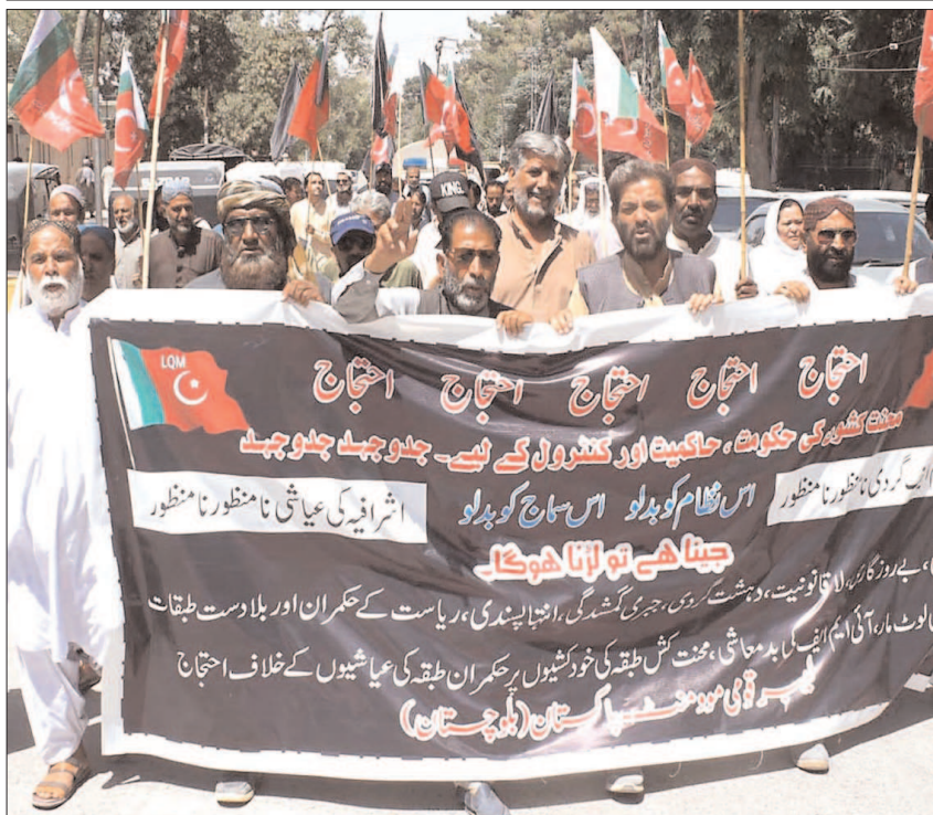
QUETTA: Activities of Labours Qumi Movement Balochistan holding a protest rally for acceptance of their demands.

He said that during hearings, he was informed by the focal persons of the federal government agencies/departments that the provincial governments had to pay outstanding dues to them. He urged the provincial governments to ensure payment of outstanding dues to the federal government agencies/departments so that they could overcome their financial issues. "The payment of the outstanding dues to the federal government departments by the provincial government would help in payment of pensions and dues of the employees besides resolving other issues," he said.