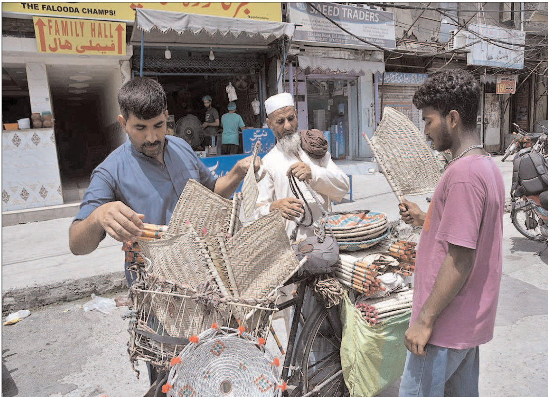
LAHORE: An elderly vendor selling hand fans to customers on his bicycle to earn livelihood in Provincial Capital.