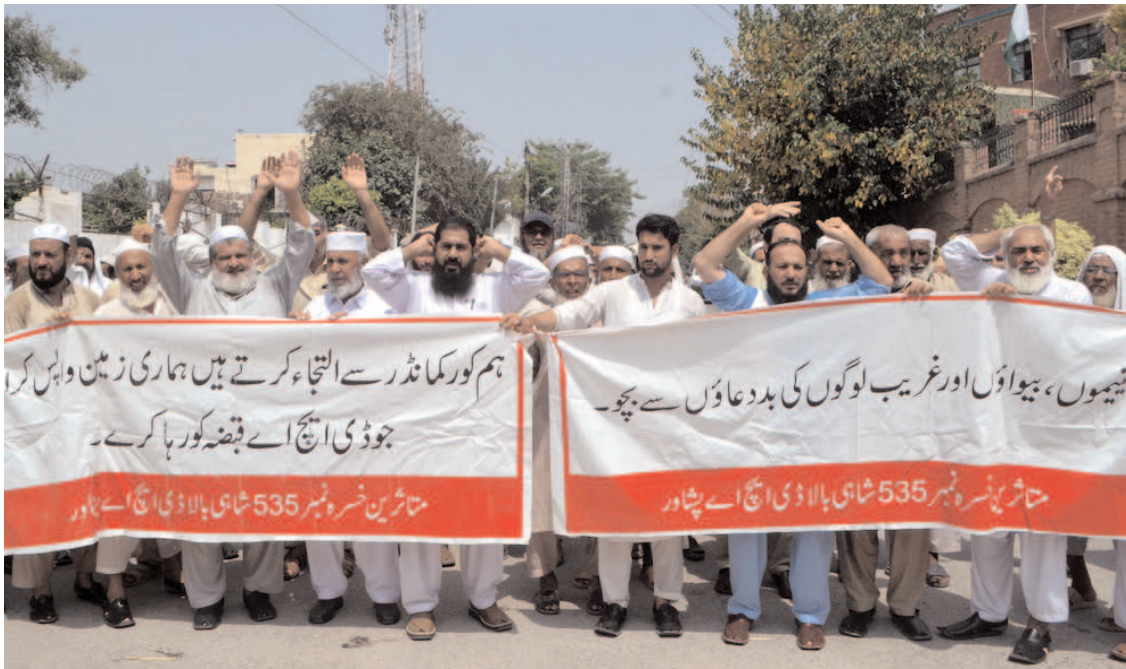
PESHAWAR: Residents of Shahi Bala holds placards during a protest in favour of their demands.