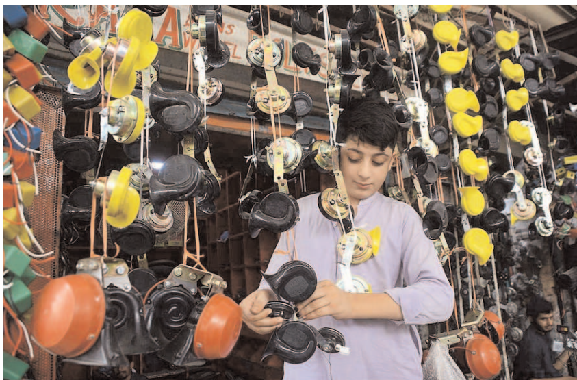
PESHAWAR: A young vendor displaying pressure horns to attract customers at his shop in Shoba Bazaar.