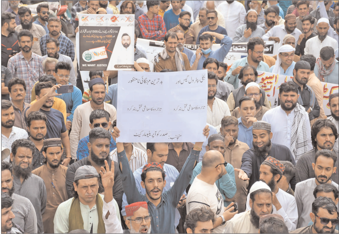
KARACHI: Traders chanting slogans as they protest against rising inflation in Provincial Capital.