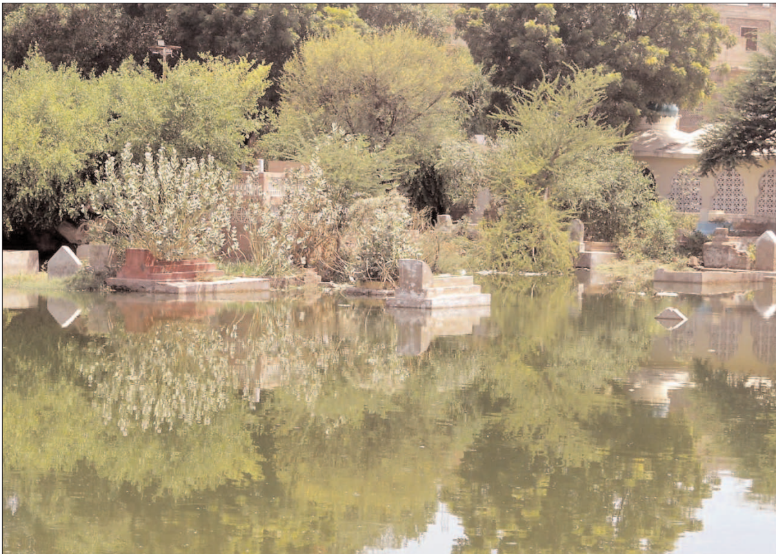
HYDERABAD: A view of graves in Lalulashari graveyard submerged with knee deep sewerage water showing negligence of civic bodies.