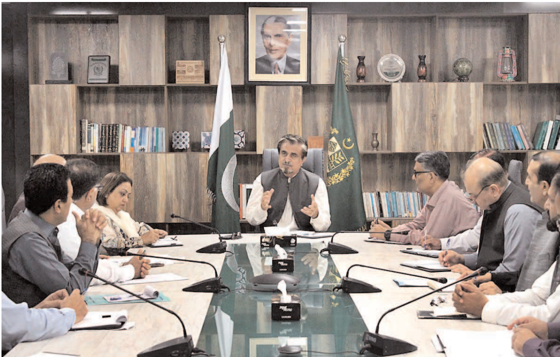
ISLAMABAD: Caretaker Federal Minister for National Heritage and Culture Syed Jamal Shah directed all the cultural and literary organizations of National Heritage and Culture Division to plan special programs to pay tribute to National heroes on Pakistan Defence Day to be observed on September 6.