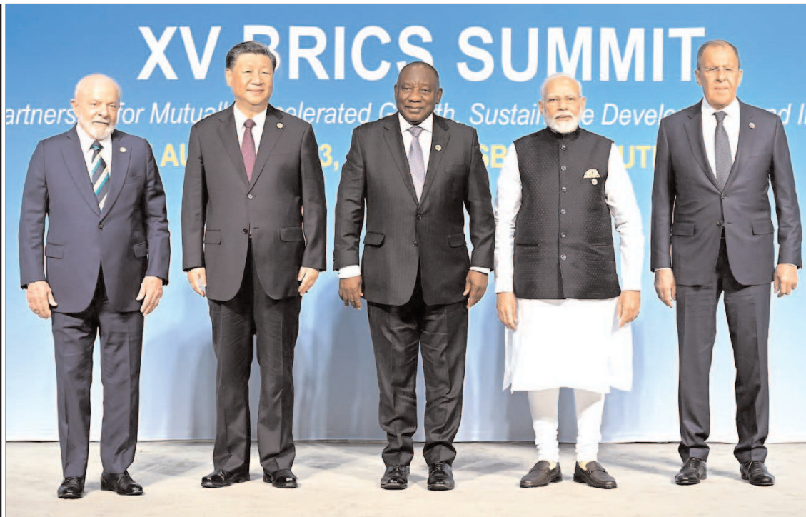
JOHANNESBURG: A group photo of Chinese President Xi Jinping, South Africa President Cyril Ramaphosa, Brazilian president Luiz Lula De Silva, Indian Prime Minister Narendra Modi and Russian Foreign Minister Sergiy Lavrov during 15th session of Heads of Member State of BRICS.