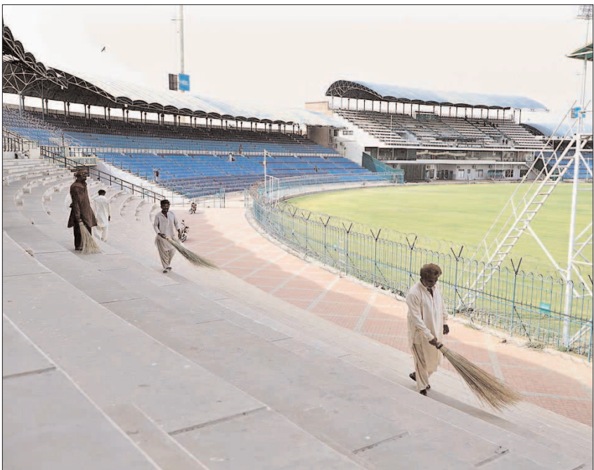
MULTAN: MPMC workers are busy in cleaning & washing enclosures for the upcoming first match of the Asia Cup 2023 tournament opener between Pakistan and Nepal on 30 August.