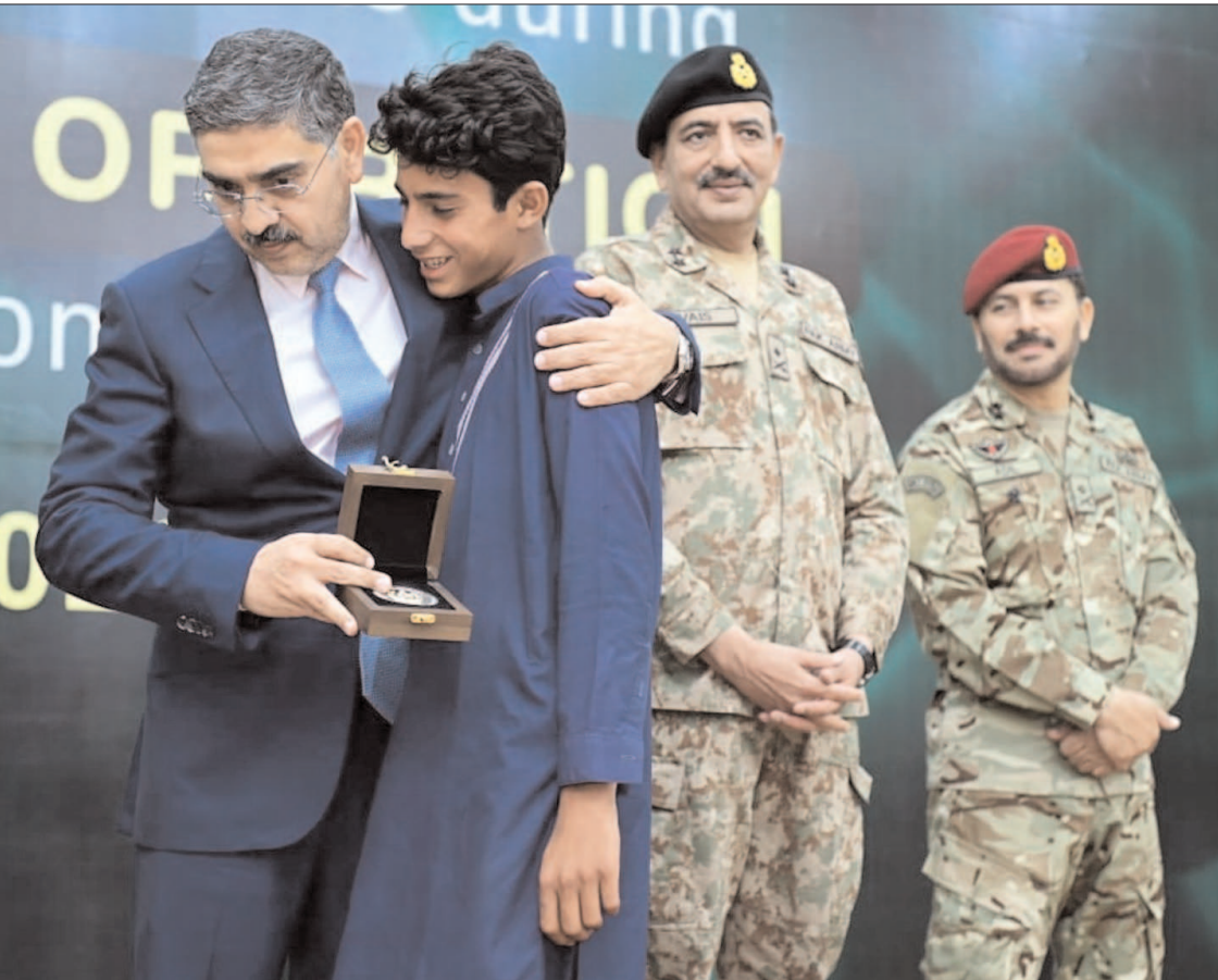
ISLAMABAD: Caretaker Prime Minister Anwaar-ul-Haq Kakar awarding survivors of Battagram chairlift incident for their bravery at a ceremony.

The ministers expressed the resolve during a meeting held here at the Ministry of Interior. Upon arrival at the Ministry, the minister for interior accorded warm welcome to Muratuz Solangi. During the meeting, both the ministers discussed matters related to the assistance of the ECP in conducting the general elections in the country.