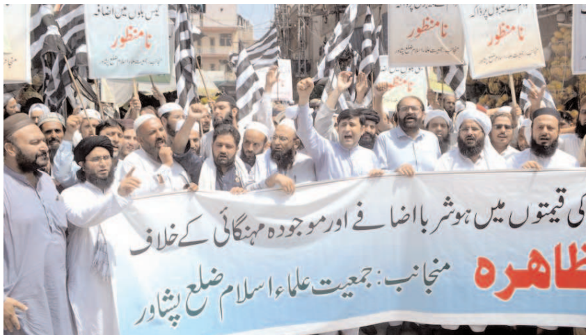
PESHAWAR: Members of Jamaat-e-Islami (F) chanting slogans during a protesting against inflated electricity bills.