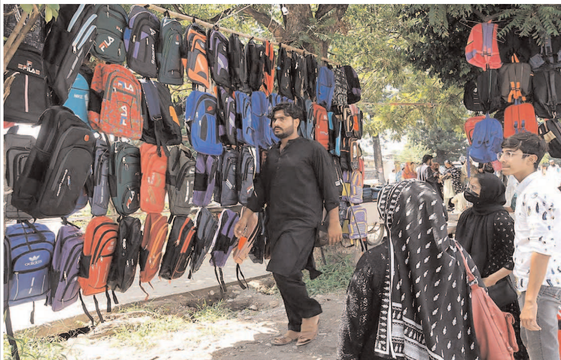
ISLAMABAD: A woman along with her children busy in selecting and purchasing school bags from vendor at Sunday Bazaar in Federal Capital.