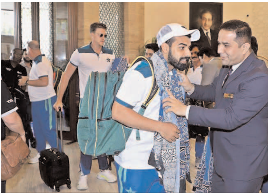
MULTAN: Pakistan cricket team arrived for the upcoming First match of Asia Cup 2023 between Pakistan and Nepal teams at Multan Cricket Stadium.

LAHORE (Monitoring Desk): Pakistan Cricket Board (PCB) will launch the national team's new kit for ODI World Cup 2023 tomorrow (Monday). PCB Chairman Zaka Ashraf will unveil the World Cup kit at an event in Lahore. The World Cup commences on Thursday, 5 October when 2019 finalists England and New Zealand clash at Narendra Modi Stadium in Ahmedabad, with the event culminating in the final at the same venue on Sunday, 19 November. Earlier this month, the International Cricket Council (ICC) announced change in the World Cup matches, including the eagerly-awaited contest between India and Pakistan.