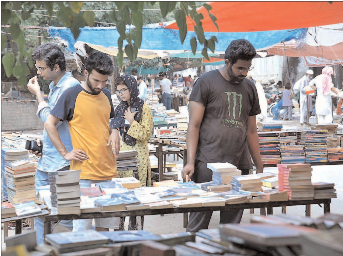
LAHORE: Book lovers selecting old books on a roadside stall in the city.

The tempting sale offers on the fake online shopping sites are attracting buyers like me and the relevant authorities must take action against these website owners who are looting the customers, he insisted.