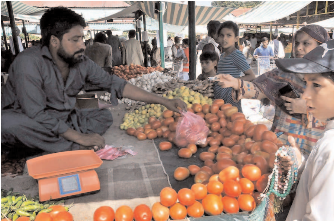
ISLAMABAD: People busy in purchasing vegetables from vendor at Sunday Bazaar.

Education and skills development programs could be established to empower African youth, leading to sustainable development, she added.