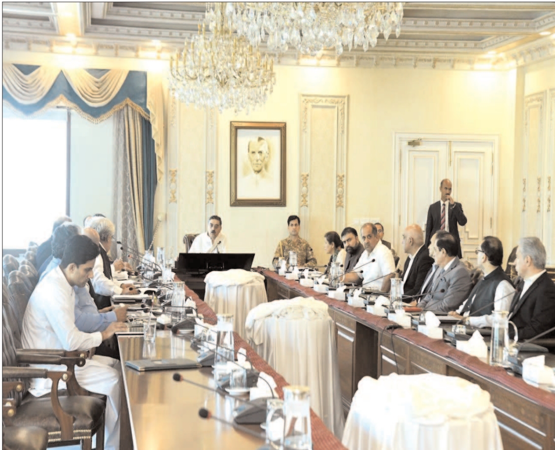
ISLAMABAD: Caretaker Prime Minister Anwaar-ul-Haq Kakar chairing an emergency meeting regarding electricity bills at the Prime Minister's House Islamabad.

The prime minister assured them to address the lingering issues faced by the residents of the province.