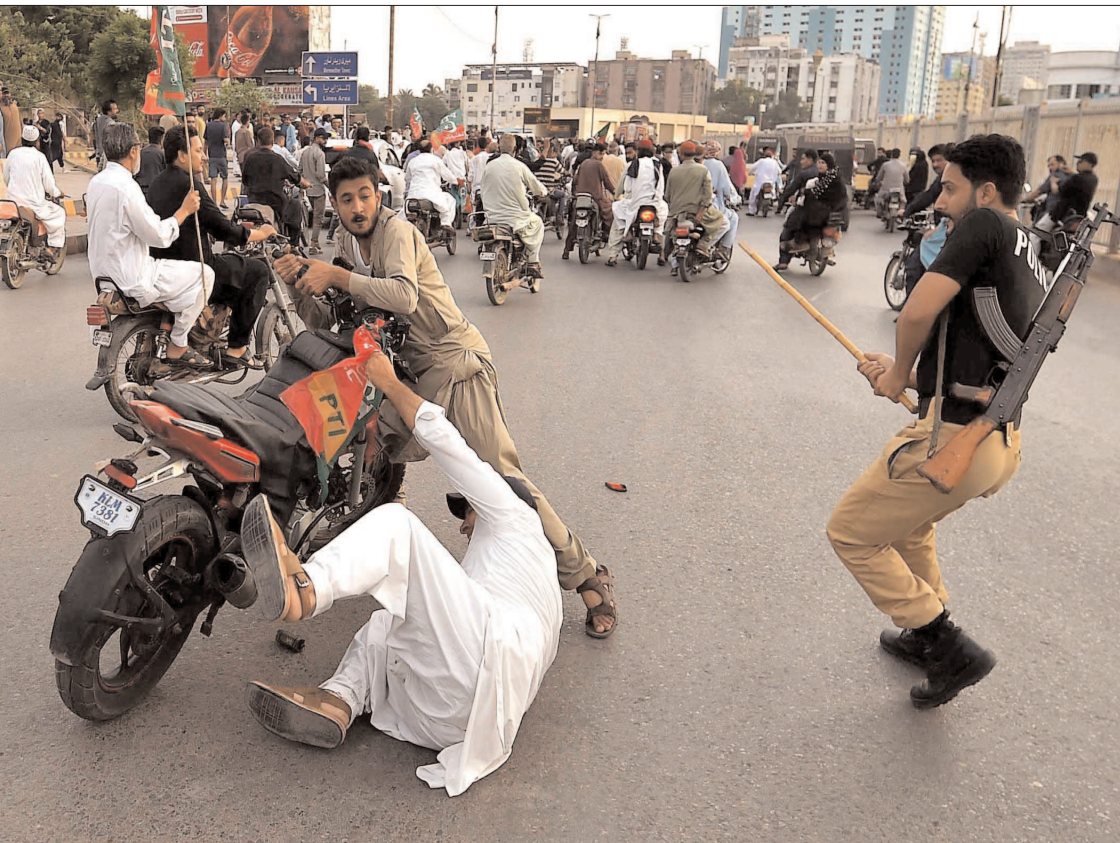
KARACHI: Police personnel arresting PTI supporters during a protest in favor of former Prime Minister Imran Khan at Nomaish Chorangi.

"Delimitation of new constituencies inevitable after the new census," he said. Speaking on the occasion, party leader Dr Farooq Sattar lashed out at the rulers on inflated power bills and rising inflation. "People are becoming rebels and this country is heading towards civil disobedience," he added. If this trend continues, a "state within a state" will be created, he continued.