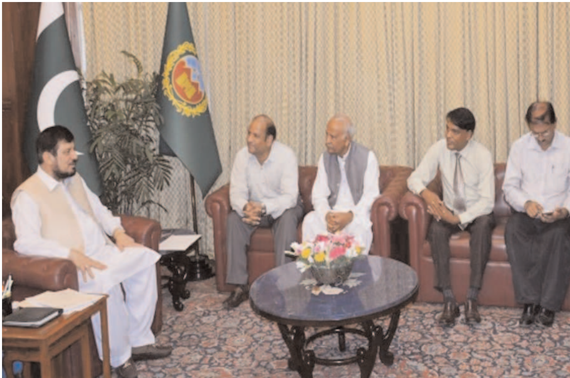
PESHAWAR: Delegation led by Priest Rauff Masih of Seventh Day Adventist Church meeting with Governor Khyber Pakhtunkhwa Haji Ghulam Ali at Governor's House.

The delegation expressed gratitude to the Governor for his willingness to address their concerns and offer cooperation in finding solutions. They also commended the steps taken by the Governor for promoting education in the province.