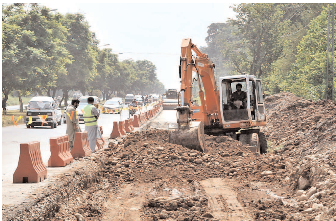
ISLAMABAD: Heavy machinery being used for expansion work of Club Road during development work in Federal Capital.

He said, "If you are strong, your commander will be strong. You represent an excellent force. Treat your uniform as your pride and wear it with honor." The gathering concluded with a group photo, highlighting unity among the officers and Jawans.