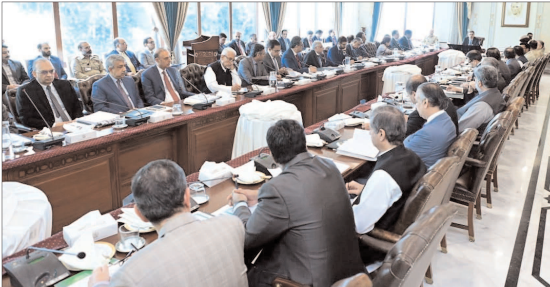
ISLAMABAD: Caretaker Prime Minister Anwaar-ul-Haq Kakar chairing the 4th apex committee meeting of the Special Investment Facilitation Council.