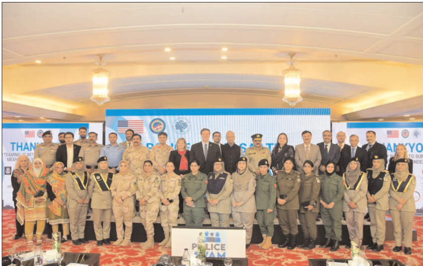
ISLAMABAD: The United States Institute of Peace (USIP), in collaboration with the U.S. Embassy's Office of International Narcotics and Law Enforcement (INLE), proudly announces the successful culmination of the three-year $3.5 million Police Awam Saath Saath Program.