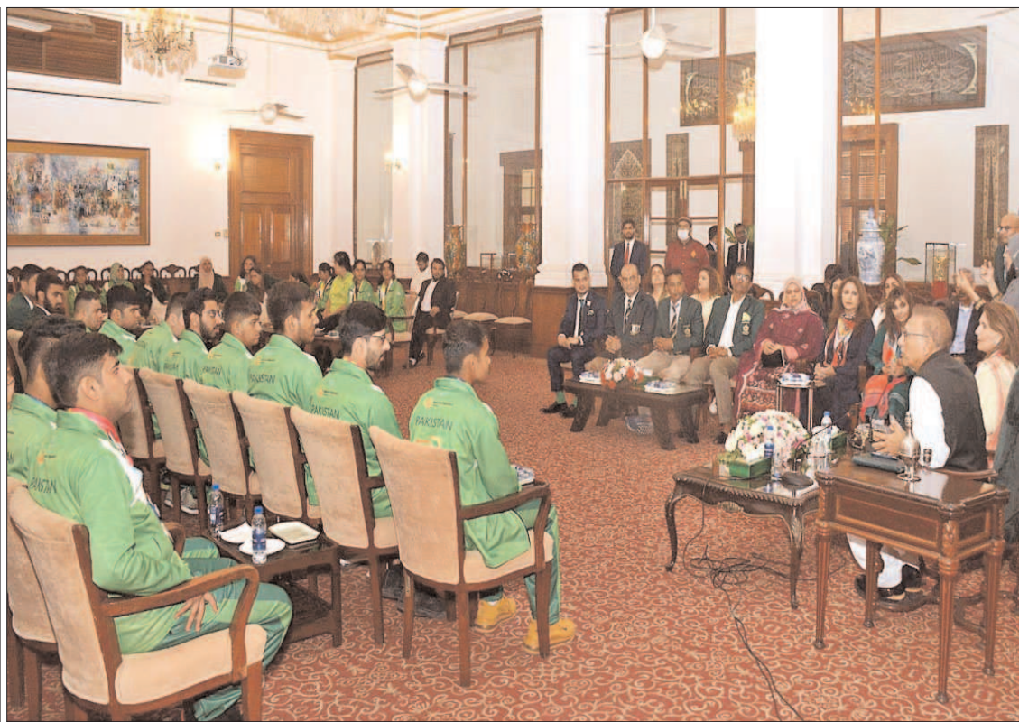
KARACHI: President Dr. Arif Alvi, accompanied by the Begum Samina Arif Alvi, speaking at an interactive session with Special Olympics Pakistan delegation World Summer Games Berlin 2023 at Governor House.

All-rounder James Neesham has withdrawn from the Twenty 20 squad for the series against England, which starts Wednesday, to return home ahead of the birth of his first child.