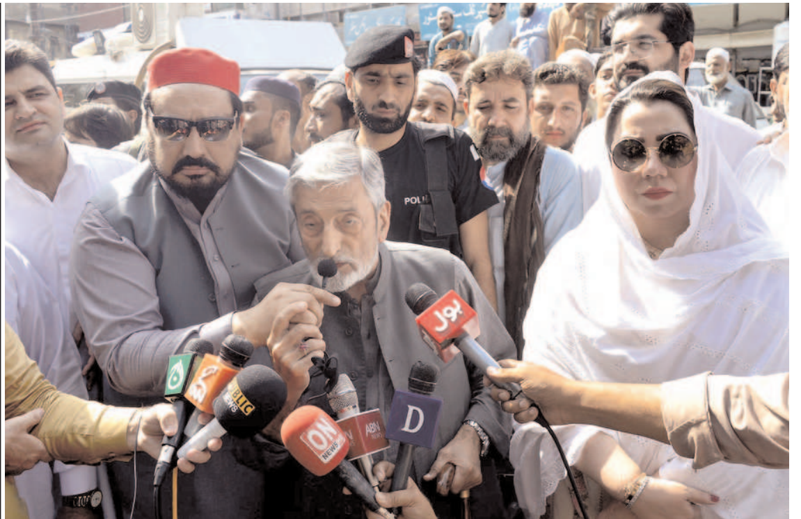
PESHAWAR: Central leader of Awami National Party Haji Ghulam Ahmad Bilour talking to media during a protest against inflated electricity bills.

Stampedes also occurred in some of the schools of Dir Lower, however, no loss of life or property was reported from any area.