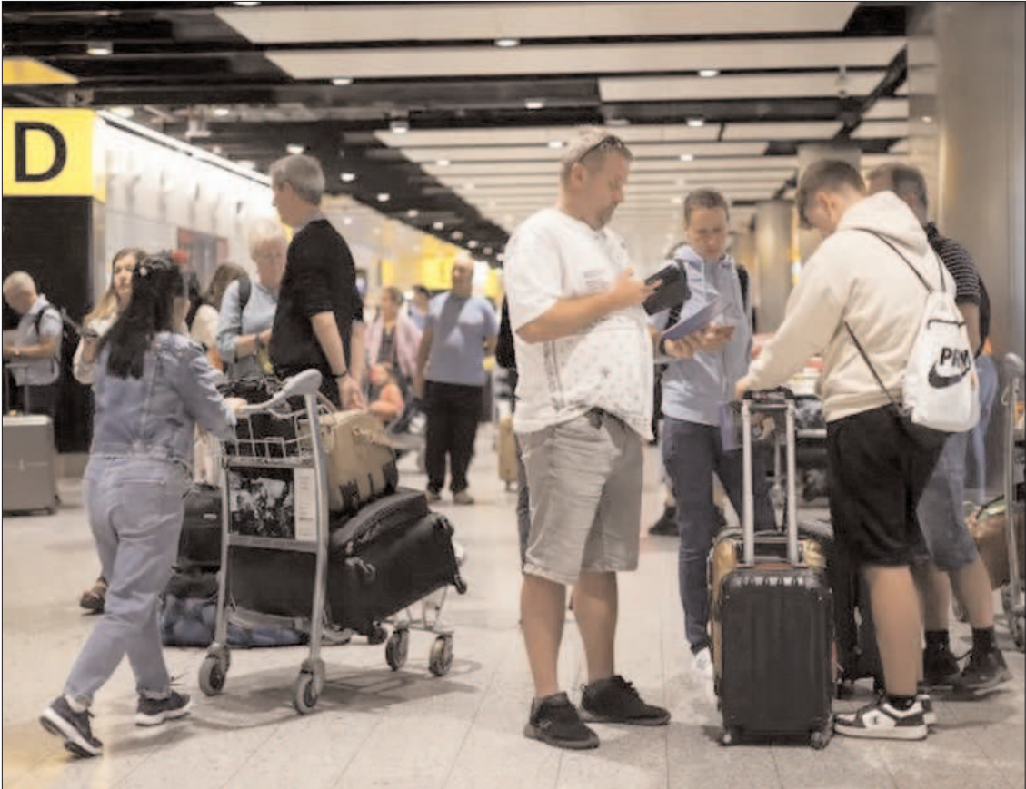
LONDON: Travellers standing near the British Airways check-in area at Heathrow Airport's Terminal 3, as the United Kingdom's National Air Traffic Services restricts air traffic due to a technical issue causing delays, in UK.