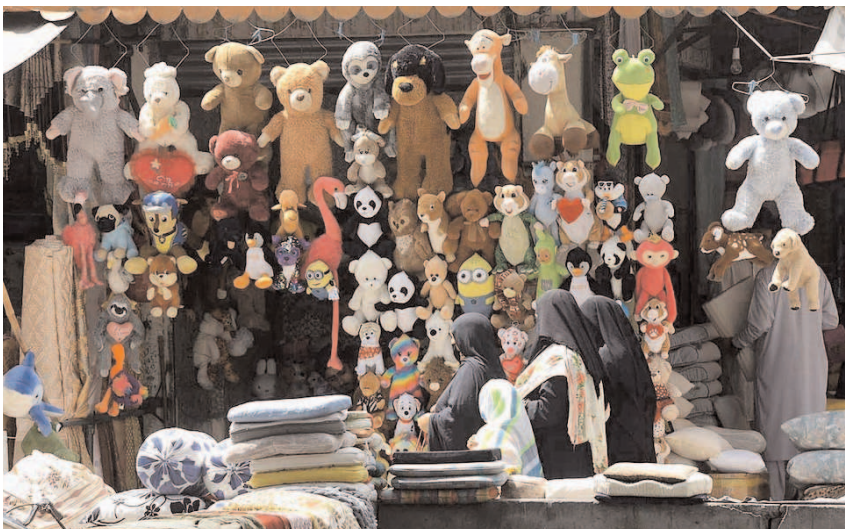
PESHAWAR: Vendor selling and displaying used toys to attract customers at Sahi Katha.

The power supply will remain suspended from Mansehra Grid Station on 30th and 31st August from 7 a.m. to 12 p.m. resultantly consumers of Ghazikot, Ahsan Shaheed, City 1,2, Qalandar Abad, Attar Sheeha, Shaheen Shaheed, Lasain Nawab, City 3, Murad Pur, Khaki and Shankari feeders will face inconvenience.