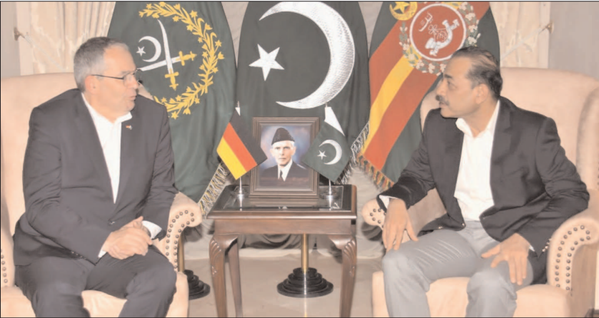
RAWALPINDI: Lieutenant General Alfonso Mais, Chief of German Army called on General Syed Asim Munir, COAS at GHQ.

The alleged vigilante leader regularly posts videos celebrating attacks on Muslims accused of transporting or killing cows, which are considered sacred by Hindus.