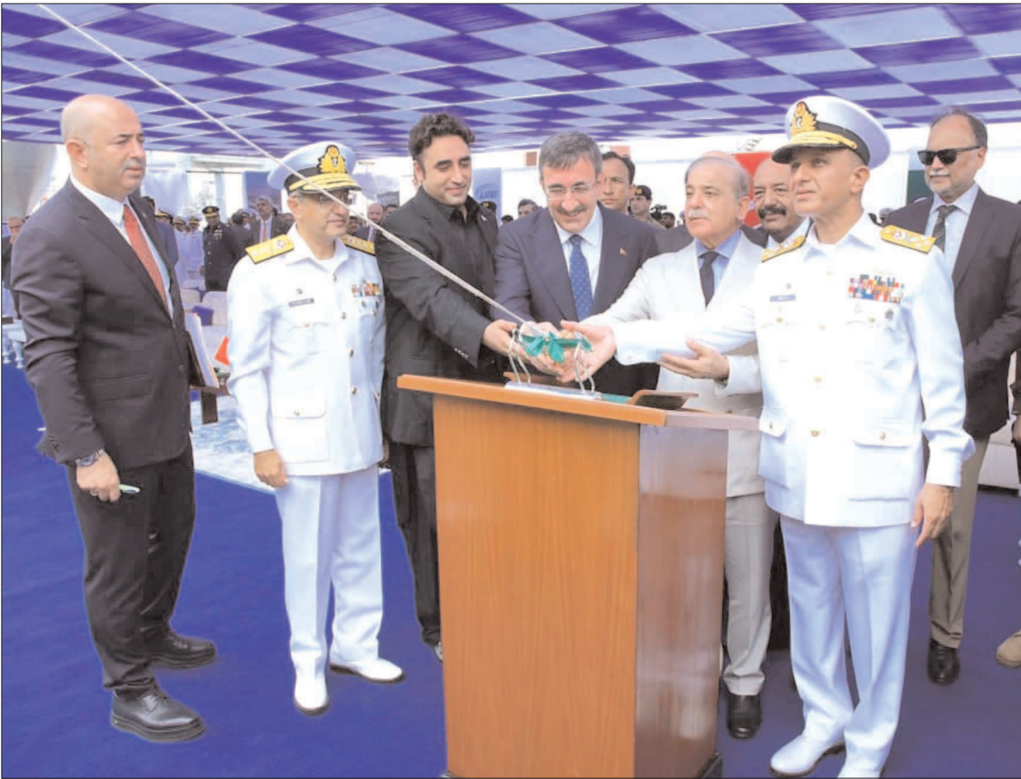
KARACHI: Prime Minister Shehbaz Sharif, Turkiye's Vice President Cevdet Yilmaz, Foreign Minister Bilawal Bhutto and Chief of Naval Staff Admiral Muhammad Amjad Khan Niazi cutting a rope to launch into sea Pakistan's 4th MILGEM Class Corvette 'PNS Tariq' in Karachi Shipyard and Engineering Works.