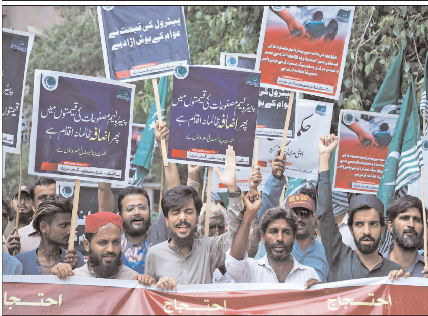
ISLAMABAD: People chanting slogans against increase of petrol prices, revised electricity tariff and overall inflation.

The PTI remains embattled, with its chairman facing several cases and a threat of disqualification while key party leaders have parted ways following May 9 — the day party workers wreaked havoc and attacked army installations. Some of the former party members, considered close to the PTI chief previously, also denied Khan's party in Punjab as Jahangir Tareen, Aleem Khan, and the other people formed the Istehkam-e-Pakistan Party in June.