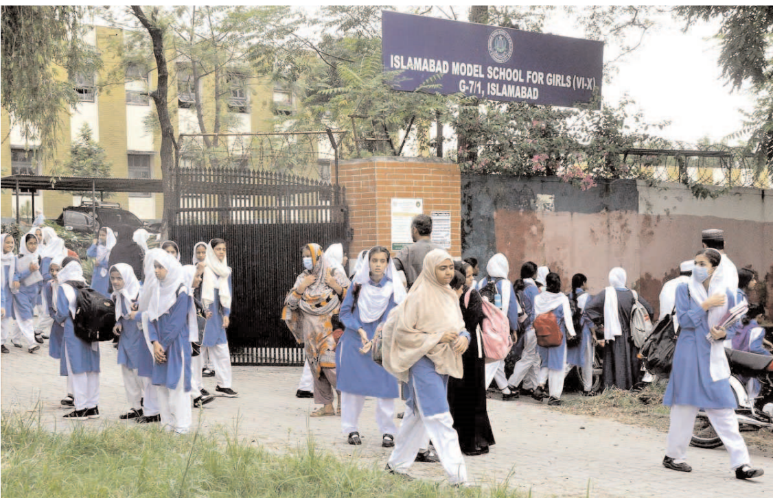
ISLAMABAD: Students attending school after the summer vacation on the opening day after two months at G-7 sector.