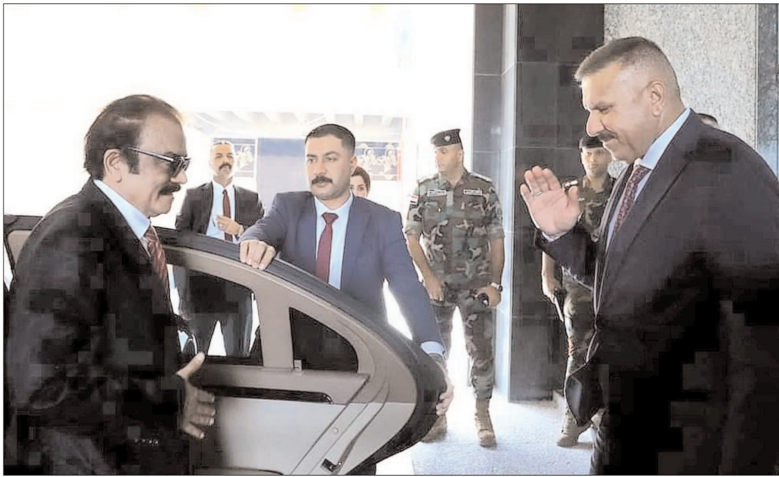
BAGHDAD: Interior Minister of Iraq, Abdul Amir Al Shammari welcoming Federal Minister for Interior Rana Sanaullah during his visit to Iraq.