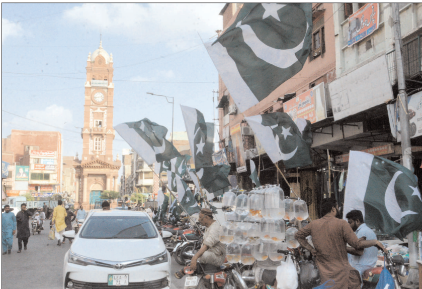
FAISALABAD: Shopkeepers displayed large size of national flags outside their shops during the celebrations of the Independence Day.

months however due to encroachment they face hurdles and difficulty to ensure smooth de-silting operations. AC requested the citizens and traders to avoid encroachment on drains to ensure smooth flow of waste water and avoid urban flooding in Mardan.