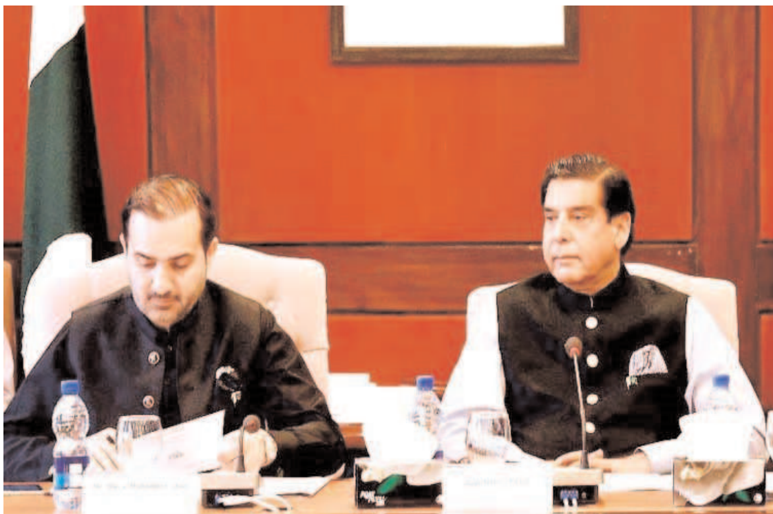
ISLAMABAD: Speaker National Assembly Raja Pervez Ashraf chairing meeting of the PIPS Board of Governors at PIPS.

ISLAMABAD (APP): Indus River System Authority (IRSA) on Wednesday released 280,200 cusecs water from various rim stations with inflow of 372,400 cusecs. According to the data released by IRSA, water level in River Indus at Tarela Dam was 1539.79 feet and was 141.79 feet higher than its dead level of 1,398 feet. Water inflow and outflow in the dam was recorded as 201,800 cusecs and 145,500 cusecs respectively.