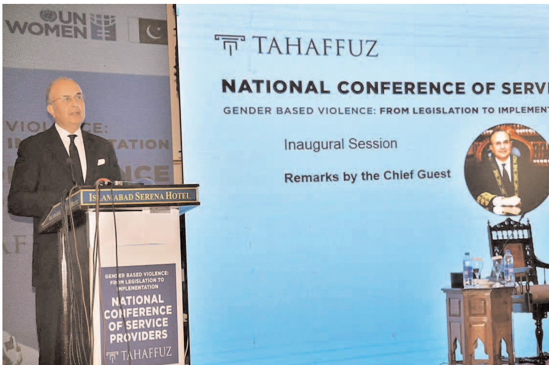
ISLAMABAD: Honourable Justice Supreme Court of Pakistan, Syed Mansoor Ali Shah addressing during National Conference of Service Providers Gender Based Violence: From Legislation to Implementation.