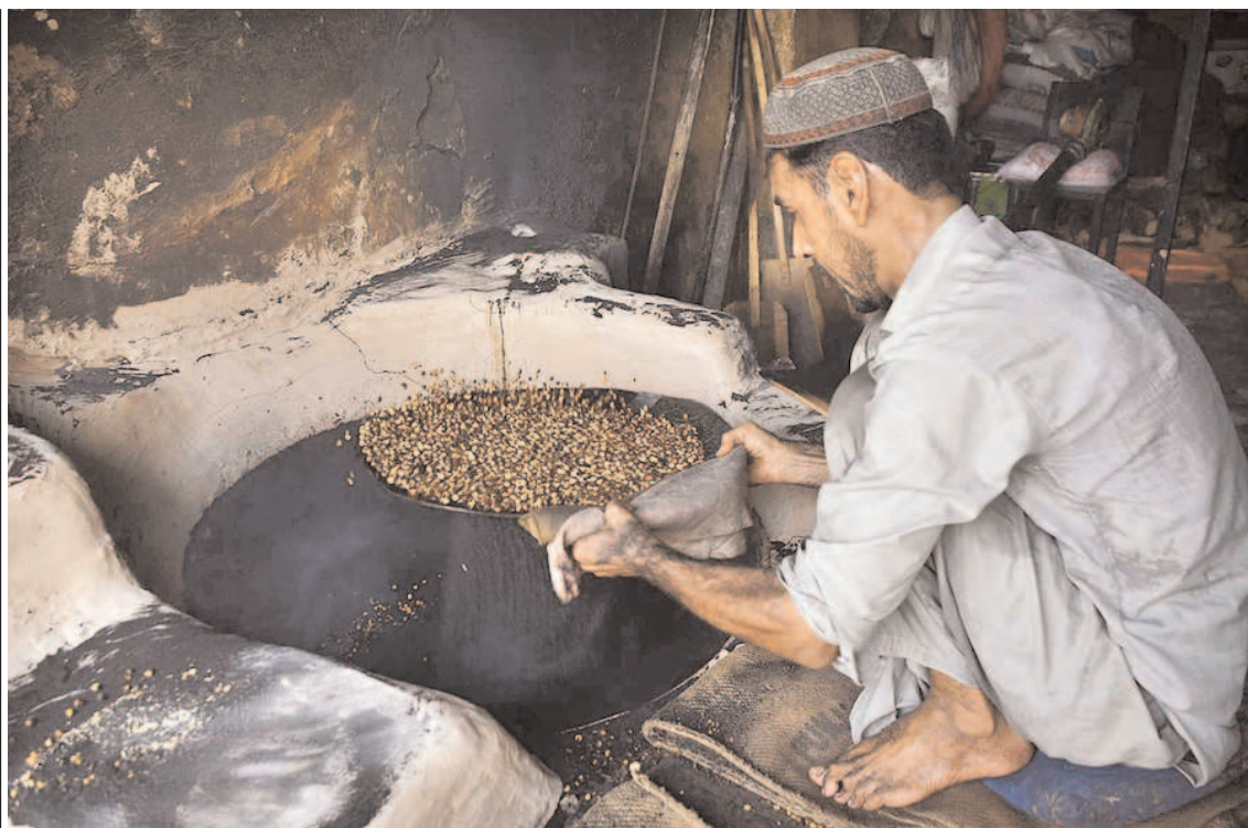
PESHAWAR: A vendor roasting grams at his workplace.

The Toyota factory in the southern Kyushu region and subsidiary Daihatsu's factory in Kyoto remained operational, the spokeswoman said. The news sent Toyota's stocks into the red, trading 0.64 percent lower at 2,421.0 yen.