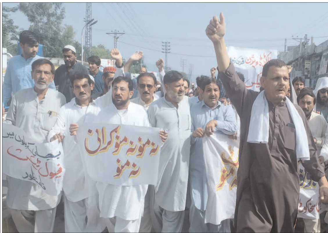
SAKHAKOT: People holding a protest rally against inflation and rise in electricity tariff.

The students were informed that elders of the JUI-F had rendered great sacrifices during the Pakistan movement. The speakers said that the Jewish and American lobbies were raising the issue of PTI chief Imran Khan's arrest by presenting it an international issue of human rights' violation. They said the JUI-F and JTI workers would never let those lobbyists to succeed.