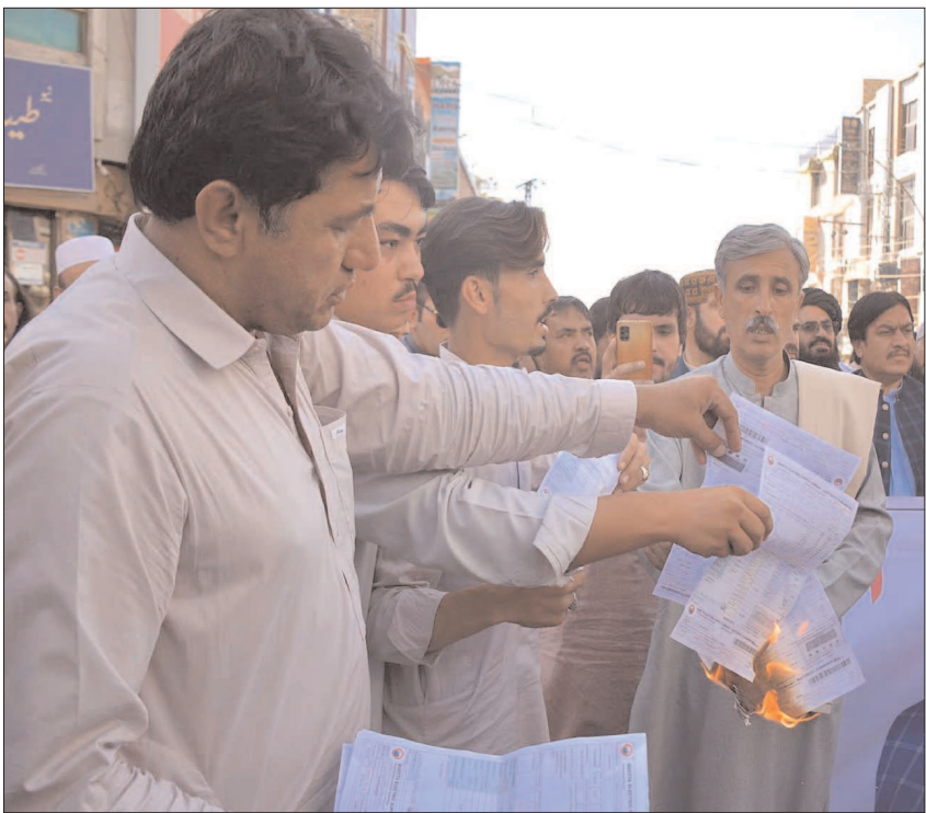
QUETTA: Traders burning electricity bills during a protest against hike in power tariff.

Similarly, some taxes may be reduced while one-slab benefit could also be extended to consumers, he said, adding that the facility of free electricity units enjoyed by Water and Power Development Authority and other institutions was also likely to be withdrawn. It was reported after Sunday's meeting that a plan was devised to withdraw subsidised electricity availed by Discos and government officers in grade 17 and above.