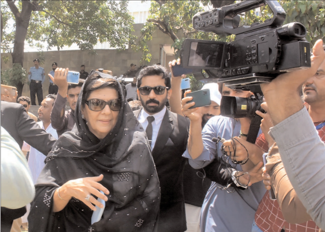
ISLAMABAD: Sister of Imran Khan leaving the court after attending hearing in PTI chief’s plea.

Addressing the participants, the chief minister said that caretaker provincial government, within its mandate, will take every possible step for the welfare of citizens.