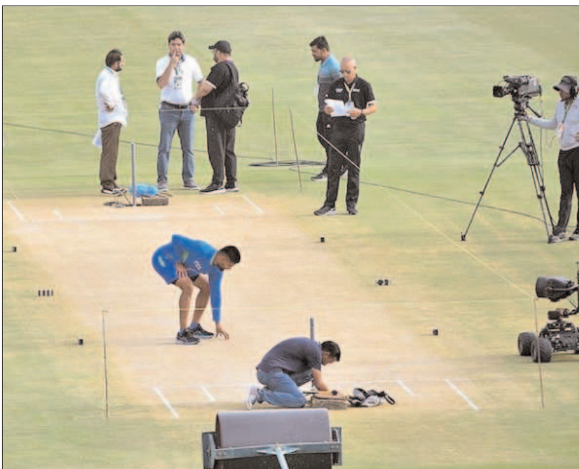
MULTAN: Pakistan Cricket team captain Babar Azam examines the pitch ahead of the first cricket match of Asia Cup 2023 at Multan Cricket Stadium.