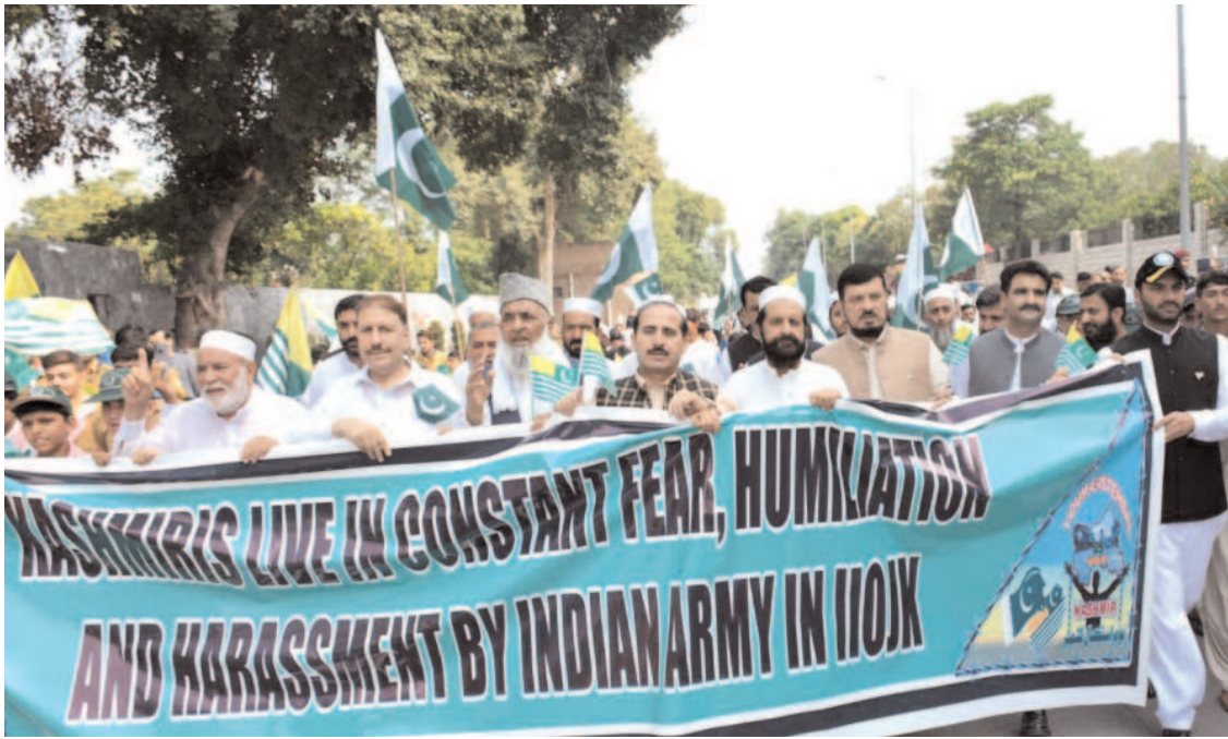
PESHAWAR: Governor Khyber Pakhtunkhwa Haji Ghulam Ali leading a rally to mark Kashmir Day of Exploitation.

As per the FIA statement, the receipts related to hawala/hundi were also recovered in the possession of the suspects, meanwhile, cases have been registered against the suspects under the Foreign Exchange Regulation Act, and legal proceedings are initiated by the FIA.