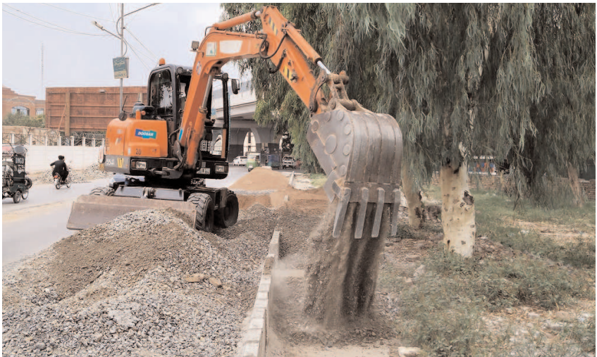
PESHAWAR: A view of ongoing work progress on Saddar Road.

Keeping in view of the sensitivity of the electoral process, the district administration also deployed a large number of police forces for the security and successful organization of the election.