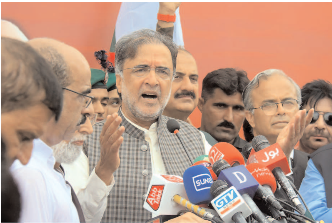
ISLAMABAD: Advisor to the Prime Minister on Kashmir Affairs and Gilgit Baltistan Qamar Zaman Kaira talking to media after holding rally to mark the Youm-e-Istehsal (Exploitation Day), Jammu Kashmir falling on 5th August.