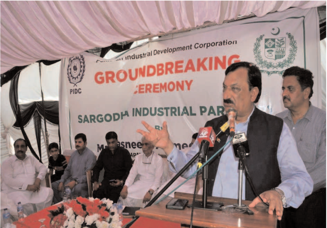
SARGODHA: State Minister for Industries and Production Tasneem Ahmed Qureshi addressing during inaugural ceremony of Sargodha Industrial Park.

2.7%, petroleum products and cement production dipped by less than 1% and the pharmaceuticals and automobiles – the two sectors hit hardest by the ban on imports – also shrank during the first seven months of the current fiscal year. Saigol said that the conventional approach of focusing solely on improving exports while pursuing a passive and imprudent foreign policy towards neighboring countries, poses a significant challenge in meeting export targets. Despite strained relations, the United States remains the largest importer of Pakistani products. Still, there are no efforts to tap into the vast markets of neighboring countries or negotiate trade agreements with them. Even though Pakistan and China enjoy close relations yet the volume of exports to China is significantly lower compared to USA. Furthermore, the existing Pakistan China Free Trade Agreement tends to