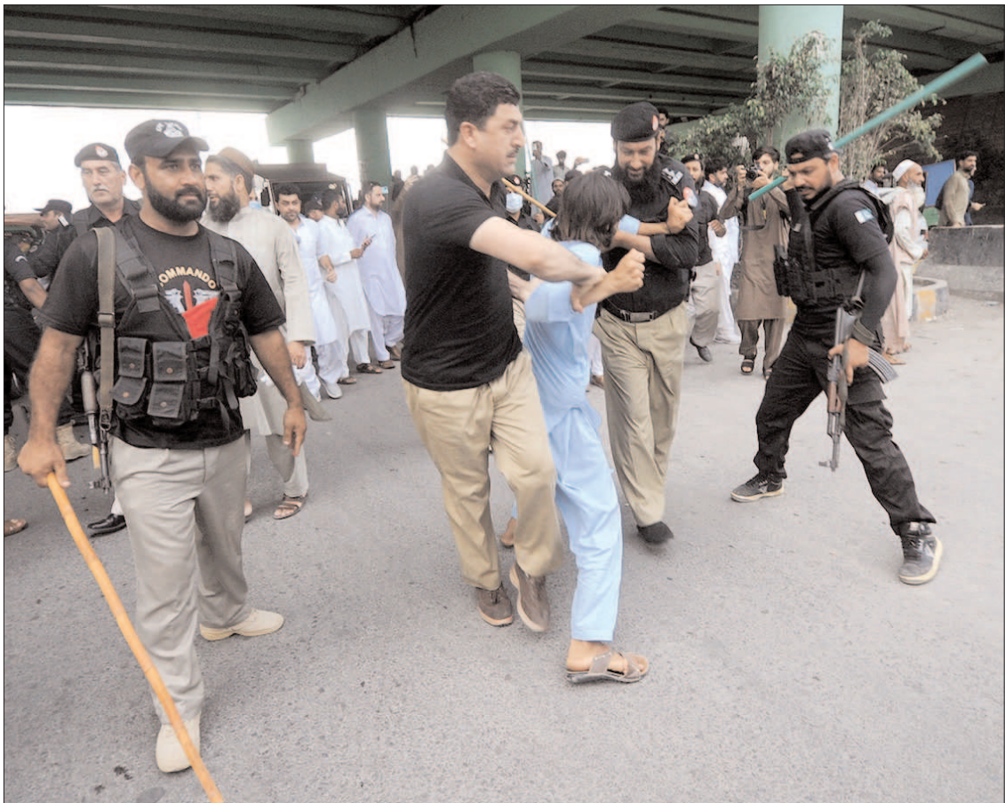
PESHAWAR: Police officials arresting the PTI activists during a protest against arrest of party chief Imran Khan.