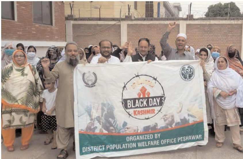
PESHAWAR: Employees of District Population Welfare Office chanting slogans in favour of Kashmiris to mark Kashmir Day of Exploitation.

Main points of manifesto include free education in public sector universities, provision of research grant, creation of new employment opportunities, easy loans to youths, free testing service for jobs, establishment of e-commerce zones at district level, new educational institutions, district autonomy, establishment of provincial finance commission, laws to end violence against transgender community, development of infrastructure and permanent opening of 16 trade corridors with Afghanistan.