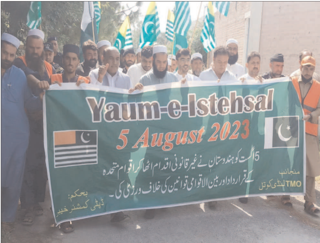
LANDI KOTAL: Locals and officials holding a banner to hold a rally in connection with Youm-e-Istehsal-e-Kashmir.