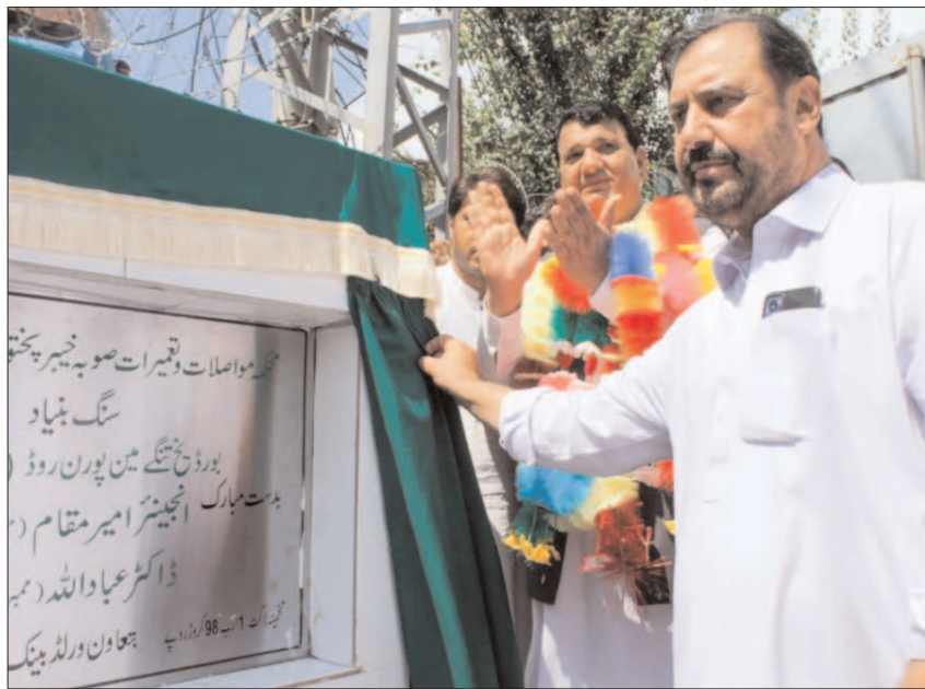
SHANGLA: Adviser to PM, Amir Muqam inaugurating work on Poranpur Road.

He was crystal clear regarding the decades long unrest on Pukhtoon soil and killing of Pakhtoon adding the Pukhtoon leadership was prioritized long lasting peace for Pukhtoon on Pukhtoon soil and working out for achieving this high value goal of peace to lead progress and prosperity in future, he concluded.