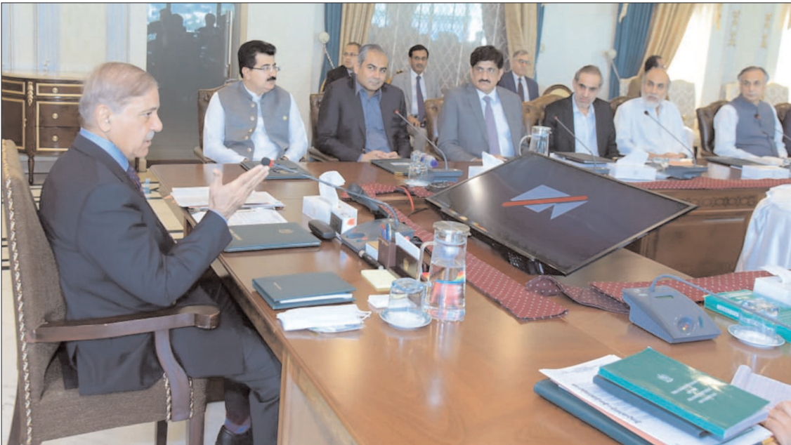
ISLAMABAD: Prime Minister Shehbaz Sharif chairing the 50th meeting of the Council of Common Interests.