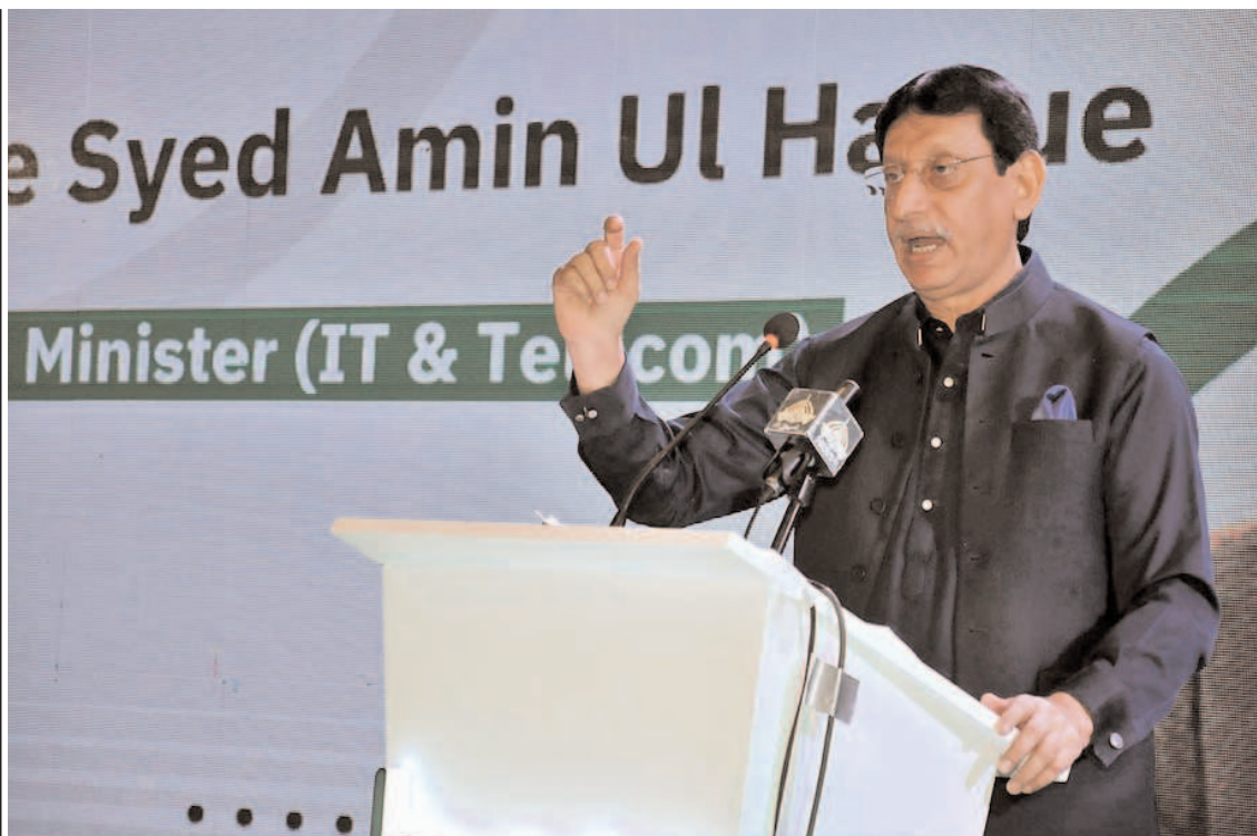
ISLAMABAD: Federal Minister for IT and Telecommunication Syed Amin Ul Haque addressing at launching ceremony of Pakistan's First Communication APP "beep".

During the period, the country's farm produce wholesale price index came in at 118.25, up 0.01 points from the previous week and