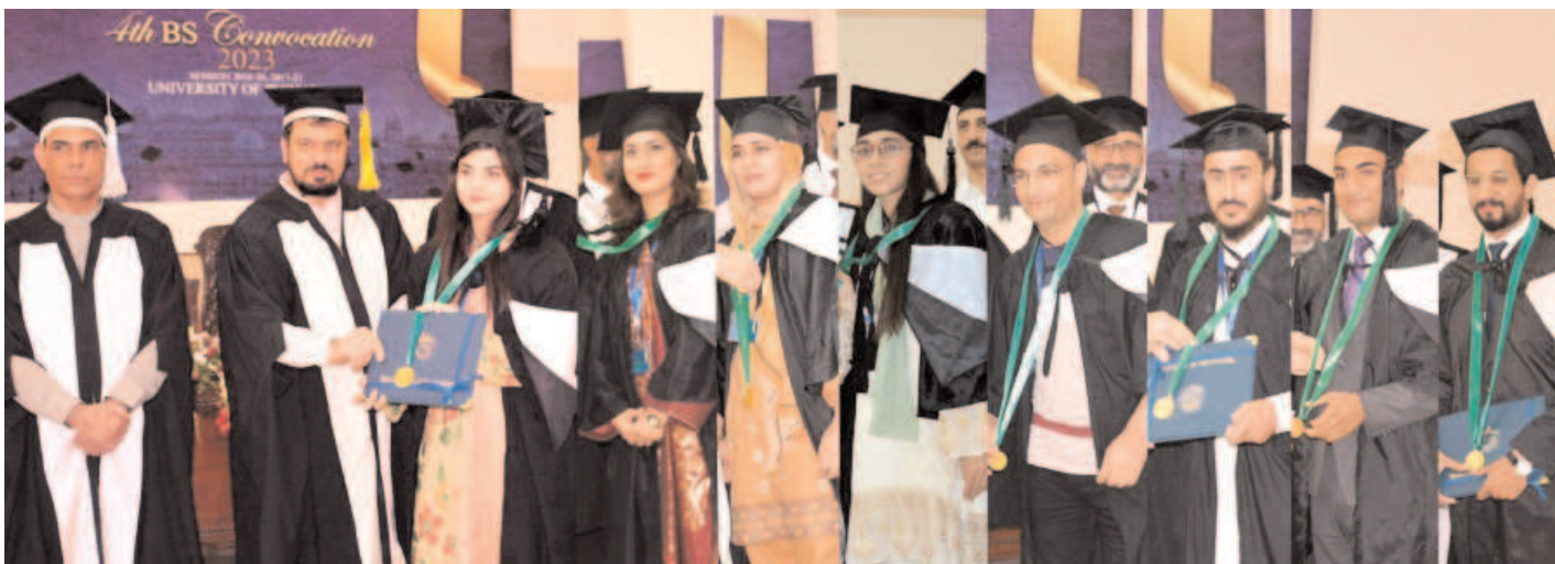
PESHAWAR: Governor KP Haji Ghulam Ali giving degrees to students during 4th BS Convocation of University of Peshawar.

on social media. He emphasized the importance of hard work, the promotion of Islamic values and knowledge, and the responsible use of social media to spread love instead of hatred. The Governor also highlighted the need to address issues faced by universities and suggested offering degrees that cater to market demands for employment opportunities. He highlighted the need to address challenges faced by universities and suggested offering degrees that align with market demand for employment opportunities. He also emphasized the responsibility of individuals to resolve issues and contribute positively to the nation's progress.