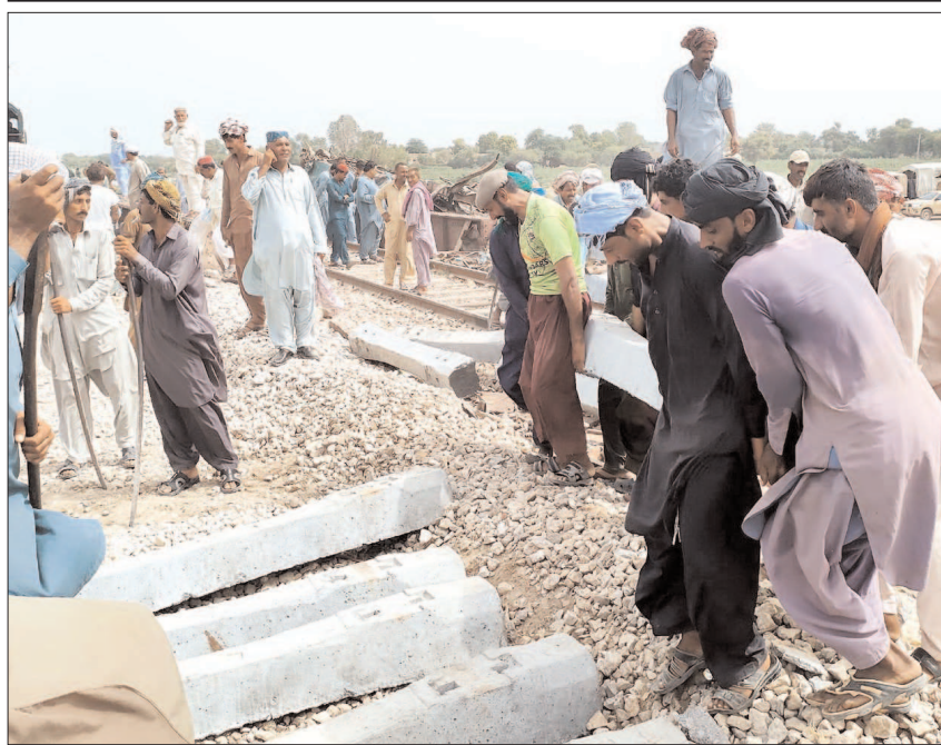
HYDERABAD: Railway workers busy in repairing railway track next to damaged track.

problems upon which he issued on-the-spot directives for addressal of the same. He asked the polio workers to discharge their duty with dedication as it was the matter of the future of our generation.