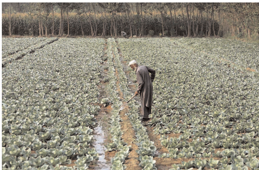
PESHAWAR: An old farmer busy in routine work in his field.