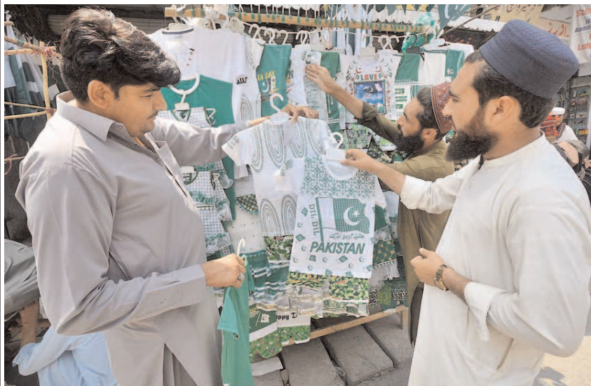
PESHAWAR: Customer purchasing national flag dresses for children at Qissa Khawani Bazaar in preparations to celebrate Independence Day.