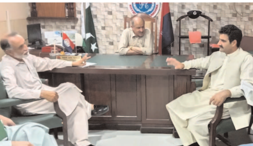
PESHAWAR: Provincial Minister Haji Manzoor Khan Afridi meeting officials of Excise Department.