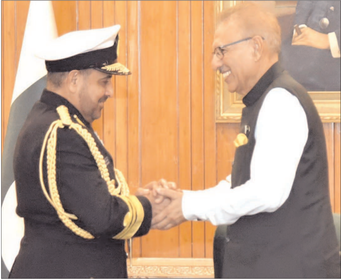
ISLAMABAD: President Dr Arif Alvi welcomes Omani Chief of Staff of Sultan Armed Forces, Vice Admiral Abdullah bin Khamis Al-Raisi at Aiwan-e-Sadr.