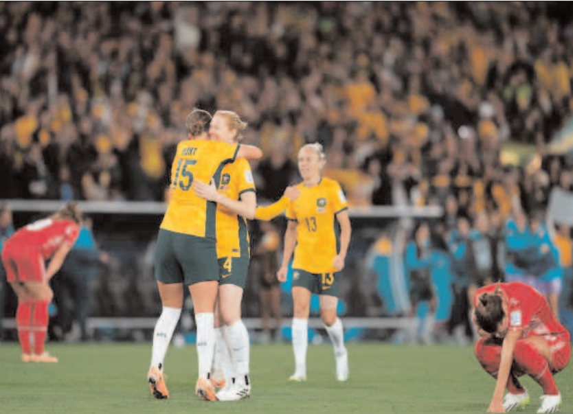
SYDNEY: Lydia Williams (R) and Kyra Cooney-Cross of Australia celebrate the team's 2-0 victory and advance to the quarter final.

They were also runners-up in the Street Child World Cup 2018 in Russia (2018), whereas, in the 2014 edition they finished third after losing in the semi-finals.