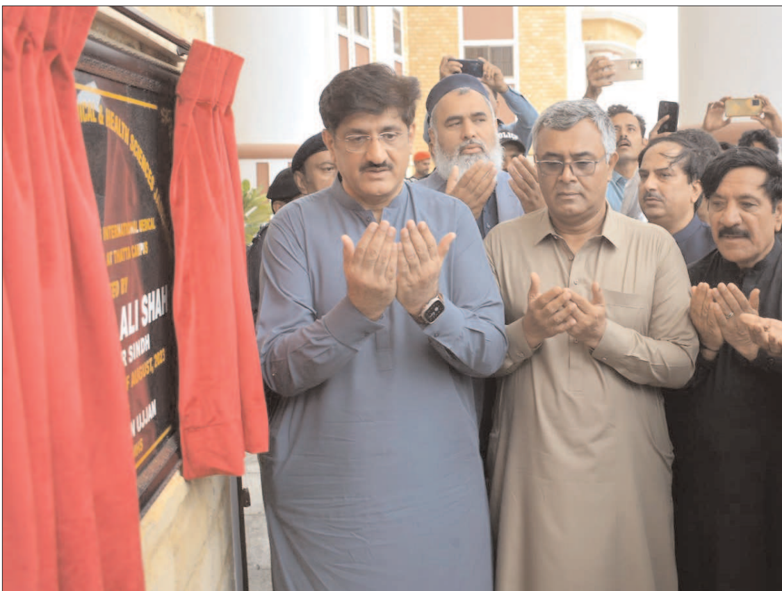
THATTA: Chief Minister of Sindh Murad Ali Shah inaugurating International Medical and Technical College LUMHS.