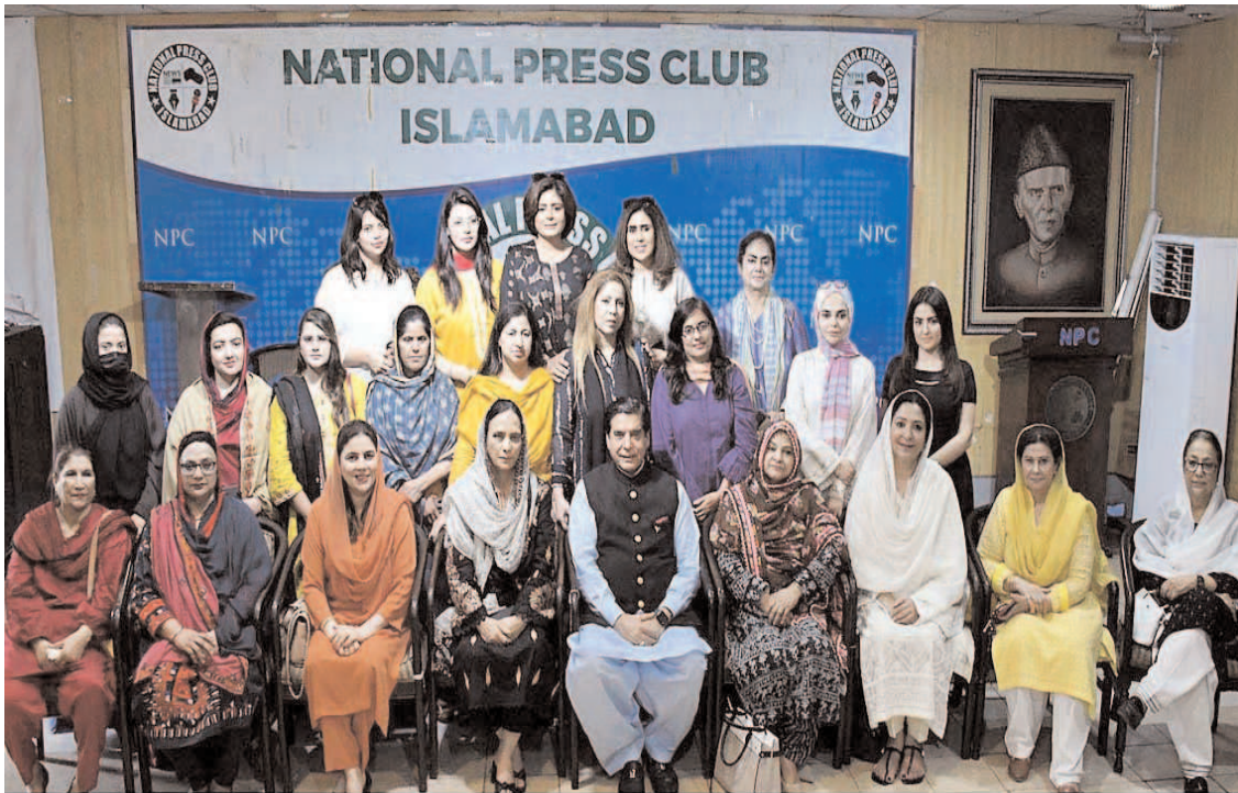
ISLAMABAD: Speaker National Assembly Raja Pervez Ashraf in a group photo with participants of the reception to pay tribute to "The Women Parliamentarians in Strengthening Democracy" at National Press Club.