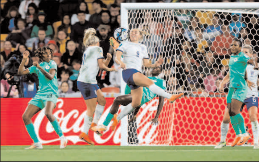
BRISBANE: Georgia Stanway of England (C) battles for the ball with Antonette Payne of Nigeria (R) during the FIFA Women's World Cup.

While the role in the cricket technical committee was unpaid, the chief selector will be remunerated. The PCB confirmed to ESPNcricinfo that a replacement for Inzamam in the technical committee would be announced in due course.