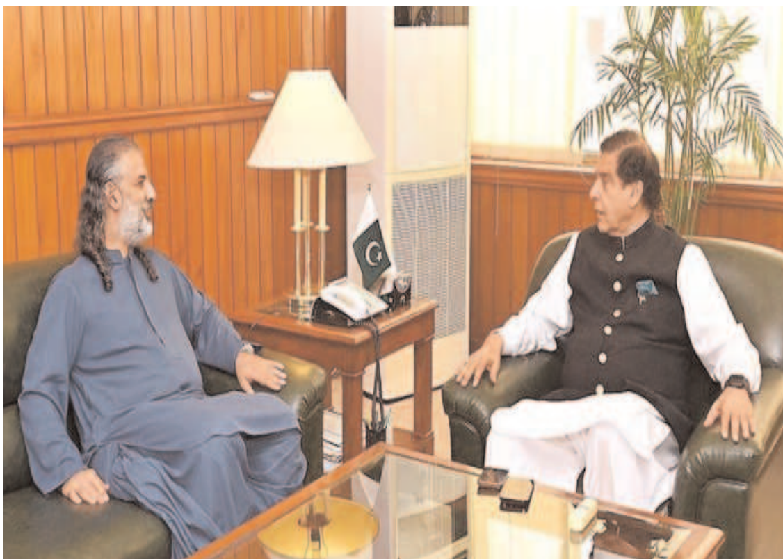
ISLAMABAD: Speaker National Assembly Raja Pervez Ashraf in a meeting with Federal Minister for Narcotics Control Nawabzada Shazain Bugti at Parliament House.

ISLAMABAD (APP): Indus River System Authority (IRSA) on Tuesday released 364,800 cusecs of water from various rim stations with inflow of 427,400 cusecs. According to the data released by IRSA, the water level in River Indus at Tarbela Dam was 1547.00 feet and was 149.00 feet higher than its dead level of 1,398 feet. Water inflow and outflow in the dam was recorded as 251,000 cusecs and 221,600 cusecs respectively. The water level in River Jhelum at Mangla Dam was 1236.25 feet, which was 186.25 feet higher than its dead level of 1,050 feet. The inflow and outflow of water was recorded at 43,200 cusecs and 10,000 cusecs respectively. The release of water at Kalabagh, Taunsa, Guddu and Sukkur was recorded as 269,500, 229,000, 233,400 and 130,200 cusecs respectively. Similarly, from River Kabul, a total of 50,300 cusecs of water were released at Nowshera and 54,700 cusecs were released from River Chenab at Marala.