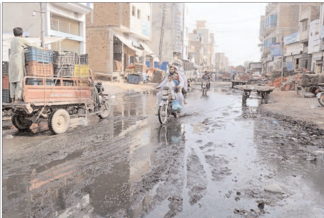
MULTAN: A view of dirty polluted waste water stands in the Vegetable Market creating environmental problems and needs the attention of concerned authorities.

The Balochistan University will remain closed for academic activities for an indefinite period, the administration said. The students have also been advised to vacate the hostel premises with immediate effect.