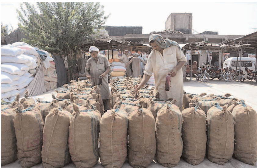
PESHAWAR: Laborers busy marking sacks of traditional sweet item Gur at Gur Mandi.

The Chief Justice said obtaining a passport is a matter of convenience as well as national honor, adding that the purpose of providing facilities to the bar and bench is also to facilitate the delivery of justice. He said that the coordination between the judiciary and passport office shows better relationship with government departments. He said that NADRA office would also be opened in building of PHC soon.