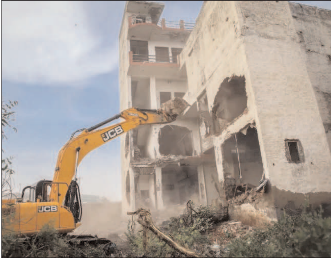
HARYANA: A bulldozer demolishing the property of a Muslim family in Nuh, India.