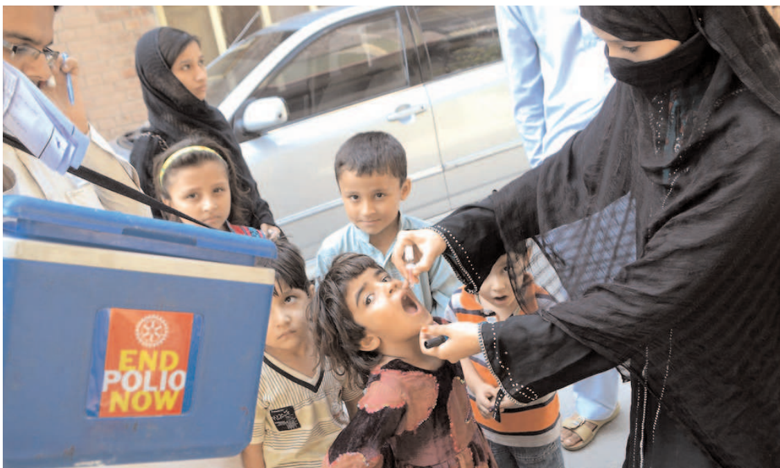
PESHAWAR: Lady health worker administrating polio vaccination drop to children during anti polio campaign.