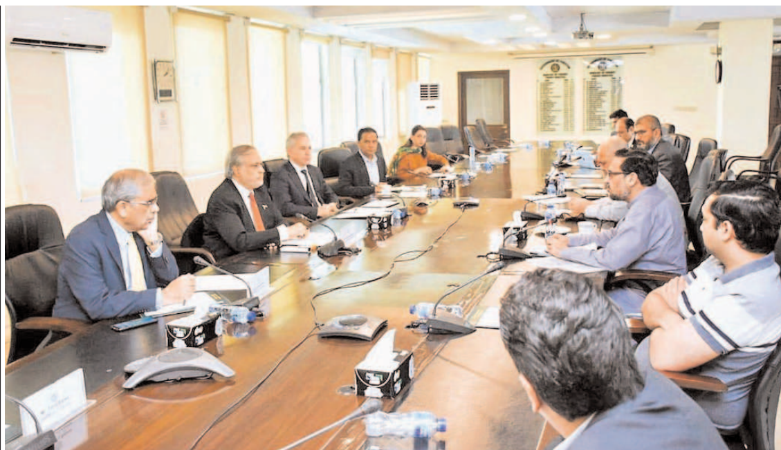
ISLAMABAD: Federal Minister for Finance and Revenue Senator Muhammad Ishaq Dar chairing meeting of Steering Committee to oversee and guide progress of work related to outsourcing of airports operations at Finance Division.

The SCCI's chief assured the APMIA delegation to take up their issues with relevant government authorities at central and provincial level in an efficient manner.