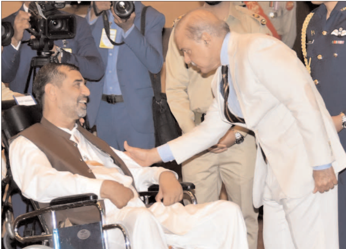
ISLAMABAD: Prime Minister Shehbaz Sharif interacting with families of martyrs during his visit to General Headquarters.