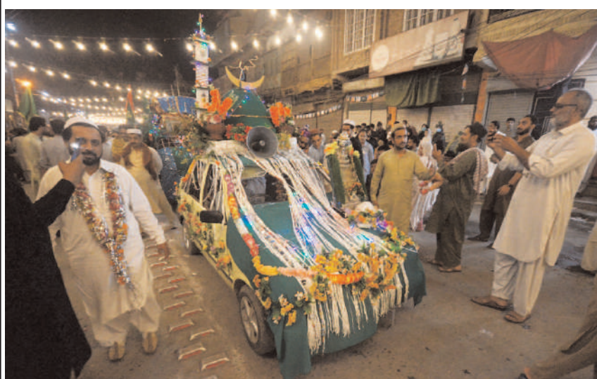
PESHAWAR: A view of decorated car participating in a religious procession on occasion of Eid Milad-ul-Nabi.

However, terrorists’ plan has been thwarted by the timely action of the Peshawar cops, said the police.