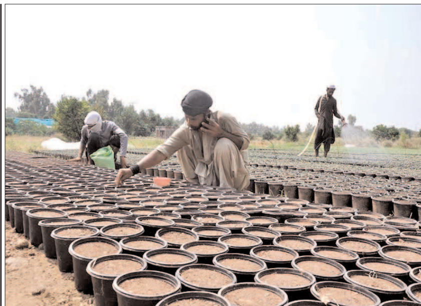
ISLAMABAD: A nursery worker busy in seedling into pots for germination seasonal plants and flowers in Federal Capital.

Cases have been registered against the nabbed accused and further investigation is underway.