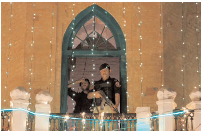
PESHAWAR: A policeman stand alert during a procession on occasion of Eid Milad-ul-Nabi.