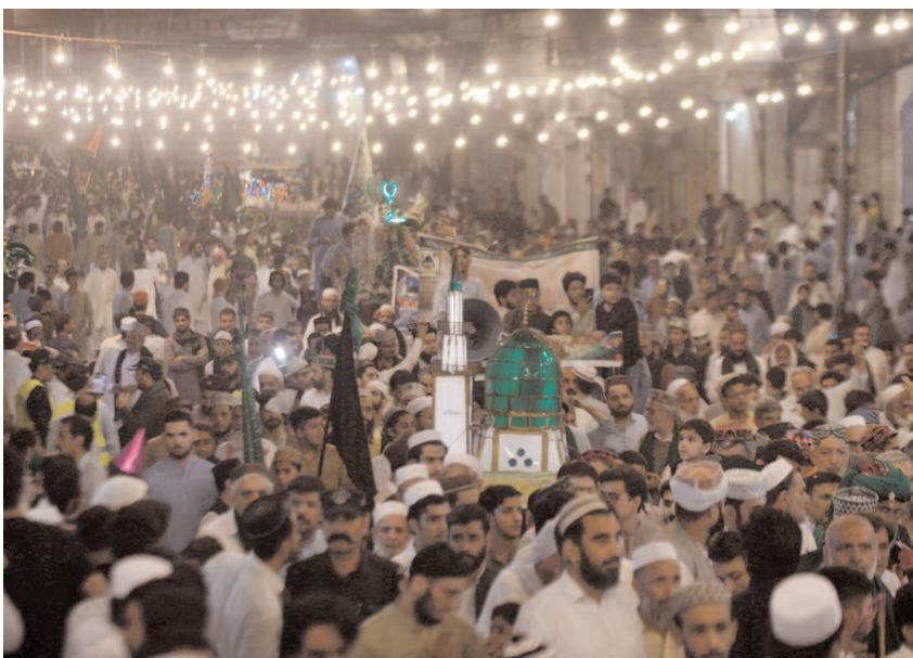
PESHAWAR: People taking part in a rally to celebrate Eid Milad-ul-Nabi.

As “Autumn Plantation Drive 2023” continues to gain momentum, SCN remains committed to organizing further initiatives with IRC to save the endangered environment through promoting planting of trees as a lifestyle. The next event in this series is scheduled at City School Peshawar and CECOS University Hayatabad with an exciting slate of activities planned for the future.