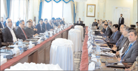
ISLAMABAD: Caretaker Prime Minister Anwaar-ul-Haq Kakar chairing the 5th Apex Committee meeting of Special Investment Facilitation Council.