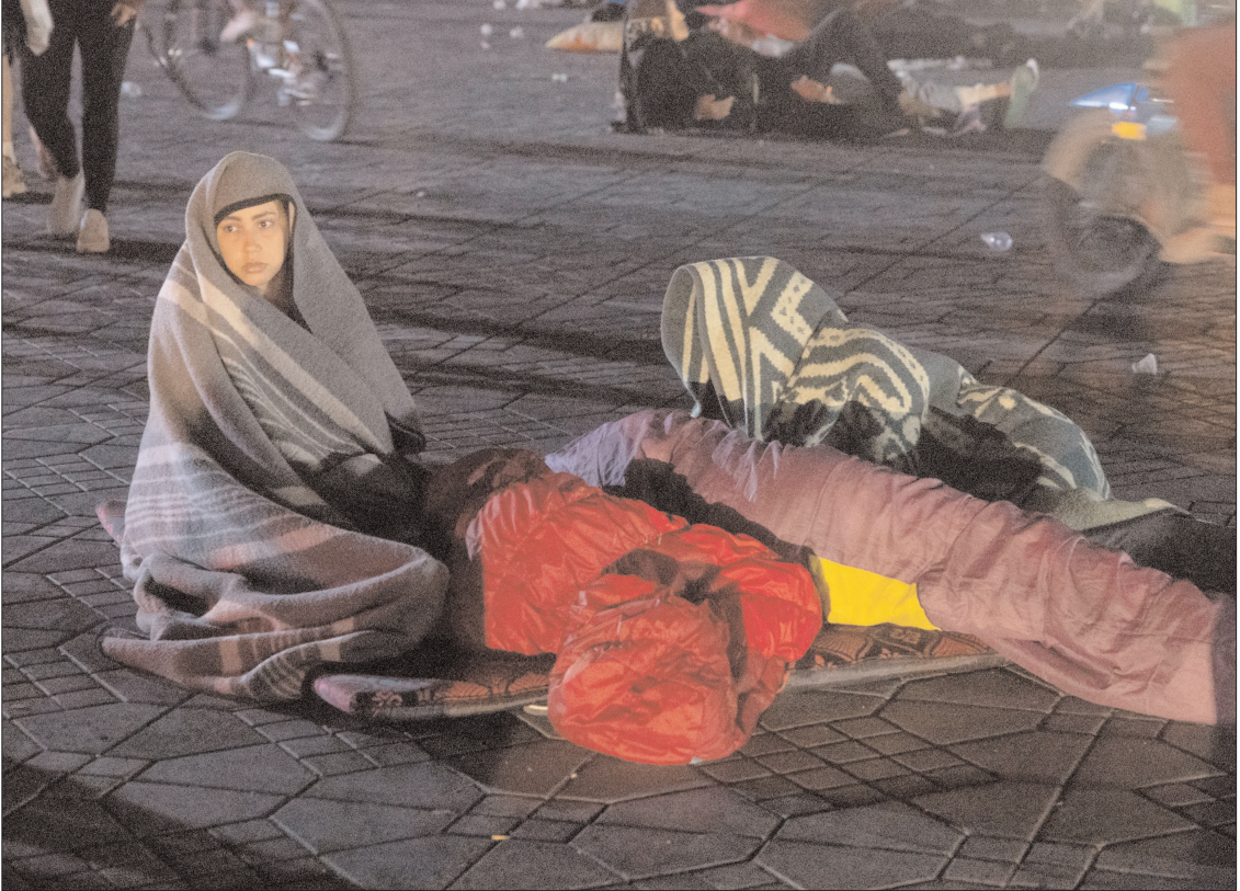
MOROCCO: Residents taking shelter outside in a square following the earthquake in the city of Marrakesh.