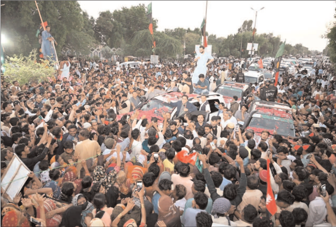
BADIN: Pakistan People's Party chairman Bilawal Bhutto Zardari addressing party workers.