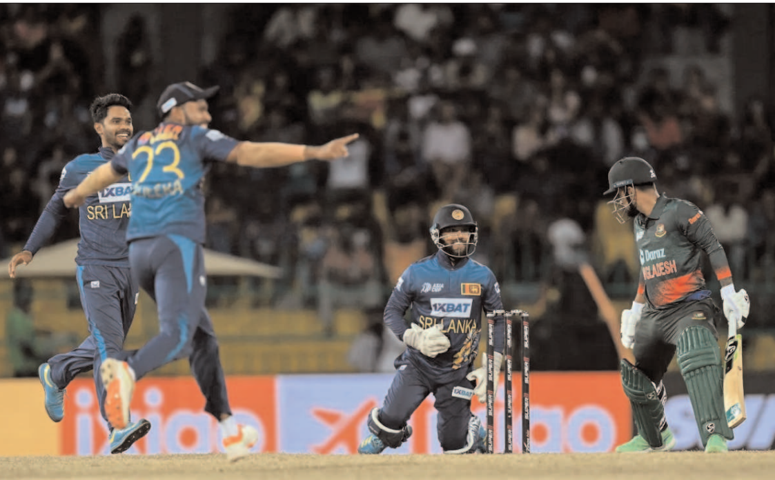
COLOMBO: Litton Das is caught behind, Sri Lanka vs Bangladesh.

thinking about an end if I'm still at the top of the game. "I just don't see a reason for that." Medvedev avenged his Wimbledon semi-final whipping by Alcaraz to reach his fifth Grand Slam final. The 27-year-old Russian lost a five-set classic to Rafael Nadal here in 2019. He was also beaten by Djokovic in Melbourne two years later before going down to Nadal at the following Australian Open. "If I lose on Sunday, the tournament, it's like it's a good tournament but I'm going to be hell of a disappointed. That's how tennis is," said Medvedev. Djokovic leads the head-to-head 9-5 but Medvedev knows his rival wants to set the record straight after the 2021 final defeat which left him in tears. "I think the only way I can use it is, as I say, thinking that Novak, when he loses, he's never the same after," said Medvedev. "So he's different. It's just a different mentality. That's why he has 23 Grand Slams, whatever, Masters 1000s, weeks at number one." "So I have to use it knowing that he's going to be 10 times better than he was that day. And I have to be, if I want to still beat him, 10 times better than I was that day."