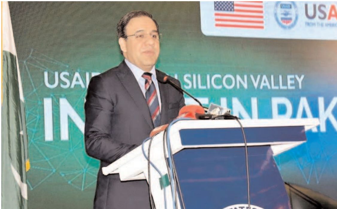
ISLAMABAD: Caretaker Federal Minister for IT and Telecommunication Dr. Umar Saif addressing during 'Invest in Pakistan Conference'.

He said: "I may ensure that I will call upon all stakeholders to come forward and play a United role for the betterment of the province. Including a seasoned team will be appointed in all major districts of the province."