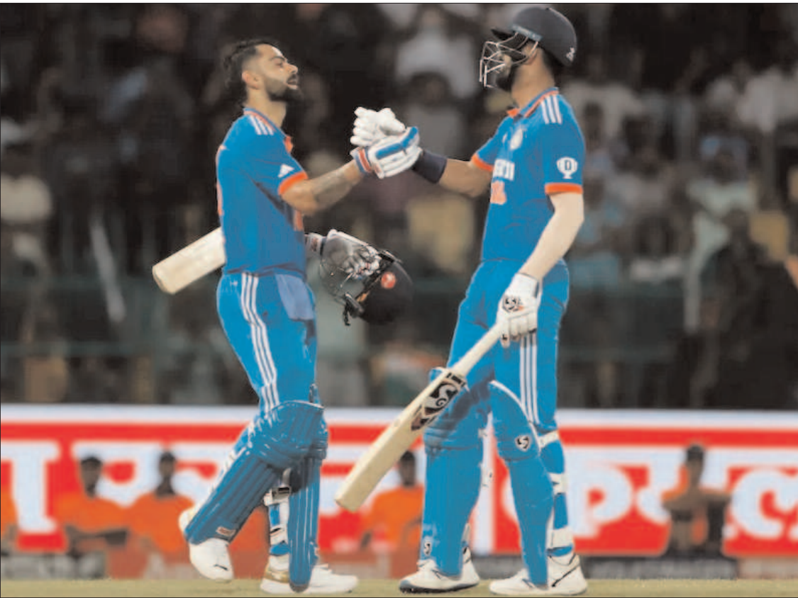
COLOMBO: Virat Kohli and KL Rahul piled on an unbeaten 233-run stand off 194 balls, Pakistan vs India Asia Cup Super Four.

New Zealand squad: Kane Williamson (captain), Trent Boult, Mark Chapman, Devon Conway, Lockie Ferguson, Matt Henry, Tom Latham, Daryl Mitchell, Jimmy Neesham, Glenn Phillips, Rachin Ravindra, Mitch Santner, Ish Sodhi, Tim Southee, Will Young.