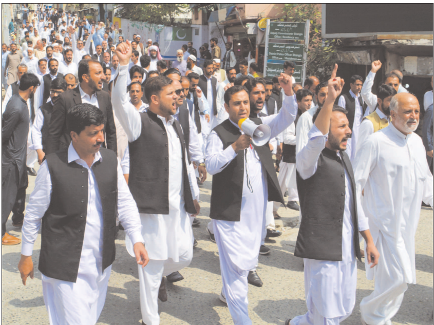
SHANGLA: Lawyers along with political workers protesting against Deputy Commissioner's attitude and corruption.