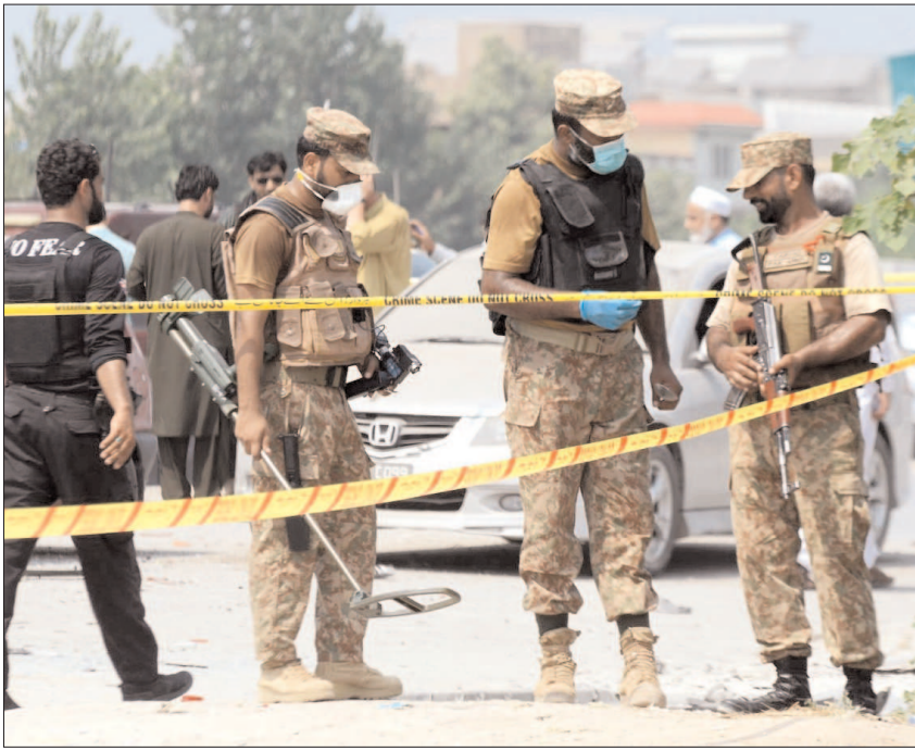
PESHAWAR: Security officials examining the spot after roadside bombing.

It is pertinent to know that Bilawal has repeatedly echoed his party's central executive committee's (CEC) stance in favour of holding elections within 90 days. The stance — however — has put Bilawal and PPP's CEC at odds with the former president and PPP Co-Chairman Asif Ali Zardari who supports fresh delimitations under the new census and therefore effectively favouring holding of elections post the 90-day limit.