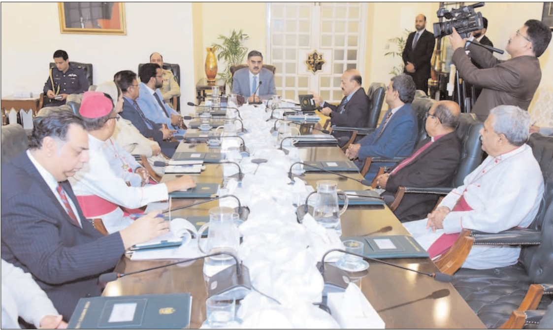
ISLAMABAD: A delegation of Christian community called on Caretaker Prime Minister Anwaar-ul-Haq.