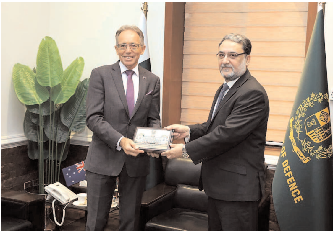
RAWALPINDI: Minister for Defence Lt. General Anwar Ali Hyder (Retd) presenting a gift to Neil Hawkins Australian High Commissioner in Ministry of Defence.

ISLAMABAD (APP): Islamabad Capital Police have launched an intensified crackdown on drivers who are violating traffic rules, resulting in the registration of 111 cases against individuals engaged in serious traffic violations across various police stations during the last three days. Police spokesperson said that Islamabad capital police have initiated the process of registering cases against traffic rule violators involved in significant traffic infractions. During this enforcement period, the police issued a total of 11,708 challan tickets, and 201 vehicles along with 565 motorcycles were impounded. Over the last 24 hours, police teams issued 32 challan tickets for overcharging on traveling fares and 79 for overloading, leading to the impoundment of 75 vehicles and 97 motorcycles across various police stations. Furthermore, special squads have been deployed along major highways and important boulevards within the federal capital to address traffic congestion and violations. These cases were registered at Sangiani and Ramna police stations. Islamabad Capital Police FM radio 92.4 is broadcasting a dedicated program focused on educating the public about traffic rules.