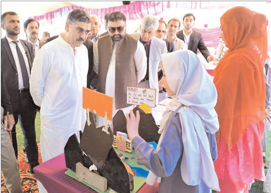
GILGIT: Caretaker Prime Minister Anwaar-ul-Haq Kakar interacting with school students at the display stalls of various science, technology and artistic projects at Chief Minister Secretariat.