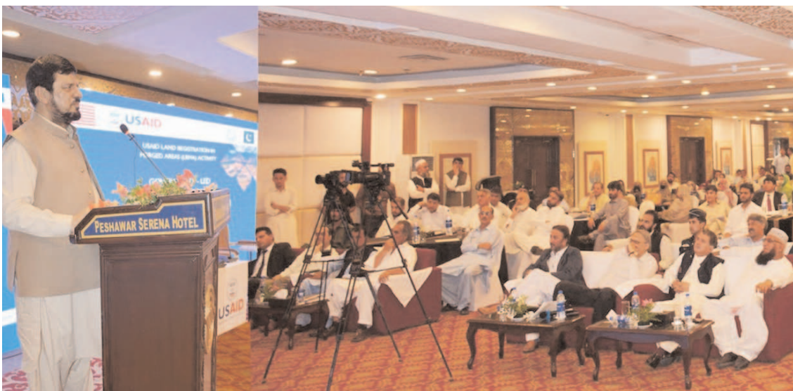
PESHAWAR: Governor Khyber Pakhtunkhwa Haji Ghulam Ali addressing participants of awareness session on land registration in merged districts.