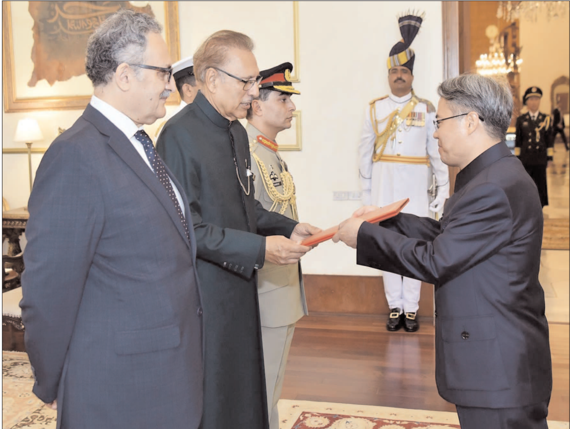
ISLAMABAD: Ambassador-designate of China, Mr. Jiang Zaidong, presenting his diplomatic credentials to President Dr. Arif Alvi, at Aiwan-e-Sadr.