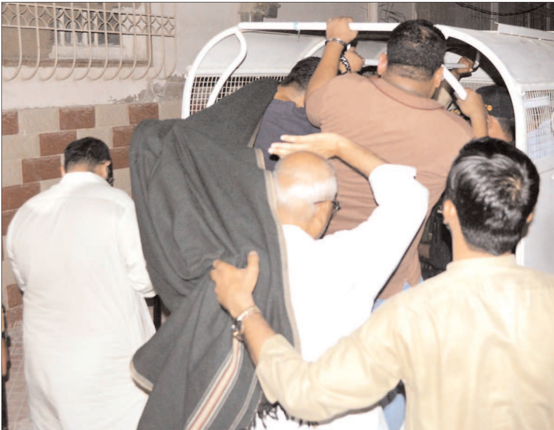
HYDERABAD: FIA official escorting arrested culprits of money laundering during raid on a house in Latifabad.