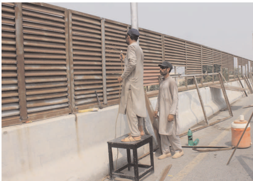
PESHAWAR: Workers repairing safety iron grille installed on road wall in front of Provincial Assembly and Peshawar High Court.