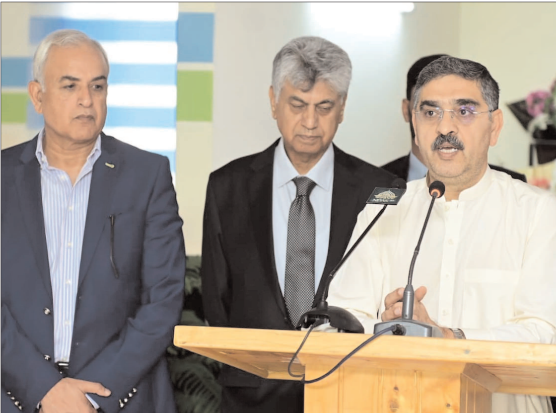
GILGIT: Caretaker Prime Minister Anwaar-ul-Haq Kakar talking to media persons after inauguration of Cardiac hospital.