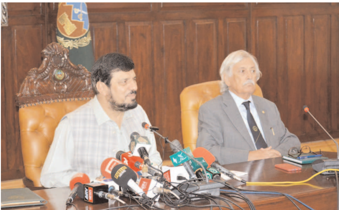
PESHAWAR: Governor Khyber Pakhtunkhwa Haji Ghulam Ali addressing a press conference at Governor's House. Caretaker Provincial Minister for Education Dr. Qasim Jan also present on occasion.