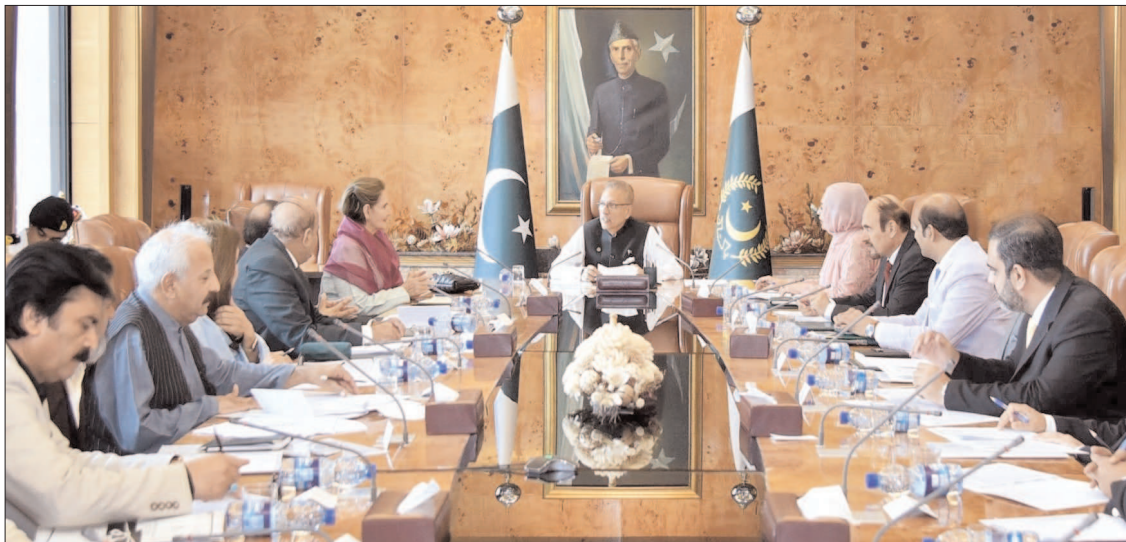
ISLAMABAD: President Dr. Arif Alvi chairing a meeting on the framework for classification of disabilities, at Aiwan-e-Sadr.

The rescue teams shifted the dead and injured to Qazi Hussain Ahmad Medical Complex Nowshera and Mardan Medical Complex. Police said the driver of the bus who also sustained injuries in the mishap, was arrested. The bus which fell into a shallow ditch after overturning was retrieved with heavy machinery and the road was made clear for traffic.